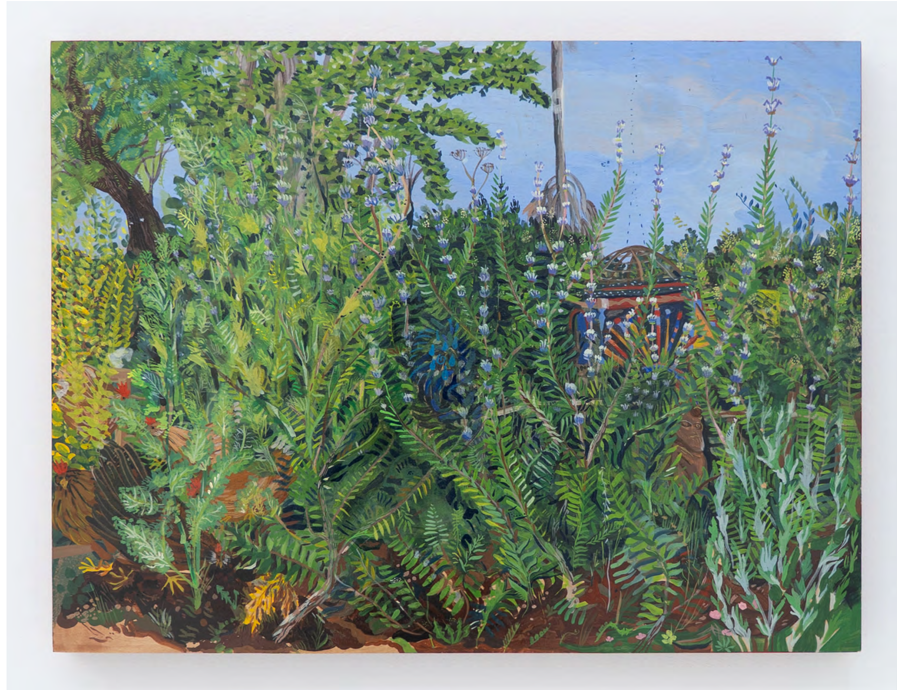
Sarita Doe Rain Gardens, Chicken Temple ( Fennel, Black Sage, Mugwort ), 2022 Natural pigment and gouache on board 18 x 24 inches

"In between freeways we planted a black sage habitat for the watershed. The chickens loved to wander in the fennel."