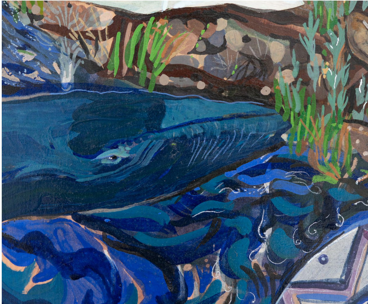
Sarita Doe Grow Native Habitat, 2024 Natural pigment and collage on board 48 x 36 inches (detail)