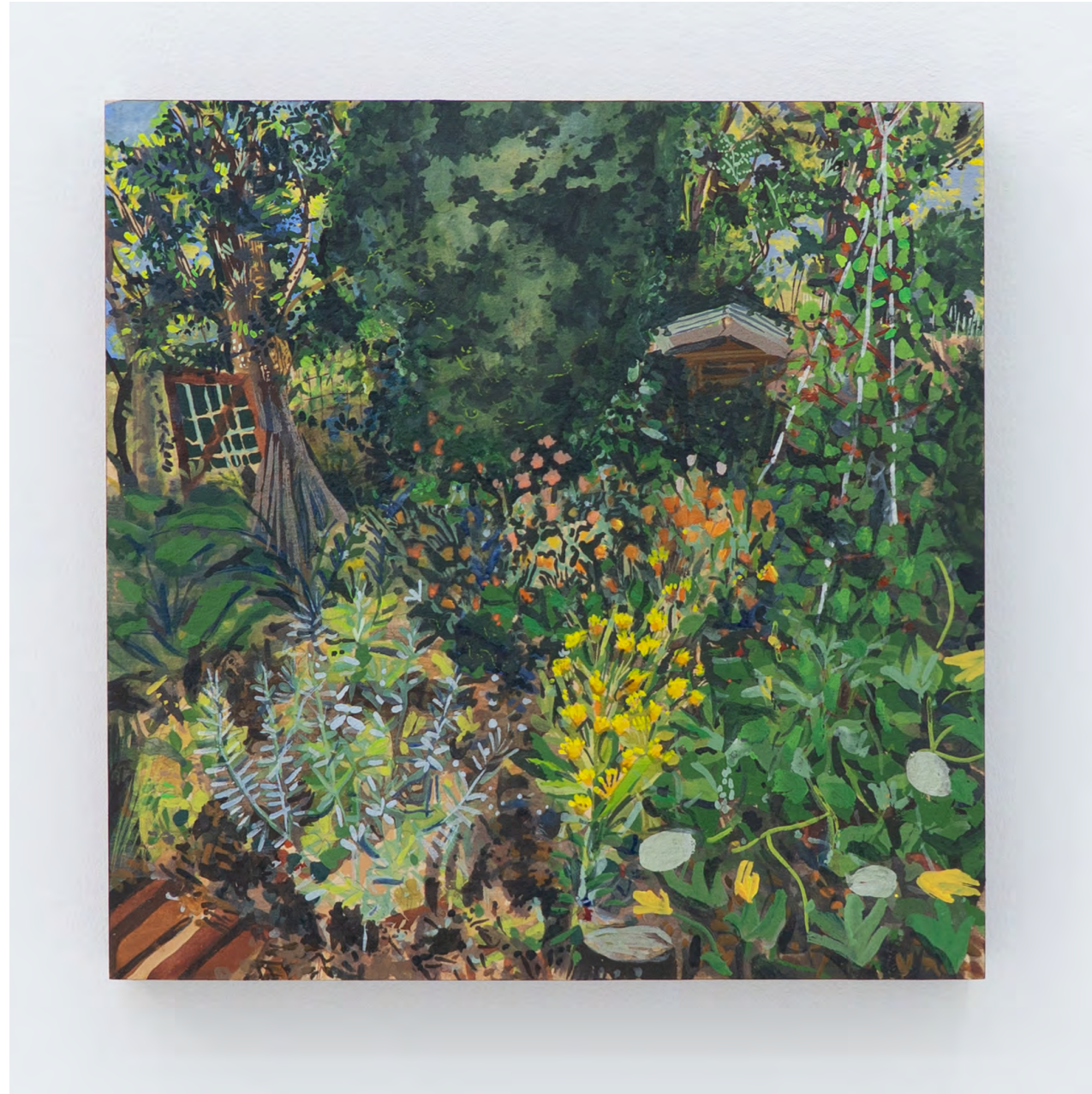
Sarita Doe Flower Mountain , 2024 Natural pigment on board 12 x 12 inches

“Flower Mountain is a site of prayer, soil cultivation, and plant communication. We made Equinox offerings here upon first moving to this home.”