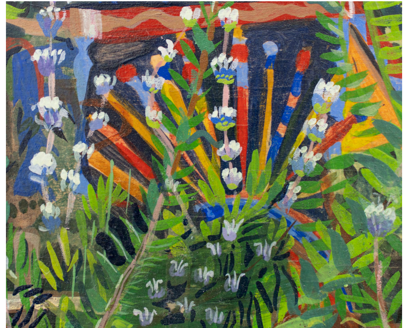
Sarita Doe Rain Gardens, Chicken Temple (Fennel, Black Sage, Mugwort) , 2022 Natural pigment and gouache on board 18 x 24 inches (detail)