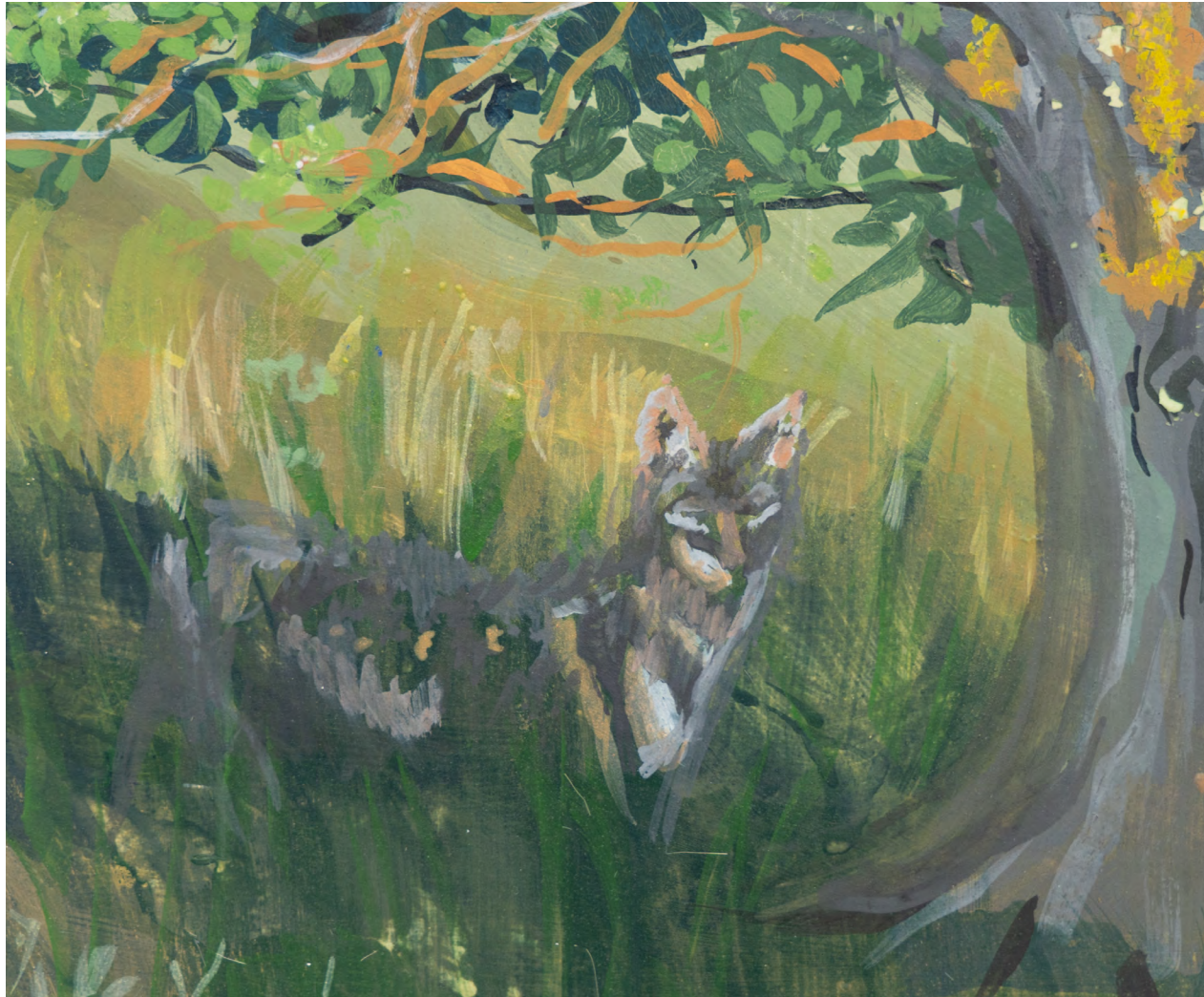
Sarita Doe Buckeye Beauty , 2023 Natural pigment and gouache on board 24 x 30 inches (detail)