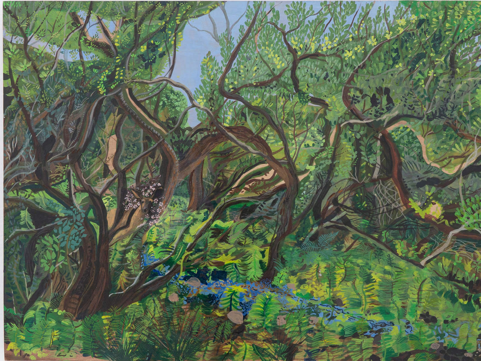
Sarita Doe Spring Deer Deity , 2024 Natural pigment on board 18 x 24 inches

"We followed a water calling through the eucalyptus forest in the city until we came upon a natural Spring. At Equinox we made an offering, and the deer goddess made herself known."