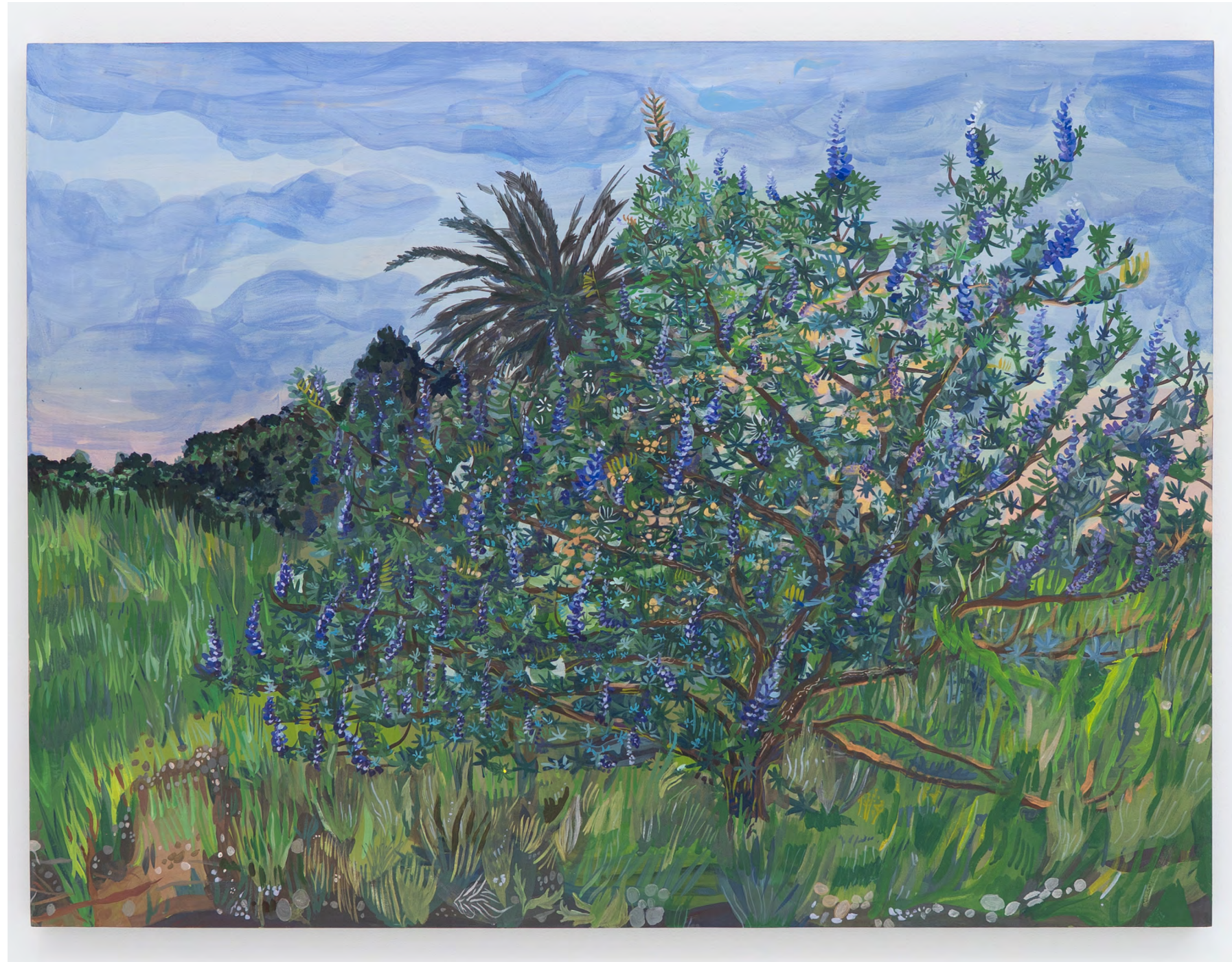
Sarita Doe Bush Lupine Habitat , 2023 Natural pigment and gouache on board 28 x 36

"In our front yard between freeways, a habitat grew there before there were cars. Bush Lupine held court in the cul-de-sac, bearing bloom and joy."