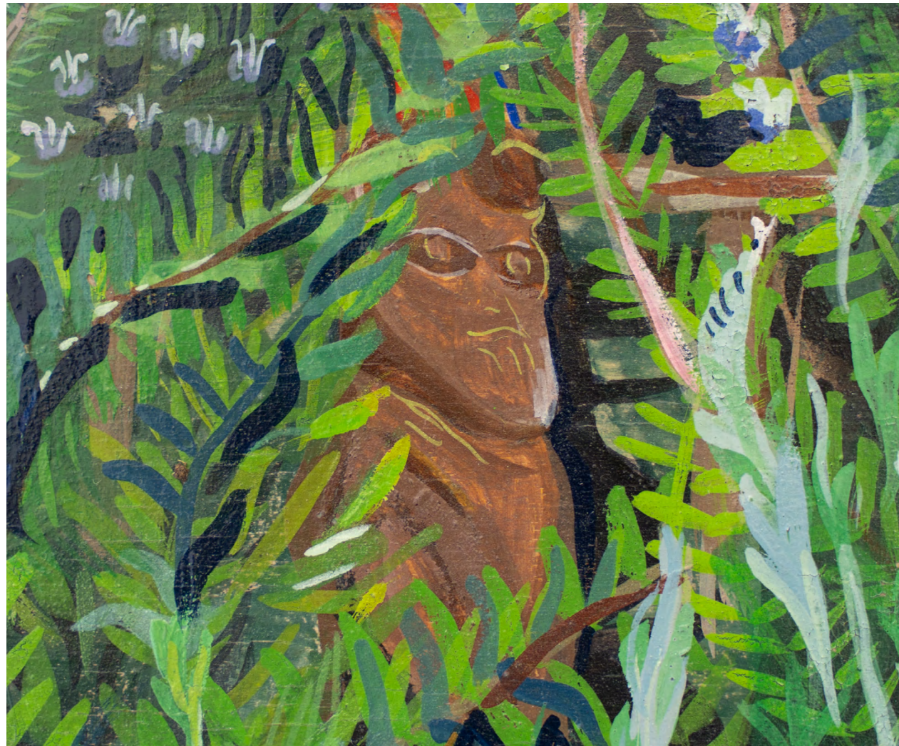
Sarita Doe Rain Gardens, Chicken Temple (Fennel, Black Sage, Mugwort) , 2022 Natural pigment and gouache on board 18 x 24 inches (detail)