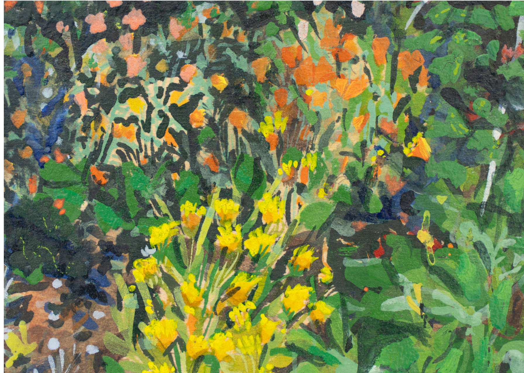
Sarita Doe Flower Mountain, 2024 Natural pigment on board 12 x 12 inches (detail)