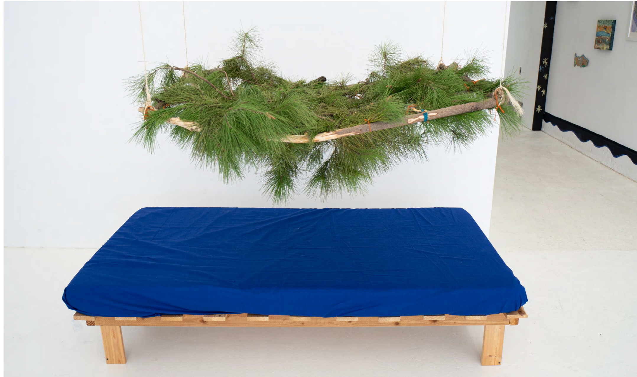
Sarita Doe Healing Pines , 2025 Monterey Pine needles, yarn, twine, oak and redwood branches dimensions variable

“Lie down human, breathe and reset. Shift into tree-mind and unwind.”