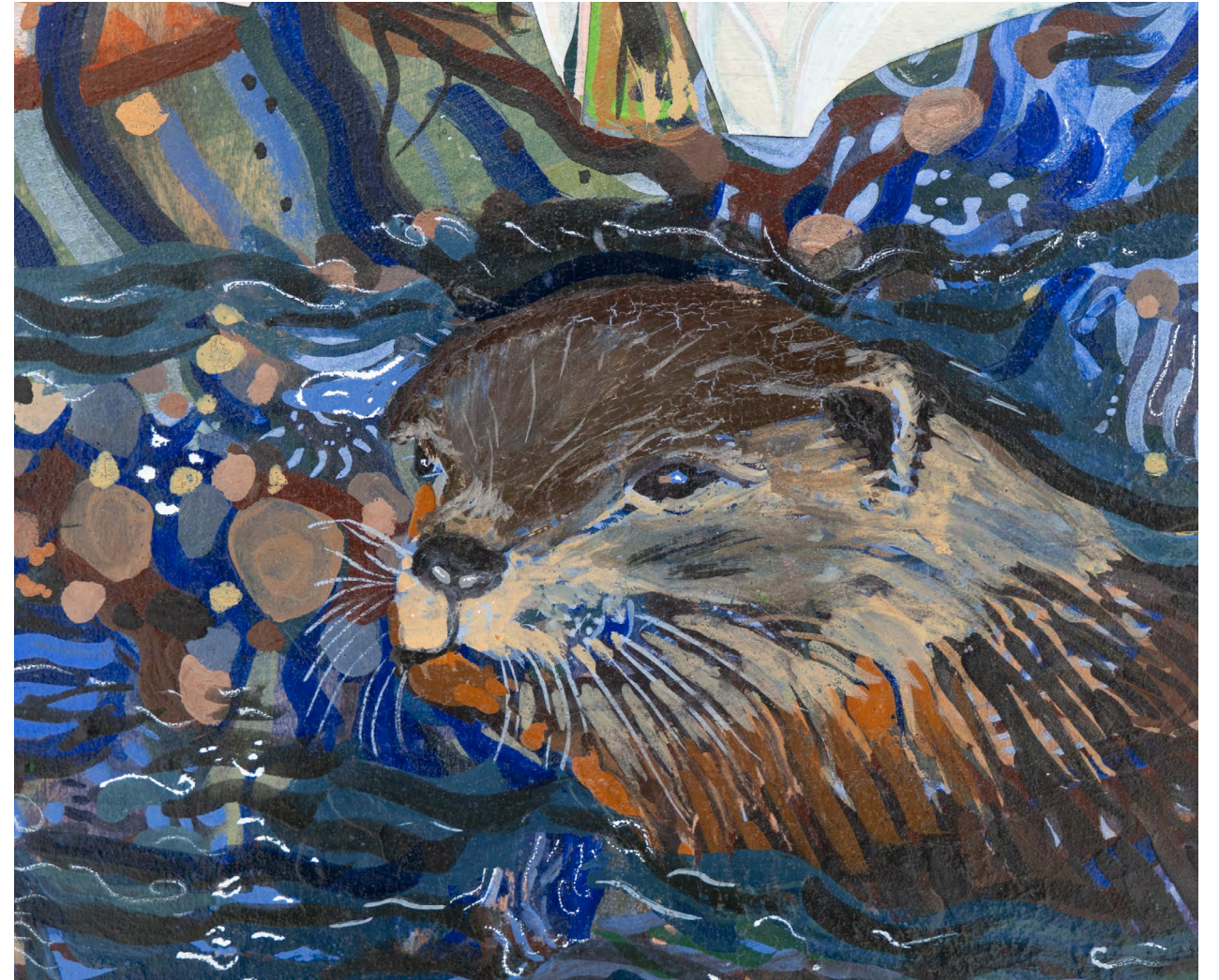
Sarita Doe Grow Native Habitat, 2024 Natural pigment and collage on board 48 x 36 inches (detail)