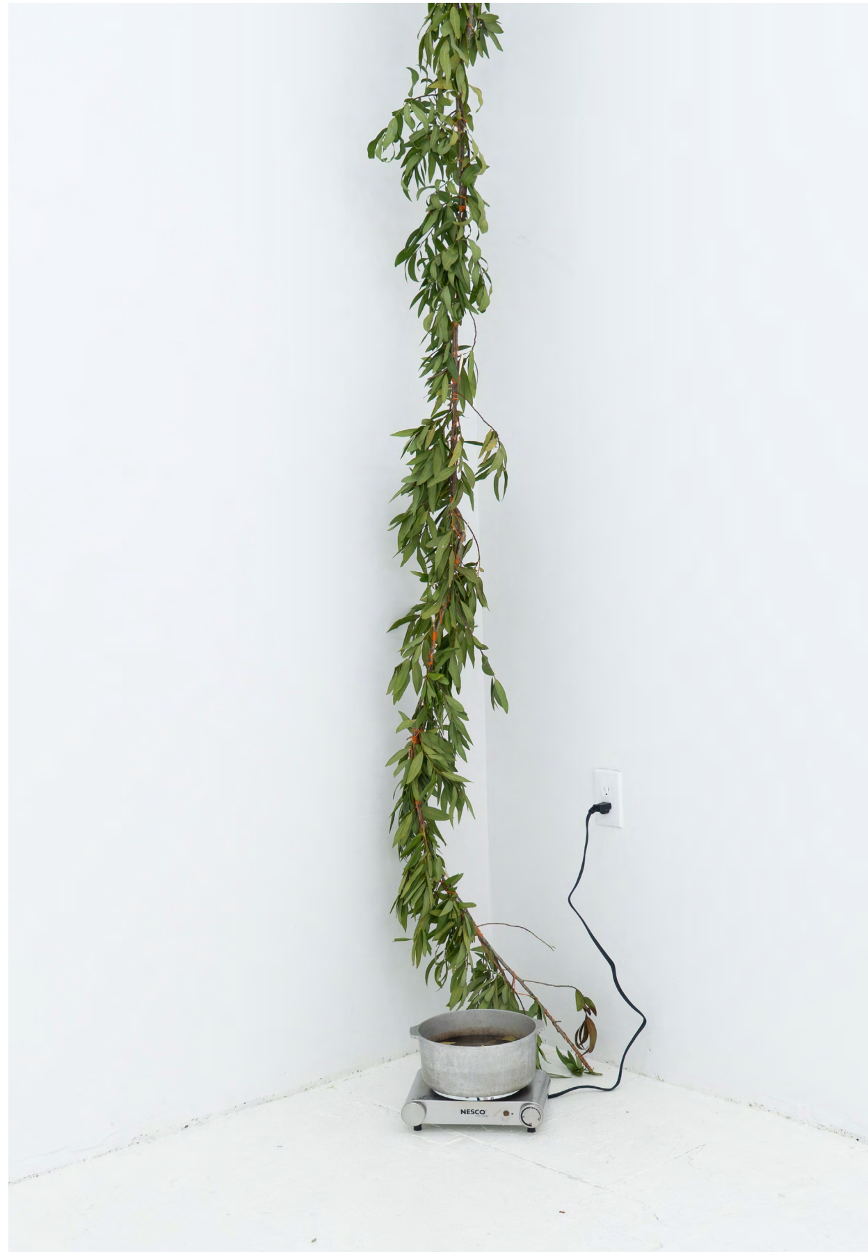
Sarita Doe Bay Laurel for our Lungs, 2025 bay laurel leaves, yarn, twine, hotplate and pot 144 x 7 inches