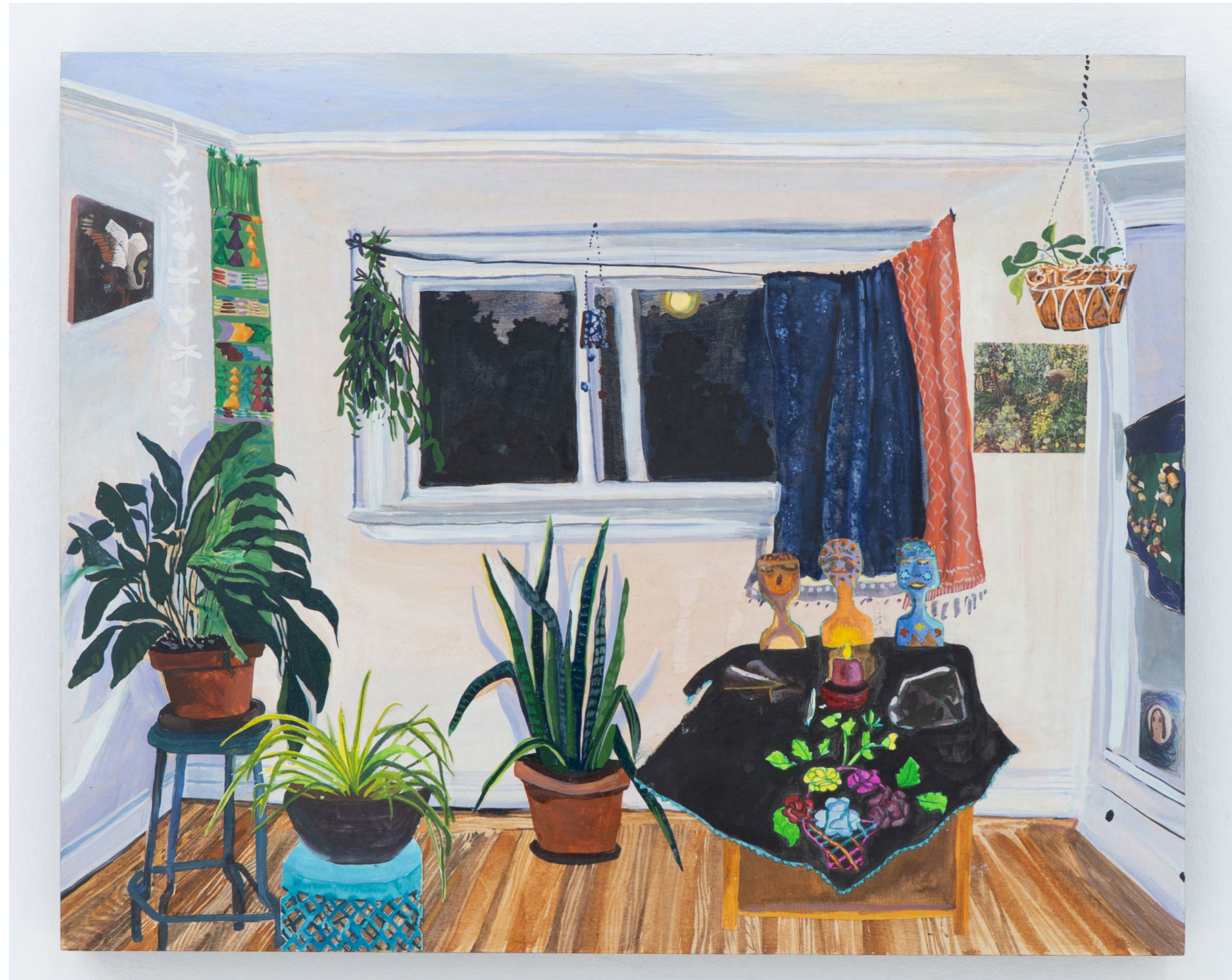
Sarita Doe Breathing Room , 2025 Natural pigment and collage on board 16 x 20 inches

"Here we bring in plant allies alongside altars for healing and breathing at home. The bay laurel leaves hang in the corner."