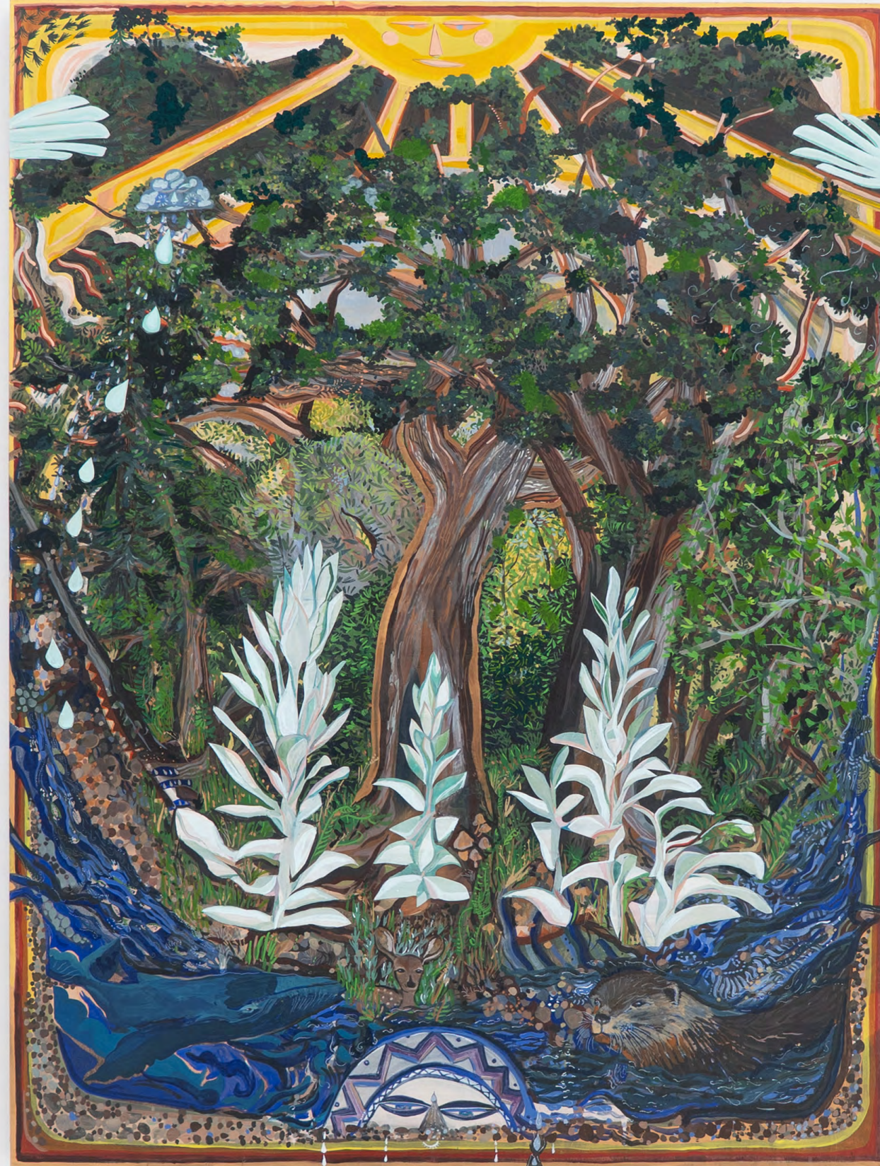
Sarita Doe Grow Native Habitat , 2024 Natural pigment and collage on board 48 x 36 inches

“This Coast Live Oak asked her portrait to be painted so I obliged and followed her lead on bringing in the watershed creatures by the creek. A week after completing this painting she fell over from sudden oak death.”