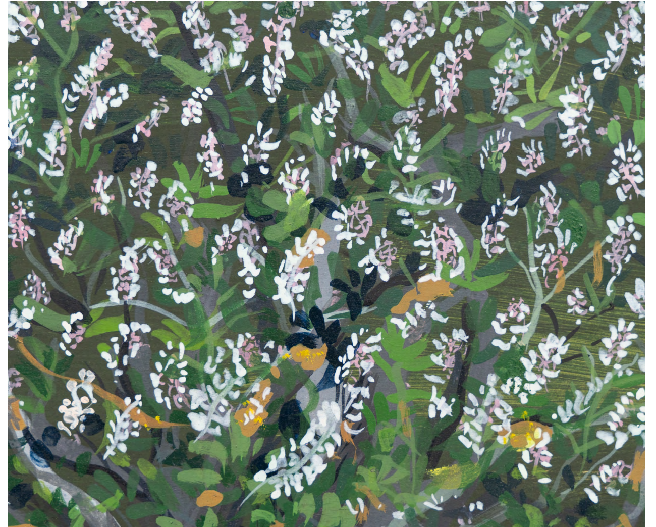
Sarita Doe Buckeye Beauty , 2023 Natural pigment and gouache on board 24 x 30 inches (detail)