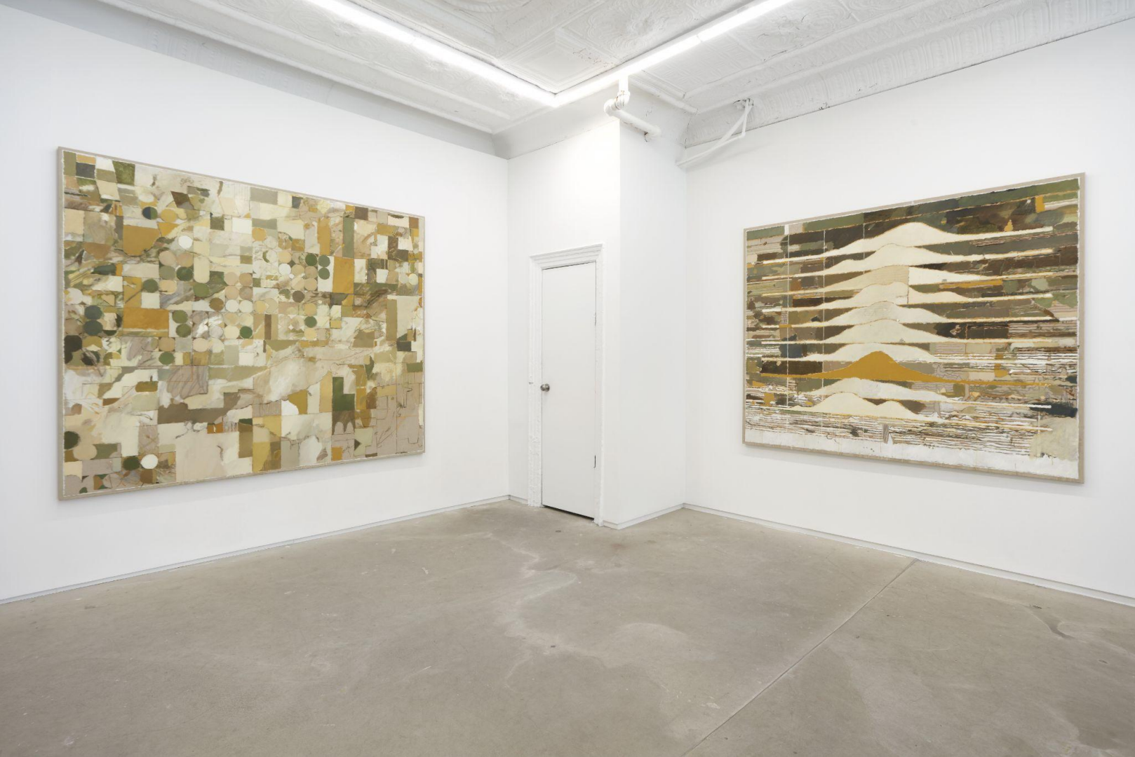
Installation view of Zephyr , 2025 at 105 Henry