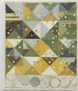
Installation view of Zephyr , 2025 at 56 Henry