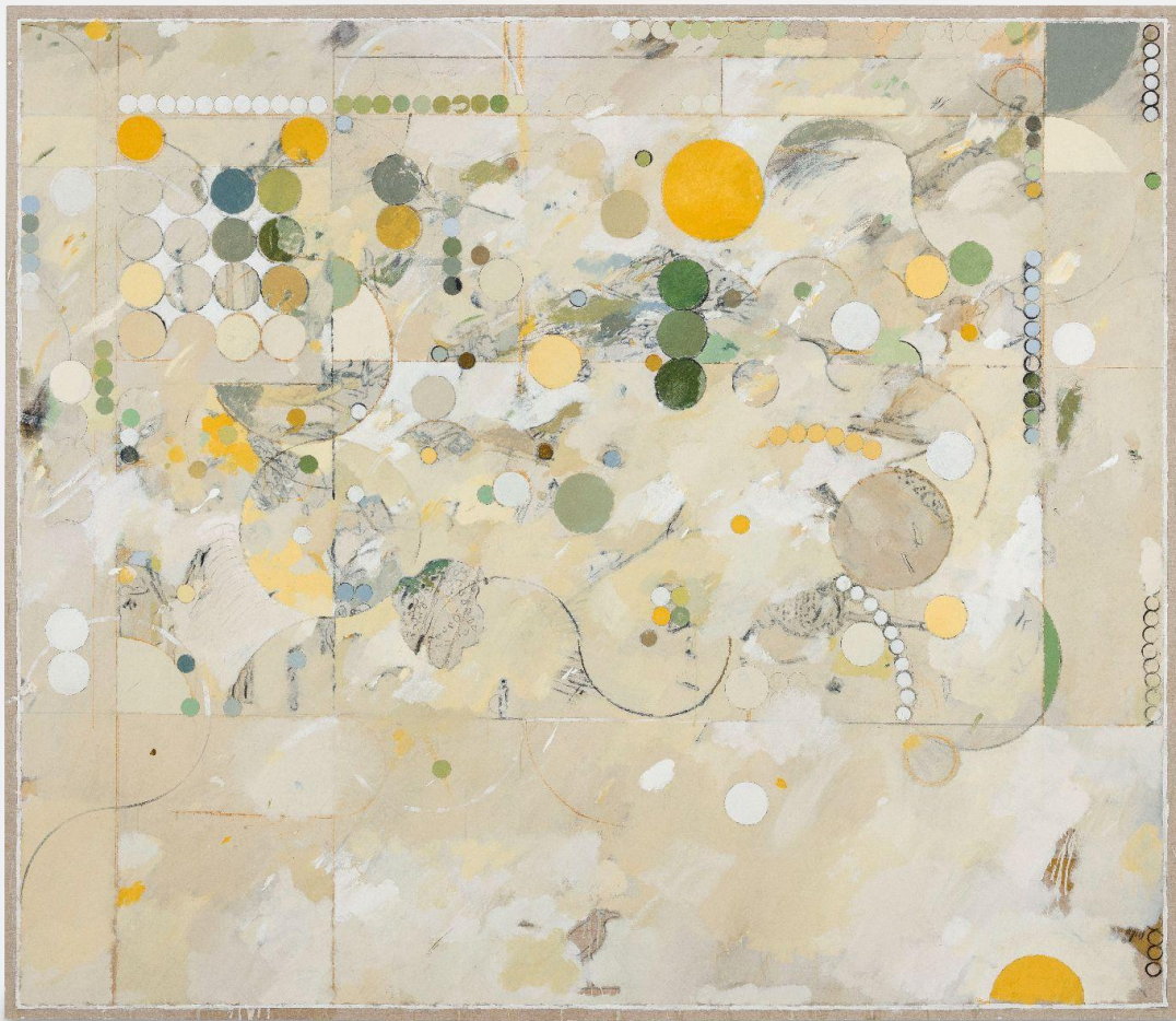
Pierre Bellot Planisphere , 2024 Oil on canvas 74 7/8 x 86 5/8 in 190 x 220 cm