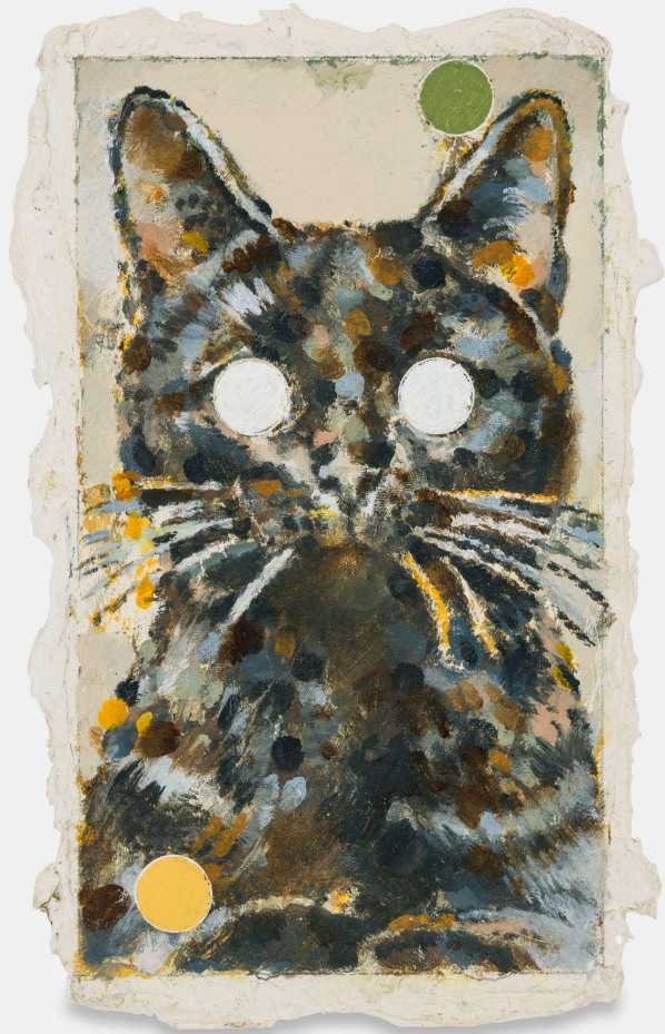
Pierre Bellot Black cat , 2024 Oil on canvas 7 1/2 x 4 1/2 in 19.1 x 11.4 cm