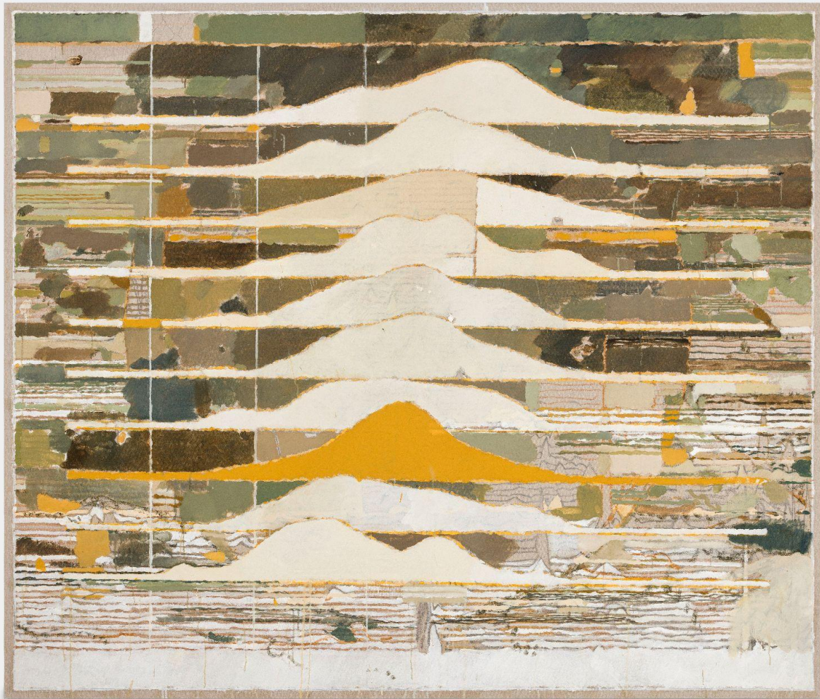
Pierre Bellot Seismic Waves , 2024 Oil on canvas 66 7/8 x 78 3/4 in 169.9 x 199.9 cm