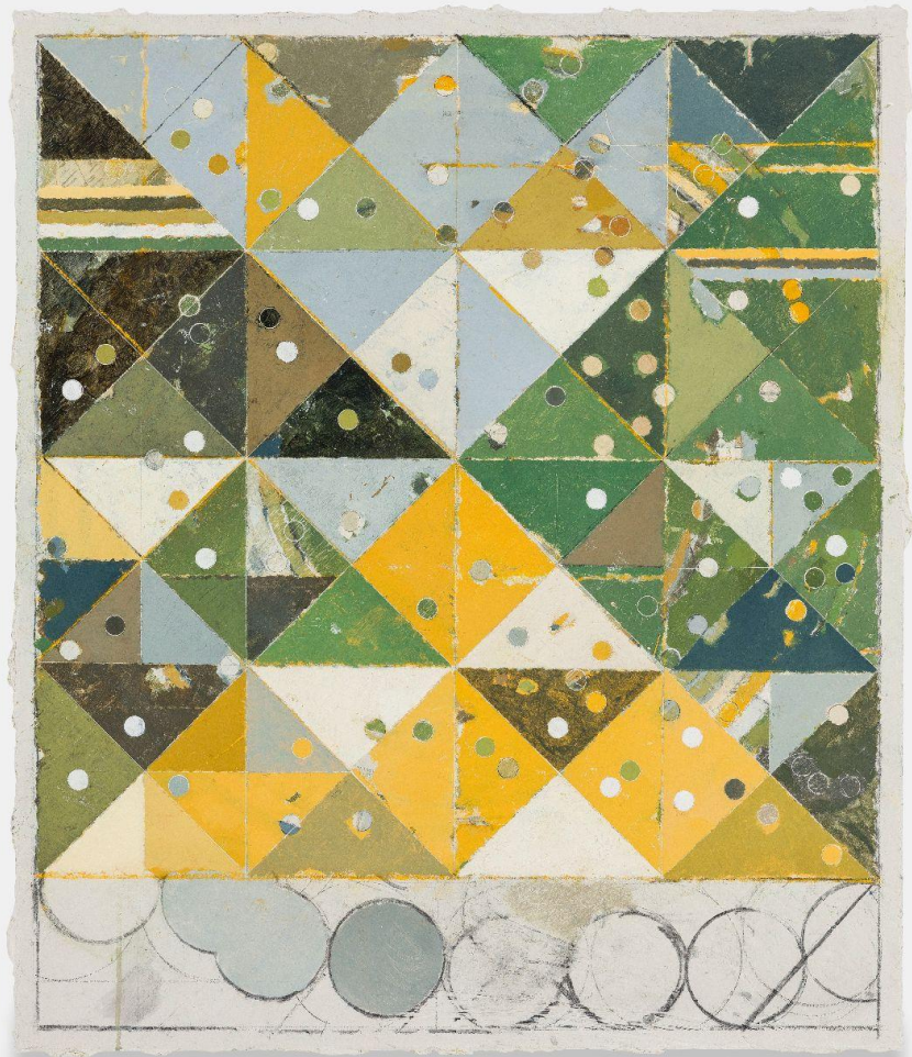
Pierre Bellot Zephyr , 2024 Oil on canvas 27 5/8 x 23 5/8 in 70 x 60 cm