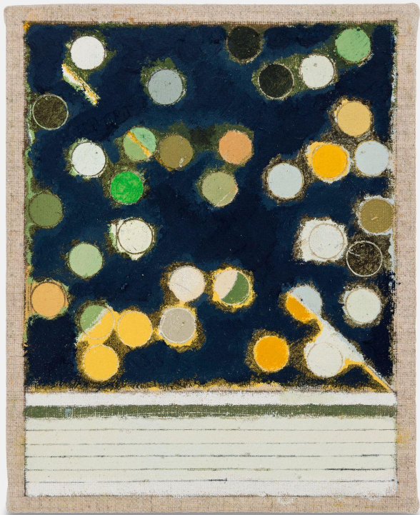
Pierre Bellot Night , 2024 Oil on canvas 7 7/8 x 6 1/4 in 20 x 15.9 cm