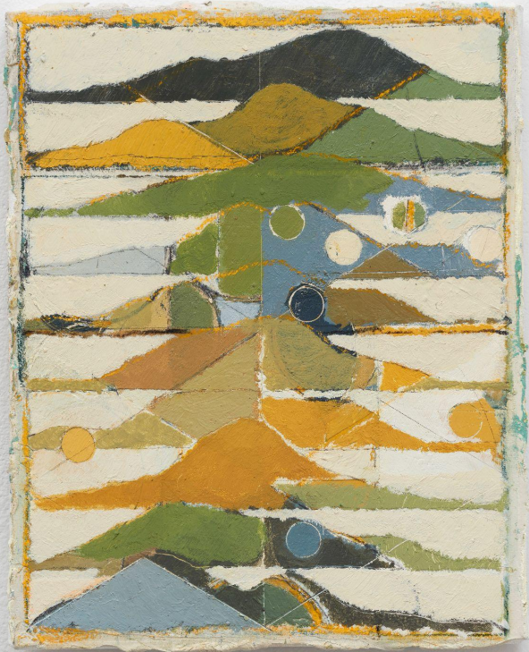
Pierre Bellot Mountains , 2025 Oil on canvas 10 1/4 x 7 7/8 in 25.9 x 20 cm