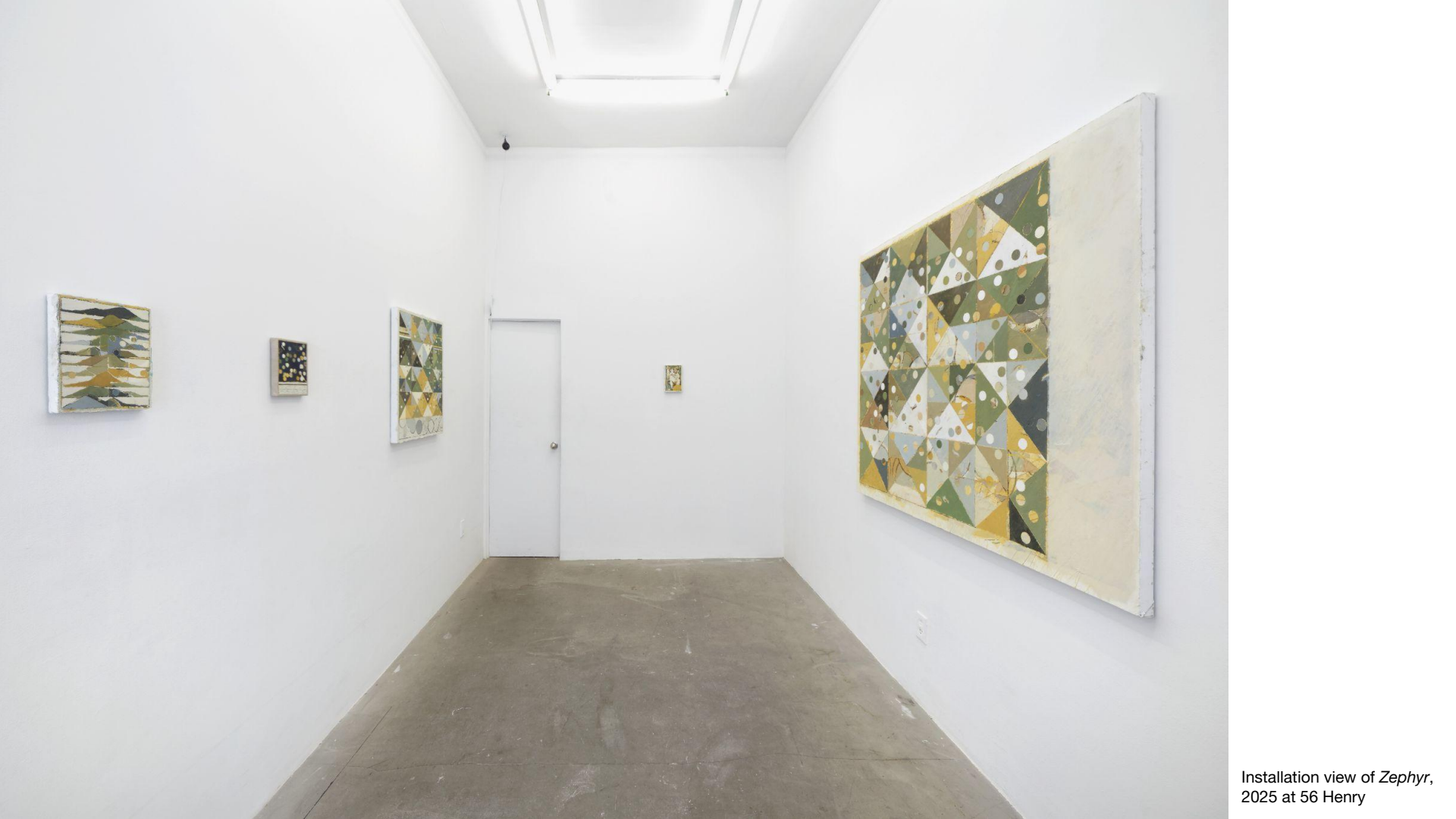
Installation view of Zephyr , 2025 at 56 Henry