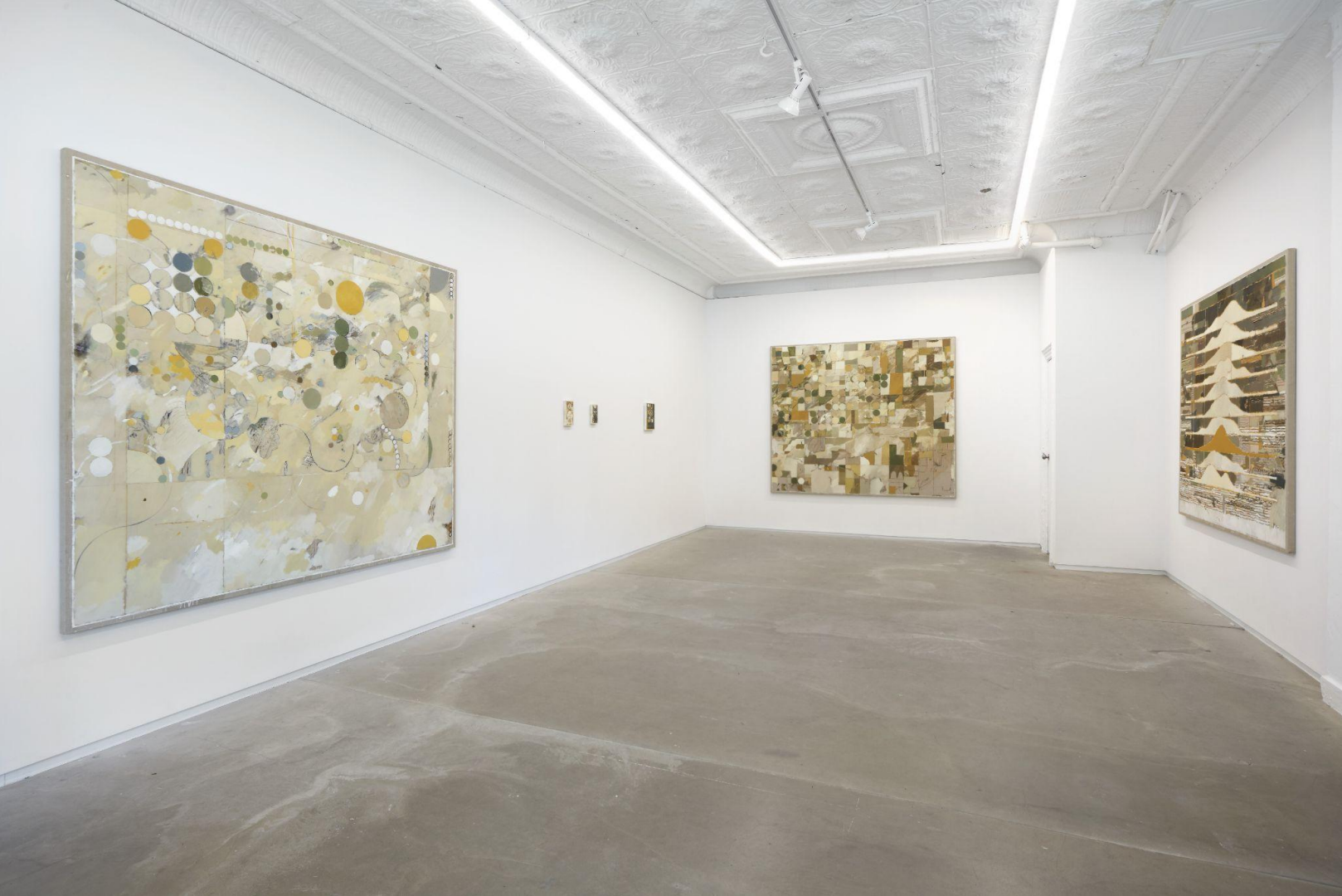
Installation view of Zephyr , 2025 at 105 Henry