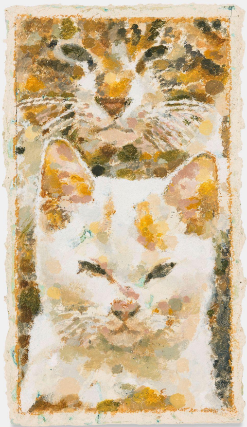
Pierre Bellot Ao-Shima , 2024 Oil on canvas 8 3/4 x 5 in 22.1 x 12.5 cm