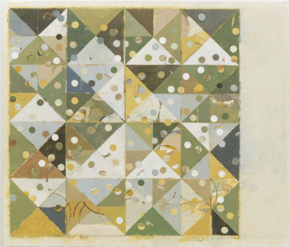
Installation view of Zephyr , 2025 at 56 Henry