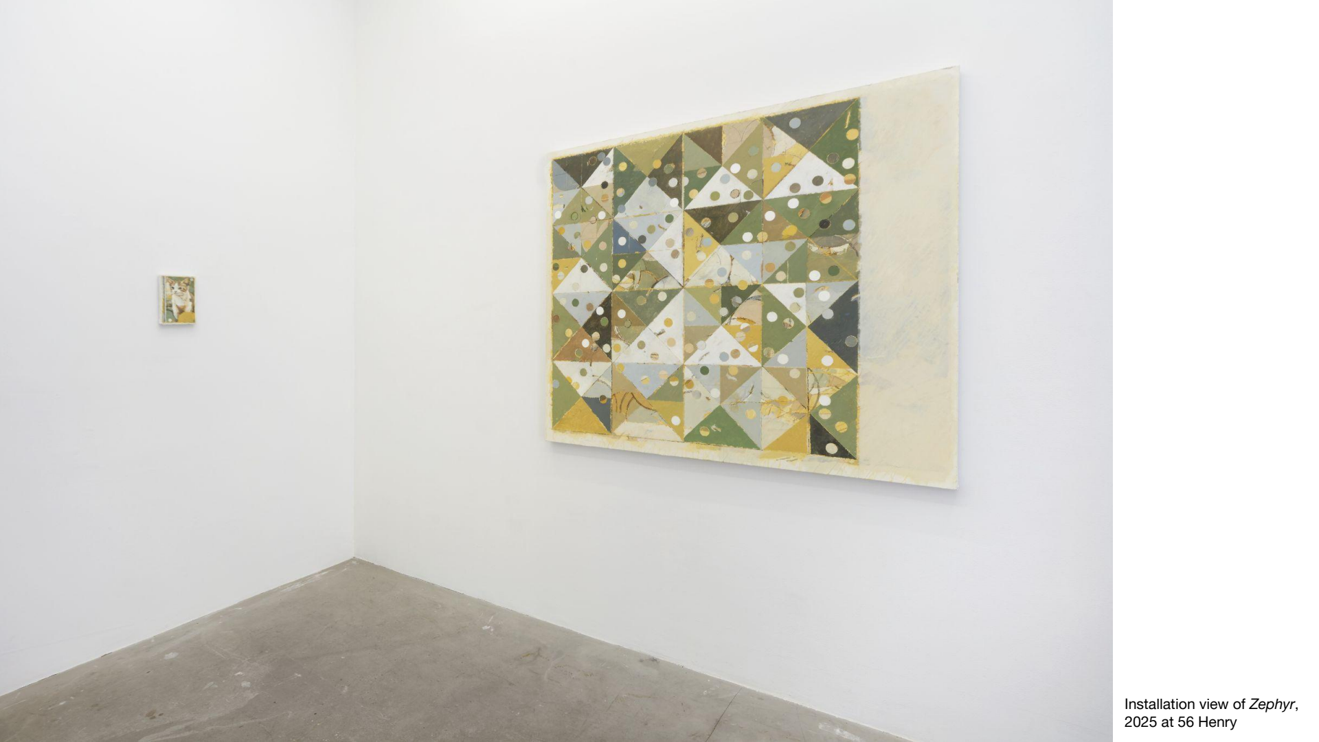
Installation view of Zephyr , 2025 at 56 Henry