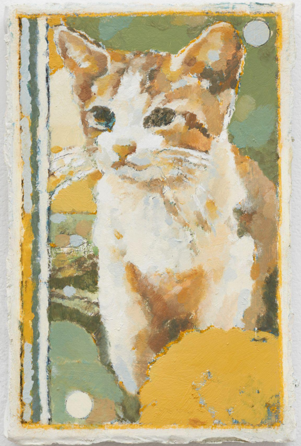
Pierre Bellot Standing cat , 2025 Oil on canvas 8 7/8 x 6 in 22.5 x 15.1 cm