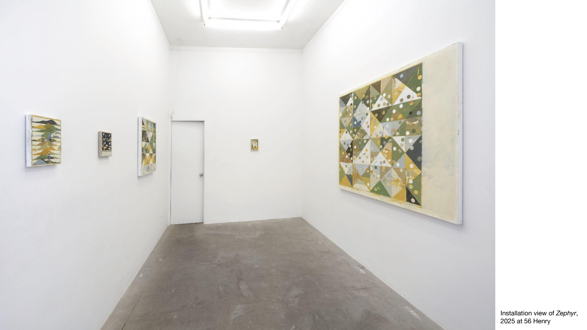
Installation view of Zephyr , 2025 at 56 Henry