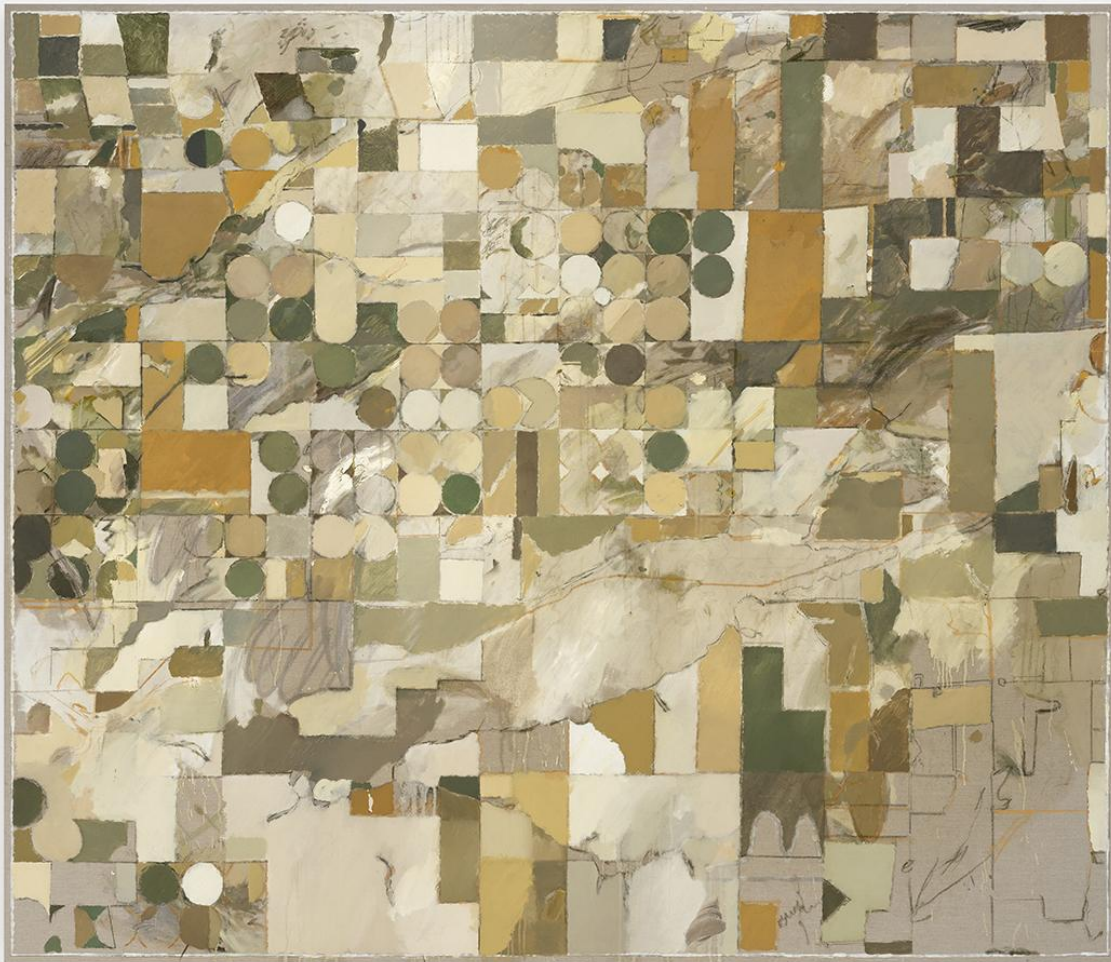
Pierre Bellot Fields , 2024 Oil on canvas 74 7/8 x 86 5/8 in 190 x 220 cm