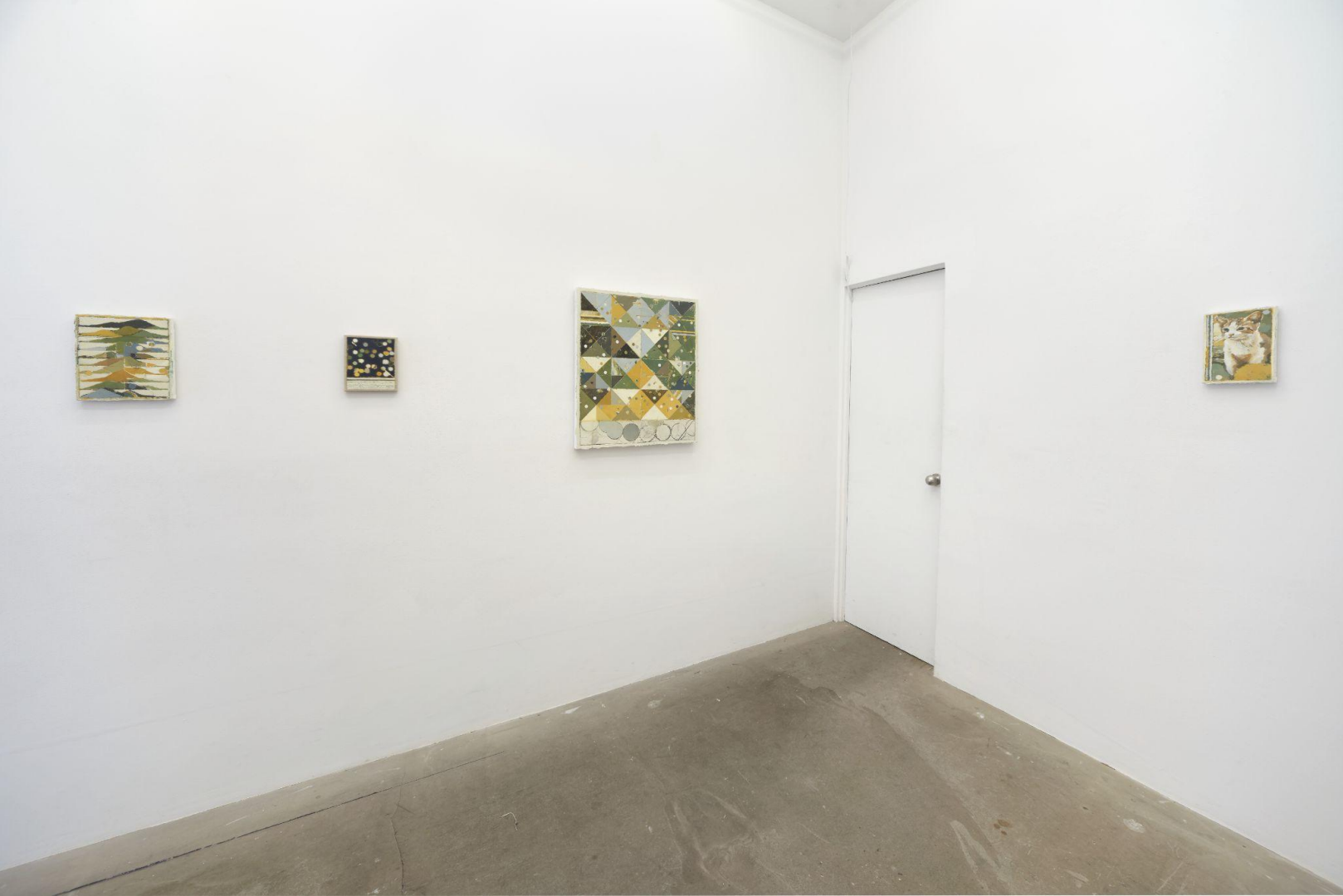
Installation view of Zephyr , 2025 at 56 Henry