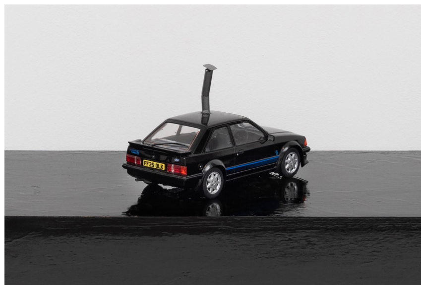
FF25 0LK , 2025 Pewter, brass, varnish, model Ford Escort Turbo 12 x 10 x 23 cm