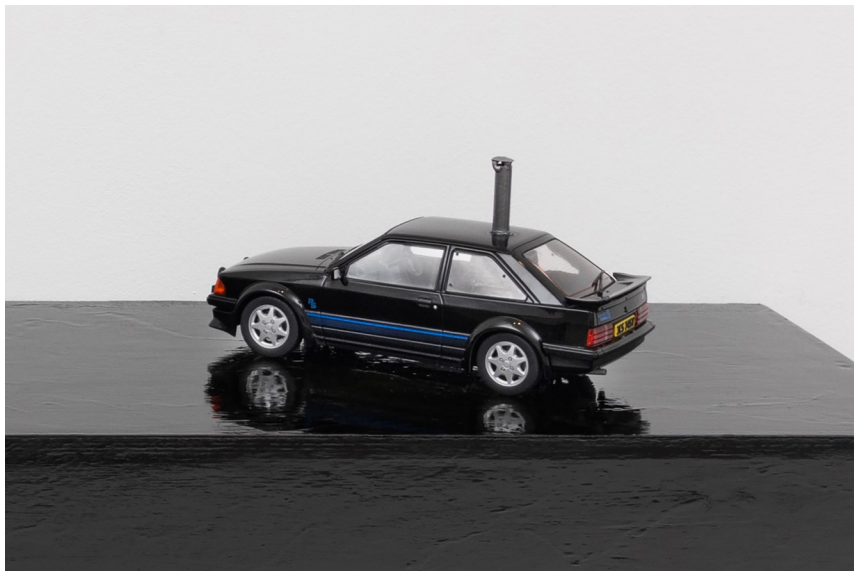
3C5 745Y , 2025 Pewter, brass, varnish, model Ford Escort Turbo 12 x 10 x 23 cm