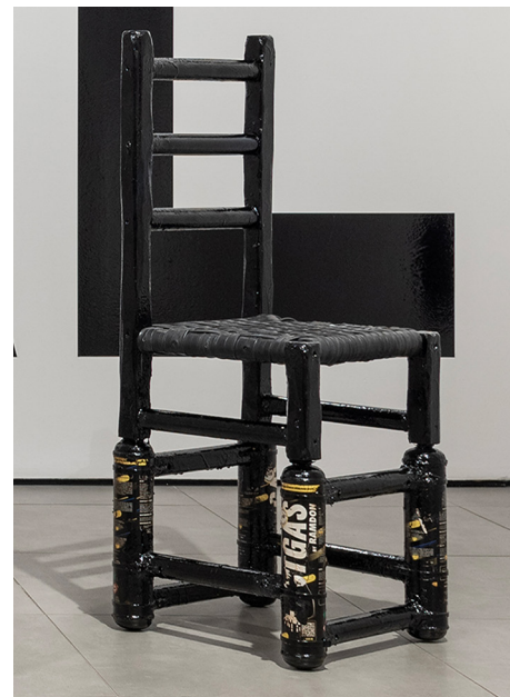
SHAKE SHAKE SHAKE (FASTGAS 2 - 7), 2024

Bitumen, NOS canisters, wood, metal inserts, inner tubes, sealant, cable ties, varnish