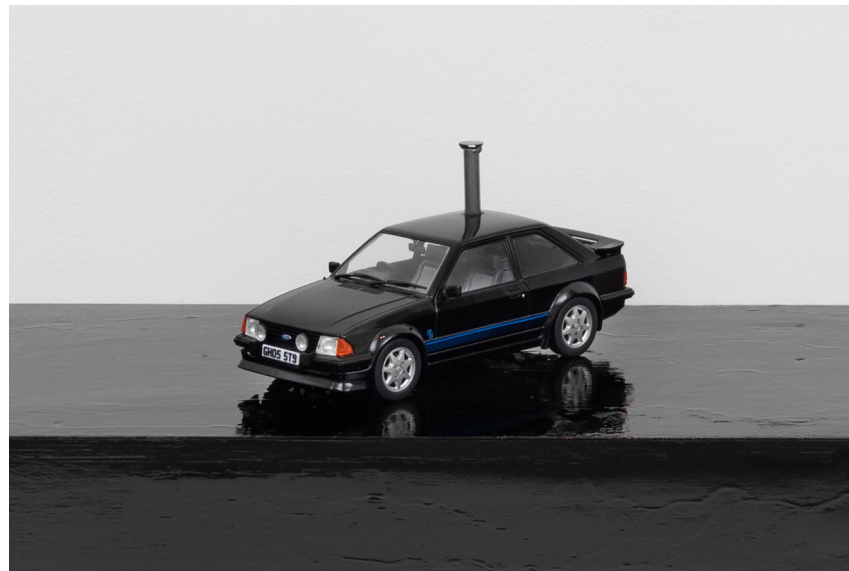
GH05 5T9 , 2025 Pewter, brass, varnish, model Ford Escort Turbo 13 x 10 x 23 cm