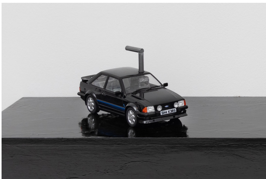
5H4 K3R5 , 2025 Pewter, brass, varnish, model Ford Escort Turbo 14 x 10 x 23 cm