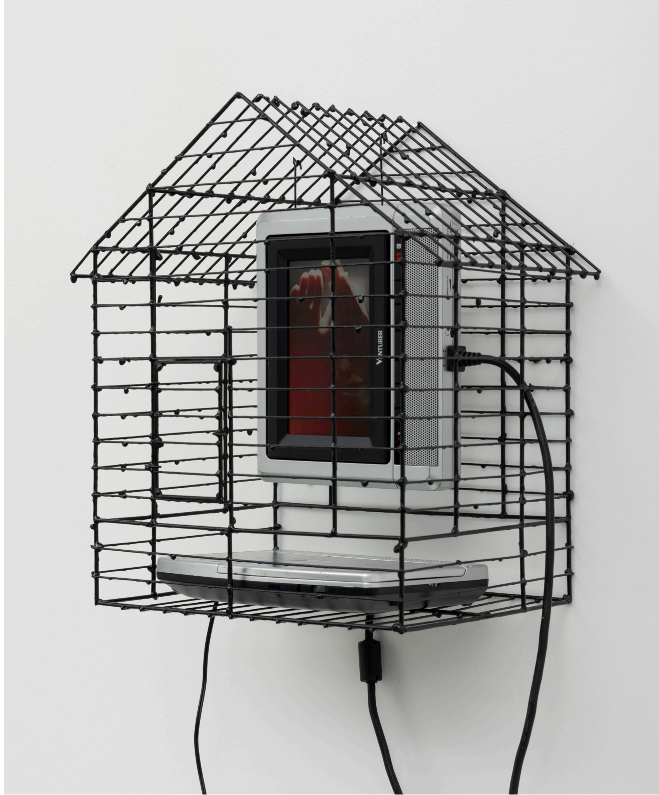
GHOST FOLK ECSTASY, 2025 Metal, solder, bitumen, varnish, DVD player 38 x 34 x 32 cm 15:00 min