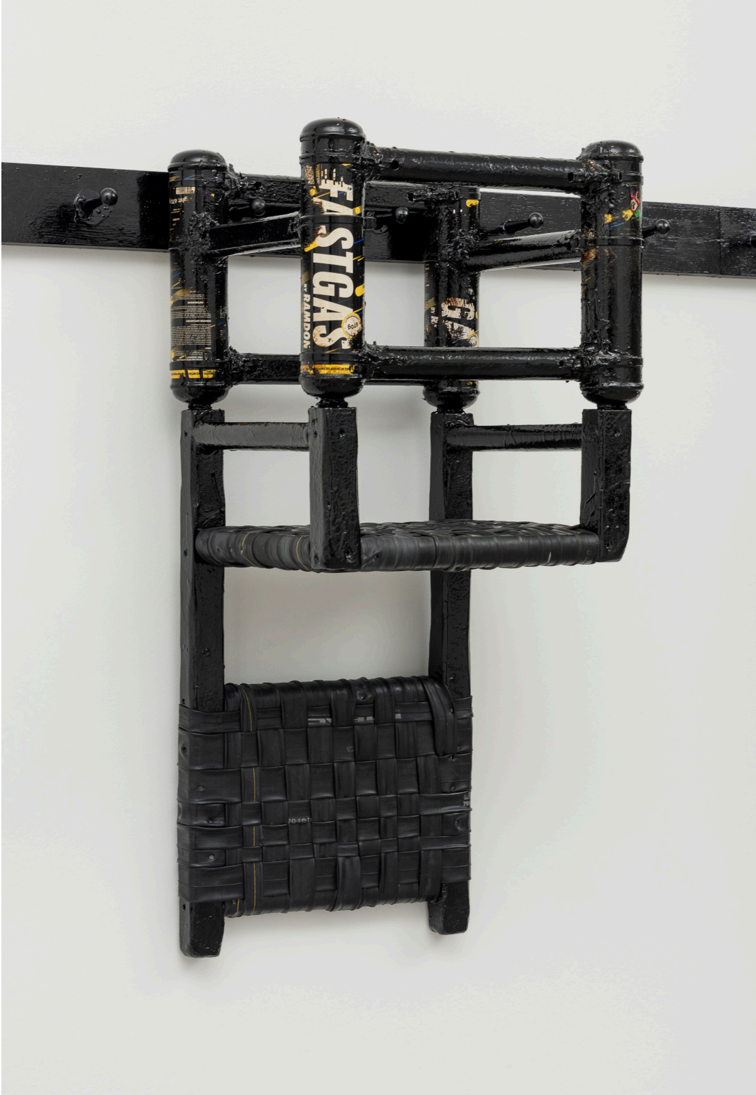
SHAKE SHAKE SHAKE (FASTGAS 1), 2024 Bitumen, NOS canisters, wood, metal inserts, inner tubes, sealant, cable ties, varnish 98 x 40 x 40 cm