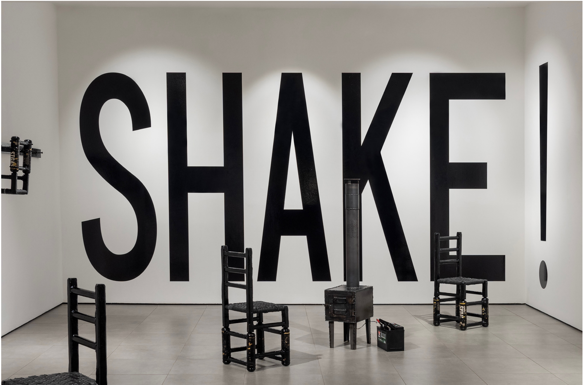
MOSH PIT , 2025 Vinyl 527 x 257 cm