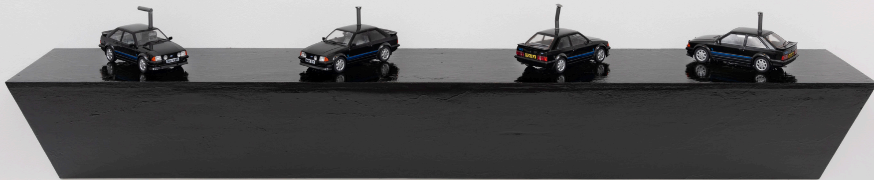
RIP MINIMALIST / shelf with Ford Escorts, 2025 Wood, bitumen, varnish, pewter, brass, varnish, model Ford Escort Turbo 30 x 175 x 30 cm