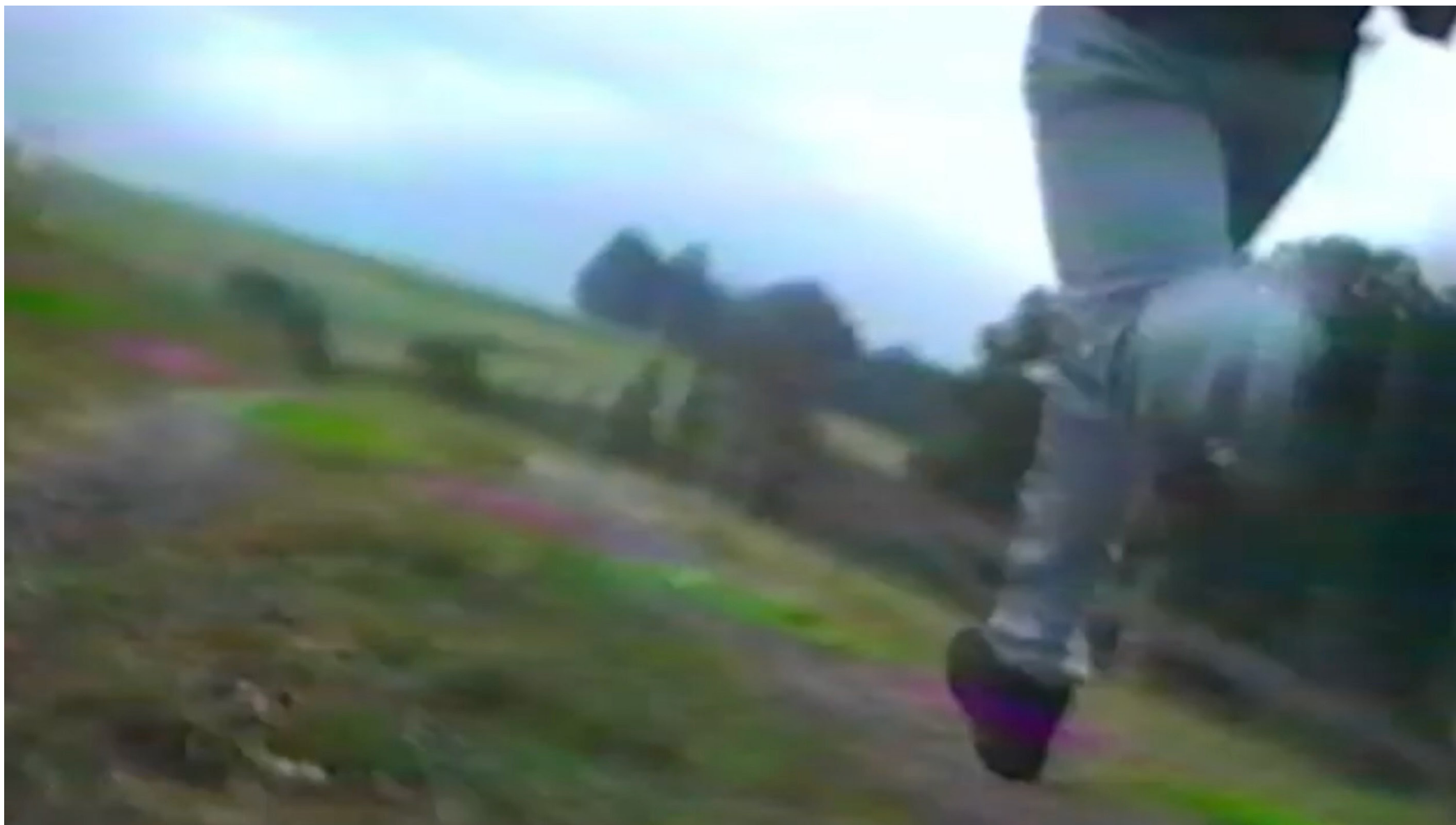
FUEL TO BURN , 2025 [Video screenshot] Metal, solder, bitumen, varnish, DVD player 34 x 22 x 35 cm 08:30 min