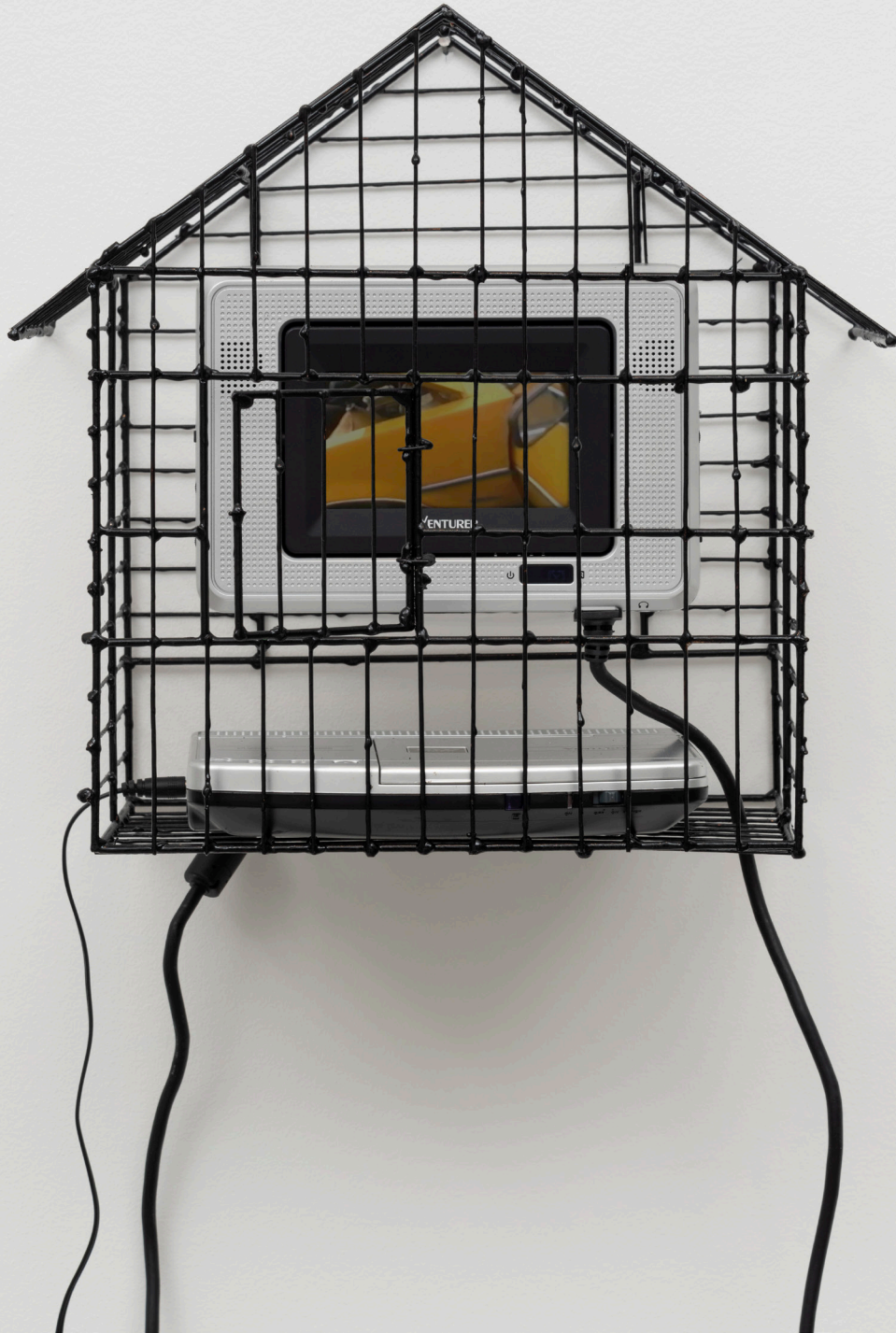
FUEL TO BURN, 2025 Metal, solder, bitumen, varnish, DVD player 34 x 22 x 35 cm 08:30 min