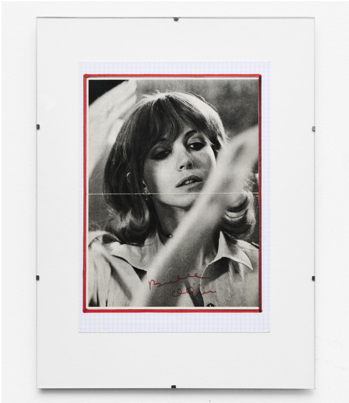
Autograph, Bulle Ogier

signature on press cut, on Bristol paper mounted on rag board under glass 12 x 16 inch 30 x 40 cm 1993