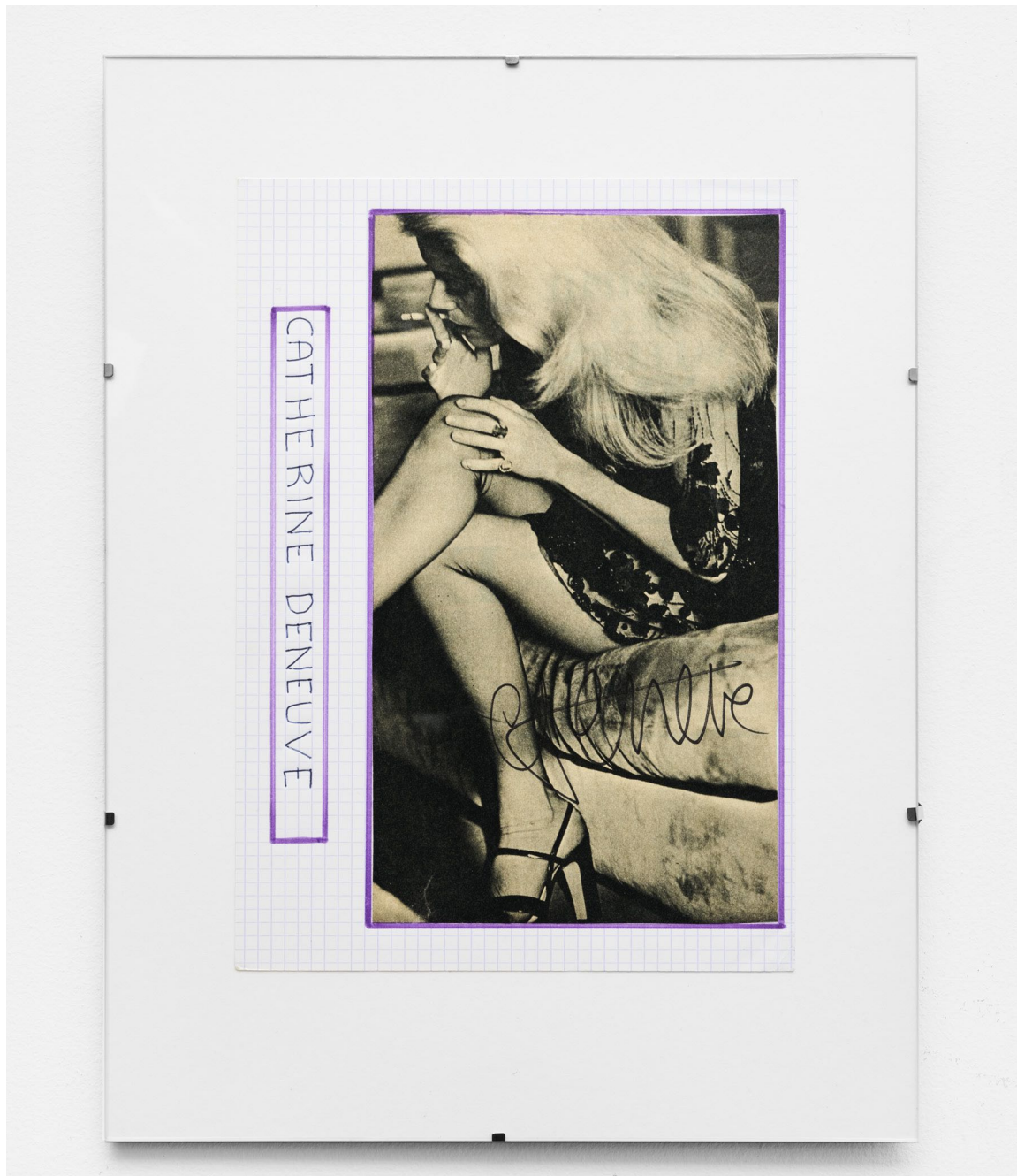
Autograph, Catherine Deneuve

signature on press cut, on Bristol paper mounted on rag board under glass 12 x 16 inch 30 x 40 cm 1993