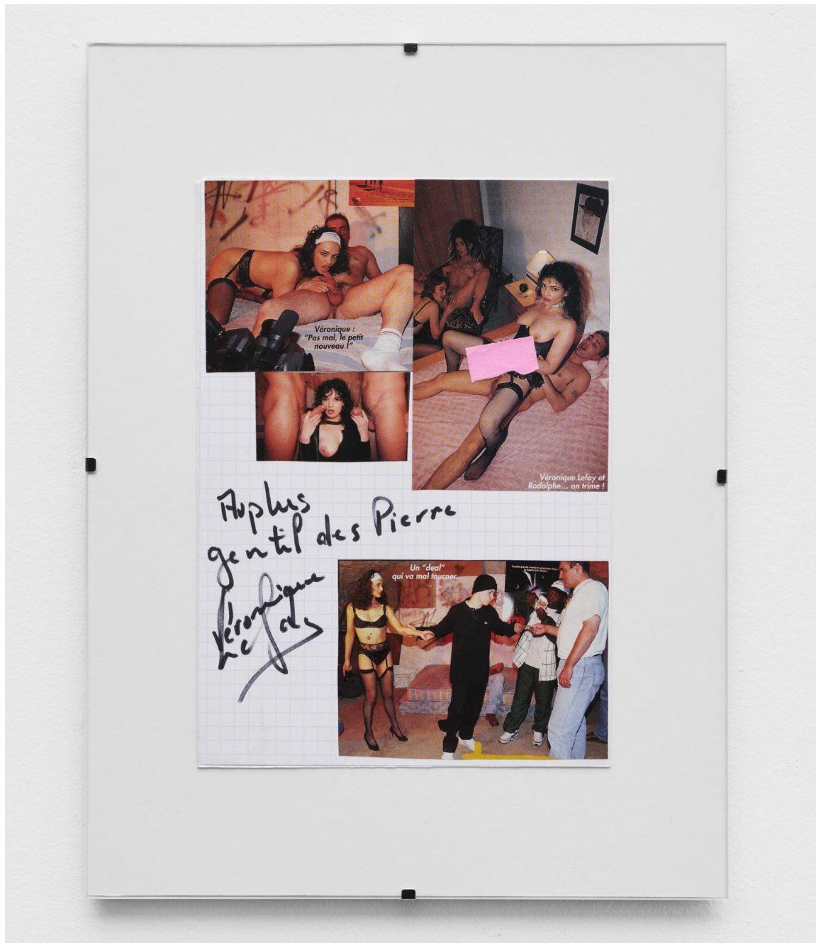
Autograph, Véronique Lefay 3

signature on press cut, on Bristol paper mounted on rag board under glass 12 x 9 inch 30 x 23 cm 1993