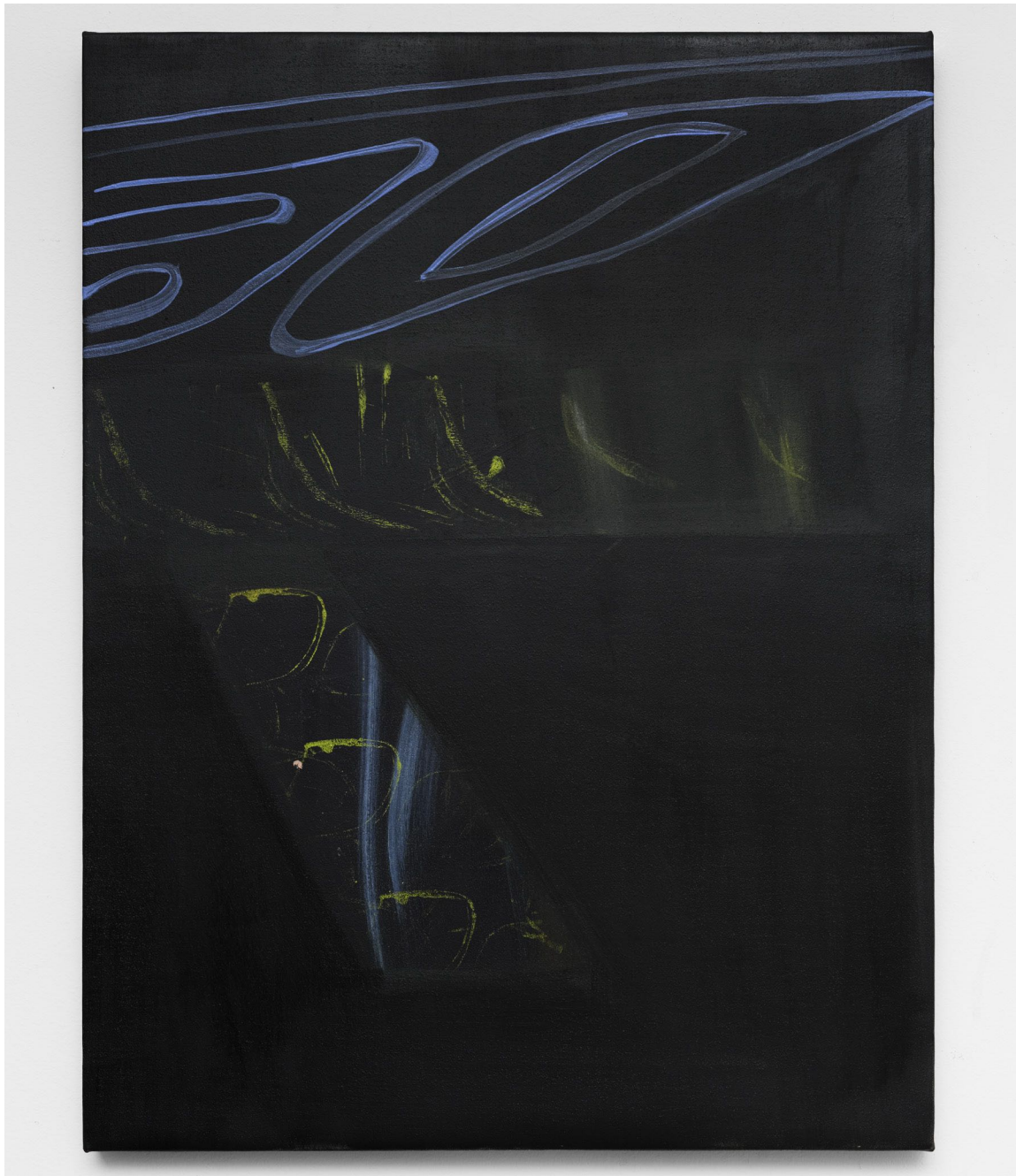
La monnaie vivante

oil on linen 25 x 19 inch 64 x 48 cm 2025