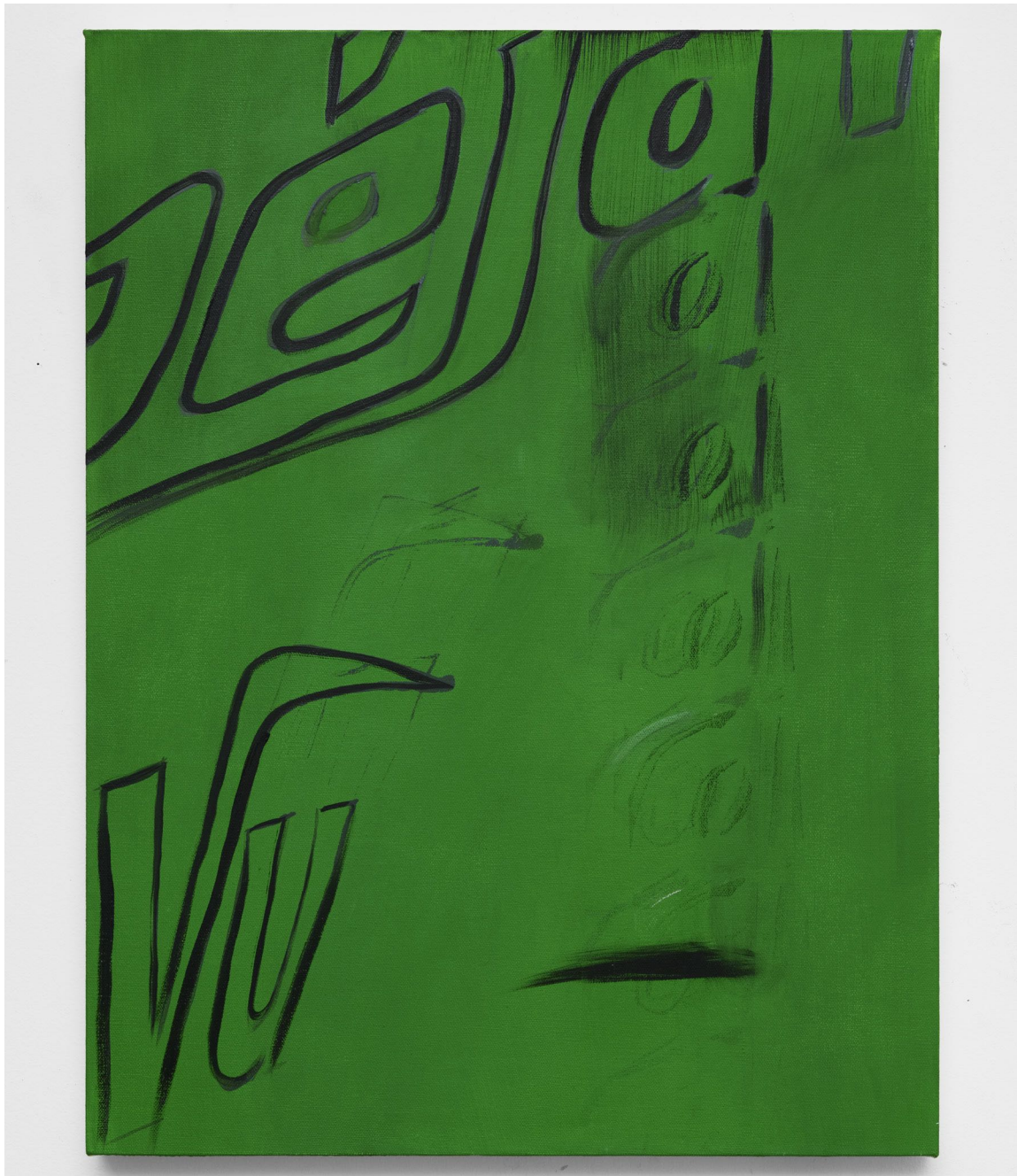
Blowbang at the Tupperware party

oil on canvas 25 x 19 inch 64 x 48 cm 2025