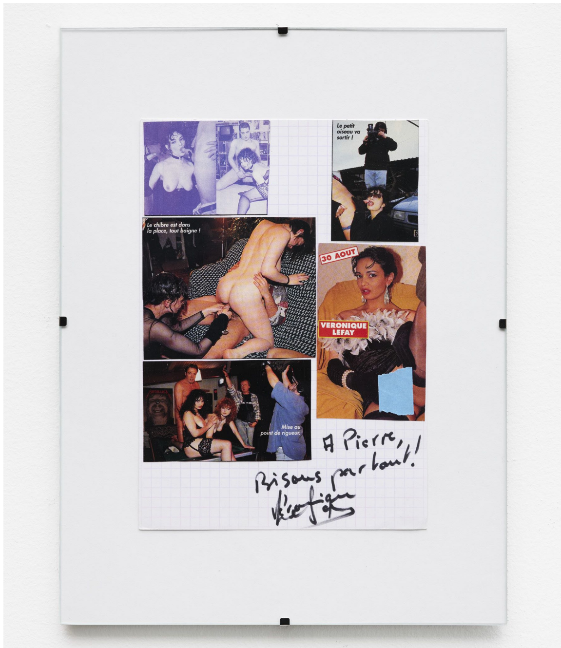
Autograph, Véronique Lefay 2

signature on press cut, on Bristol paper mounted on rag board under glass 12 x 9 inch 30 x 23 cm 1993