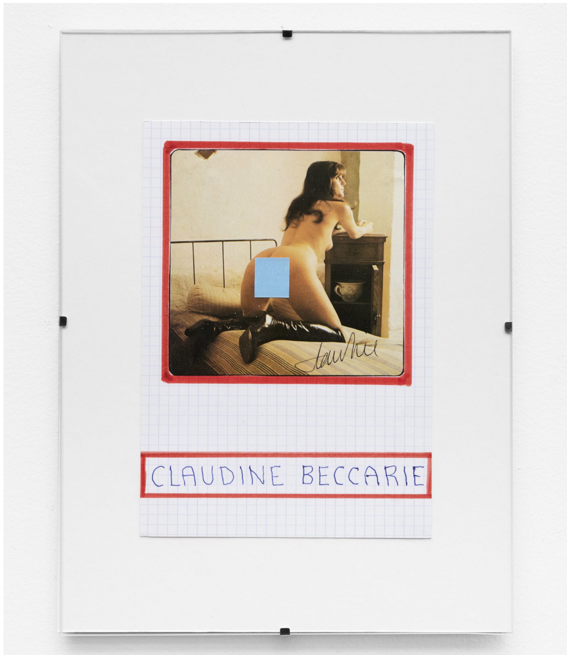
Autograph, Claudine Beccarie 2

signature on press cut, on Bristol paper mounted on rag board under glass 12 x 9 inch 30 x 23 cm 1993