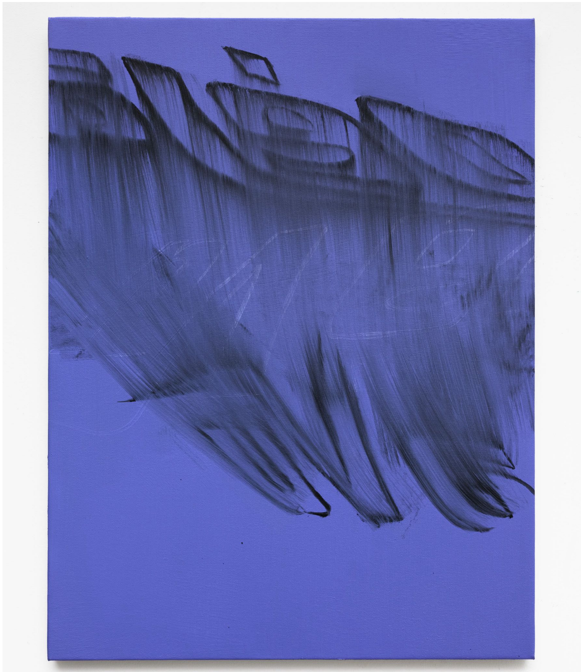
Reuben Sturman Lifetime Achievement Award

oil on linen 25 x 19 inch 64 x 48 cm 2025