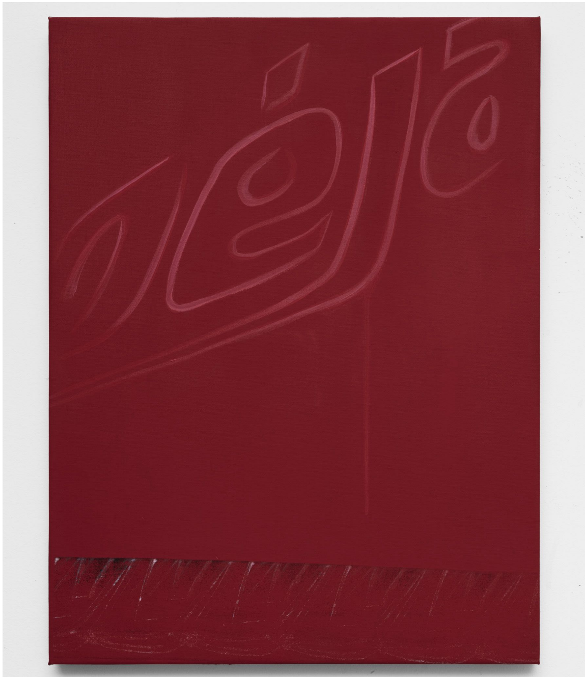
One thousand beautiful girls and three ugly ones

oil on linen 25 x 19 inch 64 x 48 cm 2025