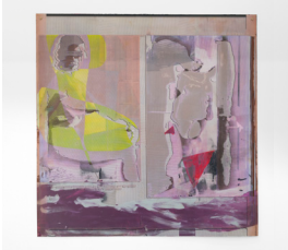
Anne-Mie Van Kerckhoven Energie Keskia Contrebalance , 2024 digital print on PVC, paper collage, aerosol, acrylic paint, acrylic varnish 100 x 100 x 0.3 cm 39 3/8 x 39 3/8 x 1/8 in (DEP-AMVK-0011 / 20240500B)