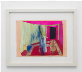
Anne-Mie Van Kerckhoven Auf der Höhepunkt der Psychose / At the Peak of Psychosis , 2006 drawing/collage, ink, felttip pen, and oil pastel on paper, stapled on handmade paper 41 x 50 x 2 cm (framed) 16 1/8 x 19 3/4 x 3/4 in (framed)