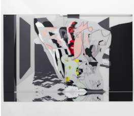
Anne-Mie Van Kerckhoven comebacktome , 2024 UV print on Plexiglas, unique 93 x 138 x 0.2 cm 36 5/8 x 54 3/8 x 1/8 in (DEP-AMVK-0013 / 20240808B)