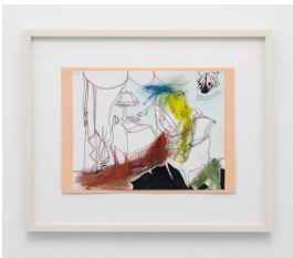
Anne-Mie Van Kerckhoven An Entire System of Defence 2005 drawing/collage, ink, felttip pen, and oil pastel on paper, stapled on handmade paper 41 x 50 x 2 cm (framed) 16 1/8 x 19 3/4 x 3/4 in (framed)