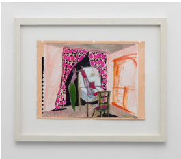
Anne-Mie Van Kerckhoven The Use of Horror , 2005 drawing/collage, ink, felttip pen, and oil pastel on paper, stapled on handmade paper 41 x 50 x 2 cm (framed) 16 1/8 x 19 3/4 x 3/4 in (framed) (DEP-AMVK-0003 / 20050628A)