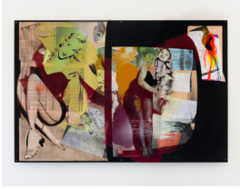
Anne-Mie Van Kerckhoven Op Doorreis / In Transit , 2023 digital print, laserprints, newspapers and acrylic on Plexiglas, mounted on painted wooden board 100 x 150 x 5,3 cm 39 3/8 x 59 x 2 1/8 in (DEP-AMVK-0015 / 20230200B)