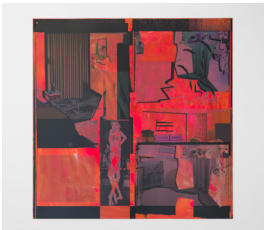
Anne-Mie Van Kerckhoven empreint jdirai Odissey , 2025 digital print on PVC, paper collage, aerosol, acrylic paint, acrylic varnish 100 x 100 x 0,3cm (DEP-AMVK-0010 / 20250200C)