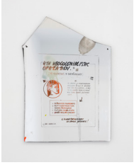
Anne-Mie Van Kerckhoven 2nd Rendez-vous in Doctrineland , 2013 mixed media on Plexiglas mirror 45 x 31 x 0,2 cm 17 3/4 x 12 1/4 x 1/8 in (DEP-AMVK-0017)