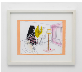
Anne-Mie Van Kerckhoven A Transmitter of Fluid , 2005 drawing/collage, ink, felttip pen, and oil pastel on paper, stapled on handmade paper 41 x 50 x 2 cm (framed) 16 1/8 x 19 3/4 x 3/4 in (framed) (DEP-AMVK-0005 / 20050600B)