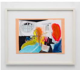
Anne-Mie Van Kerckhoven This Image of the Human Heart , 2005 drawing/collage, ink, felttip pen, and oil pastel on paper, stapled on handmade paper 41 x 50 x 2 cm (framed) 16 1/8 x 19 3/4 x 3/4 in (framed) (DEP-AMVK-0004 / 20050800A)