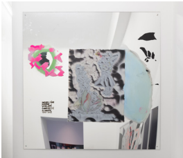
Anne-Mie Van Kerckhoven Pourquoi l'Âme conserve sa Volonté , 2025 collage and paint on Plexiglas mirror 100 x 100 x 0.3 cm 39 3/8 x 39 3/8 x 1/8 in (DEP-AMVK-0016 / 20250200B)