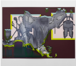
Anne-Mie Van Kerckhoven naughtyboy , 2025 UV print on Plexiglas, unique 93 x 131 x 0.2 cm 36 5/8 x 51 5/8 x 1/8 in (DEP-AMVK-0012 / 20250202A)