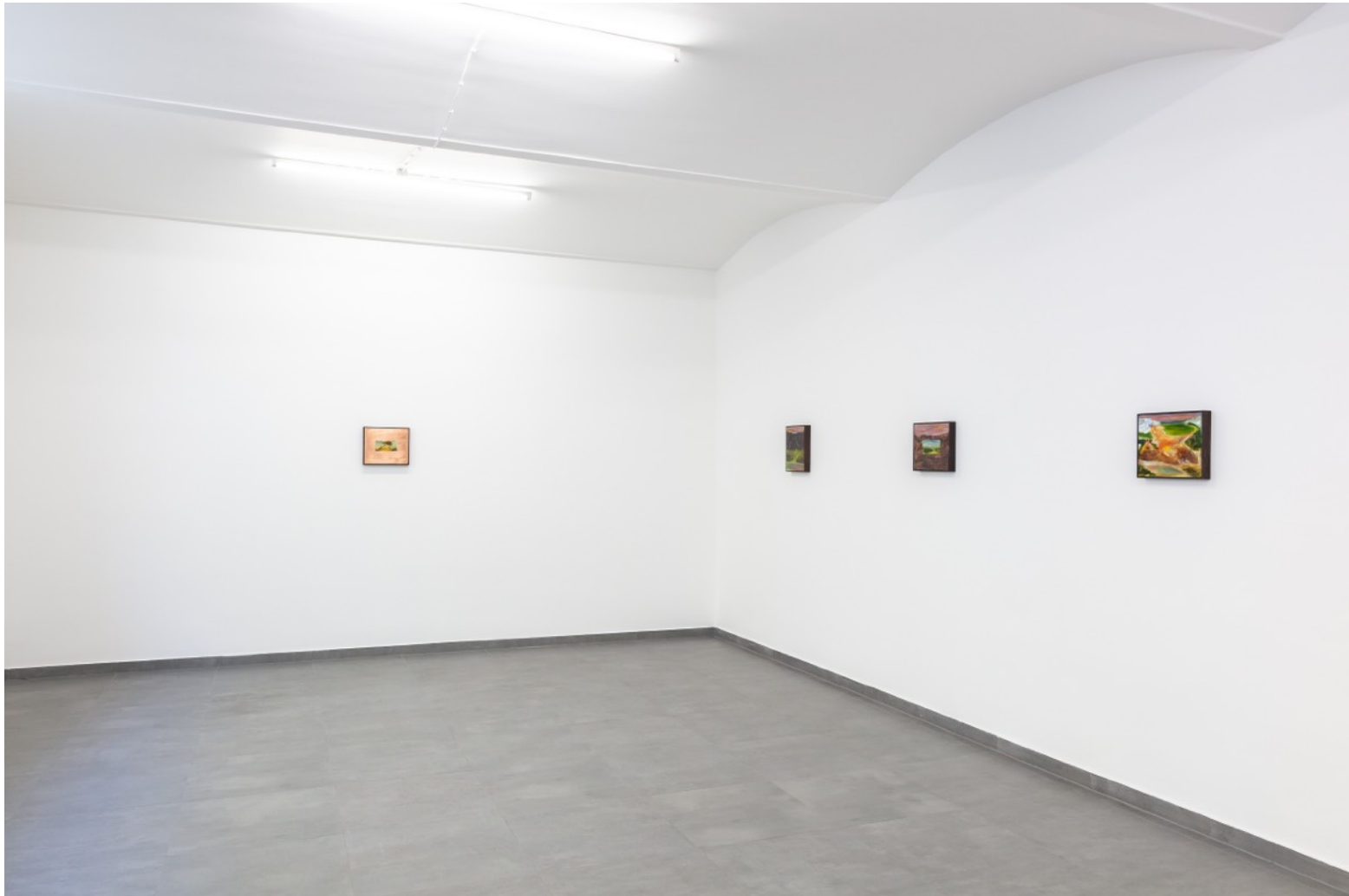
Jamiu Agboke, The Argonauts , installation view