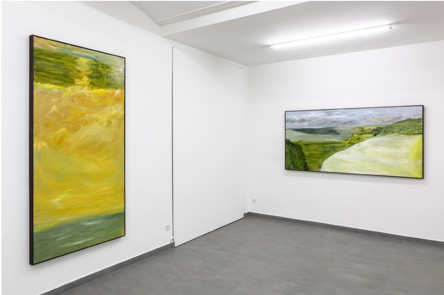
Jamiu Agboke, The Argonauts , installation view