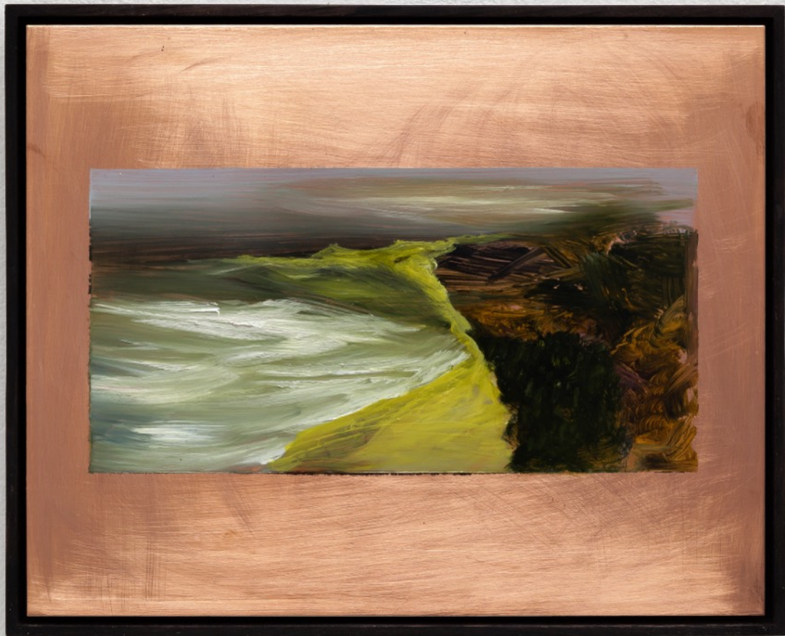
Sea meets land, 2025 30 x 25 cm Oil on copper, stained oak frame

VIN VIN Vienna - Hintzerstraße 4/1 1030 Wien - www.vinvin.eu - mail@vinvin.eu VIN VIN in Naples - Vicoletto II Santa Maria ad Agnone 3 80139 Naples - www.vinvin.eu - mail@vinvin.eu