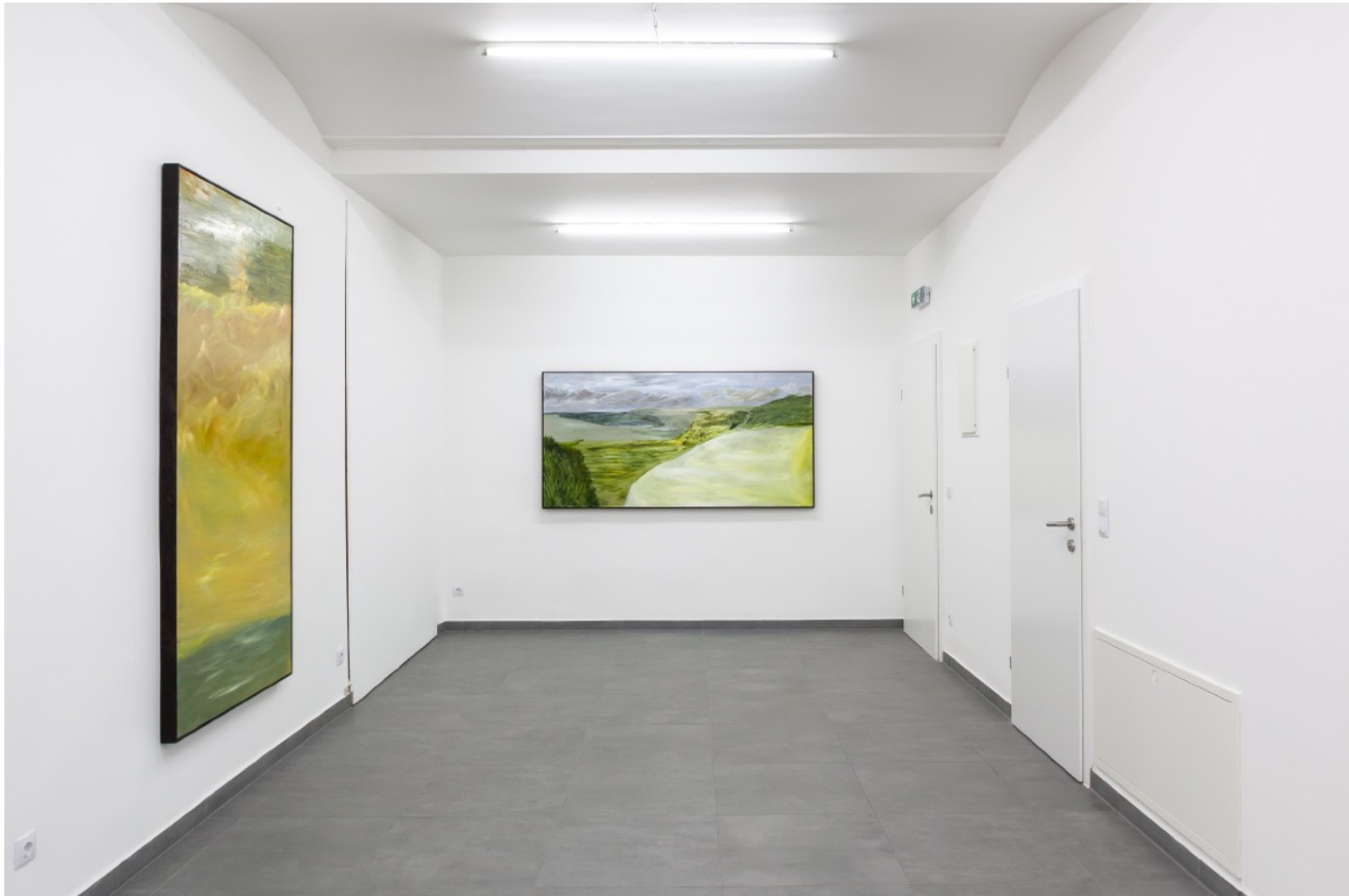
Jamiu Agboke, The Argonauts , installation view