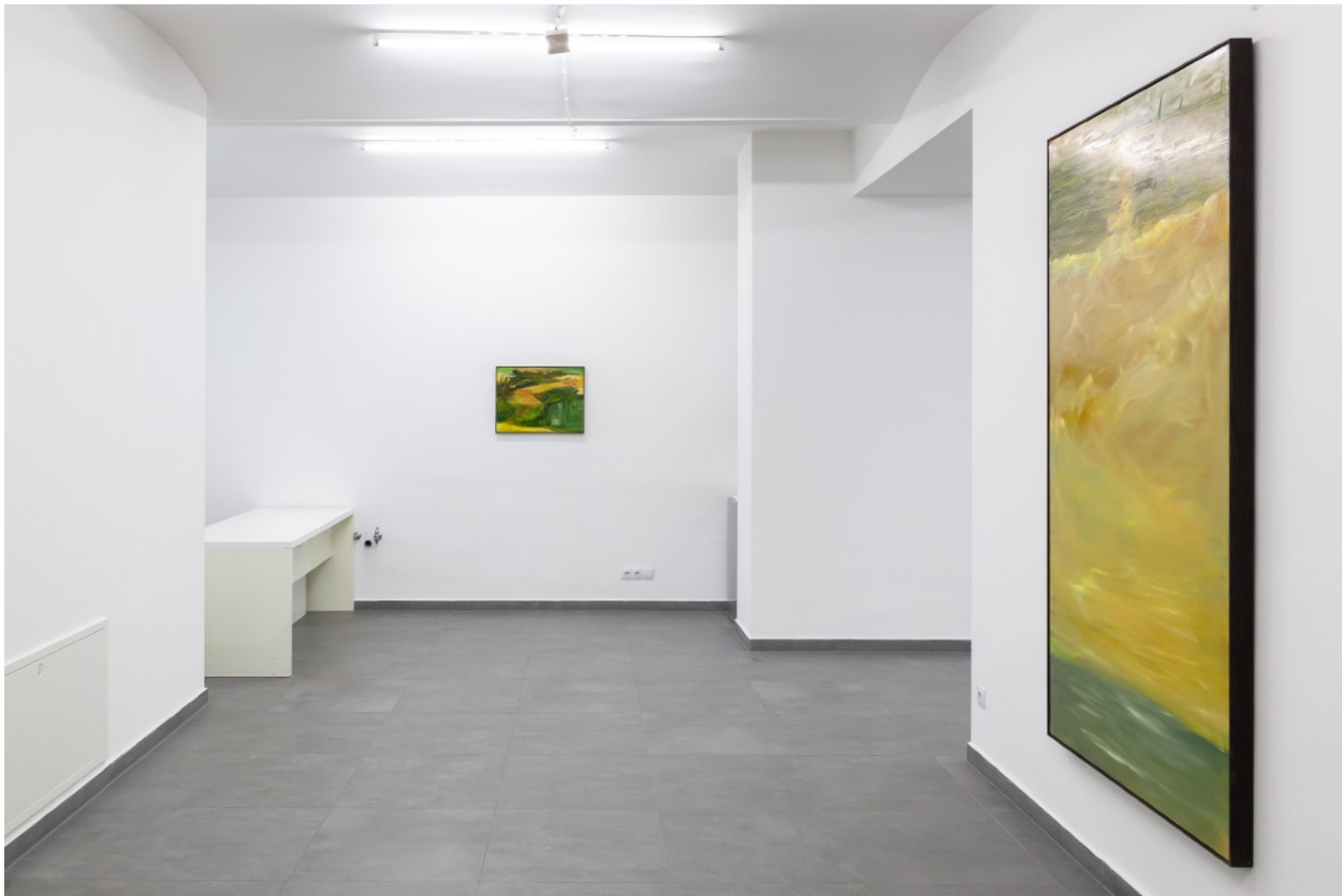
Jamiu Agboke, The Argonauts , installation view