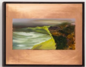
Jamiu Agboke, The Argonauts , installation view