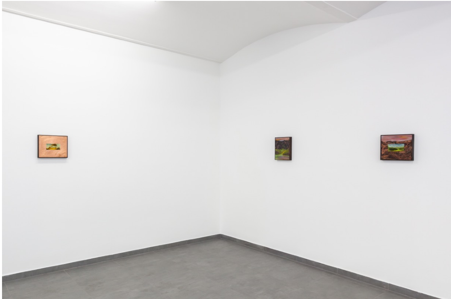
Jamiu Agboke, The Argonauts , installation view