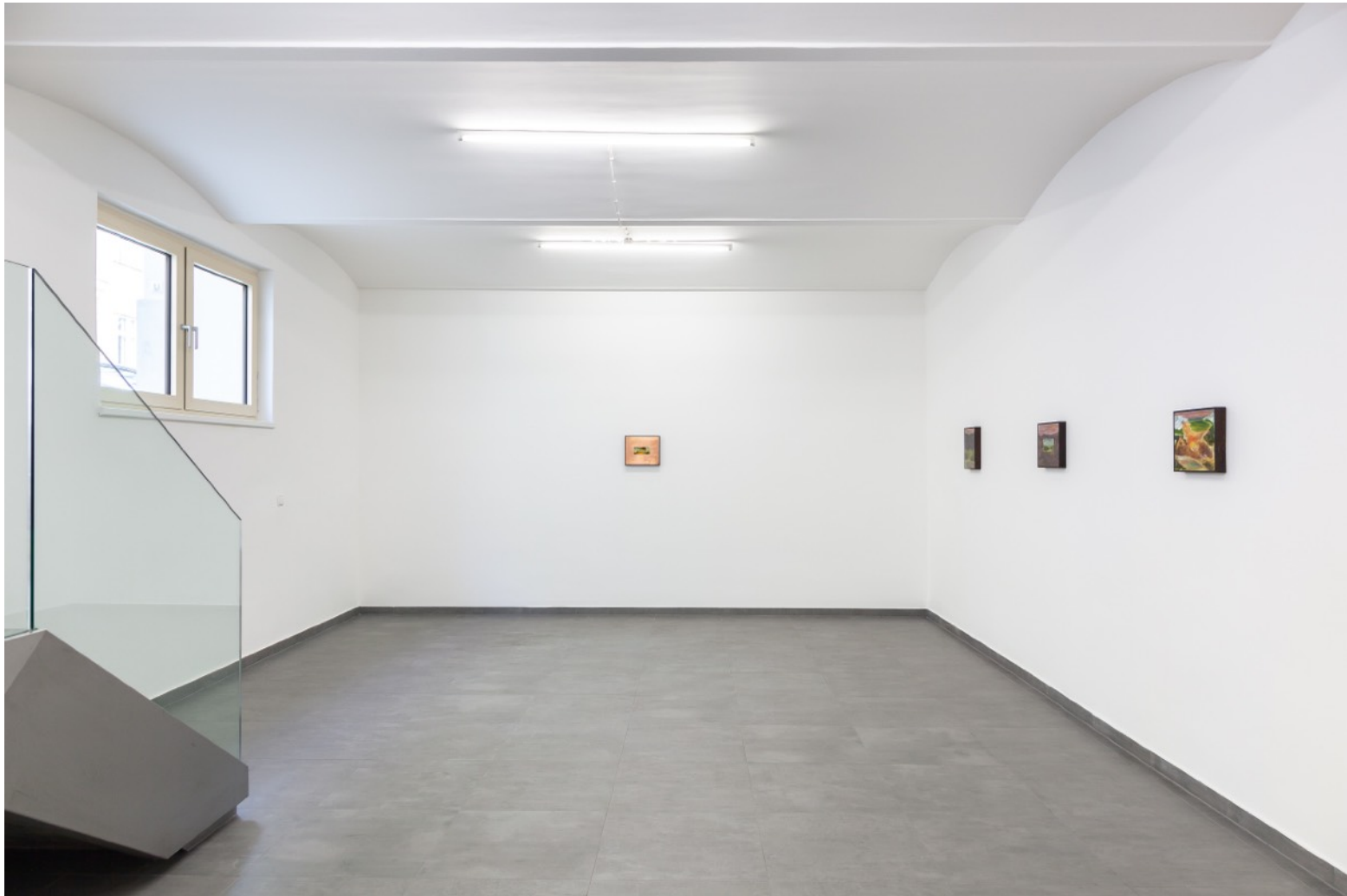
Jamiu Agboke, The Argonauts , installation view