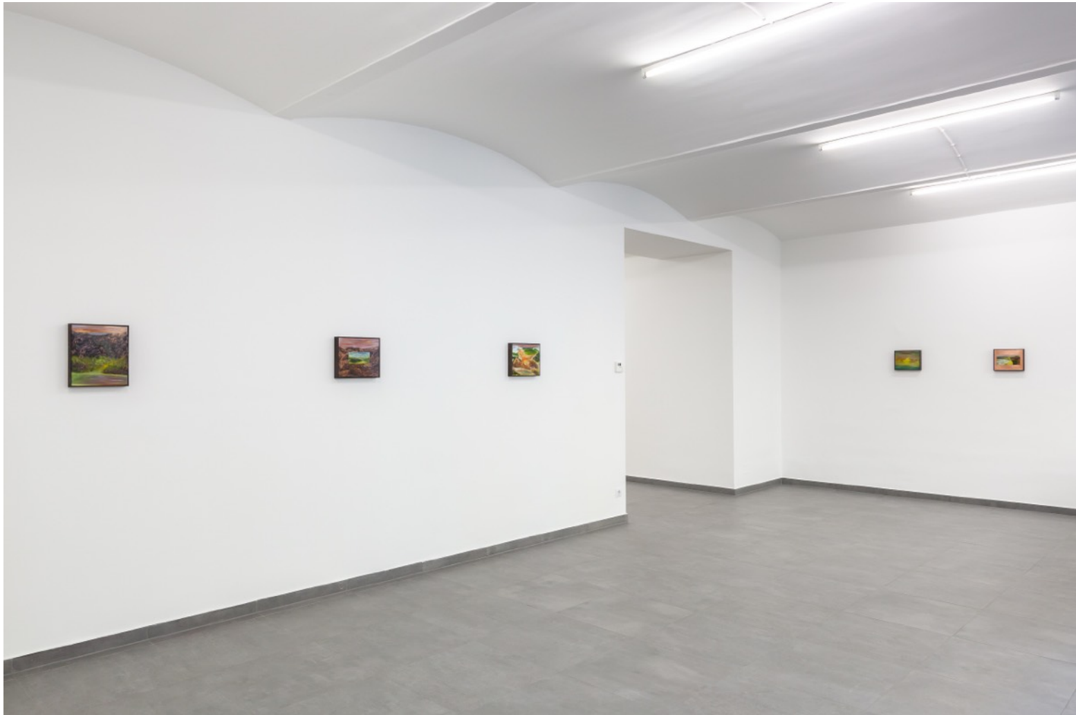
Jamiu Agboke, The Argonauts , installation view