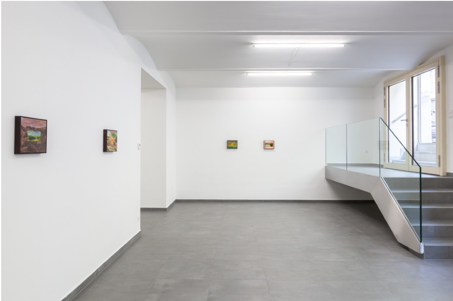
Jamiu Agboke, The Argonauts , installation view