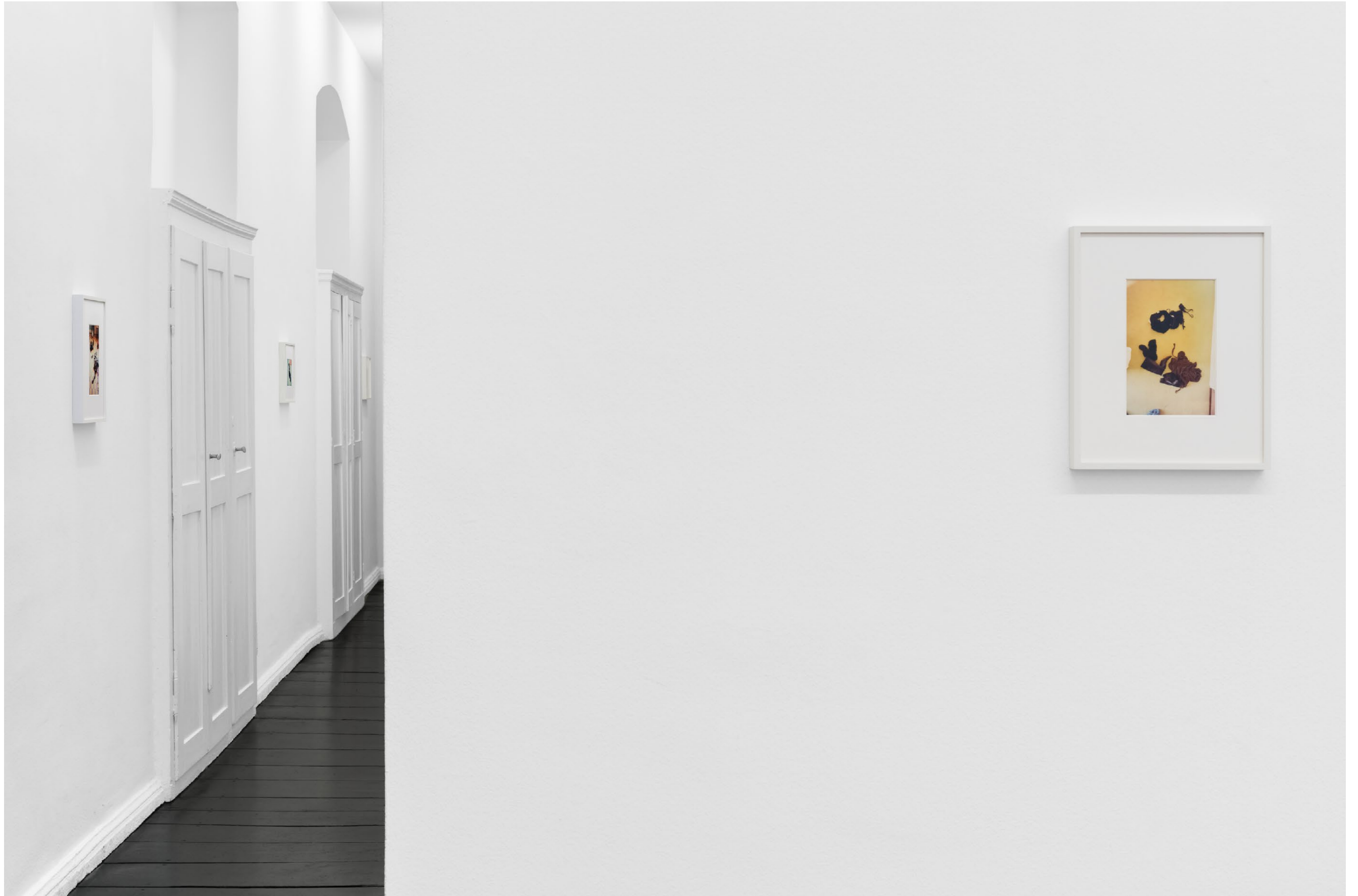
Installation view, Bedroom, Christmas Morning , Galerie Isabella Bortolozzi, Berlin, 2025