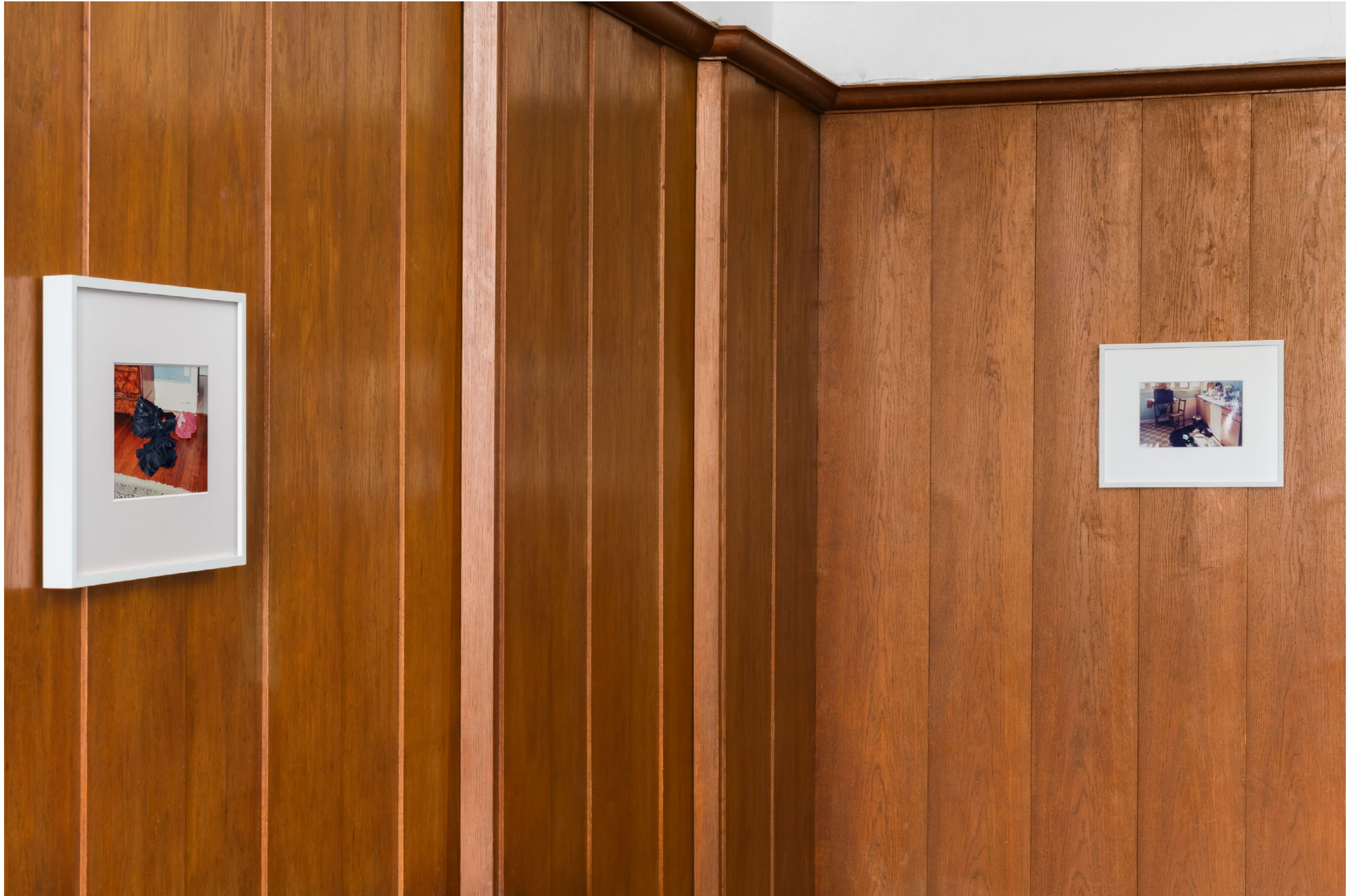
Installation view, Bedroom, Christmas Morning , Galerie Isabella Bortolozzi, Berlin, 2025