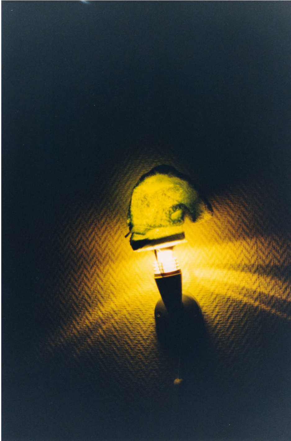
Annie Ernaux & Marc Marie Brussels, Hôtel des Écrins, Room 125, 6 October, 2003 C-print 20 x 13 cm | 7 7/8 x 5 1/8 in Framed: 36 x 29 x 3 cm | 14 1/8 x 11 3/8 x 1 1/8 in Edition of 3 + 2 AP AE/PH 11