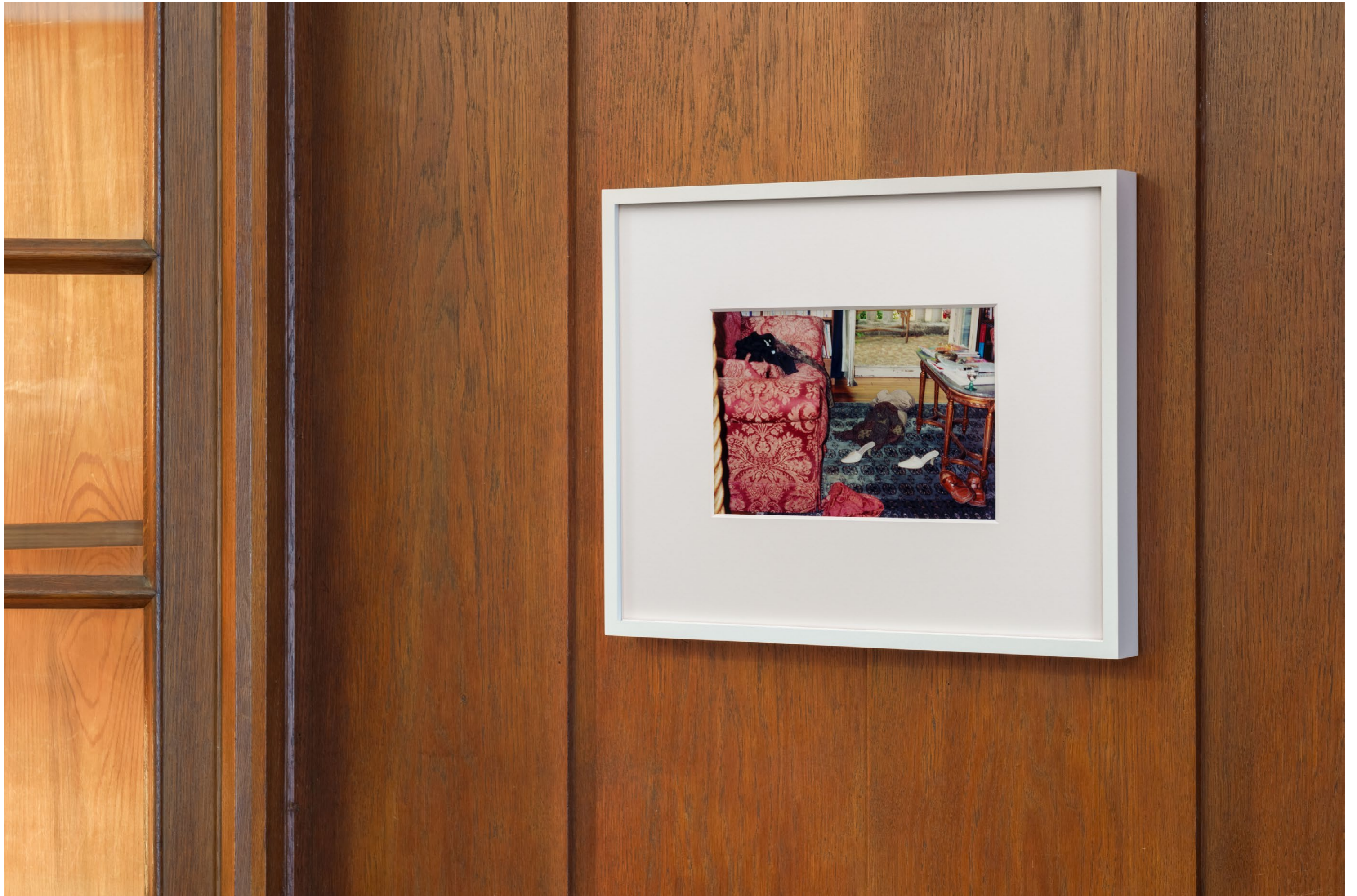
Installation view, Bedroom, Christmas Morning , Galerie Isabella Bortolozzi, Berlin, 2025