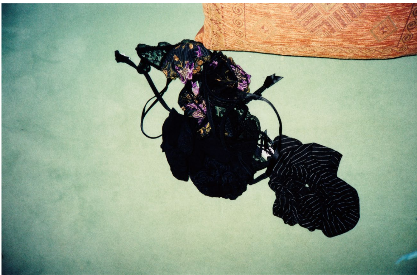
Annie Ernaux & Marc Marie Bedroom, Christmas Morning, Continued , 2003 C-print 20 x 13 cm | 7 7/8 x 5 1/8 in Framed: 36 x 29 x 3 cm | 14 1/8 x 11 3/8 x 1 1/8 in Edition of 3 + 2 AP AE/PH 13