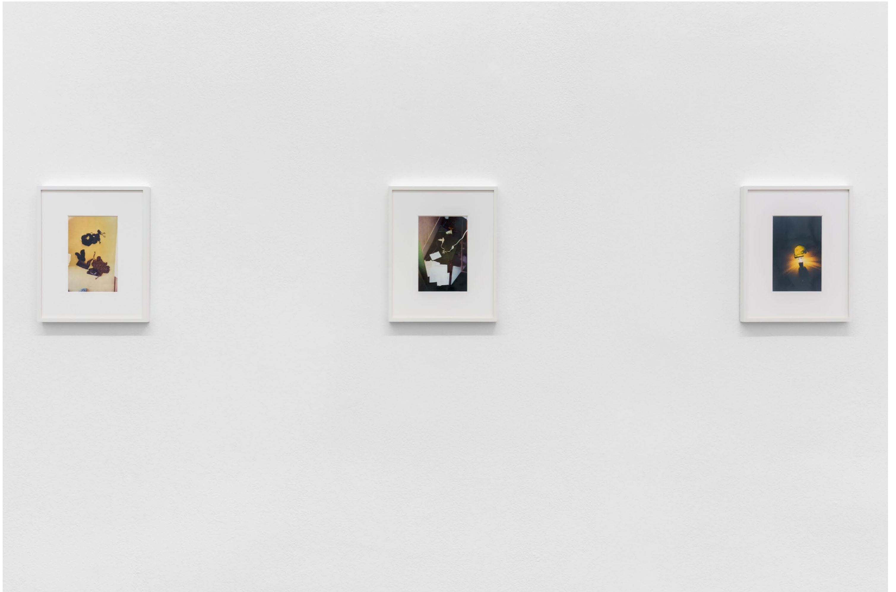
Installation view, Bedroom, Christmas Morning , Galerie Isabella Bortolozzi, Berlin, 2025