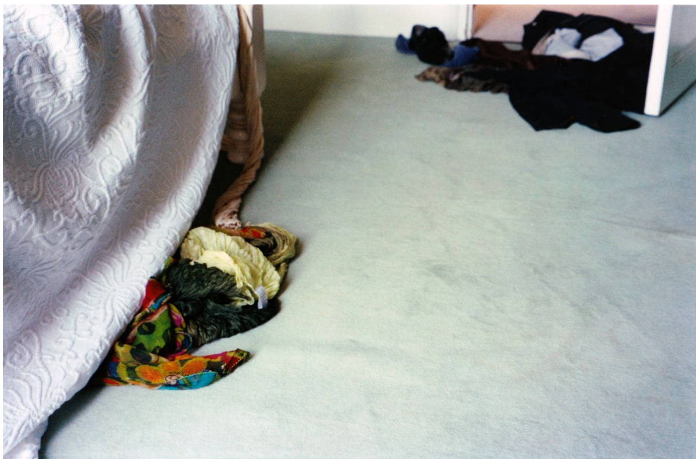
Annie Ernaux & Marc Marie Bedroom, End of May – Beginning of June, 2003 C-print 20 x 13 cm | 7 7/8 x 5 1/8 in Framed: 36 x 29 x 3 cm | 14 1/8 x 11 3/8 x 1 1/8 in Edition of 3 + 2 AP AE/PH 10