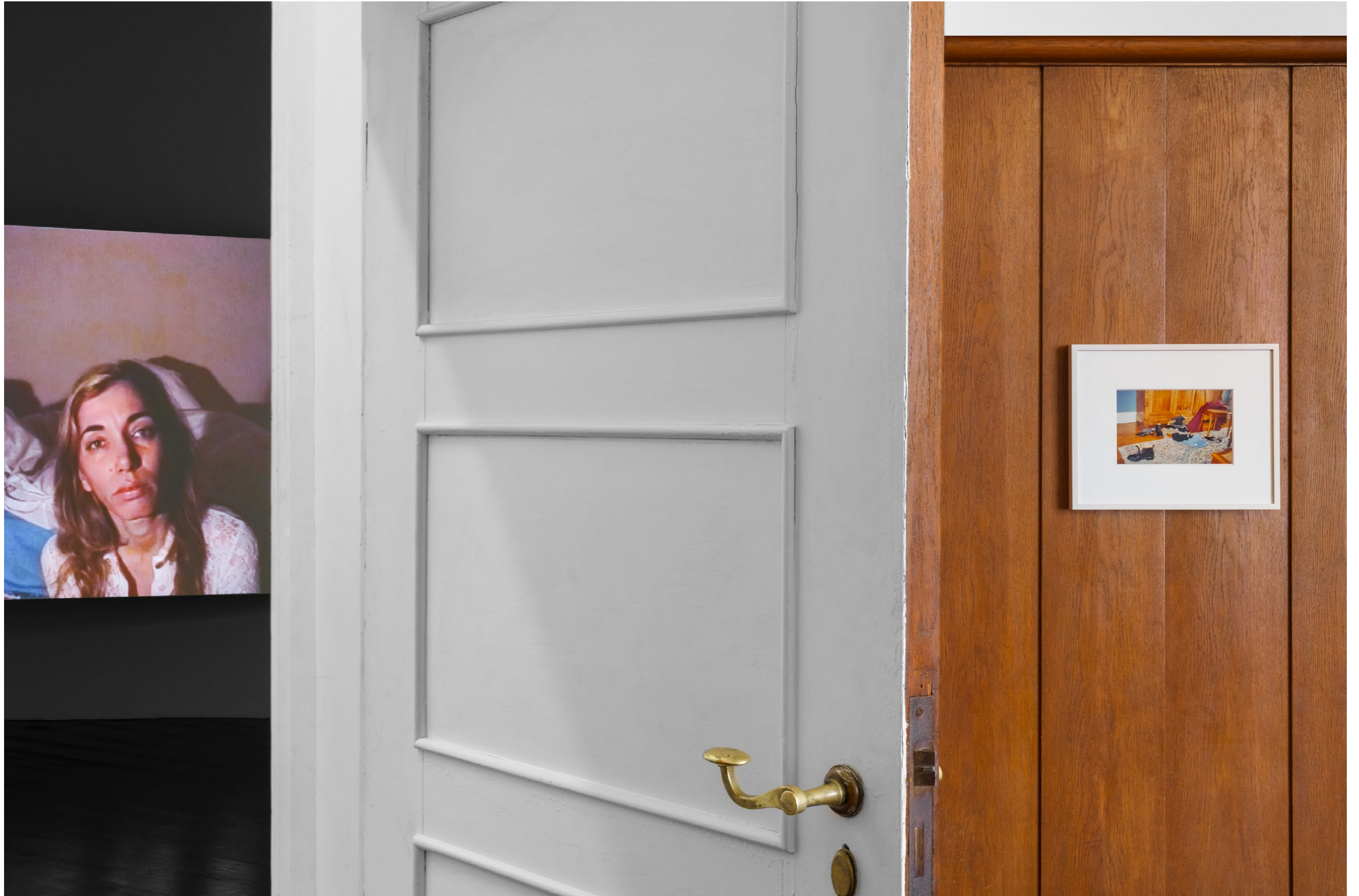
Installation view, Bedroom, Christmas Morning , Galerie Isabella Bortolozzi, Berlin, 2025