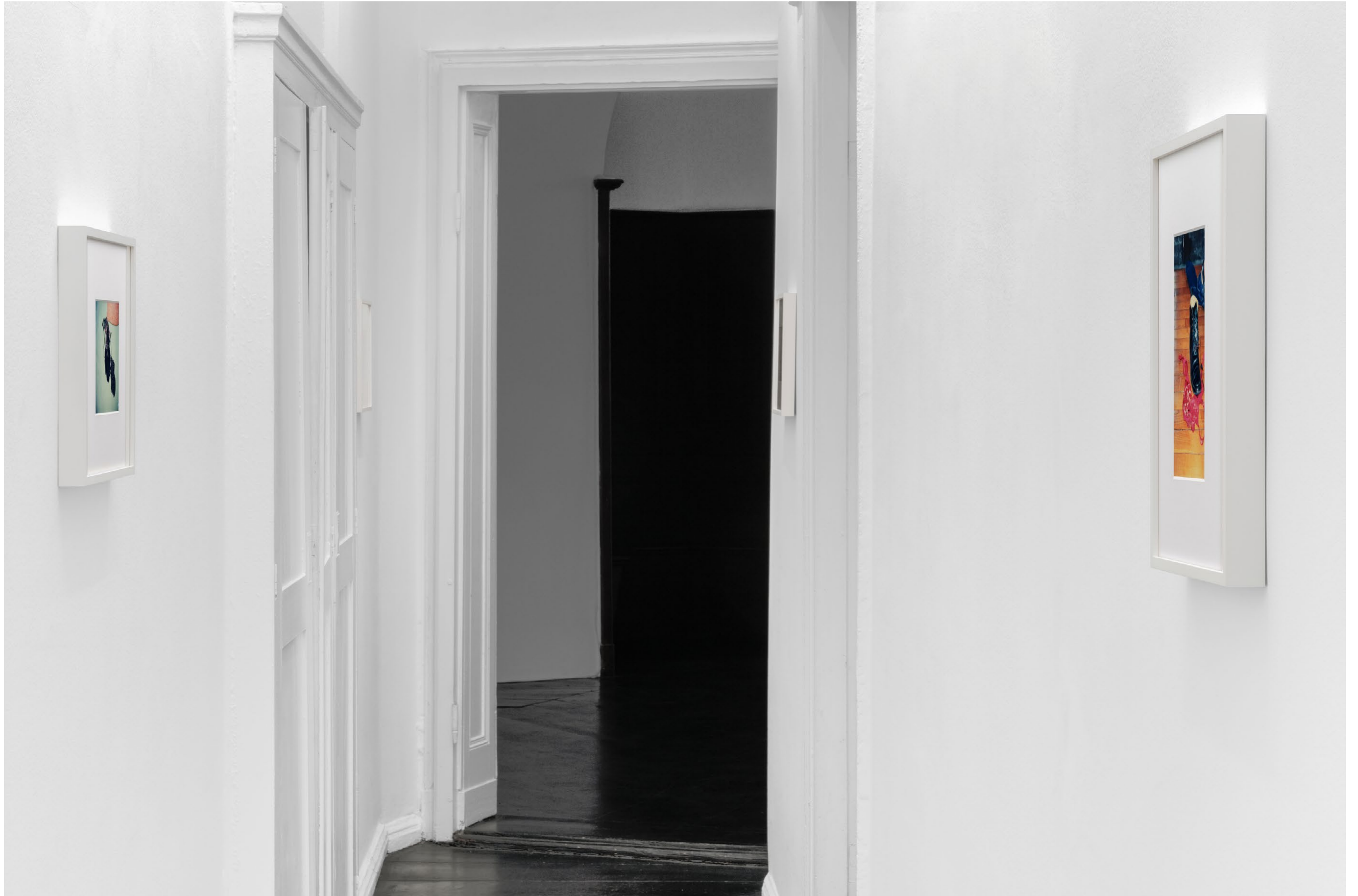
Installation view, Bedroom, Christmas Morning , Galerie Isabella Bortolozzi, Berlin, 2025