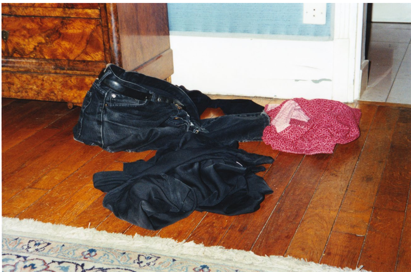
Annie Ernaux & Marc Marie Jeans Sitting on the Parquet, 24 or 31 May, 2003 C-print 13 x 20 cm | 5 1/8 x 7 7/8 in Framed: 29 x 36 x 3 cm | 11 3/8 x 14 1/8 x 1 1/8 in Edition of 3 + 2 AP AE/PH 8