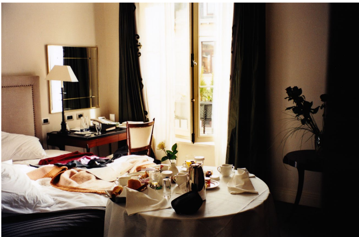
Annie Ernaux & Marc Marie Room 223 of the Hôtel Amigo, Brussels, 10 March, 2003 C-print 20 x 13 cm | 7 7/8 x 5 1/8 in Framed: 36 x 29 x 3 cm | 14 1/8 x 11 3/8 x 1 1/8 in Edition of 3 + 2 AP AE/PH 2