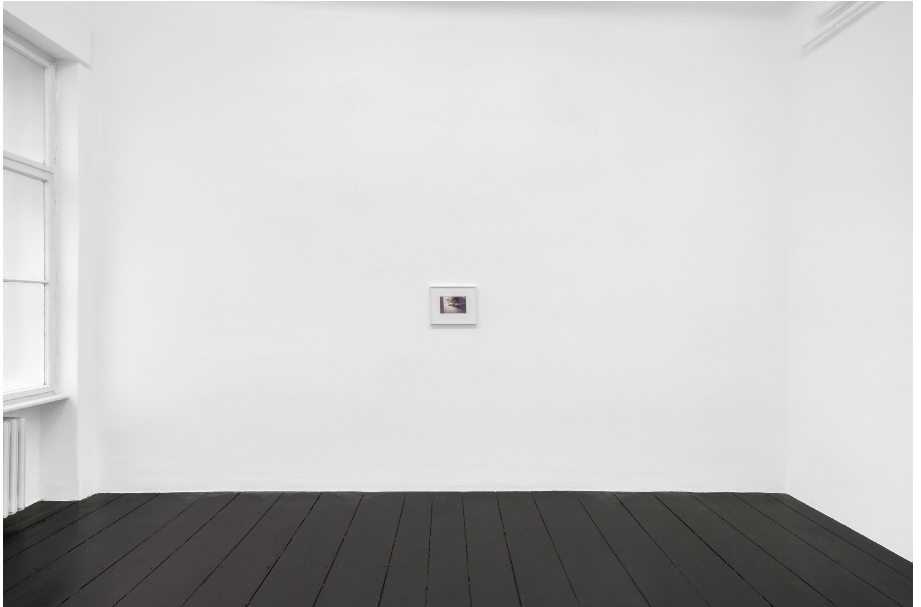
Installation view, Bedroom, Christmas Morning , Galerie Isabella Bortolozzi, Berlin, 2025