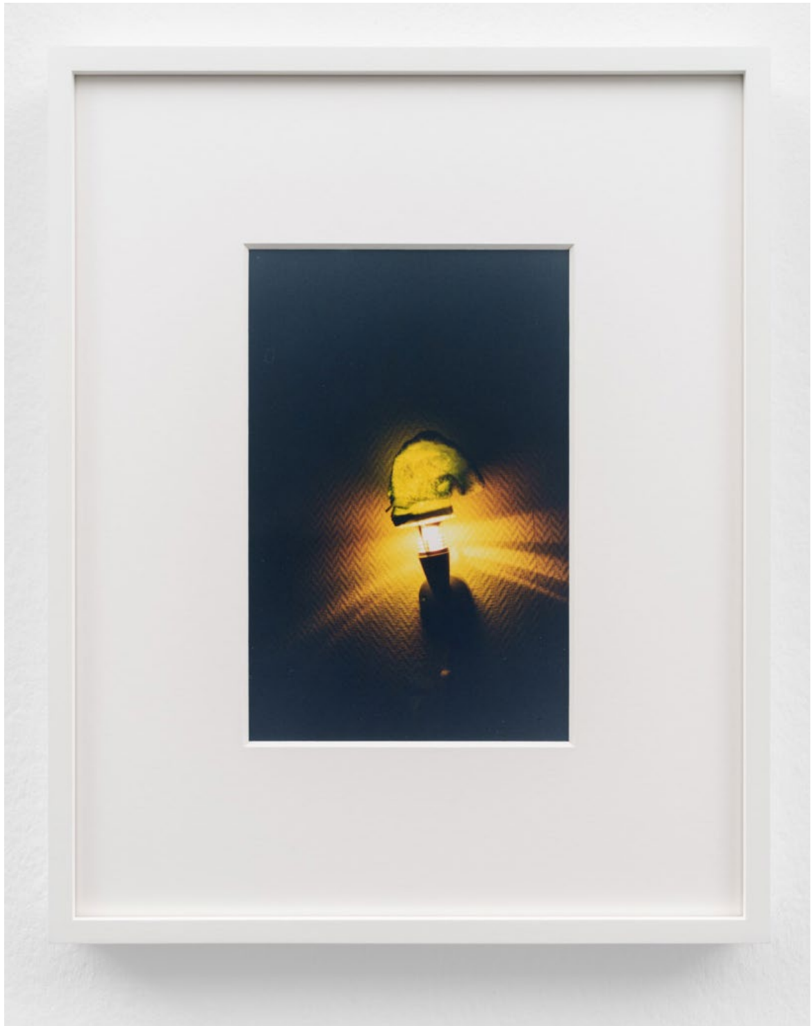
Annie Ernaux & Marc Marie Brussels, Hôtel des Écrins, Room 125, 6 October, 2003 C-print 20 x 13 cm | 7 7/8 x 5 1/8 in Framed: 36 x 29 x 3 cm | 14 1/8 x 11 3/8 x 1 1/8 in Edition of 3 + 2 AP AE/PH 11