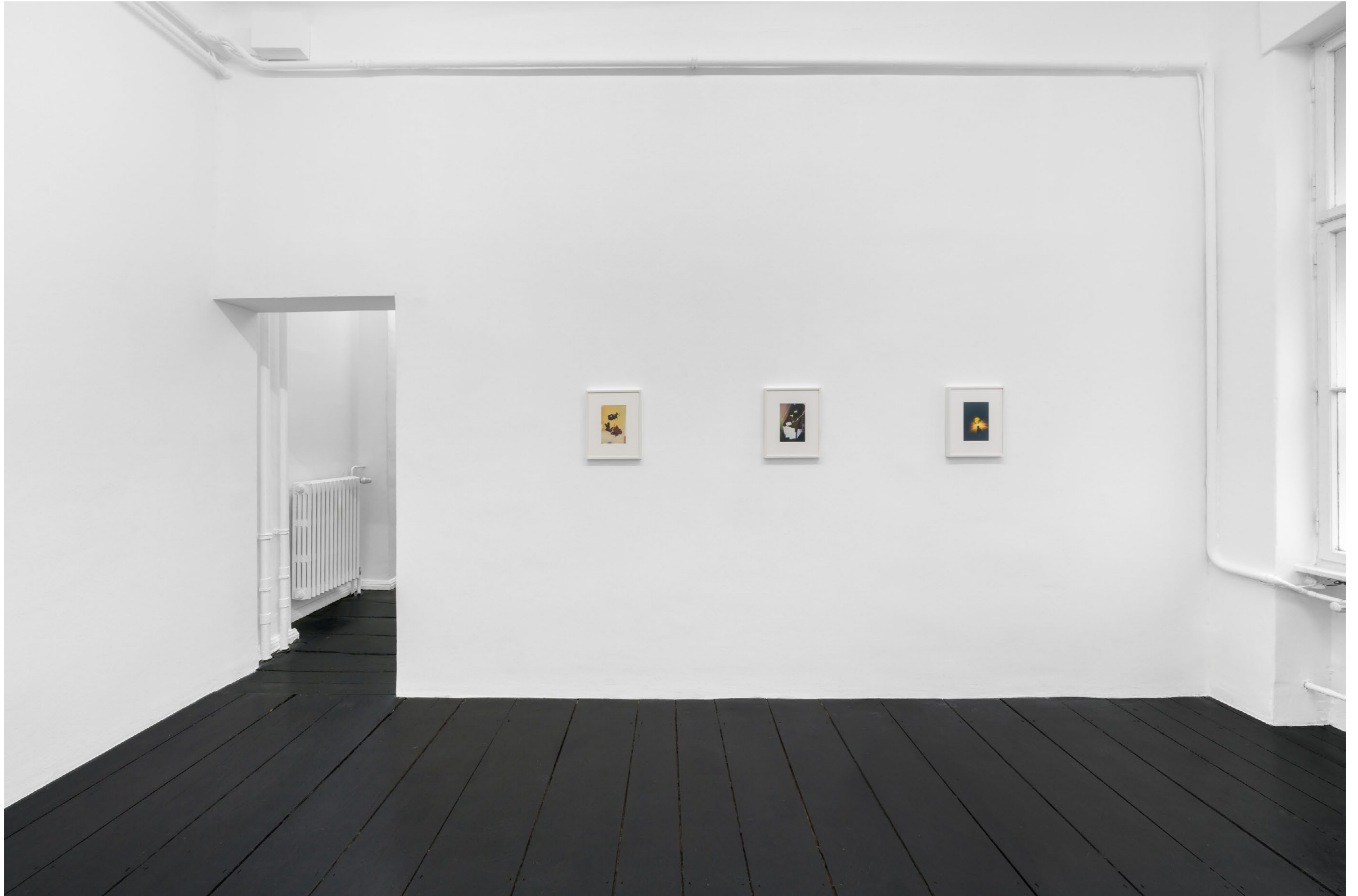
Installation view, Bedroom, Christmas Morning , Galerie Isabella Bortolozzi, Berlin, 2025