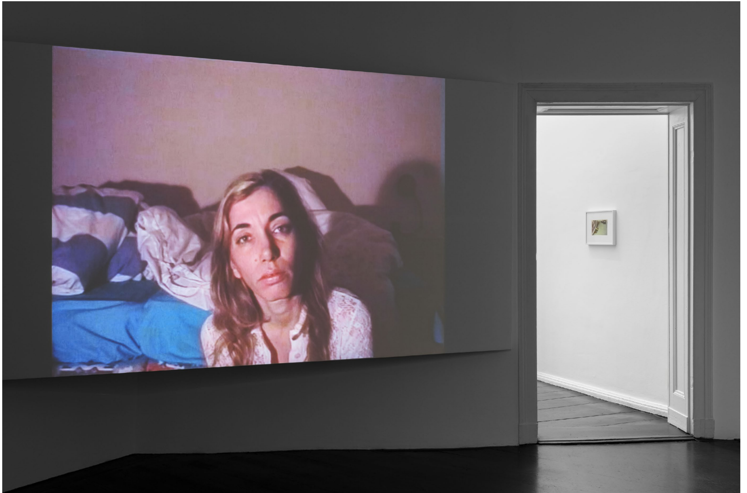
Installation view, Bedroom, Christmas Morning , Galerie Isabella Bortolozzi, Berlin, 2025