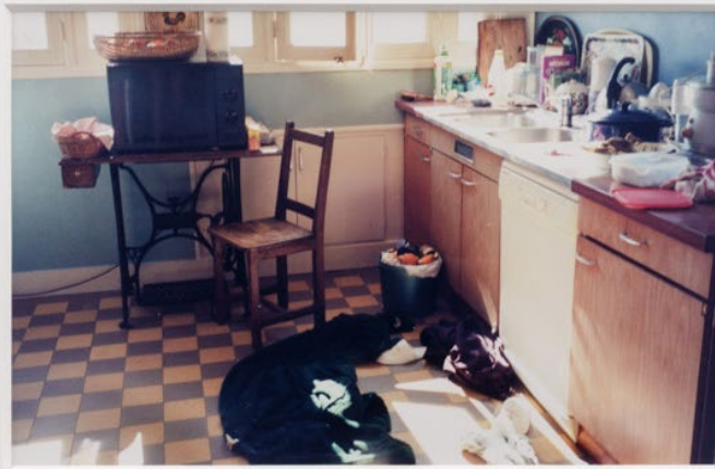
Annie Ernaux & Marc Marie The Kitchen in the Morning, Sunday 16 March, 2003 C-print 13 x 20 cm | 5 1/8 x 7 7/8 in Framed: 29 x 36 x 3 cm | 11 3/8 x 14 1/8 x 1 1/8 in Edition of 3 + 2 AP AE/PH 4