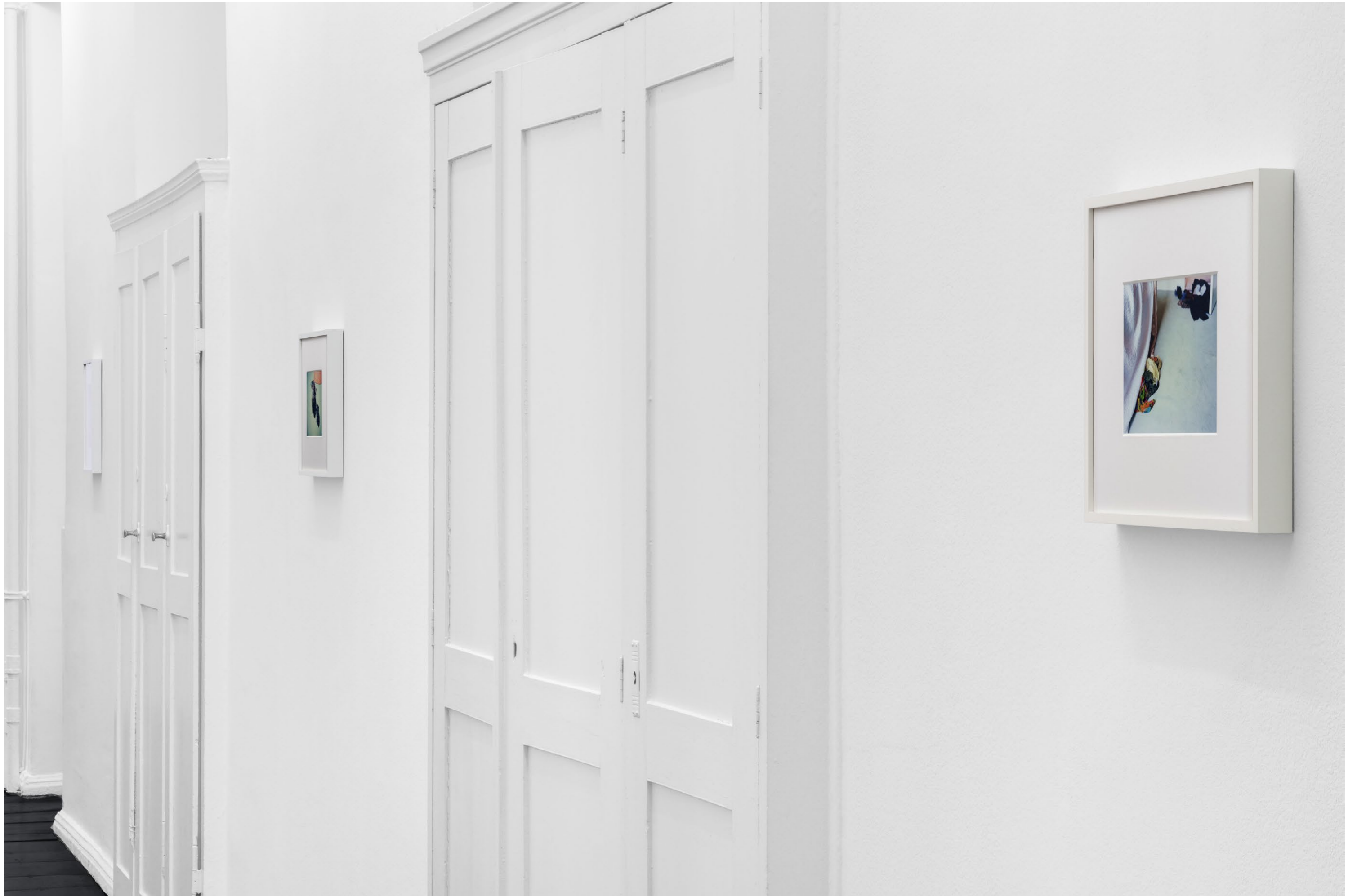
Installation view, Bedroom, Christmas Morning , Galerie Isabella Bortolozzi, Berlin, 2025