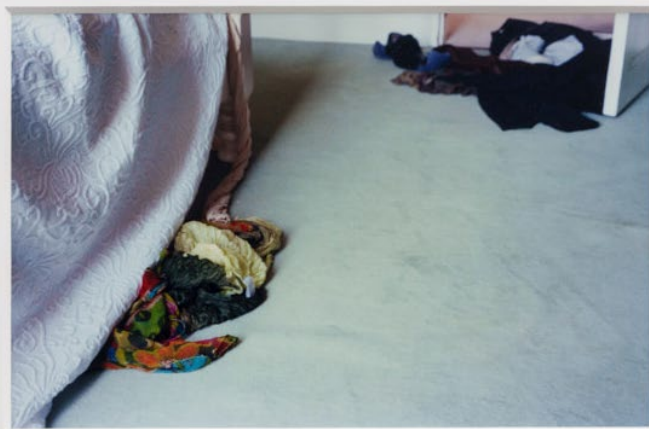
Annie Ernaux & Marc Marie Bedroom, End of May – Beginning of June, 2003 C-print 20 x 13 cm | 7 7/8 x 5 1/8 in Framed: 36 x 29 x 3 cm | 14 1/8 x 11 3/8 x 1 1/8 in Edition of 3 + 2 AP AE/PH 10