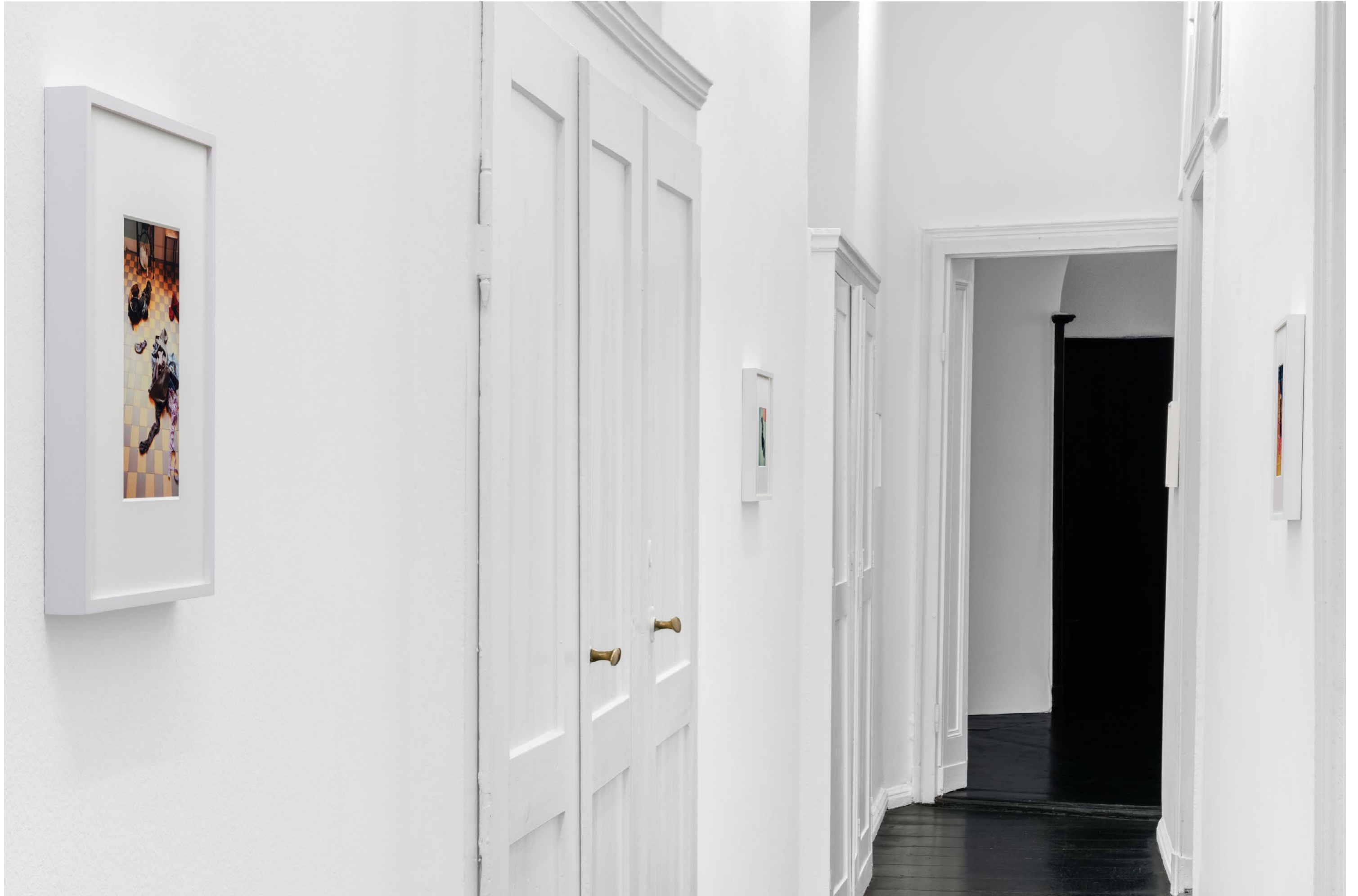
Installation view, Bedroom, Christmas Morning , Galerie Isabella Bortolozzi, Berlin, 2025