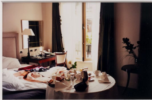
Annie Ernaux & Marc Marie Room 223 of the Hôtel Amigo, Brussels, 10 March, 2003 C-print 20 x 13 cm | 7 7/8 x 5 1/8 in Framed: 36 x 29 x 3 cm | 14 1/8 x 11 3/8 x 1 1/8 in Edition of 3 + 2 AP AE/PH 2