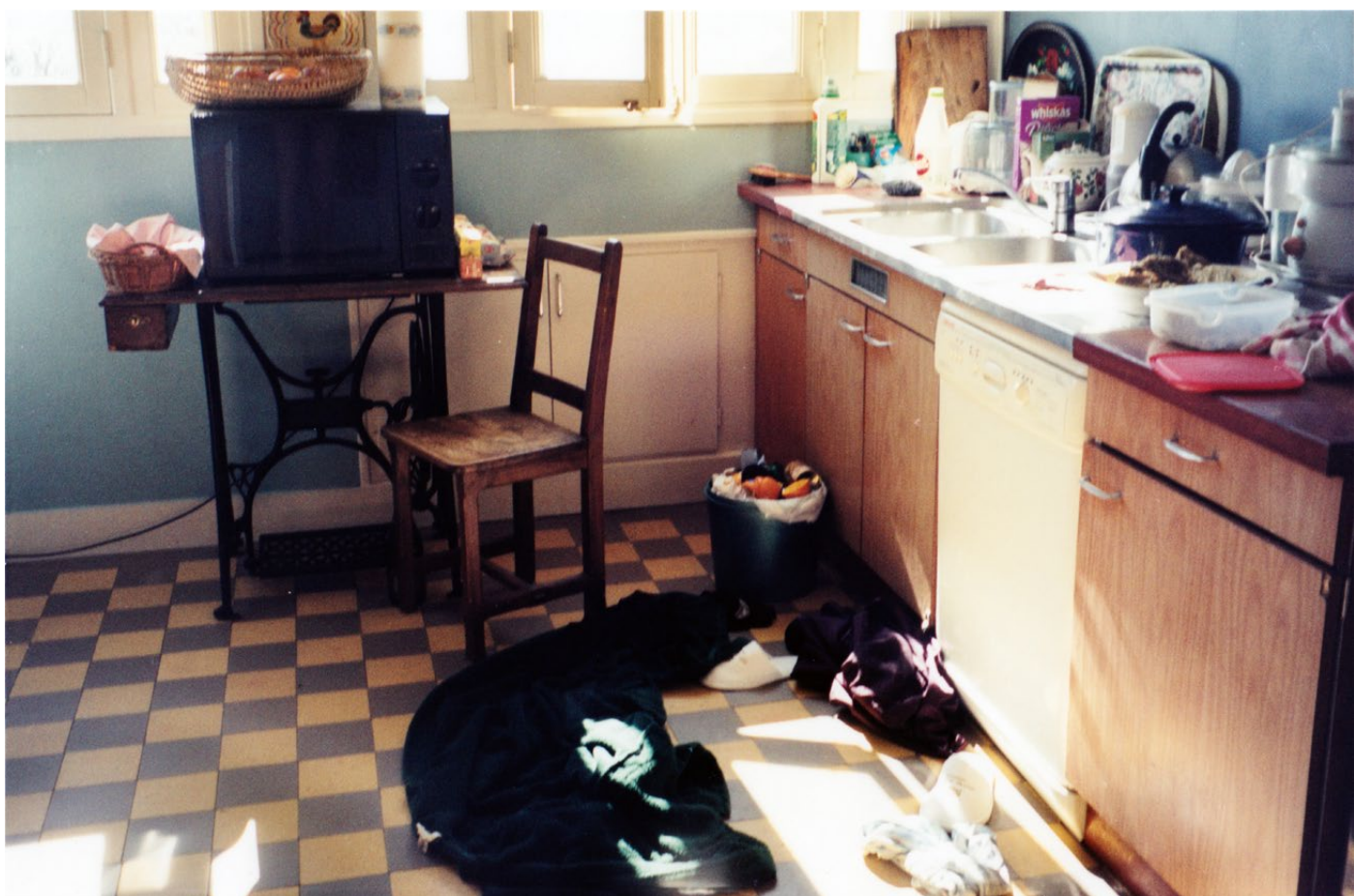
Annie Ernaux & Marc Marie The Kitchen in the Morning, Sunday 16 March, 2003 C-print 13 x 20 cm | 5 1/8 x 7 7/8 in Framed: 29 x 36 x 3 cm | 11 3/8 x 14 1/8 x 1 1/8 in Edition of 3 + 2 AP AE/PH 4