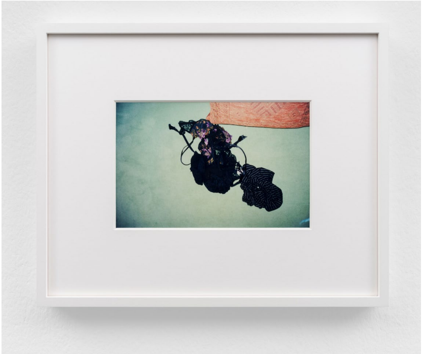
Annie Ernaux & Marc Marie Bedroom, Christmas Morning, Continued, 2003 C-print 20 x 13 cm | 7 7/8 x 5 1/8 in Framed: 36 x 29 x 3 cm | 14 1/8 x 11 3/8 x 1 1/8 in Edition of 3 + 2 AP AE/PH 13