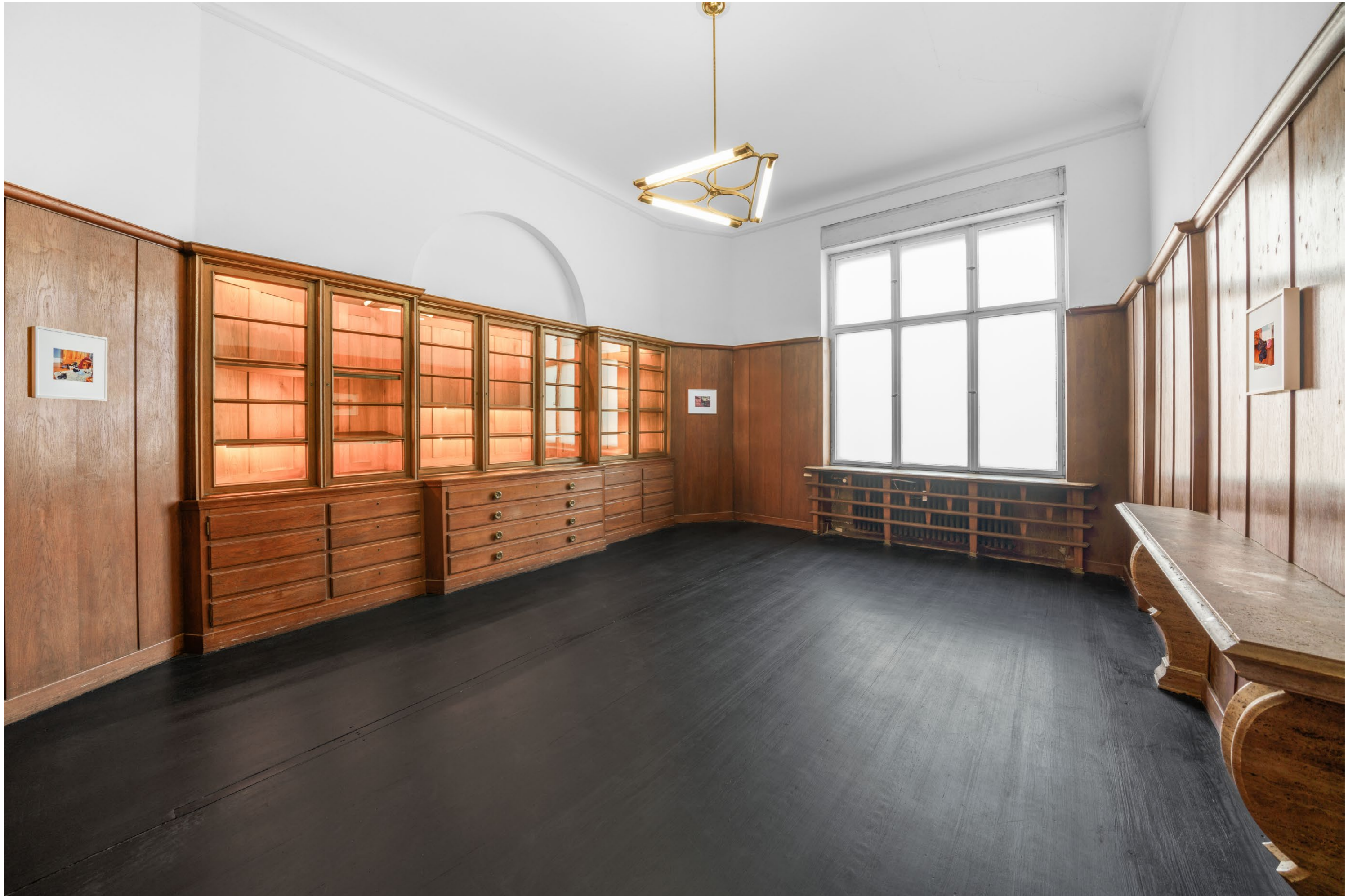
Installation view, Bedroom, Christmas Morning , Galerie Isabella Bortolozzi, Berlin, 2025