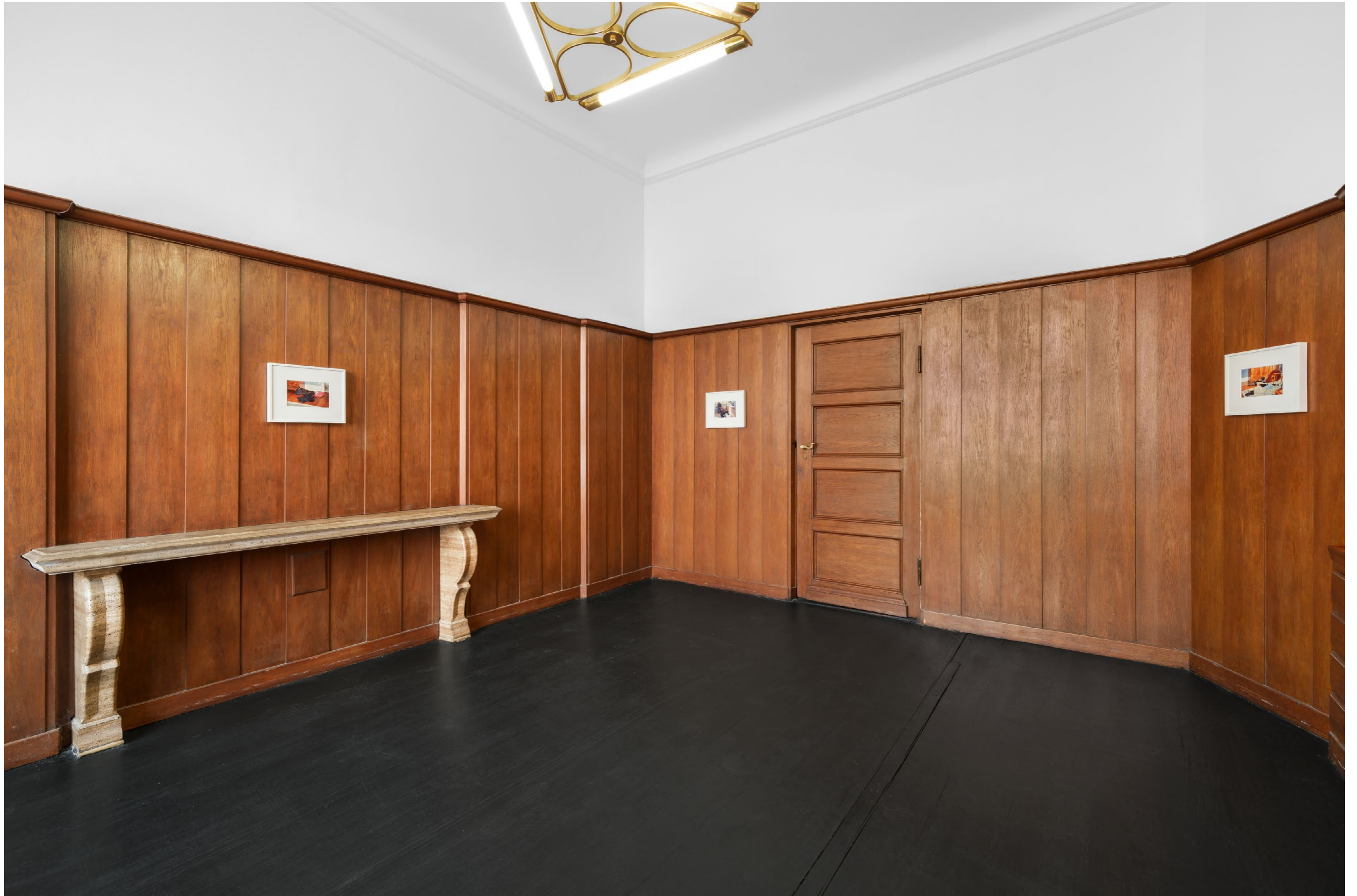
Installation view, Bedroom, Christmas Morning , Galerie Isabella Bortolozzi, Berlin, 2025