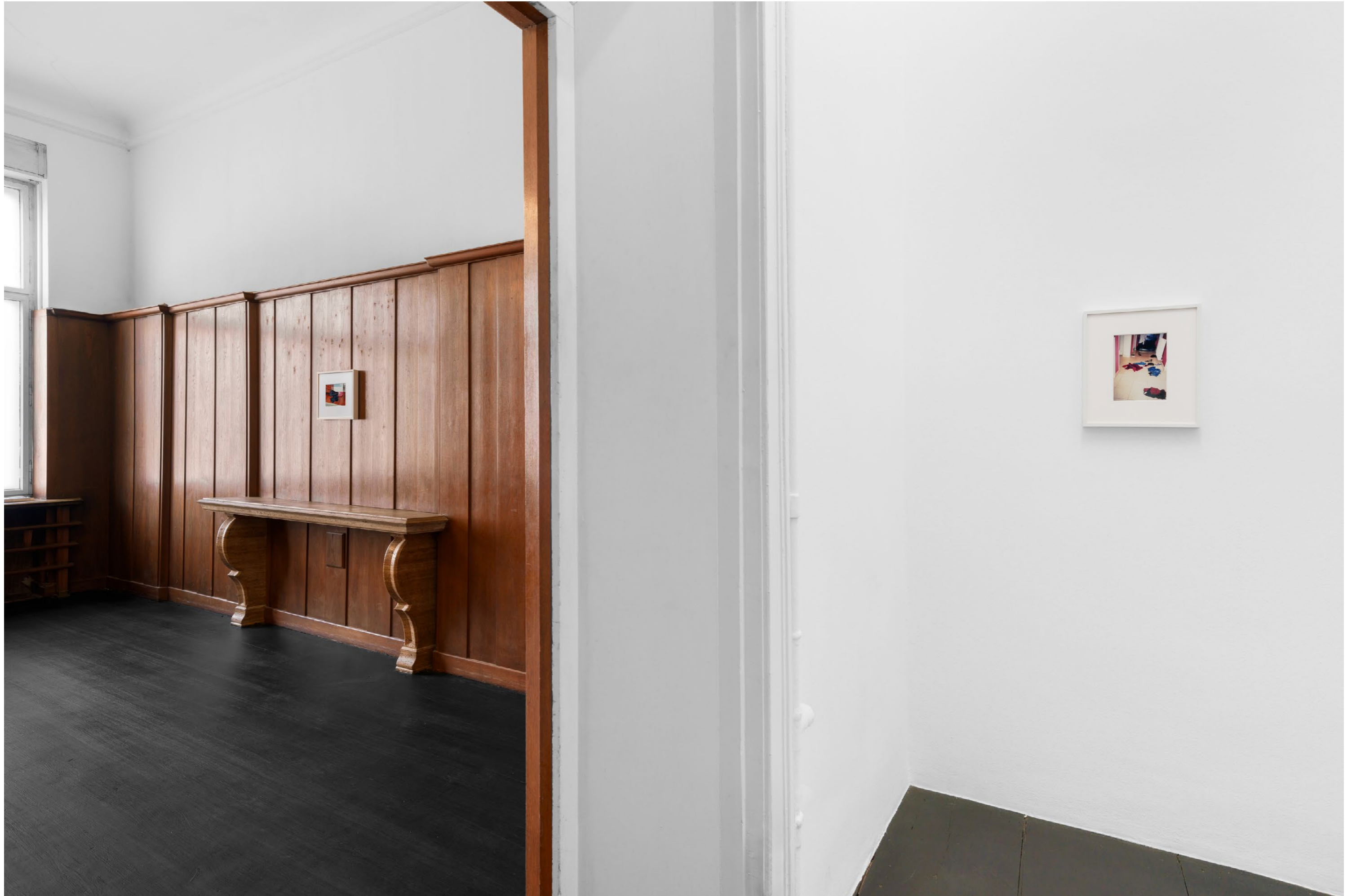
Installation view, Bedroom, Christmas Morning , Galerie Isabella Bortolozzi, Berlin, 2025