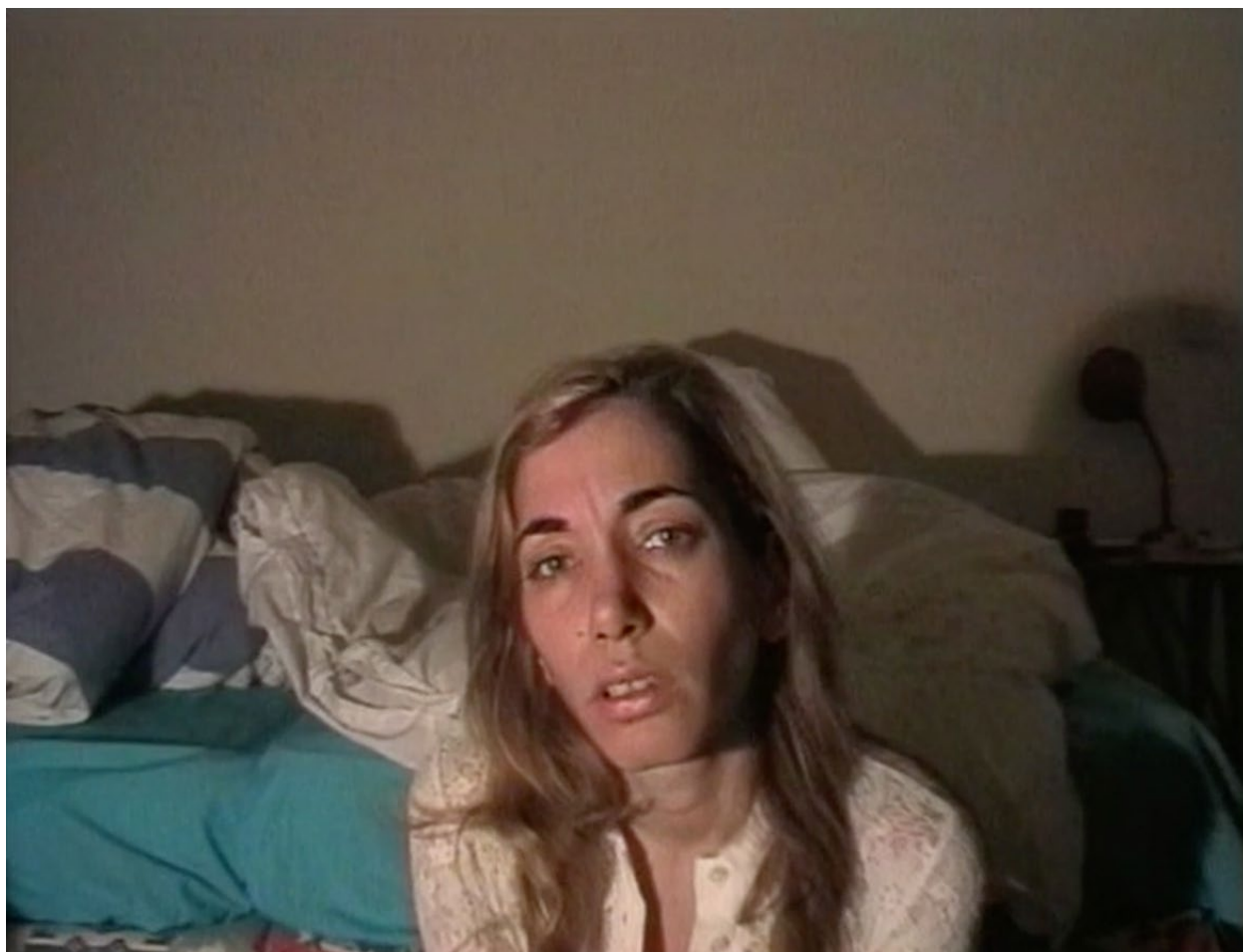
Ellen Cantor If I Just Turn and Run , 1998 Video; colour, sound 22:39 min Edition of 5 + 2 AP EC/V 3