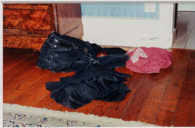
Annie Ernaux & Marc Marie Jeans Sitting on the Parquet, 24 or 31 May, 2003 C-print 13 x 20 cm | 5 1/8 x 7 7/8 in Framed: 29 x 36 x 3 cm | 11 3/8 x 14 1/8 x 1 1/8 in Edition of 3 + 2 AP AE/PH 8