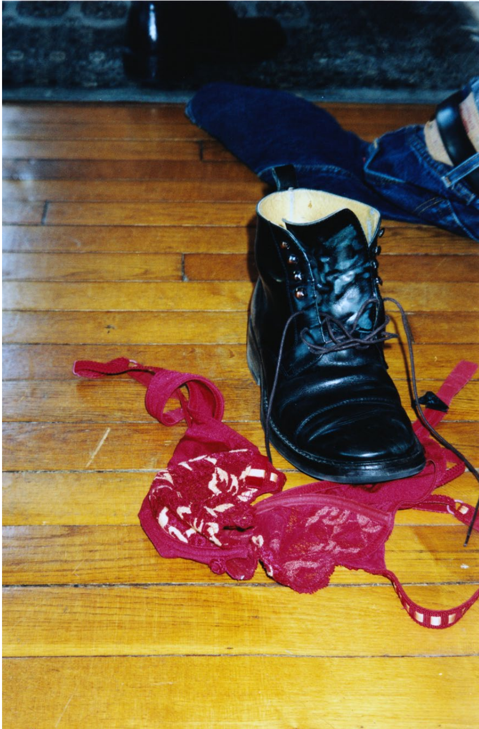
Annie Ernaux & Marc Marie The Shoe in the Living Room, 15 March, 2003 C-print 20 x 13 cm | 7 7/8 x 5 1/8 in Framed: 36 x 29 x 3 cm | 14 1/8 x 11 3/8 x 1 1/8 in Edition of 3 + 2 AP AE/PH 3