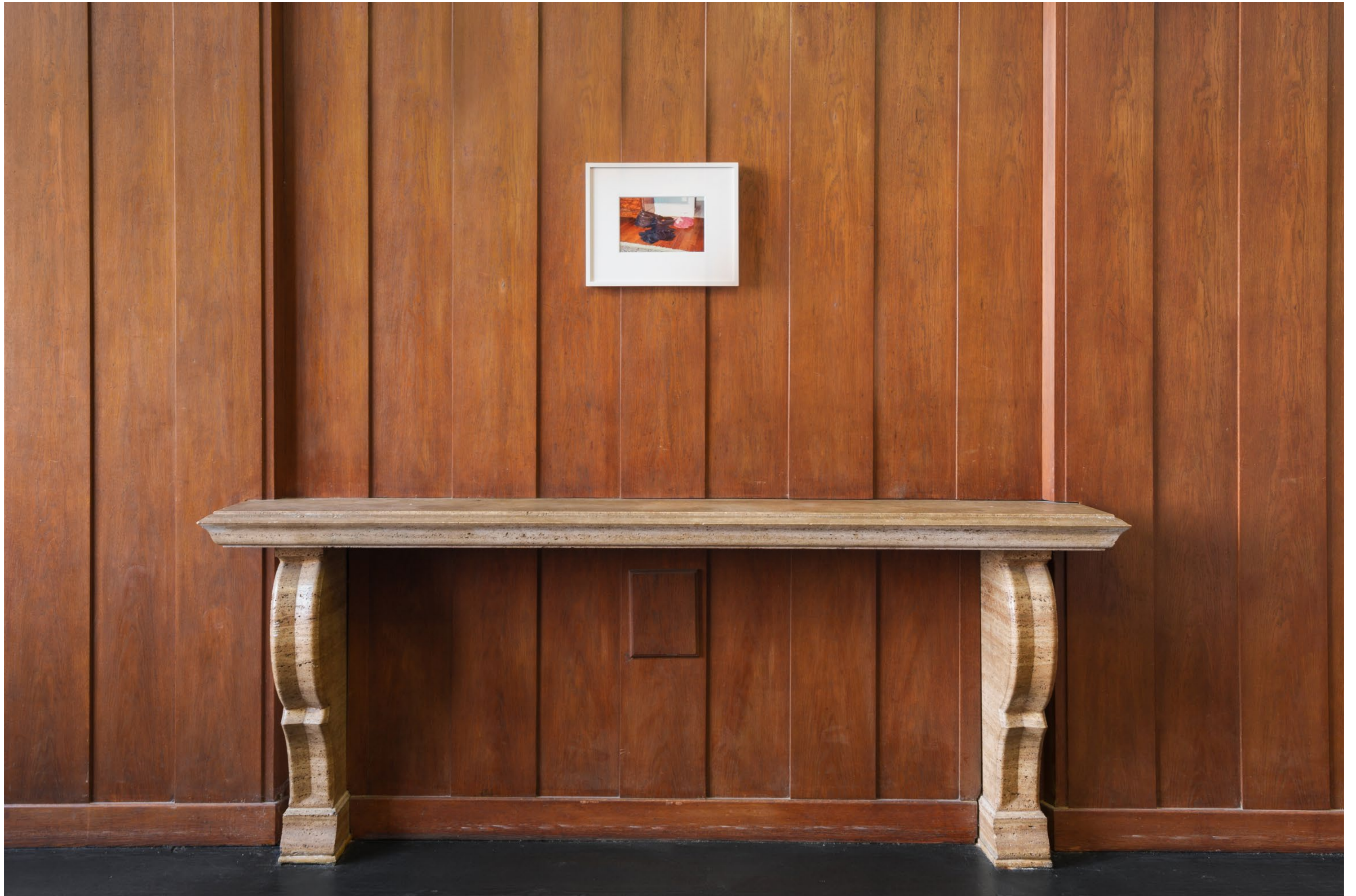
Installation view, Bedroom, Christmas Morning , Galerie Isabella Bortolozzi, Berlin, 2025