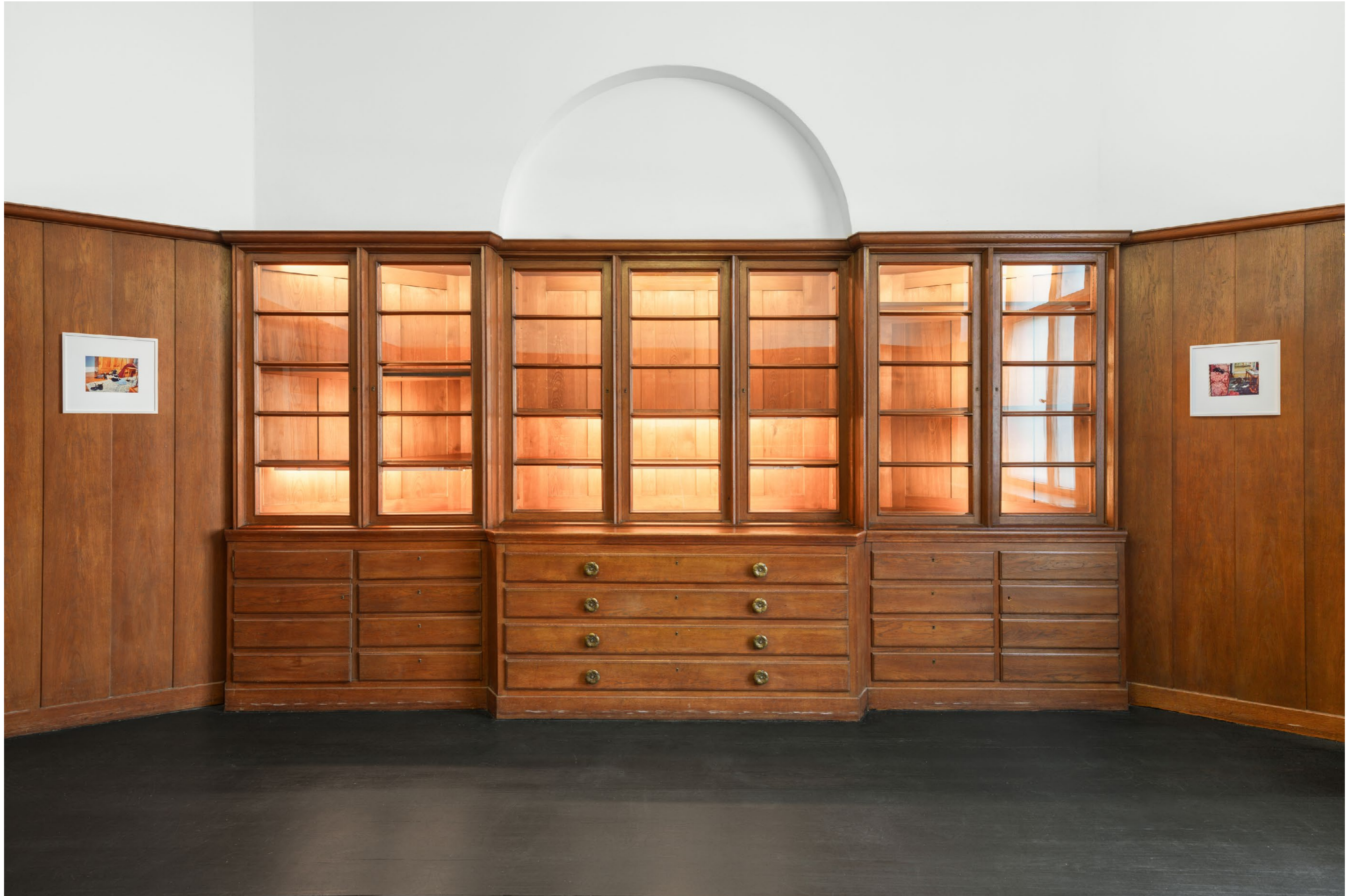
Installation view, Bedroom, Christmas Morning , Galerie Isabella Bortolozzi, Berlin, 2025