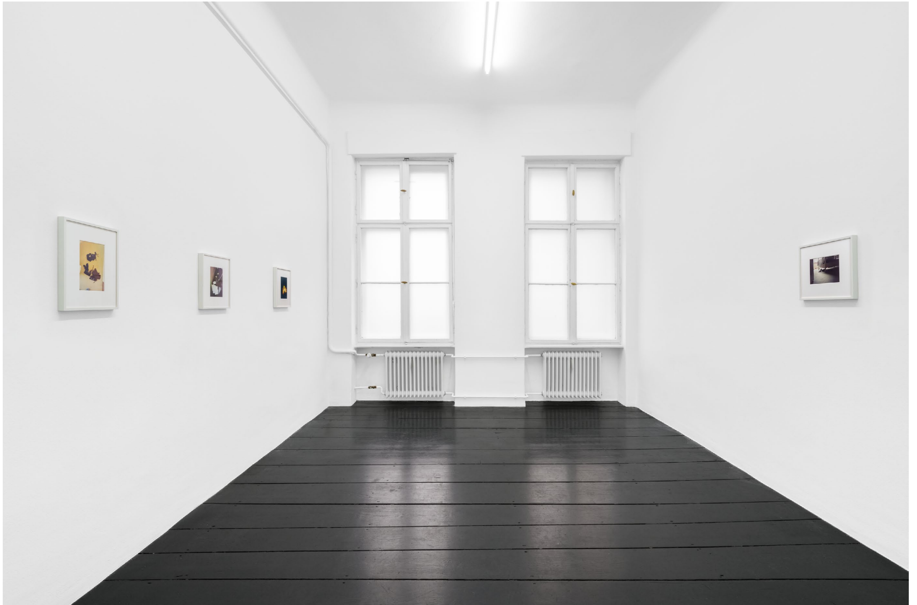
Installation view, Bedroom, Christmas Morning , Galerie Isabella Bortolozzi, Berlin, 2025