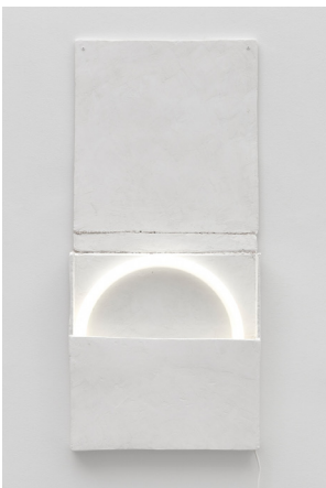
Lichttasche (Light Bag), 1988 plaster, neon, electromaterial, 96 x 43,7 x 4,6 cm