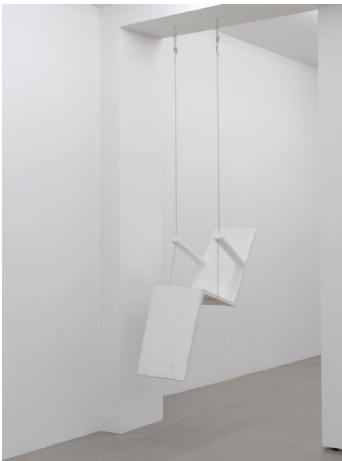
Die Schaukel (The Swing), 1974 plaster on iron construction, 139 x 50 x 153 cm