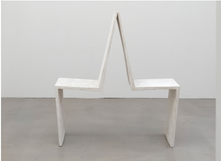
An einander gelehnt (Leaning against each other), 1992 plaster, 105 x 35 x 85 cm

info@kadel-willborn.de www.kadel-willborn.de