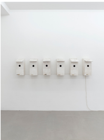
Vogelkasten mit Türklingeln (Bird Boxes with doorbells), 1981 6 parts, plaster and bells, each 55 x 23 x 21 cm (overall dimension approx. 55 x 238 x 21 cm)