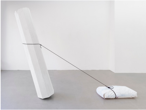
Säule, Gipssack ziehend (Column, pulling a bag of plaster), 1988-2016 plaster, rope and bag of plaster, total dimension 210 x 225 x 38 cm

info@kadel-willborn.de www.kadel-willborn.de