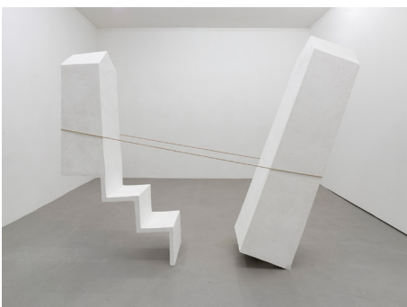
Balancierende Tuerme (Balancing Towers), 1989 plaster on metal construction, 260 x 83 x 143 cm