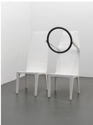
Auto (Car), 2016 plaster, iron construction, total dimension approx. 113 x 120 x 55 cm