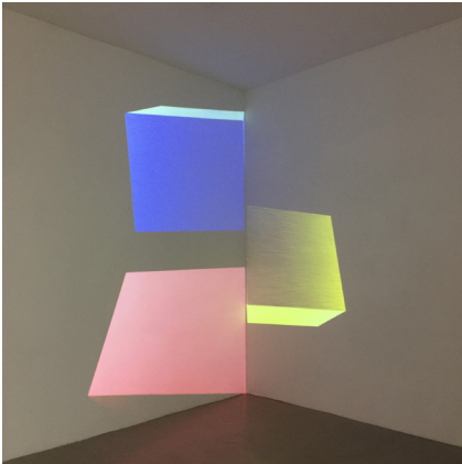
Sideways Corner, 2016 HD video projection, color, silent, loop, dimensions variable

info@kadel-willborn.de www.kadel-willborn.de