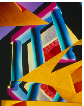
Architectural Site 8, Loyola Law School, Los Angeles, CA, December 21, 1986 Cibachrome, 60 x 50 inch (152 x 127 cm)