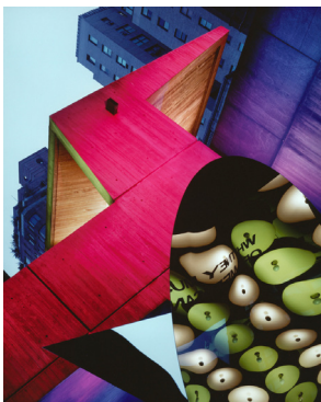
Architectural Site 16, Whitney Museum of Art, NY, October 19, 1987 Cibachrome, 60 x 50 inch (152 x 127 cm)