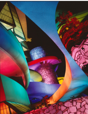
Architectural Site 19, Pavillion for Japanese Art LACMA, Los Angeles, CA, July 19, 1989 Cibachrome, 60 x 50 inch (152 x 127 cm)