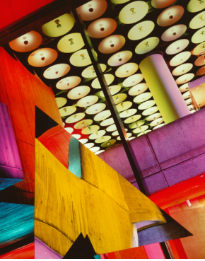
Architectural Site 15, Whitney Museum of American Art, October 19, 1987 Cibachrome, 60 x 50 inch (152 x 127 cm)

info@kadel-willborn.de www.kadel-willborn.de