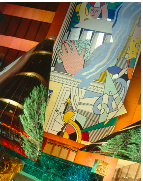
Architectural Site 3, Equitable Building New York, June 14, 1986 Cibachrome, 60 x 50 inch (152 x 127 cm)