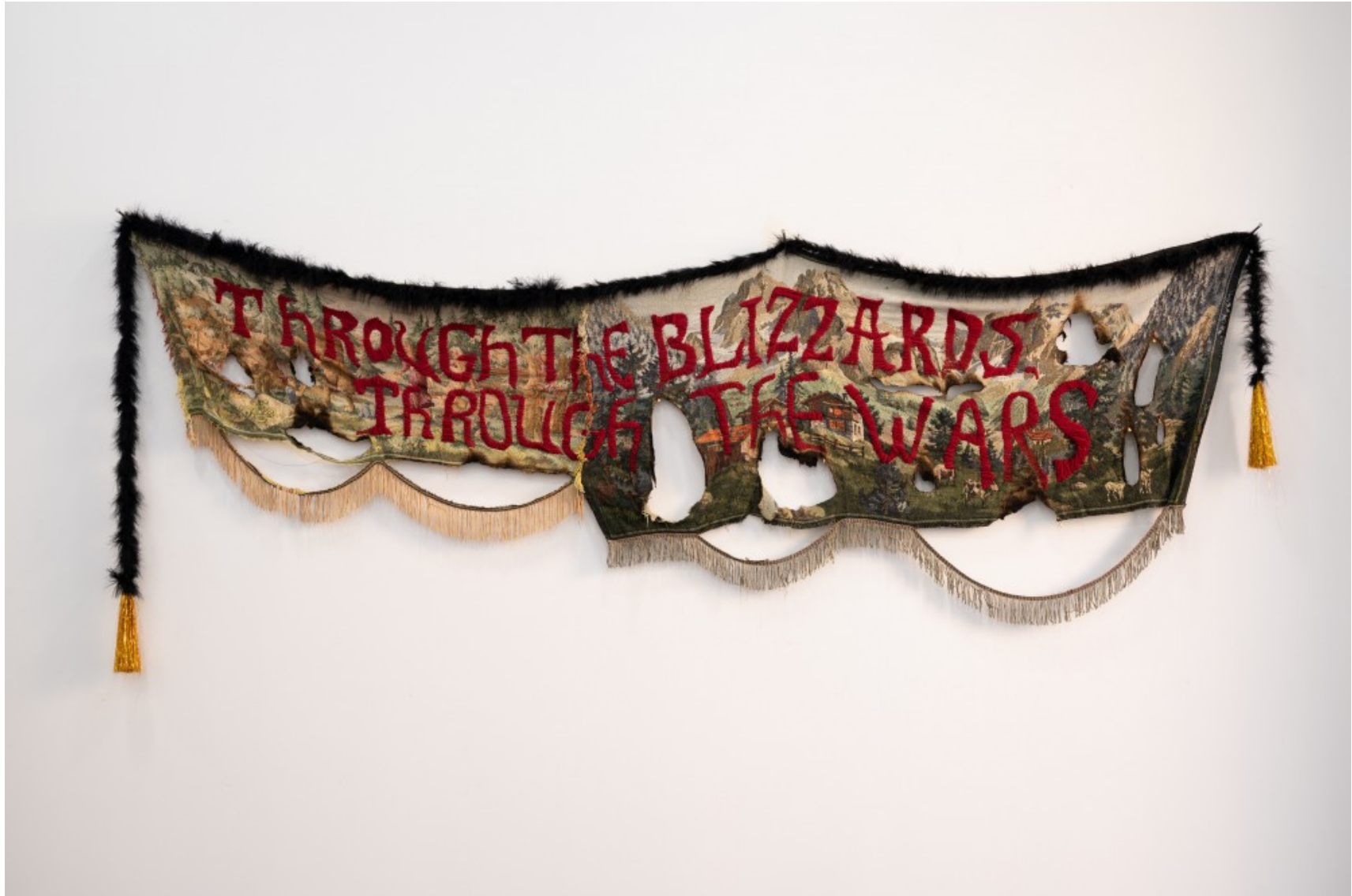
— Gvantsa Jishkariani, Through The Blizzards, Through The Wars, 2022 modified tapestry, synthetic yarn, 103 x 258 cm