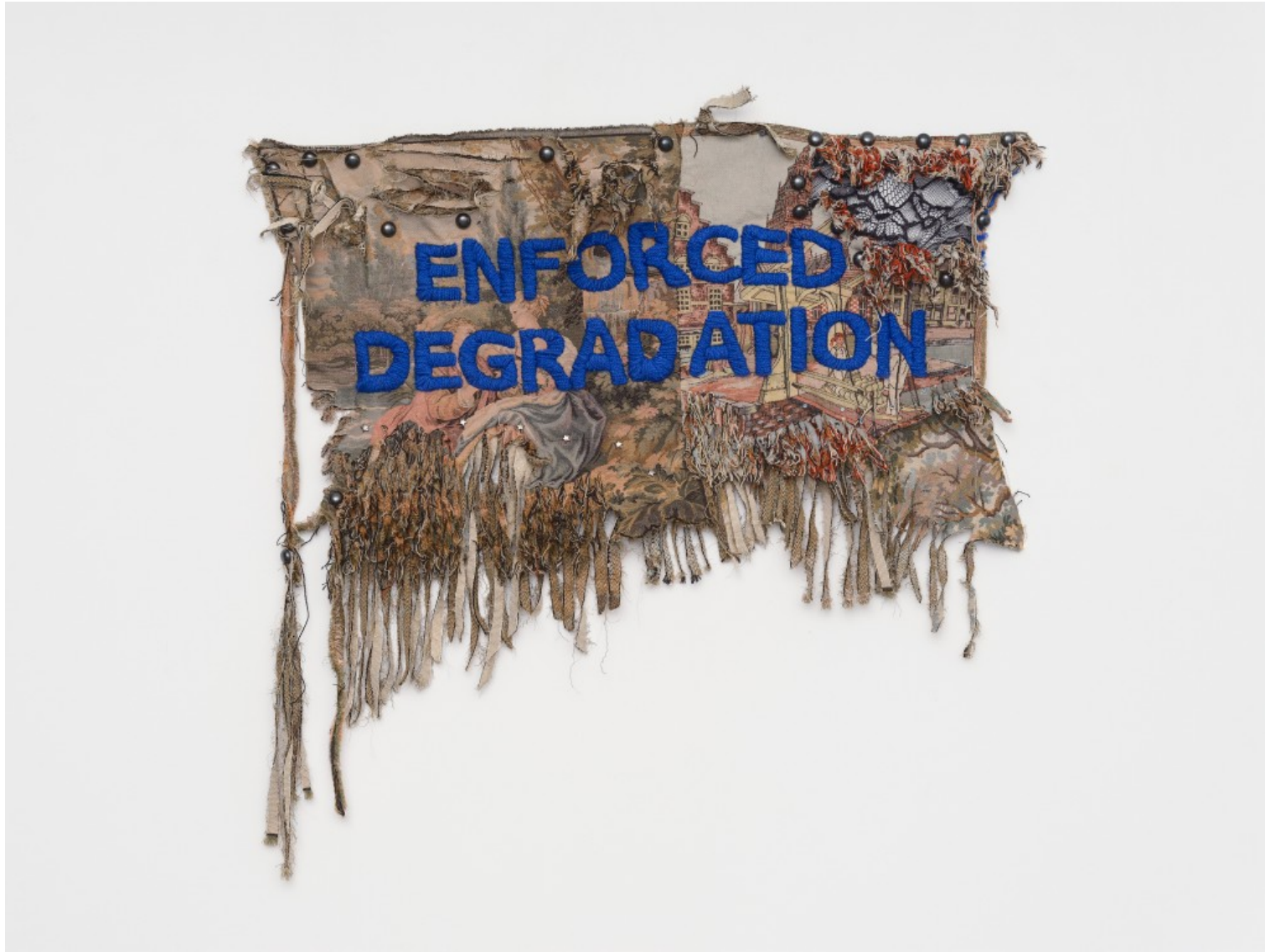
— Gvantsa Jishkariani, Enforced Degradation , 2025 modified tapestry, synthetic yarn, metal, lace, 90 x 96 cm