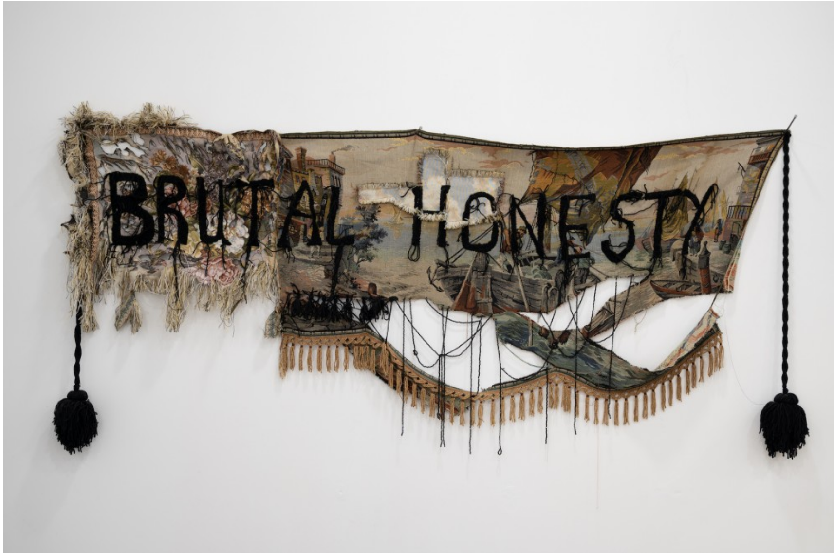
— Gvantsa Jishkariani, Brutal Honesty, 2022 modified tapestry, synthetic yarn, crystal beads, 60 x 260 cm