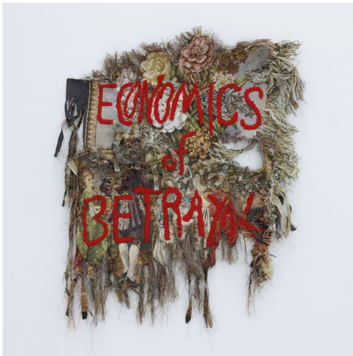
— Gvantsa Jishkariani, Economics of Betrayal, 2022 modified tapestry, synthetic yarn, metal, 85 x 65 cm