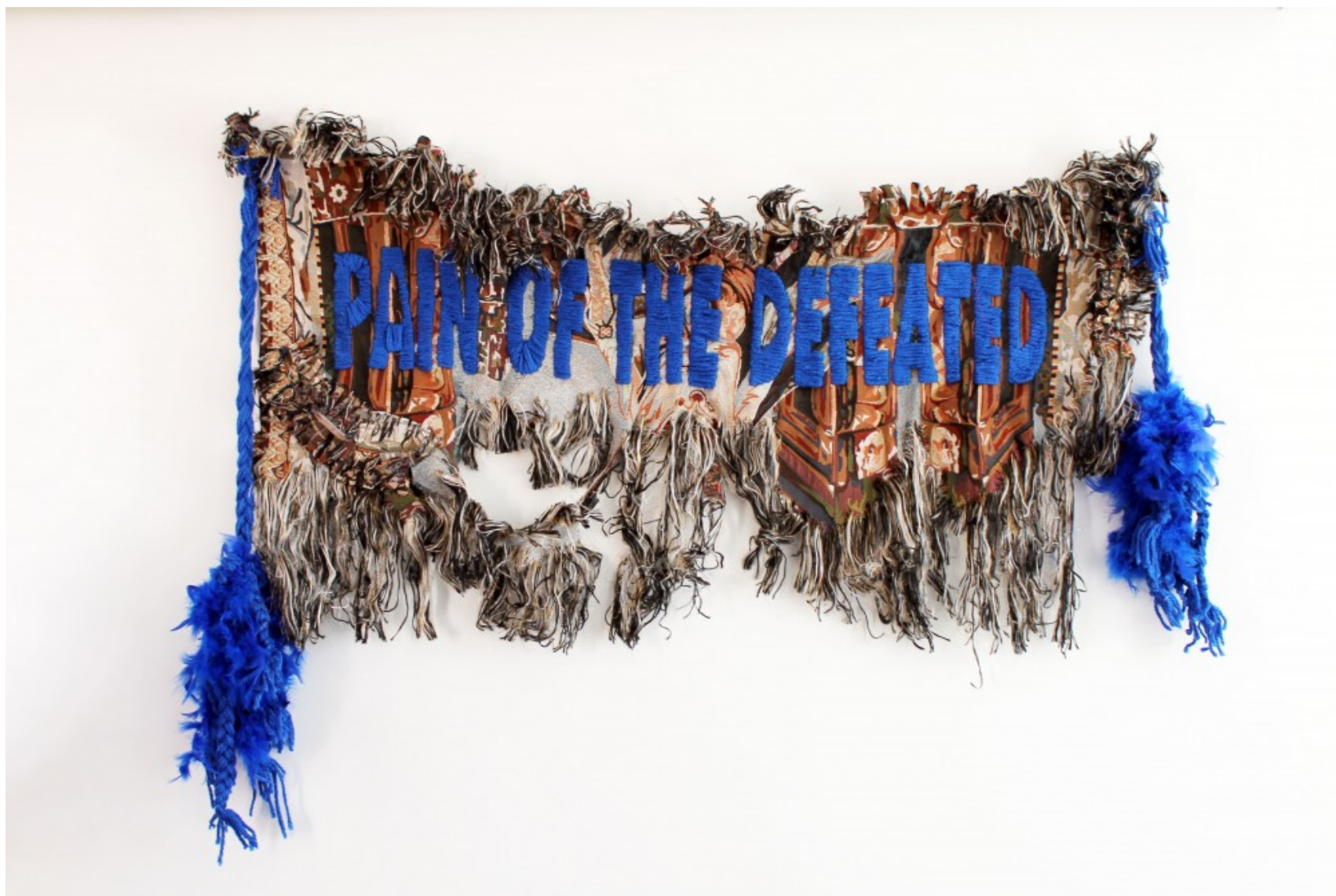
Gvantsa Jishkariani, Pain of Defeated, 2024 modified tapestry, synthetic yarn, feathers, 95 x 115 cm