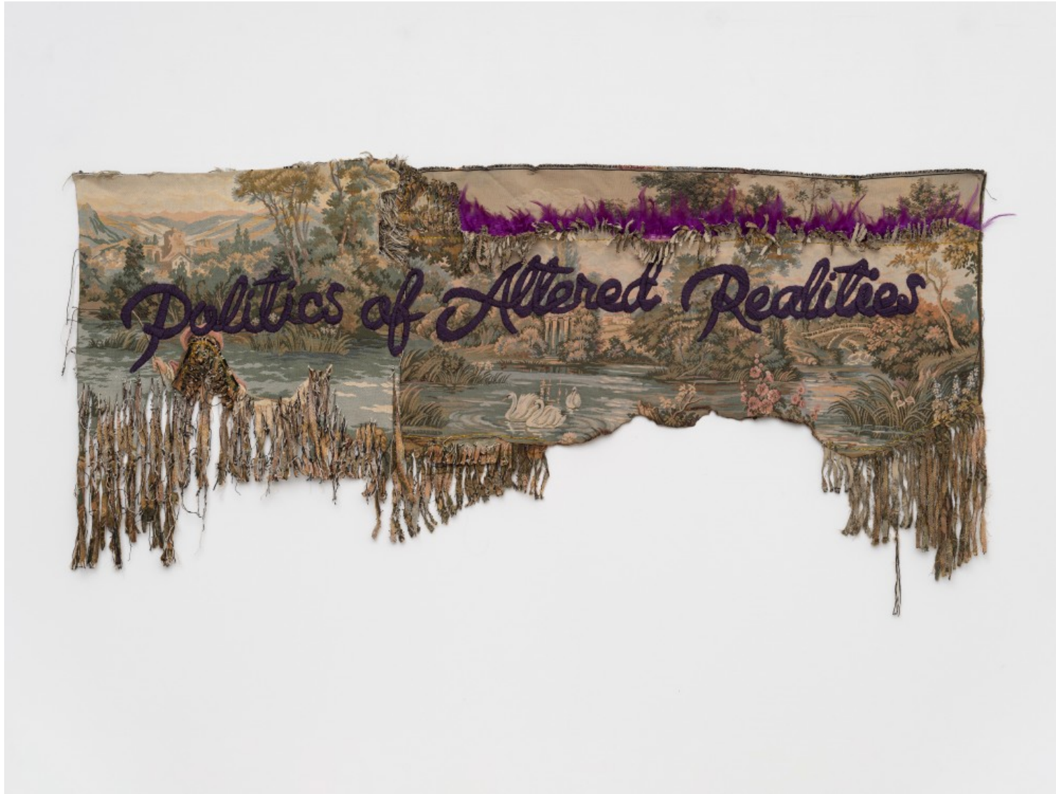
Gvantsa Jishkariani, Politics of Altered Realities , 2024 modified tapestry, synthetic yarn, feathers, 103 x 213 cm