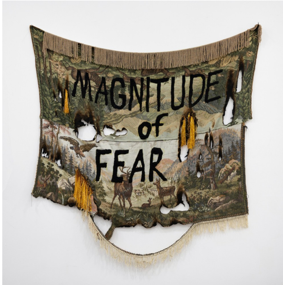
— Gvantsa Jishkariani, Magnitude of Fear , 2022 modified tapestry, synthetic yarn, 120 x 150 cm