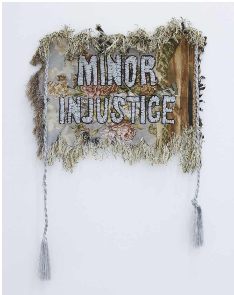
Gvantsa Jishkariani, Minor Injustice , 2023 modified tapestry, synthetic yarn, 110 x 73 cm