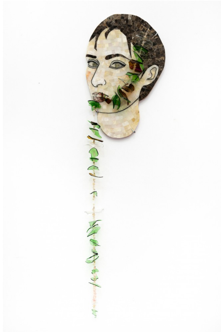
— Gvantsa Jishkariani, I Chew My Own Solid Blood , 2022

marble, granite and onyx mosaic on wood, beer bottle glass, topaz, agate and prehnite beads 43 x 29 x 1 cm