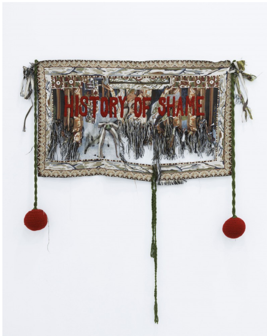
— Gvantsa Jishkariani, History of Shame, 2023 modified tapestry, synthetic yarn, stones, 115 x 95 cm