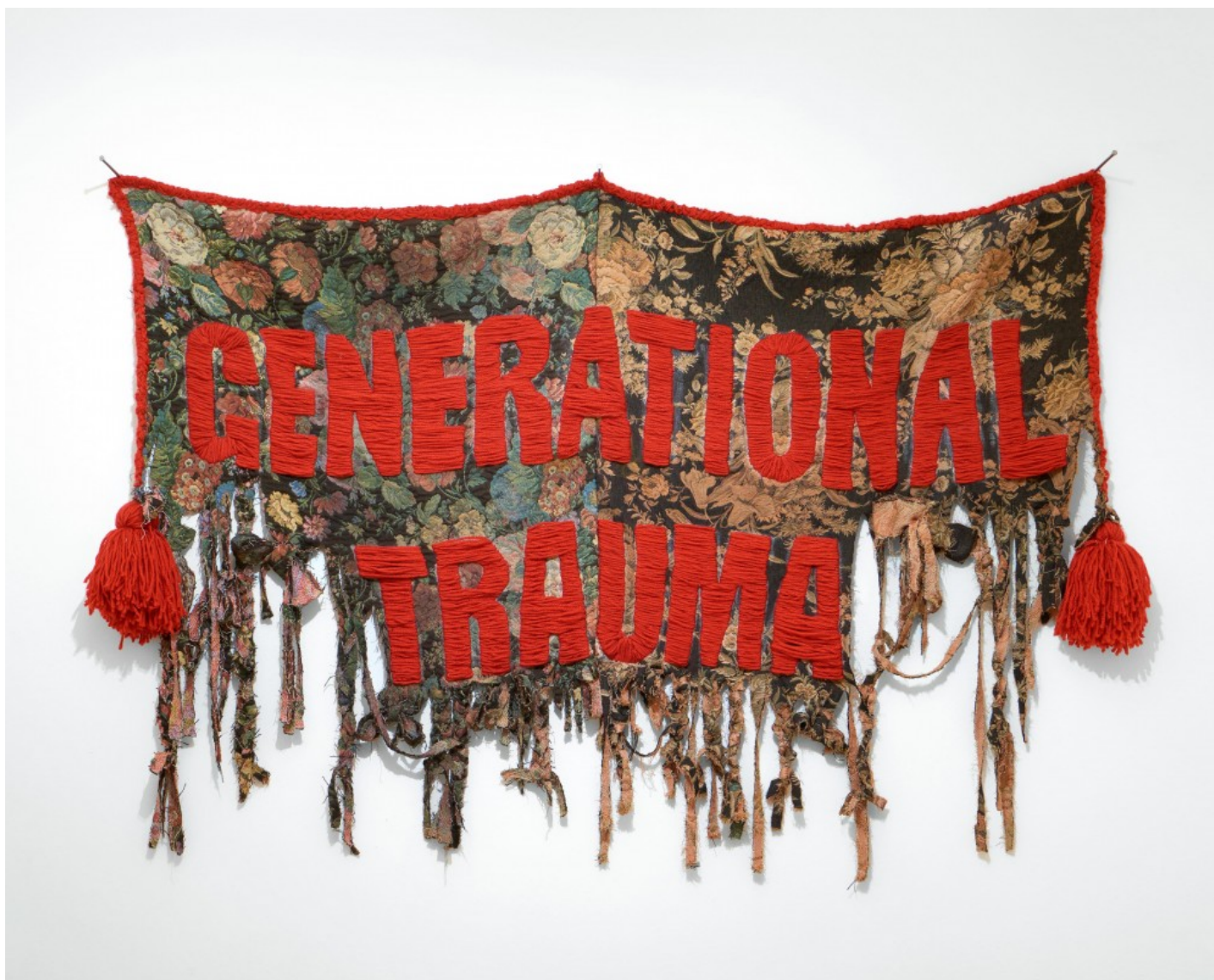
Gvantsa Jishkariani, Generational Trauma , 2022 modified jacquard, acrylic yarn, 170 x 110 cm