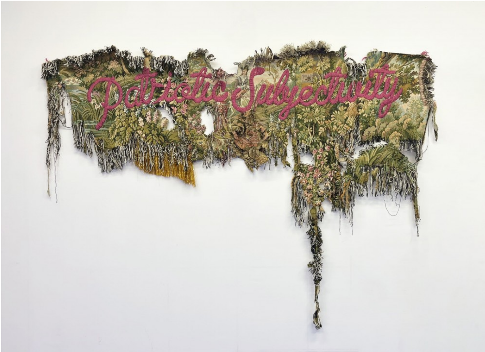
— Gvantsa Jishkariani, Patriotic Subjectivity , 2024 modified tapestry, synthetic yarn, 170 x 215 cm