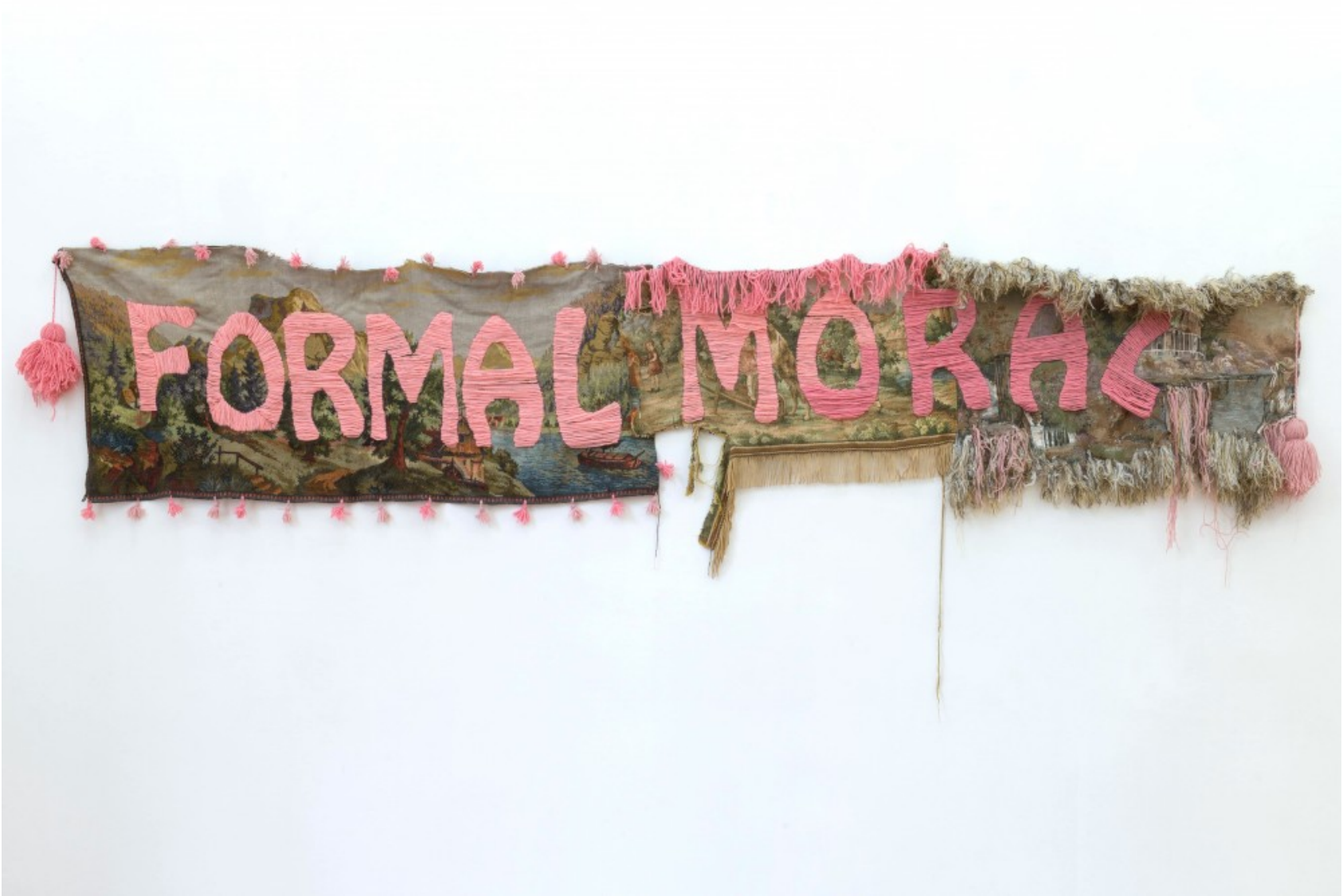
— Gvantsa Jishkariani, Formal Moral, 2021 modified tapestry, synthetic yarn, 50 x 260 cm