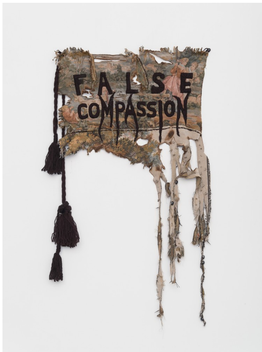
Gvantsa Jishkariani, False Compassion, 2025 modified tapestry, synthetic yarn, metal, 135 x 69 cm