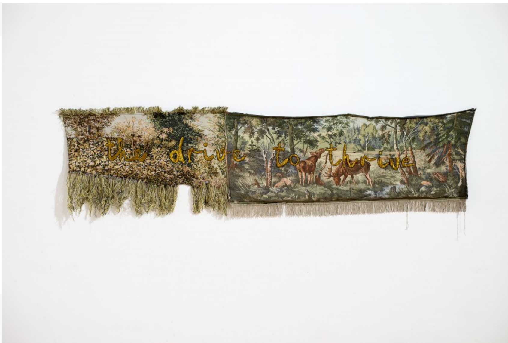
— Gvantsa Jishkariani, The Drive to Thrive , 2022 modified tapestry, synthetic yarn, 60 x 260 cm