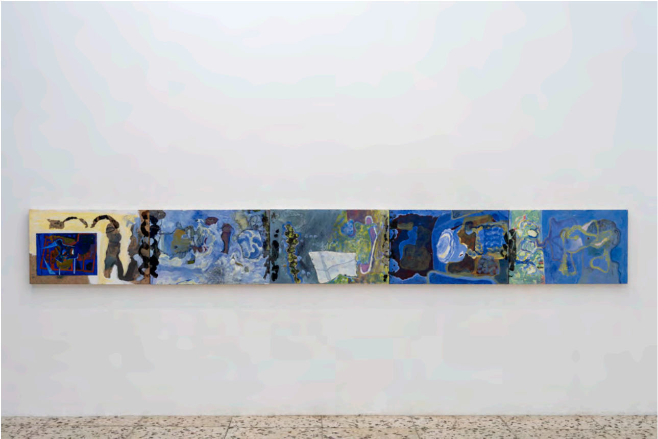
So to Speak , 2024 Oil, charcoal, collage & ink on wood 25 x 201 cm