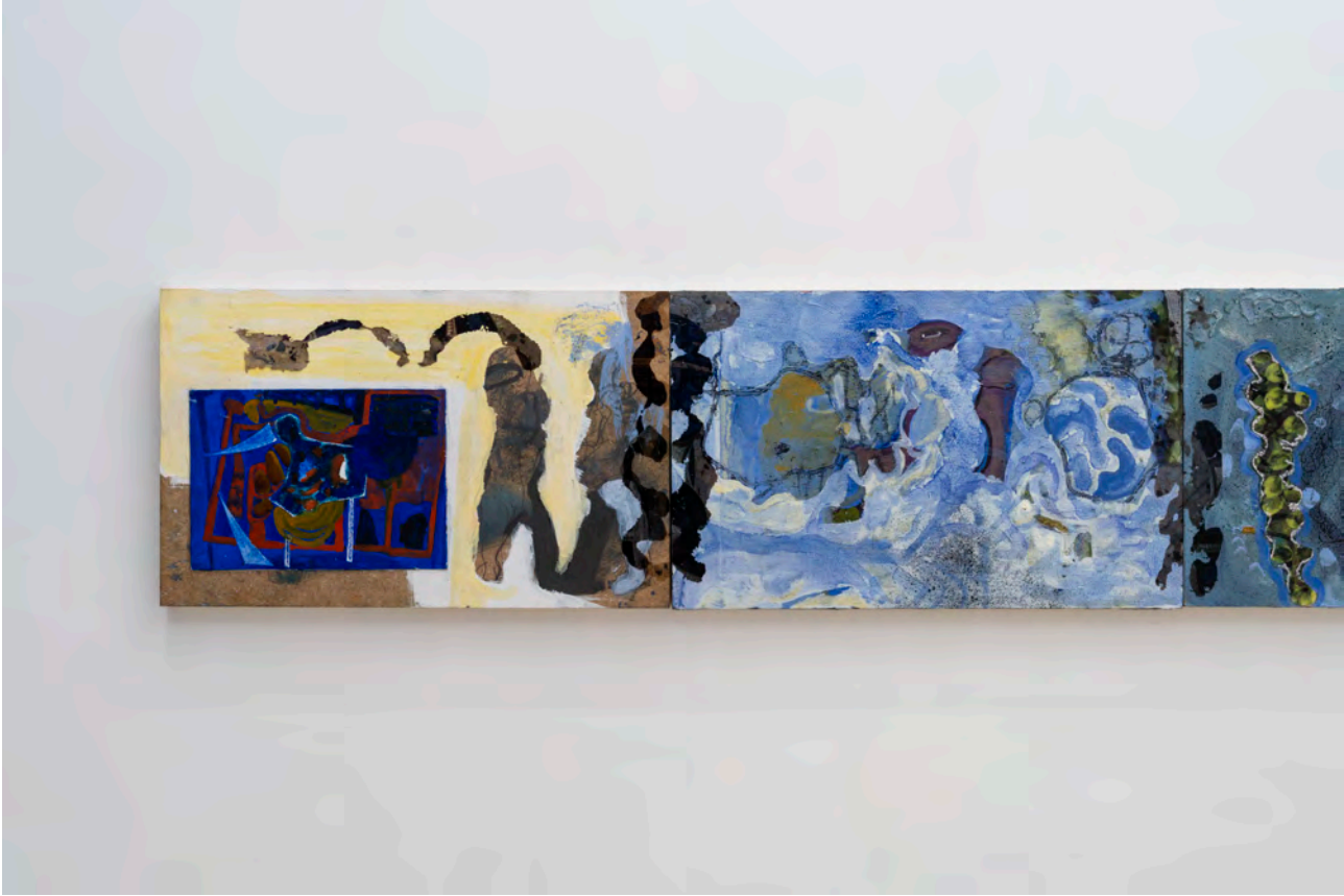
(detail) So to Speak , 2024: