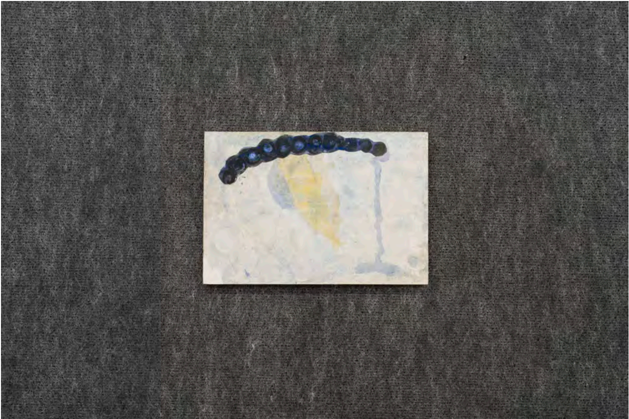
The Arrival , 2024 oil & collage on paper mounted on wood 20,5 x 30cm