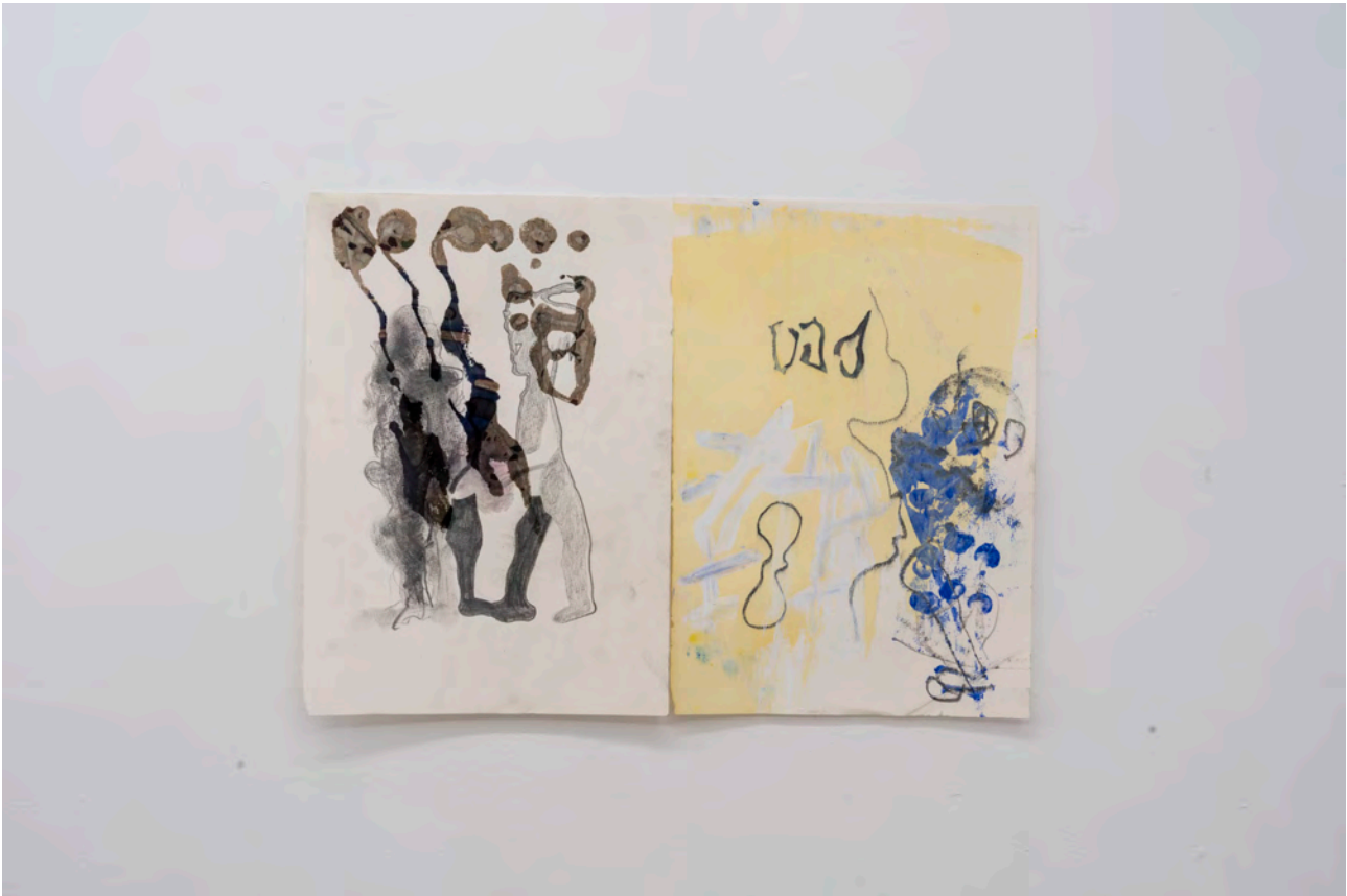
LEFT: Feeting, raining, 2024 Charcoal and ink on paper 21 x 29,7 cm