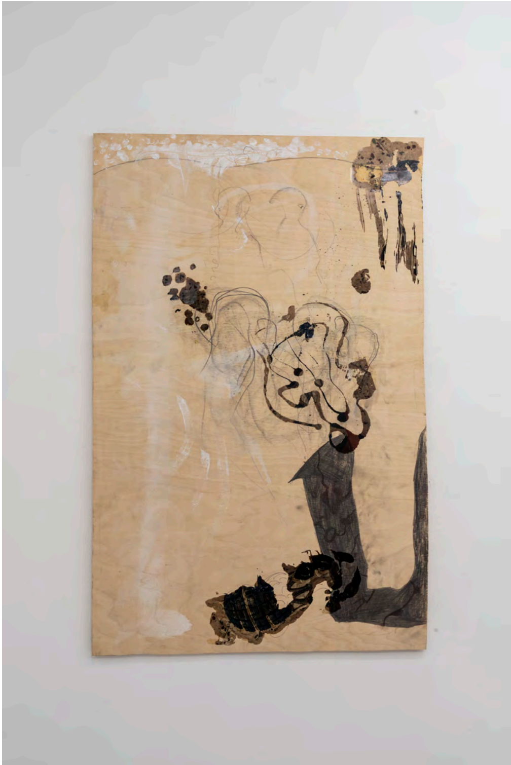
With & Apart From , 2024 Charcoal, acrylic & ink on wood 89 x 57 cm