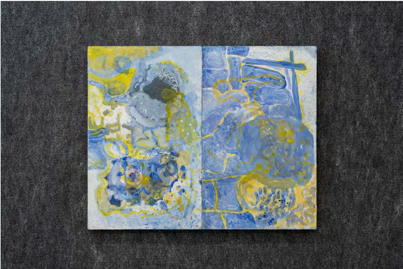
Baseline Sideways , 2024 Oil & acrylic on wood 40 x 50 cm