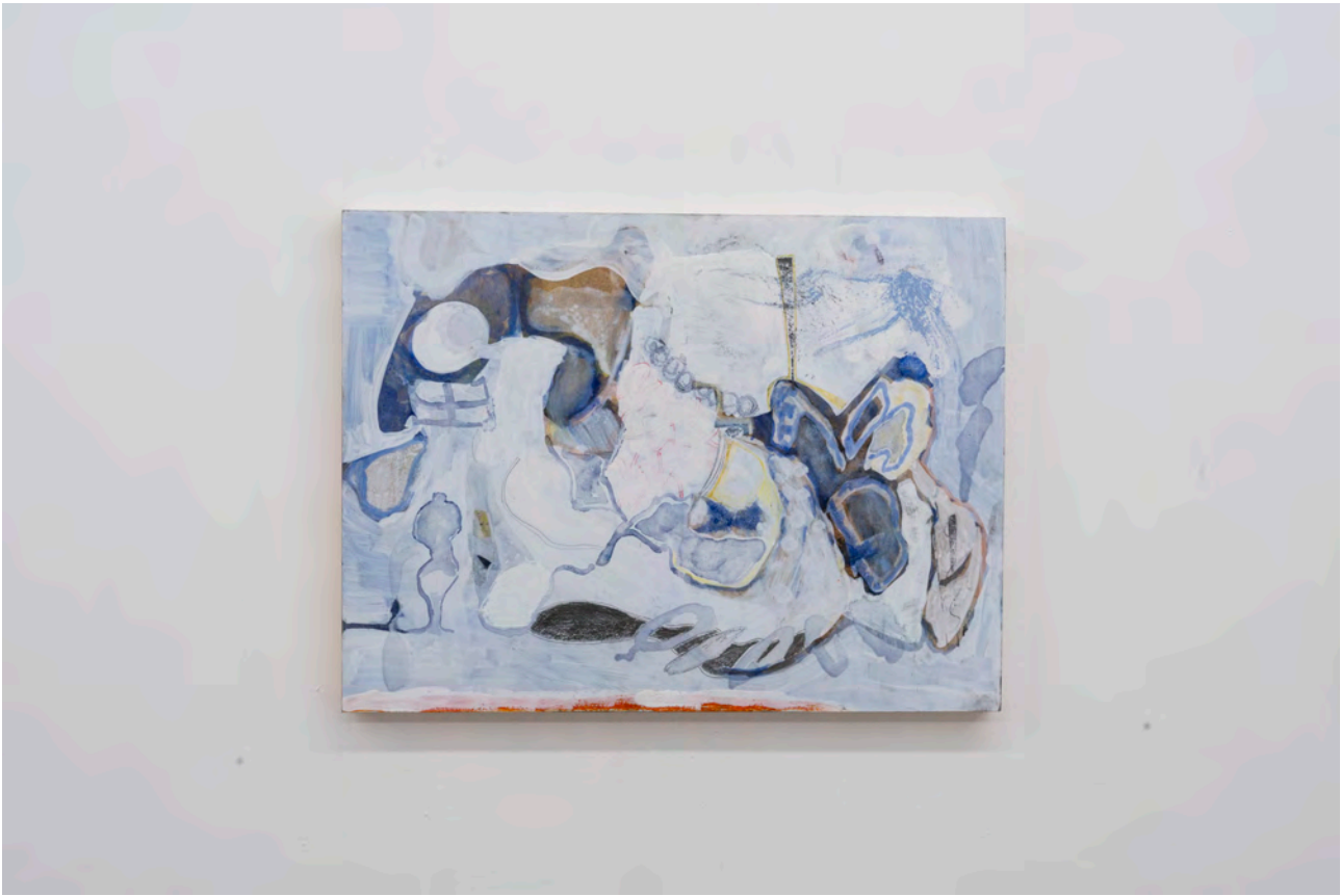
O,O,O,O,O, 2024 Oil and charcoal on wood 30 x 40 cm