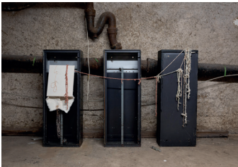
Claire Megumi a story between them - everything is political から逃げられない よ。on se tient la mano, alles zusammen 2023/2024/2025 canvas, rabbit-skin glue, needle, thread, beads, cordelette dimensions variable (canvas: 30 x 24 cm)

Photography by Stefan Lux. All works courtesy of the artists.