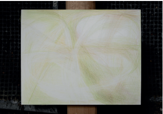
Hojeong Lee One Way or the Other 2025 colored pencil on paper, mounted on wood (work in process) 24 x 30 x 3 cm