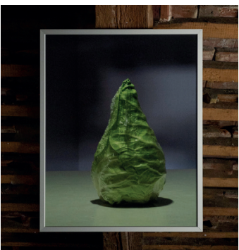
Lidong Zhao Lebensmittel. Glanz. 2023 inkjet print, framed 36 x 29 cm