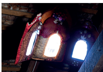
Hannah Kindler Triad of Motherhood 2023 three-channel video 02:25 min, 01:18 min, 03:19 min textile 54 x 83 x 9 cm