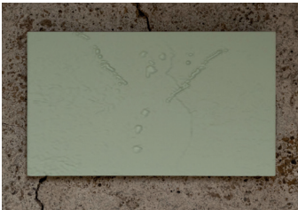
Lorenz Walter Wernli October Third 2024 CNC milling on polyurethane board 23 x 40 x 5 cm