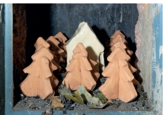
Michaela Tröscher, the Icelandic pianist Das böse Klärle muss draußen bleiben! 2025 glazed ceramics dimensions variable (house: 6 x 9 x 6 cm, trees: approx. 6 x 7 x 6 cm)