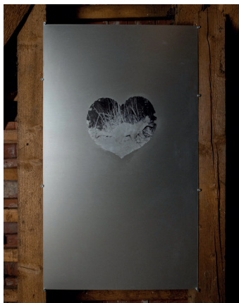
Alice Tioli Marder, bist du da? 2025 (1) image transfer and scratching on aluminum 85 x 50 cm (2) archive field recordings, electronic composition 7:53 min