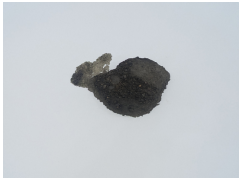
Linn P. Meldt À conter en le trottoir , 2024 Silicone, petals (Cast silicone and flower petals with sidewalk residue) 5 7 / 8 x 7 7 / 8 in (15 x 20 cm) MELli-001