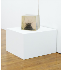
David Nelson untitled , ca 1999 Dirt, tree roots, polyurethane resin 11 1 / 4 x 12 x 12 in (28.6 x 30.5 x 30.5 cm) NELda-001