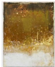
Daniel Bodner Presence 6 , 2024 Oil and acrylic on linen 14 x 11 in (35.6 x 27.9 cm) BODda-001