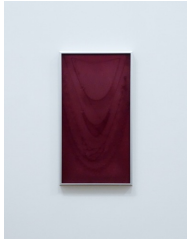
Carlos Reyes Popular Jewelry , 2023 Acquired jewelry display, frame 14 1/2 x 8 x 1 in (36.8 x 20.3 x 2.5 cm) REYca-001