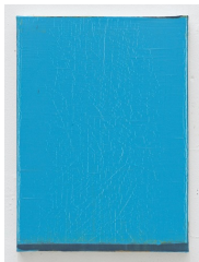
Thomas Fougeirol 107-GCY , 2021 Oil and pigments on canvas on canvas 13 x 9 in (33 x 22.9 cm) FOUth-001