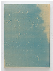
Thomas Fougeirol 059-GCY , 2021 Oil and pigments on canvas on canvas 13 x 9 in (33 x 22.9 cm) FOUth-002