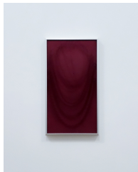
Carlos Reyes Popular Jewelry , 2023 Acquired jewelry display, frame 14 1/2 x 8 x 1 in (36.8 x 20.3 x 2.5 cm) REYca-002