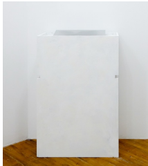
Craig Jun Li Repose II , 2025 Stainless steel, painted MDF, joint compound, SX-70 films, liquid cooling system 24 x 36 x 13 in (61 x 91.4 x 33 cm) JUNcr-002