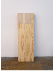
Anna Campbell Chest , 2022 Plywood, hickory veneer, pine 2x4s 55 1 / 9 x 19 x 4 in (140 x 48.3 x 10.2 cm) CAMan-001