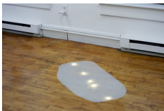
Linn P. Meldt Dermis , 2025 Silicone, lights 35 3 / 8 x 15 3 / 4 in (90 x 40 cm) MELli-002