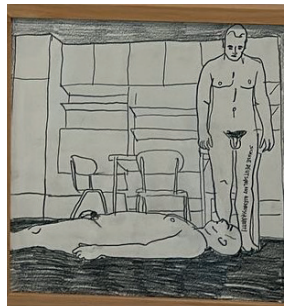
versteh mich nicht