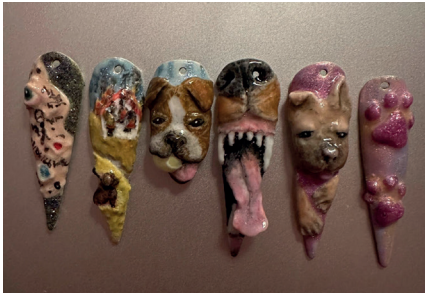
Mamacita necklace, 2025 Silver, nail polish €290 – €330 Pendants: €150 – €230