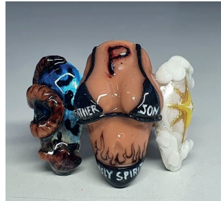
Mamacita rings, 2024/25 Silver, nail polish €460 – €550