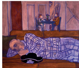
Benni as Freddi, 2025 Oil on canvas 120 x 120 cm €2,800