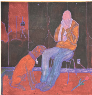
Hangman Again, 2025 Oil on canvas 110 x 120 cm €2,700