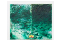
Ocean in Green (With a Drawing of Franz Marc's Painting "Horse in a Landscape") , 2024 Collaged oil pastel drawing on paper on oil on canvas 72 ½ × 84 ½ in. (184.15 × 214.63 cm)