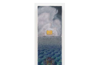
Untitled (Stacked Diptych 1) , 2024 Oil on panel 20 × 8 in. (50.80 × 20.32 cm)