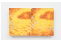
Diptych in Yellow , 2023 Oil on panel 10 × 16 in. (25.40 × 40.64 cm)