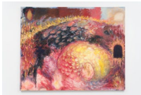
Untitled (Serpent, Fire, Hands, Winds, Sky) , 2022 Oil on canvas 76 × 96 in. (193.04 × 243.84 cm)