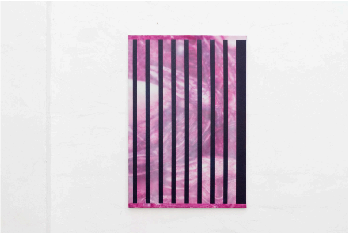
Penny Drop Acrylic on canvas 96.5 x 66.5 cm 2024