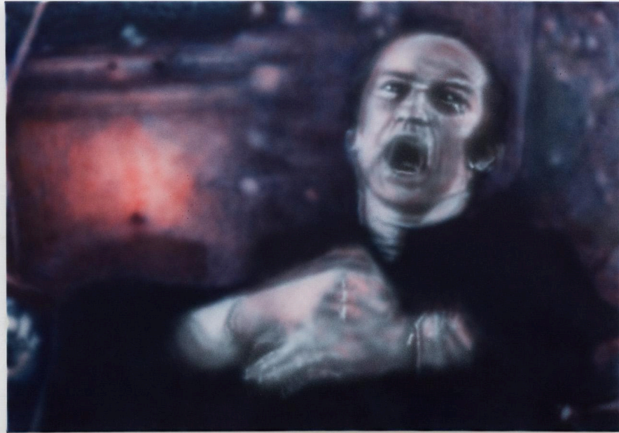
Fugue Acrylic on canvas 70 x 100 cm 2025