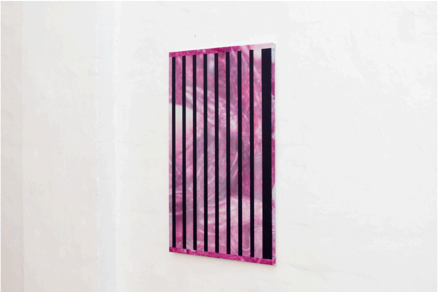
Penny Drop Acrylic on canvas 96.5 x 66.5 cm 2024