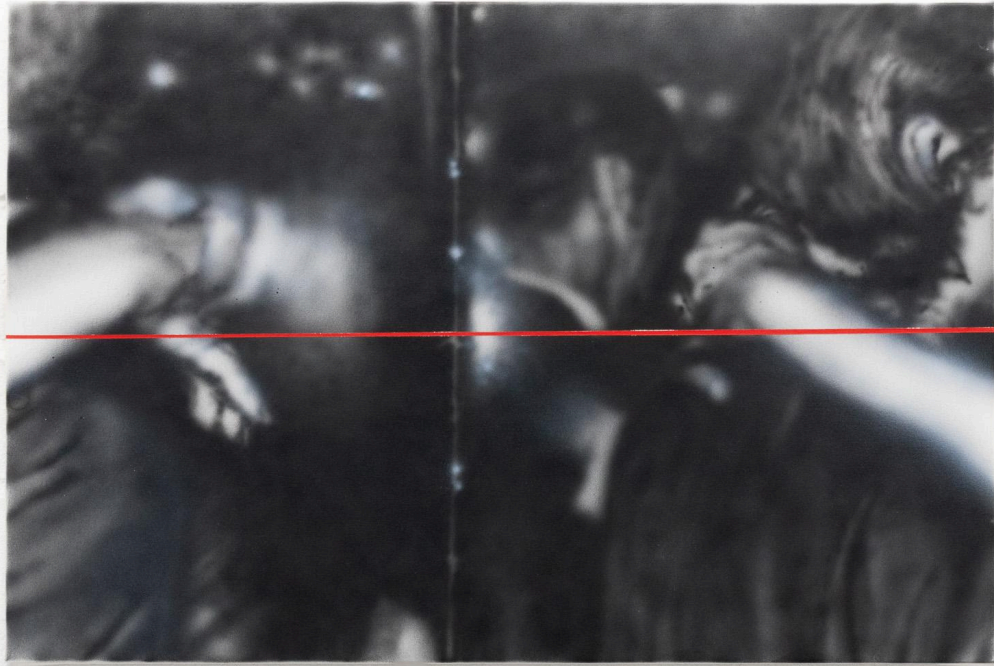
Arm's Length Acrylic on canvas 41 x 61 cm 2024