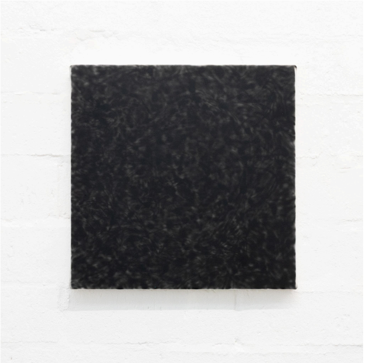
The Catalyst Acrylic on canvas 31 x 31 cm 2024