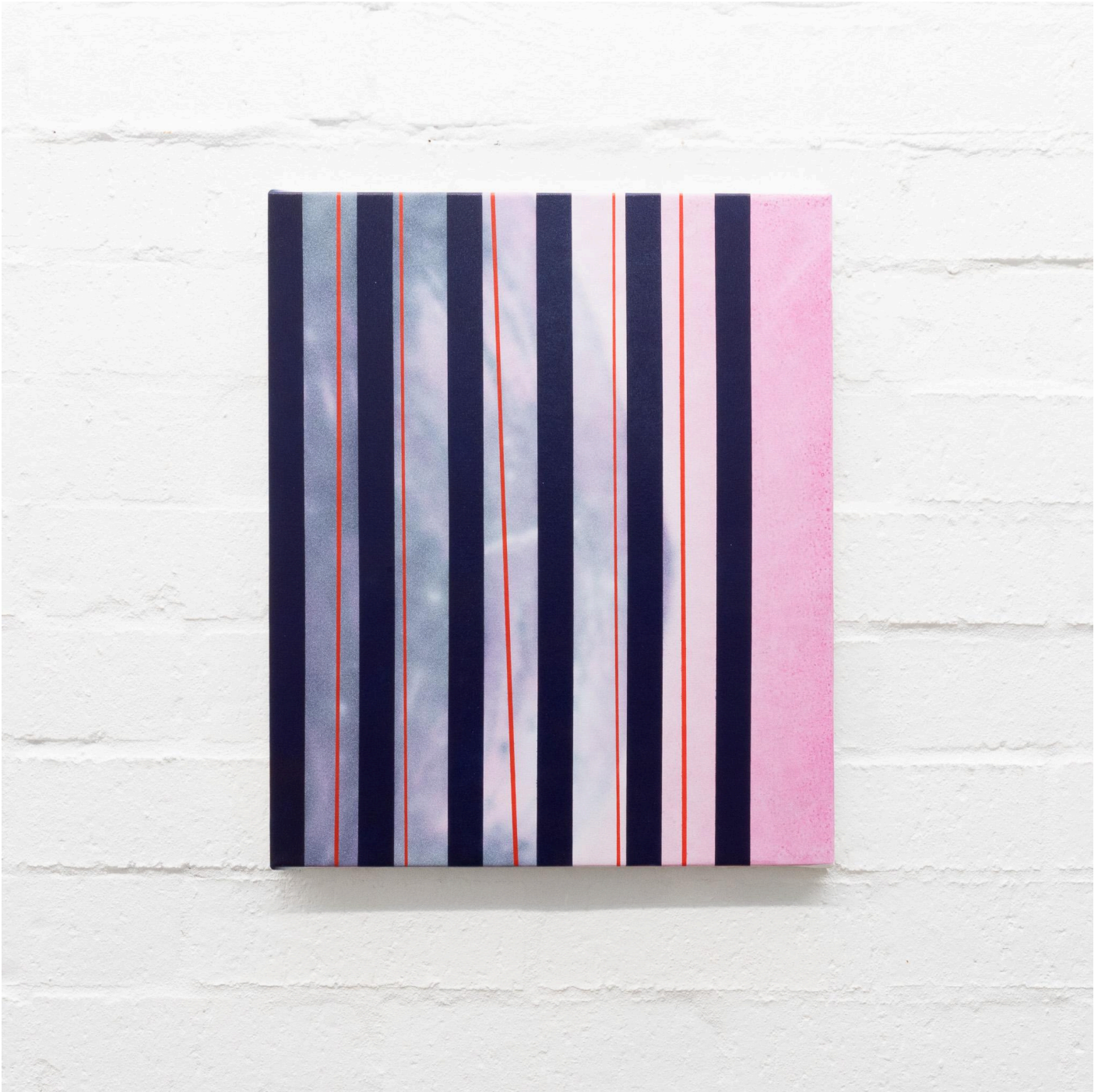
Sacrificial Anode Acrylic on canvas 46 x 38.5 cm 2025