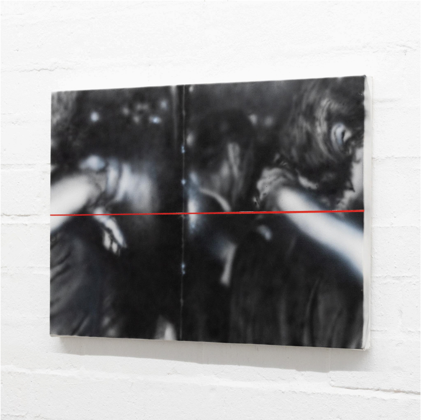
Arm's Length Acrylic on canvas 41 x 61 cm 2024