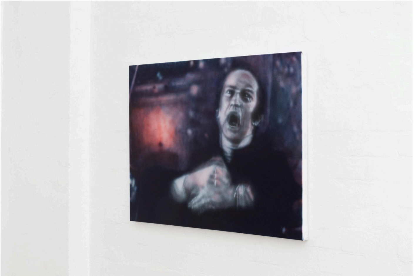
Fugue Acrylic on canvas 70 x 100 cm 2025