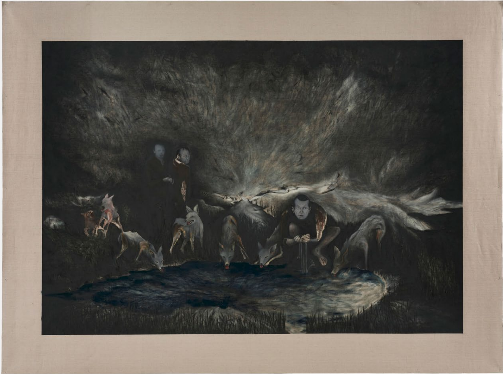
Nika Kutateladze, Two men and the calf , 2025, oil on canvas, 170 x 250 cm | 66 7/8 x 98 3/8 in, MW.NKU.006,