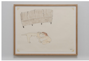
Holding On (with couch), 2024 ballpoint pen and crayon on paper 17 1/2" x 23"