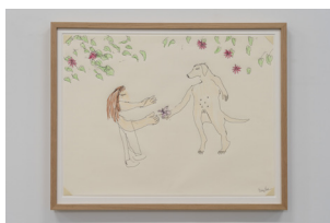
The Gift, 2024 ballpoint pen and crayon on paper 17 1/2" x 23"