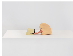
French Kissing, 2025 oil paint and cold wax medium on ceramic lips and tongue: 5" x 4 1/4" x 4 3/4" muzzle and tongue: 4 3/4" x 2 3/4" x 2 1/2"