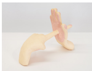
Finger Through Palm, 2020 acrylic paint on papier mâché and epoxy resin 8 1/4" x 4 1/2" x 11"