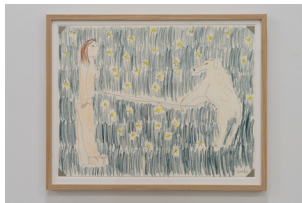
Dogs and Humans Figure a Universe 2, 2022 ballpoint pen and crayon on paper 17 1/2" x 23" inches