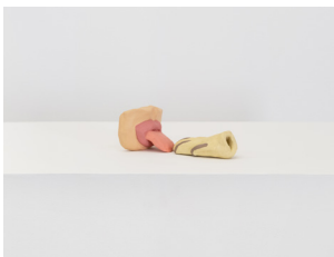
Tongue and Paw, 2023 oil paint and cold wax medium on ceramic paw: 4 1/2" x 2 1/2" x 1 1/2" tongue: 3" x 4 1/2" x 3"