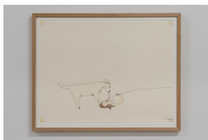
Good Morning, 2024 ballpoint pen and crayon on paper 17 1/2" x 23"