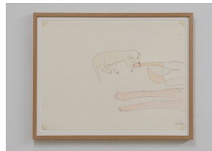
On a Good Day You can Feel My Love for You, 2022 ballpoint pen and crayon on paper 17 1/2" x 23"