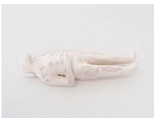
Doggirl (smaller), 2025 earthenware ceramic 11 3/4" x 4 1/2" x 2 1/4"