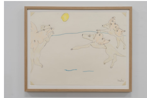
London Afterlife, 2022 ballpoint pen and crayon on paper 17 1/2" x 23"