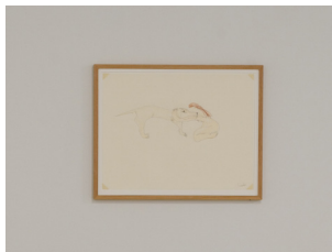
Holding On, 2024 ballpoint pen and crayon on paper 17 1/2" x 23"