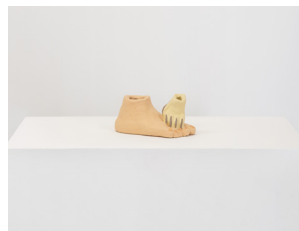
Paw on Foot, 2023 oil paint and cold wax medium on ceramic 9" x 4" x 4"