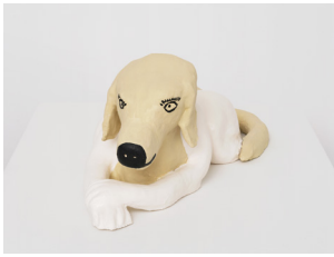
Doggirl Sphinx, 2023 oil paint and cold wax medium on ceramic 19 1/2" x 10 1/4" x 7 3/4"