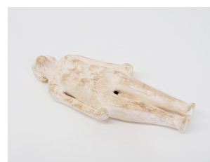
Doggirl, They Called Me, 2021 earthenware ceramic 15" x 6" x 3 1/2"