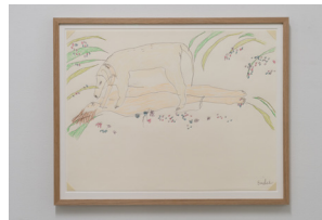
Me and London Lying in the Flowers 1, 2022 ballpoint pen and crayon on paper 17 1/2" x 23"