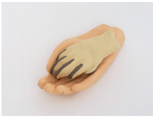
London's Paw in My Open Hand, 2025 oil paint and cold wax medium on ceramic paw: 4 1/2" x 2" x 1 1/4" hand: 7" x 3 1/2" x 1 1/2"