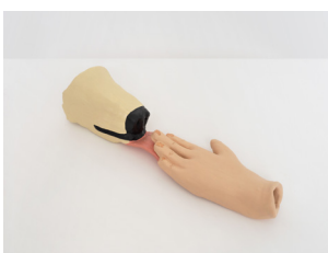
Fingers and Tongue, 2023 oil paint and cold wax medium on ceramic 17" x 5 1/2" x 4 1/2"