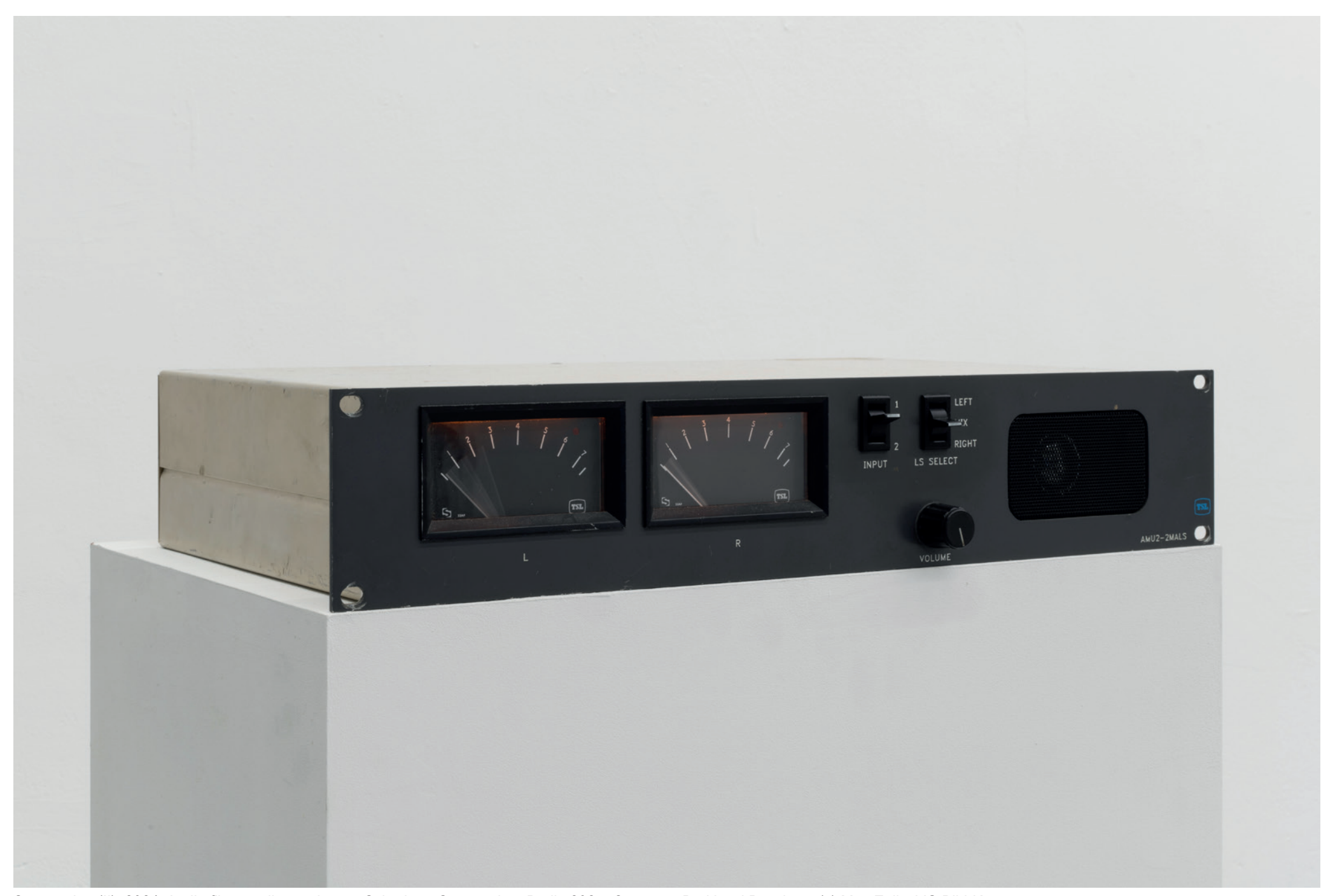
Suspension (II), 2024, Audio files, audio monitor: at Scherben, Suspension, Berlin 2025. Courtesy: Burkhard Beschow. (c) Max Eulitz VG Bild-Kunst.