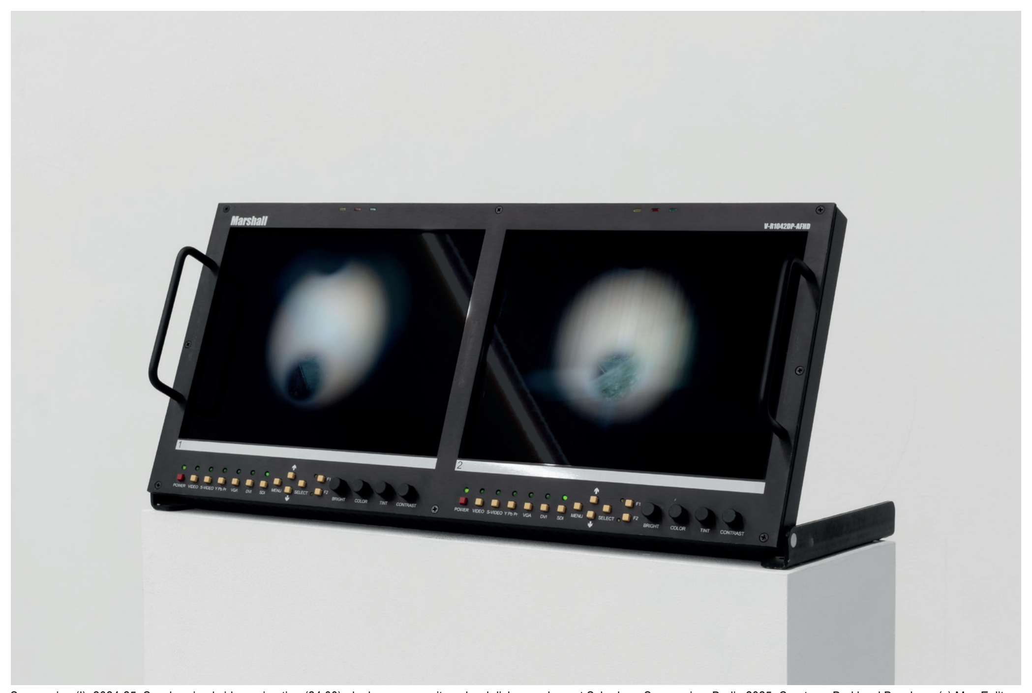
Suspension (I), 2024-25, Synchronized video animation (24:00), dual-screen monitors, hard disk recorders: at Scherben, Suspension, Berlin 2025. Courtesy: Burkhard Beschow. (c) Max Eulitz VG Bild-Kunst.