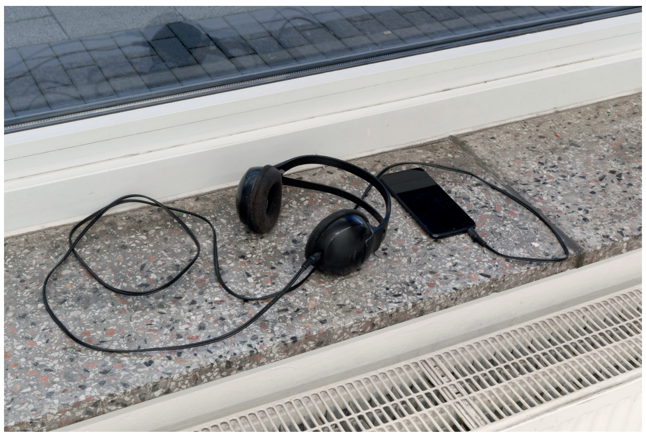
Sitex, 2025, Audio file (5:00), headphones, cellphone: at Scherben, Suspension, Berlin 2025.