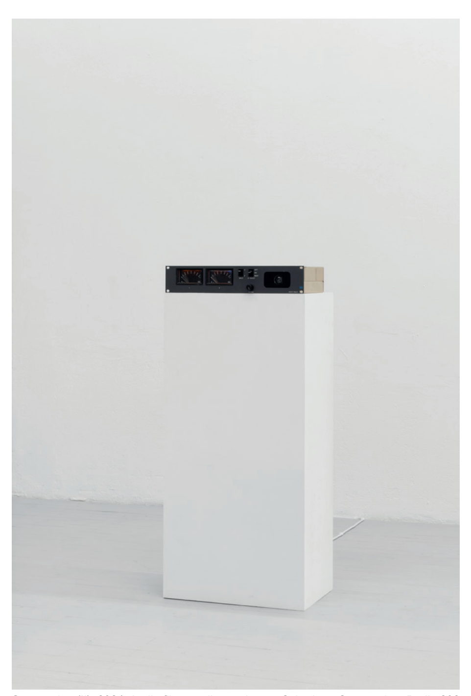
Suspension (II), 2024, Audio files, audio monitor: at Scherben, Suspension, Berlin 2025. Courtesy: Burkhard Beschow. (c) Max Eulitz VG Bild-Kunst.