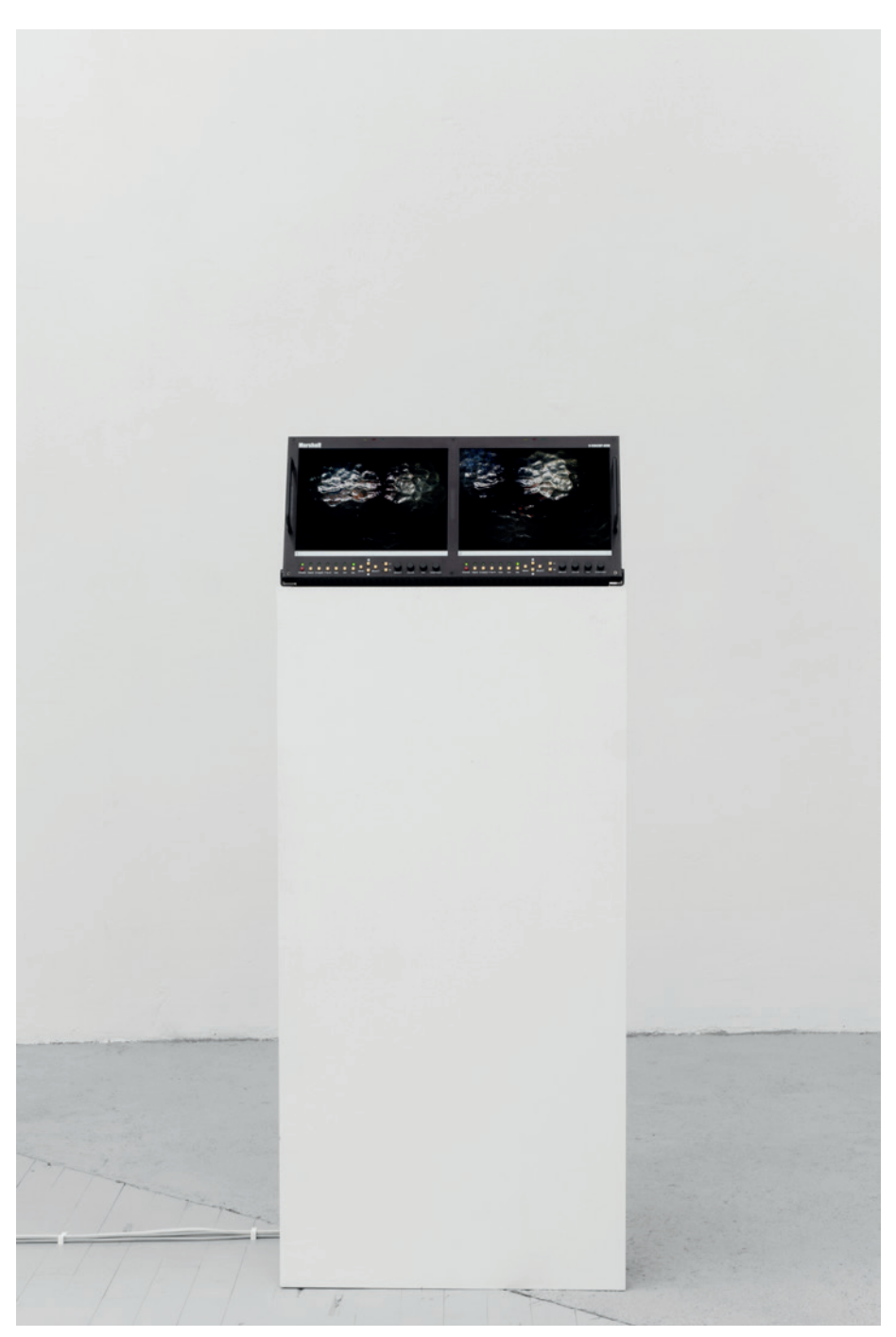
Suspension (I), 2024-25, Synchronized video animation (24:00), dual-screen monitors, hard disk recorders: at Scherben, Suspension, Berlin 2025. Courtesy: Burkhard Beschow. (c) Max Eulitz VG Bild-Kunst.