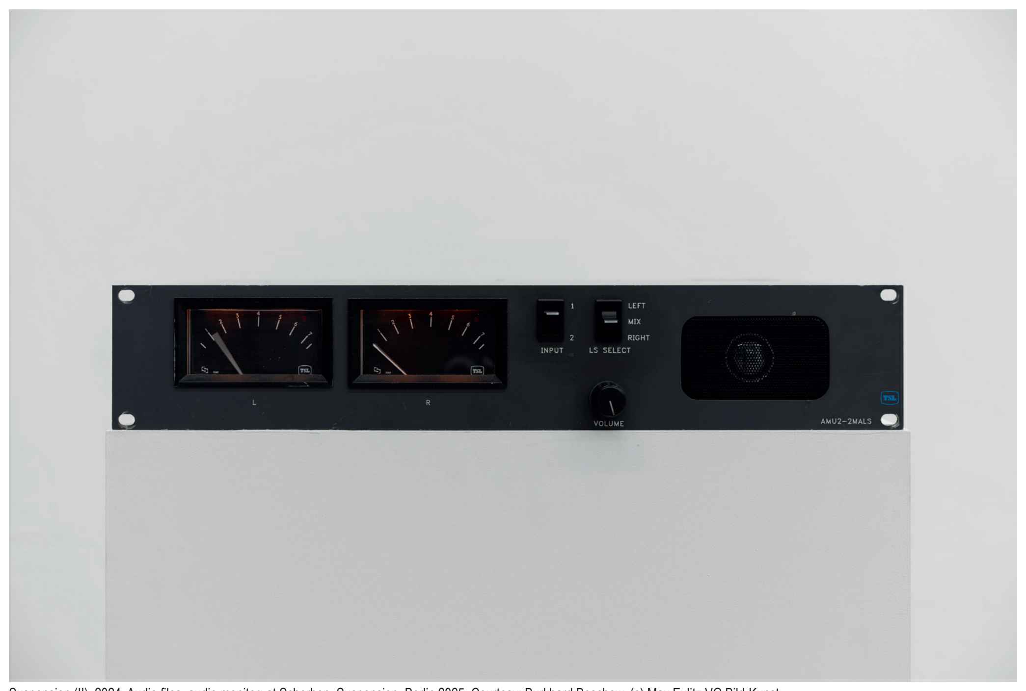
Suspension (II), 2024, Audio files, audio monitor: at Scherben, Suspension, Berlin 2025. Courtesy: Burkhard Beschow. (c) Max Eulitz VG Bild-Kunst.