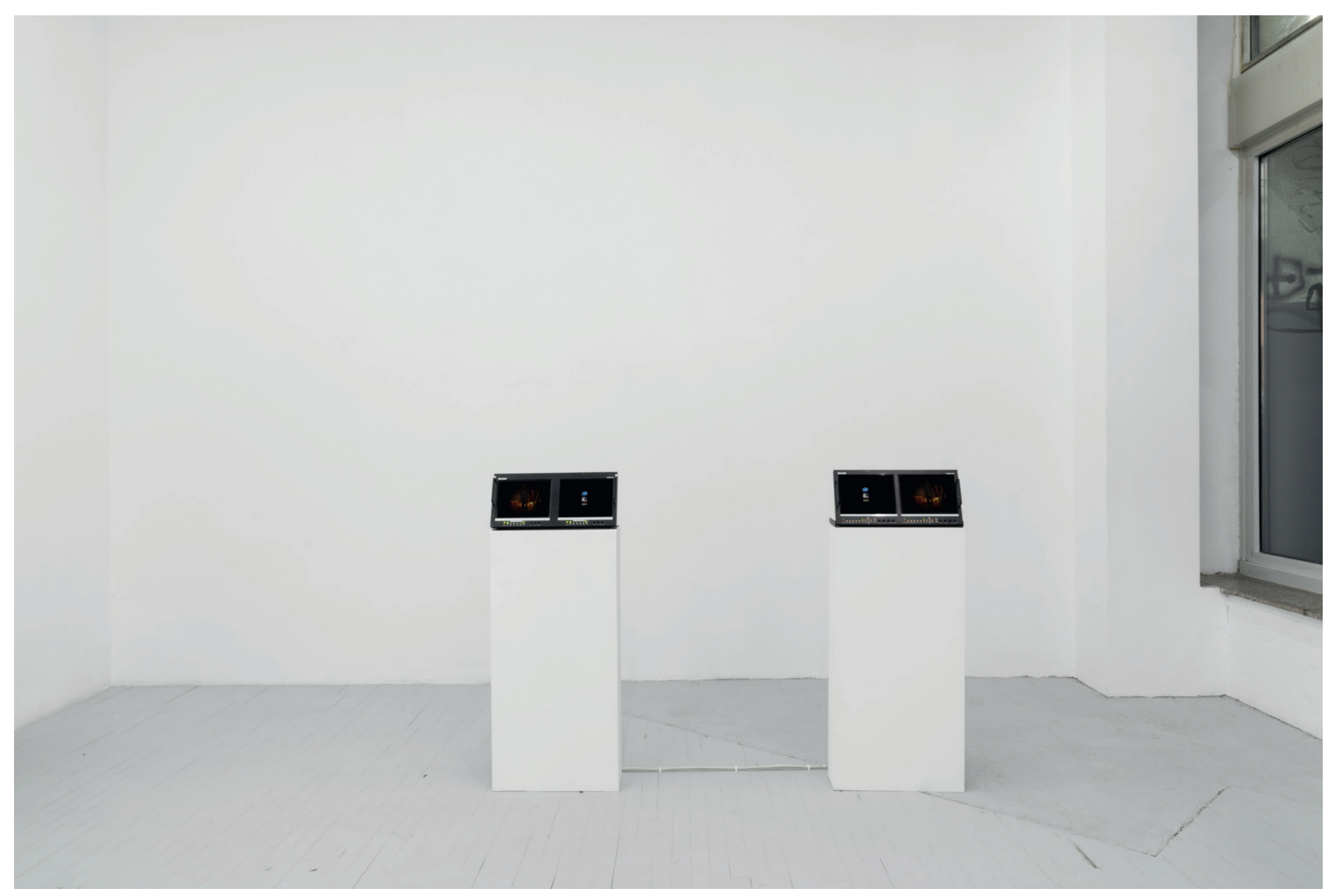
Suspension (I), 2024-25, Synchronized video animation (24:00), dual-screen monitors, hard disk recorders: at Scherben, Suspension, Berlin 2025. Courtesy: Burkhard Beschow. (c) Max Eulitz VG Bild-Kunst.