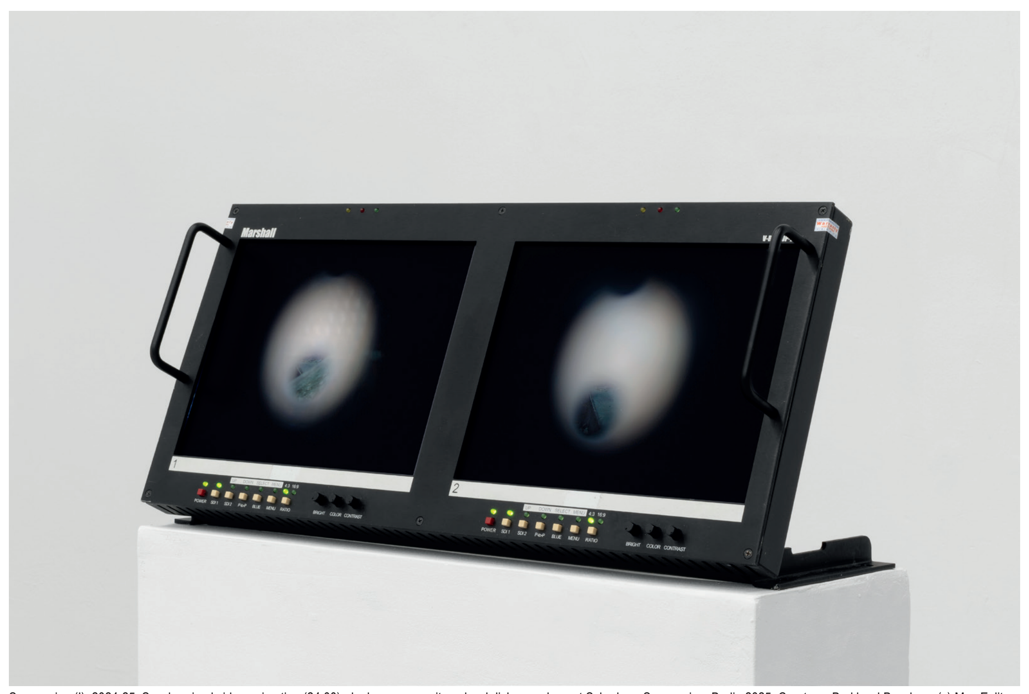
Suspension (I), 2024-25, Synchronized video animation (24:00), dual-screen monitors, hard disk recorders: at Scherben, Suspension, Berlin 2025. Courtesy: Burkhard Beschow. (c) Max Eulitz VG Bild-Kunst.