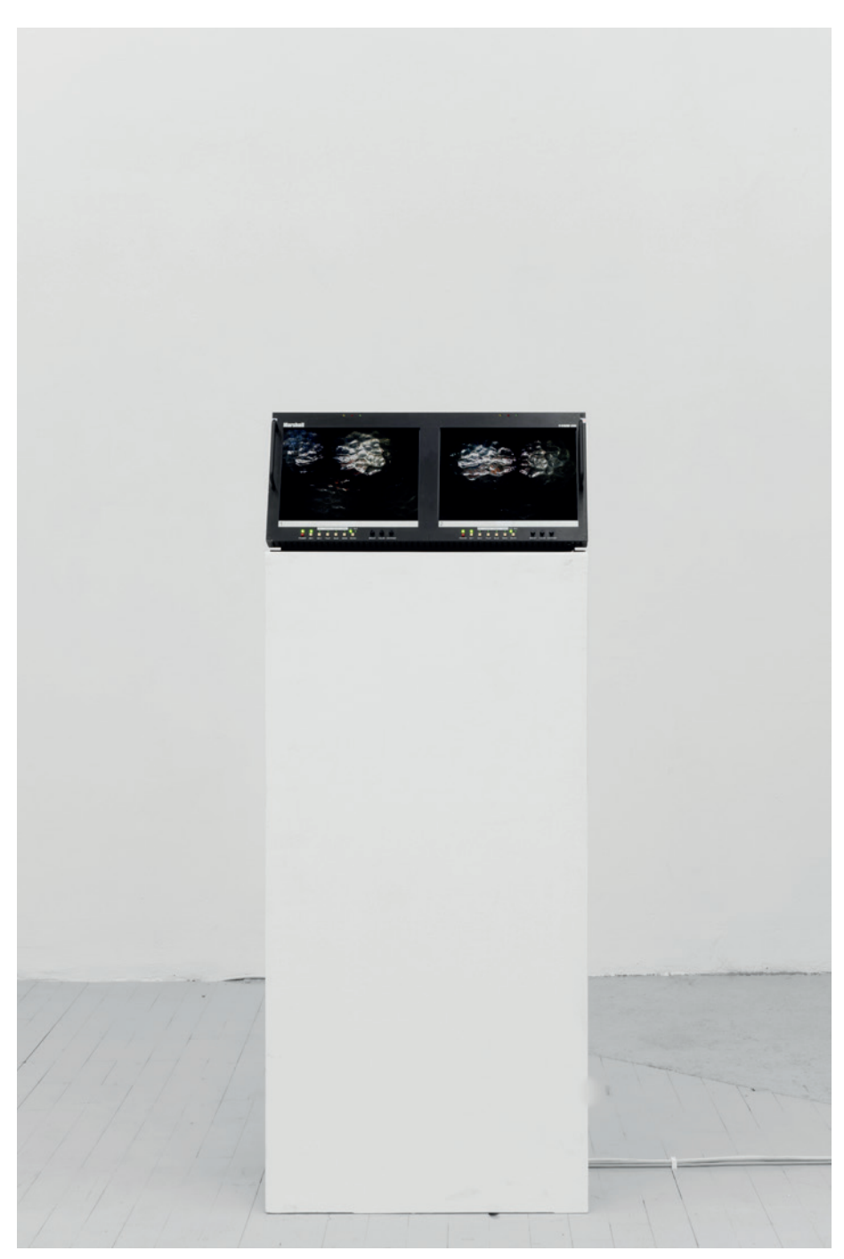
Suspension (I), 2024-25, Synchronized video animation (24:00), dual-screen monitors, hard disk recorders: at Scherben, Suspension, Berlin 2025. Courtesy: Burkhard Beschow. (c) Max Eulitz VG Bild-Kunst.