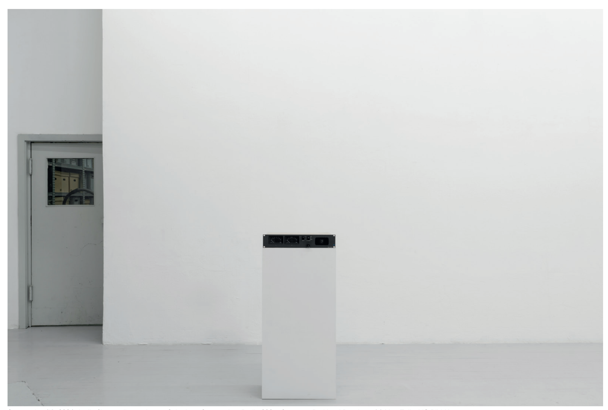
Suspension (II), 2024, Audio files, audio monitor: at Scherben, Suspension, Berlin 2025. Courtesy: Burkhard Beschow. (c) Max Eulitz VG Bild-Kunst.