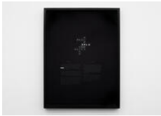
WOP 5723/U, Cameron A. Granger 6th movement - Lost Cities, 2024 Screenprint and pen on paper Edition of 2 with 1 AP; each edition has a unique, handwritten element 33 × 25 inches (83.82 × 63.50 cm) (framed)