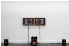
V 5727/1, Cameron A. Granger Just Below Heaven, 2025 Found wood, pigeon feet, rusted nails, video Video running time 8 min, 54 seconds: 18 1/2 × 55 1/2 inches (46.99 × 140.97 cm) Edition 1/2 + II AP