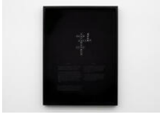
5725/U, Cameron A. Granger 8th movement - Cities for the Future, 2024 Screenprint and pen on paper Edition of 2 with 1 AP; each edition has a unique, handwritten element 35 × 22 inches (88.90 × 55.88 cm) (framed)