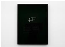
5724/U, Cameron A. Granger 7th movement - Invisible Cities, 2024 Screenprint and pen on paper Edition of 2 with 1 AP; each edition has a unique, handwritten element 35 × 22 inches (88.90 × 55.88 cm) (framed)