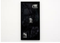
5726/U, Cameron A. Granger Hollowfolk #2 - Black Herman Covers the World, 2024 Screenprint and inkjet prints collaged on paper 55 3/4 × 26.8125 inches (141.61 × 68.10 cm) (framed)