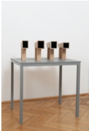
4 Time Tubes , 2011 MDF, wooden frame, lacquer on paper (1) 31,8 x 9,4 x 50,9 cm (2) 31,9 x 10,4 x 51,2 cm (3) 31,2 x 10,7 x 51,2 cm (4) 29,8 x 10,9 x 50,9 cm