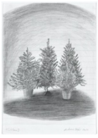
Fichten 1 , 1996 Pencil on paper 20,5 x 14,8 cm