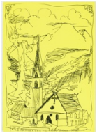
Die Dämonen von Uri , 1996 Xerox on paper 29,5 x 21 cm