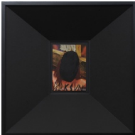
DARK SUN , 2011 3D card, oil 40 x 40 x 8 cm