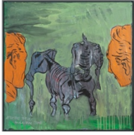
After the future , 2011 Oil on board 60 x 60 cm