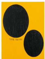
Time Machine (2) , 2011 Lacquer, oil on canvasboard 80 x 60 cm