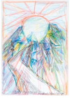
Older Mountains , 1998 Crayon, marker, fine liner on paper 42 x 29,5 cm