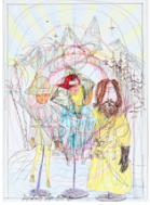
Idaho Transfer , 1998 Crayon, marker, fine liner on paper 42 x 29,5 cm