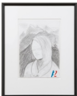
K2 , 2001 Pencil, crayon, collage on paper 29,5 x 21 cm