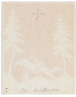
Love , 2007 Phantom, pencil 28 x 22 cm