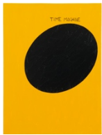
Time Machine (4) , 2011 Lacquer, oil on canvasboard 80 x 60 cm