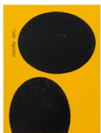
Time Machine (3) , 2011 Lacquer, oil on canvasboard 80 x 60 cm