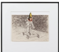
Robinson auf dem Mars , 2002 Fine liner, collage on paper 23 x 29,7cm