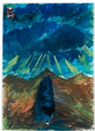
X Dream People , 1998 Gouache, collage on paper 41 x 29,5 cm