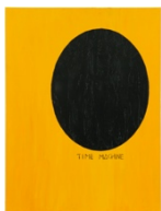
Time Machine (1) , 2011 Lacquer, oil on canvasboard 80 x 60 cm