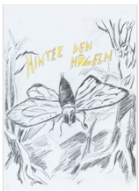
Hinter den Hügeln , 2004 Pencil, crayon on paper 29,5 x 21 cm