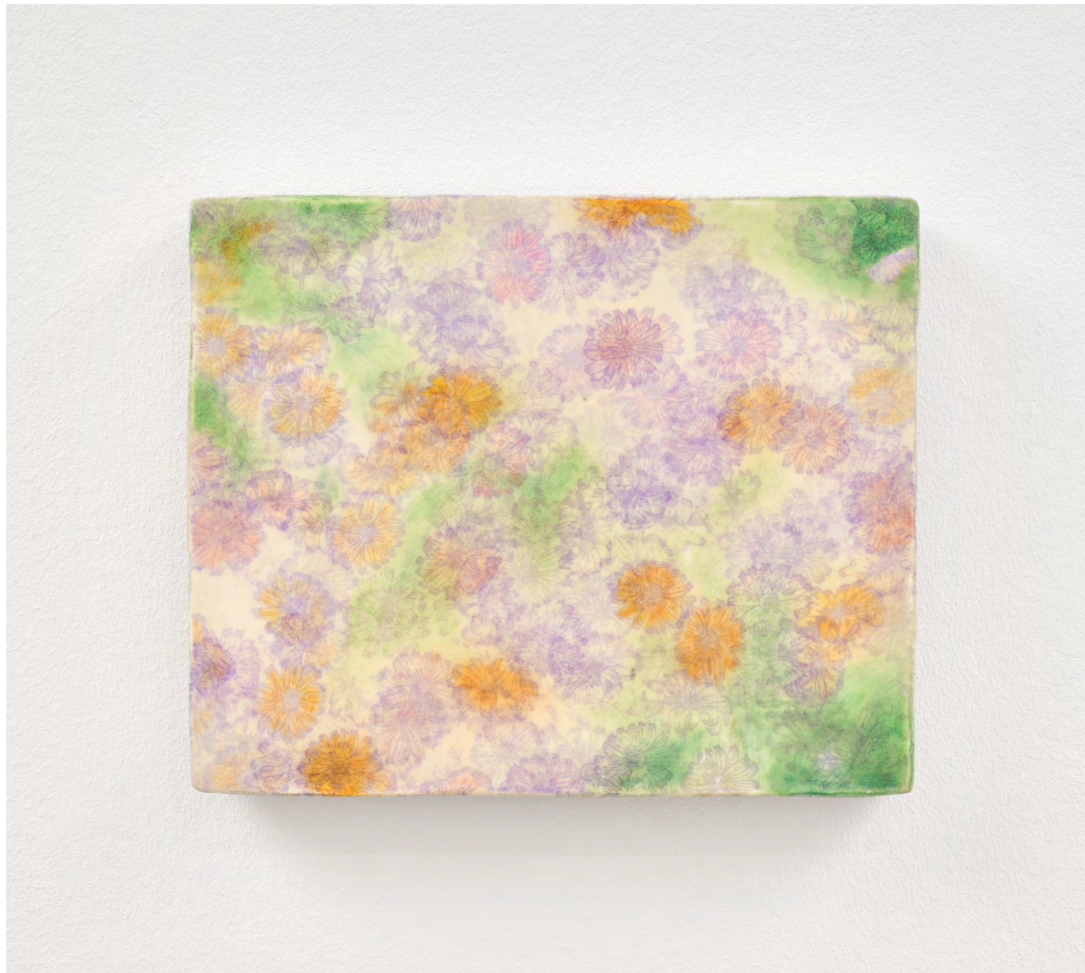
Falling flowers (inerti) #4 (2025)

Ink, acrylic resin, pigments and colour transfer from torn toilet paper on box cast of concrete, epoxy resin and marble dust, aluminium 26 x 32 x 4 cm