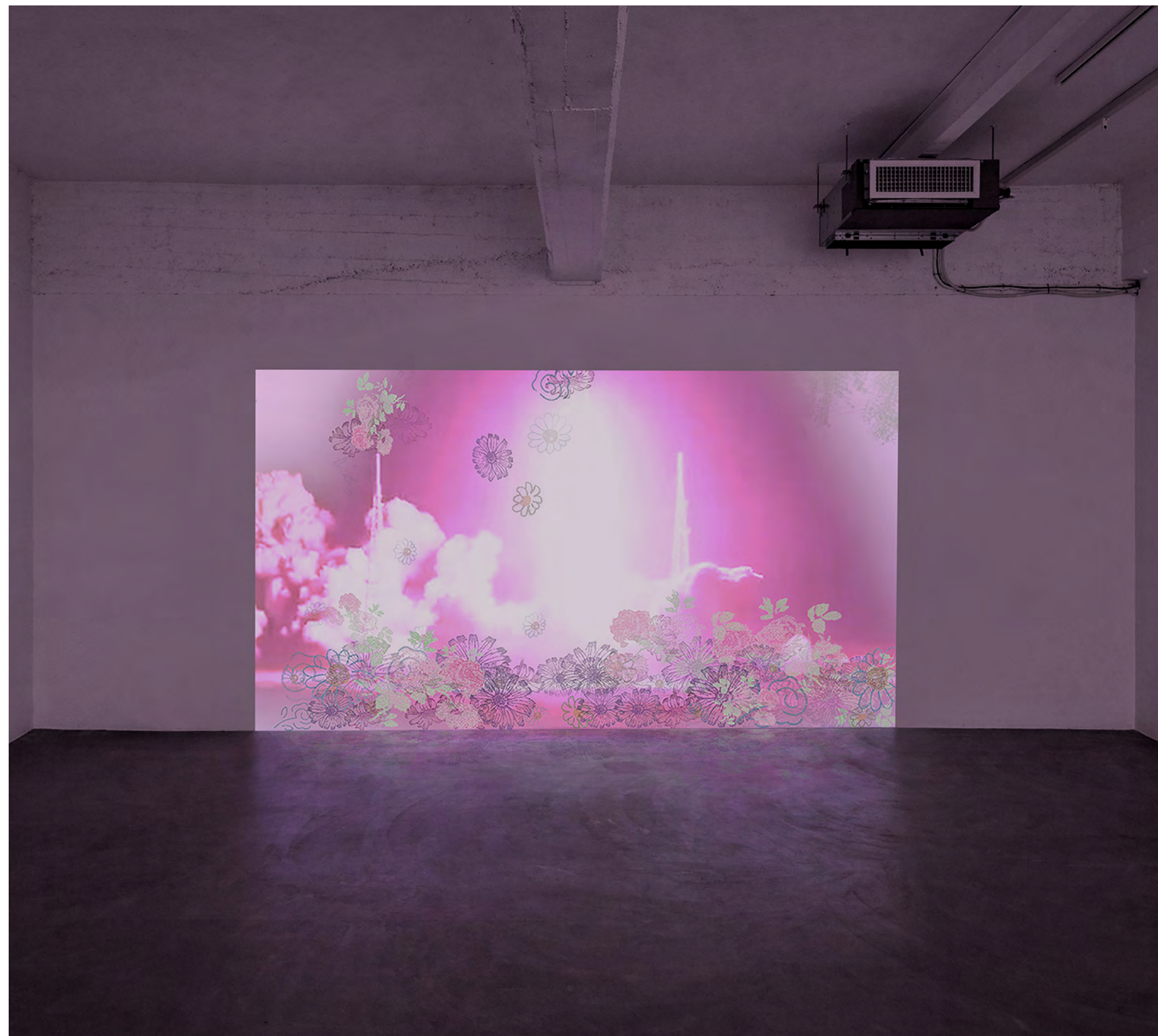
Falling flowers (2025) 4K video colour, 5.1 sound stereo Edition of 3 + 2APs 5'20"