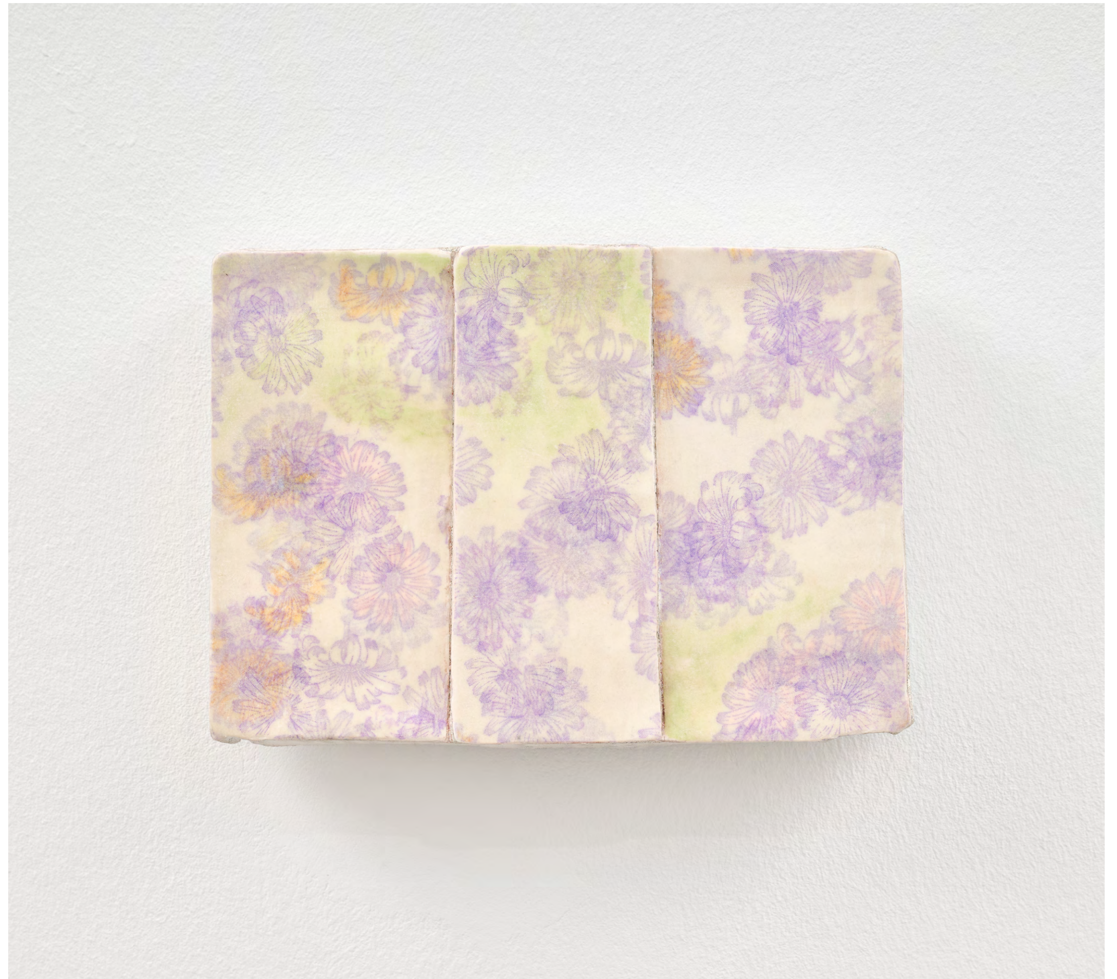
Falling flowers (inerti) #1 (2025)

Ink, acrylic resin, pigments and colour transfer from torn toilet paper on box cast of reinforced concrete, resin and marble dust, aluminium 18 x 26 x 6 cm