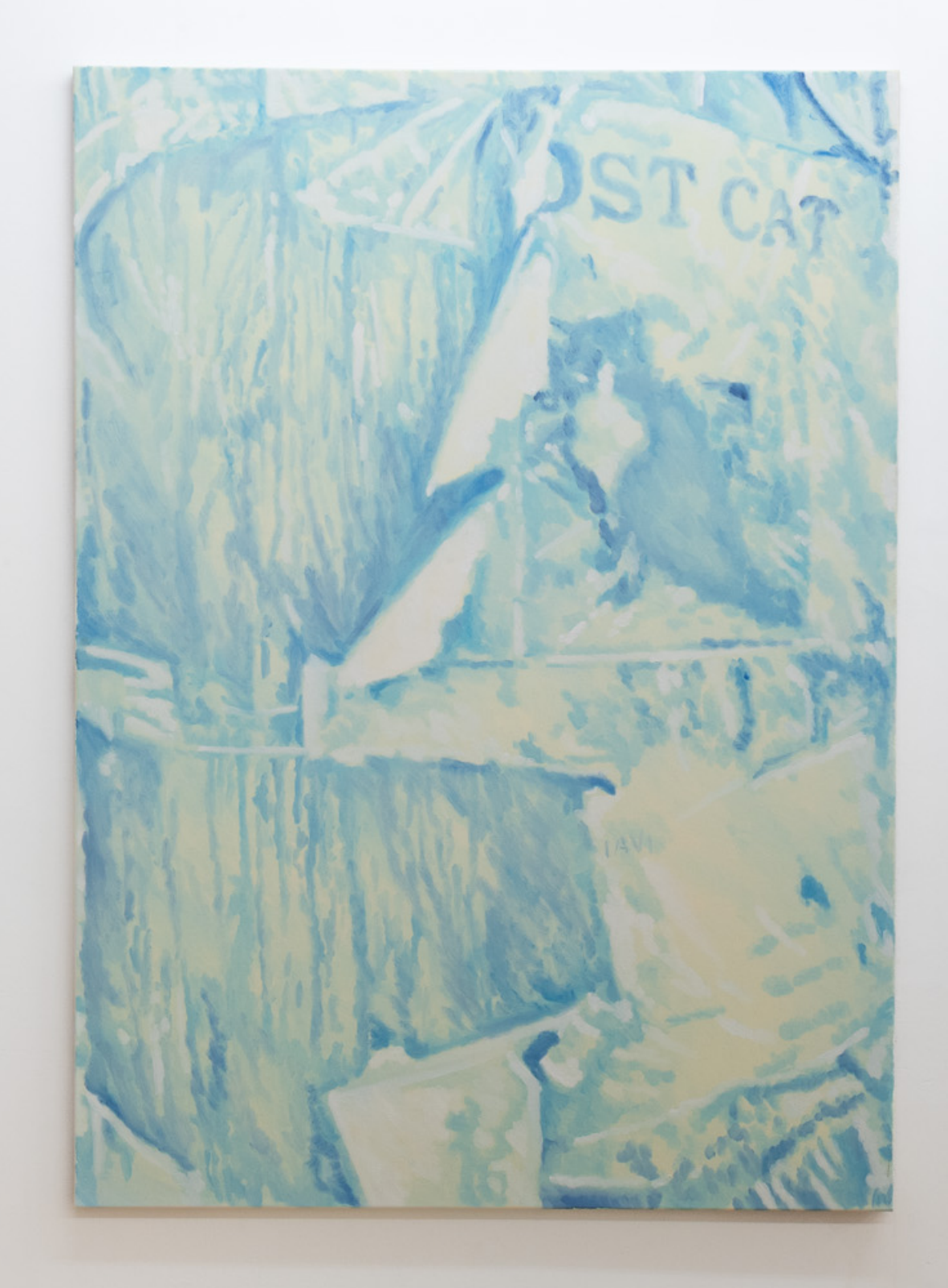
Telegraph pole, 2025 Oil on canvas 180 x 130 cm