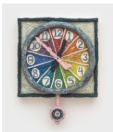
Jeni Spota C. Color Wheel Pendulum , 2025 Oil on canvas with aluminum clock hands, spray foam, and clock mechanism 27h x 20w in jspota033