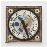
Jeni Spota C. Primo , 2025 Oil on canvas with aluminum clock hands, spray foam, spray paint, and clock mechanism 30h x 30w in jspota034