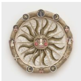
Jeni Spota C. Sun Clock , 2025 Oil on canvas with paper mache, birch ply, spray paint, aluminum clock hands, and clock mechanism 20 inch diameter jspota036