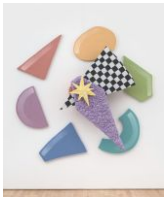
Jeni Spota C. Supreme , 2025 Clock mechanism, aluminum clock hands, cinefoil, wooden dowels, MDF board, molding paste, acrylic paint, spray foam, and spray paint 108h x 108w in jspota039