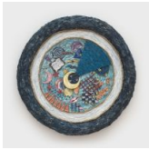
Jeni Spota C. Galaxy Triptych (Number 3) , 2025 Oil on canvas with clock mechanism, birch ply, and spray paint 25 inch diameter jspota031