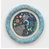
Jeni Spota C. Galaxy Triptych (Number 2) , 2025 Oil on canvas with clock mechanism, birch ply, and spray paint 25 inch diameter jspota030