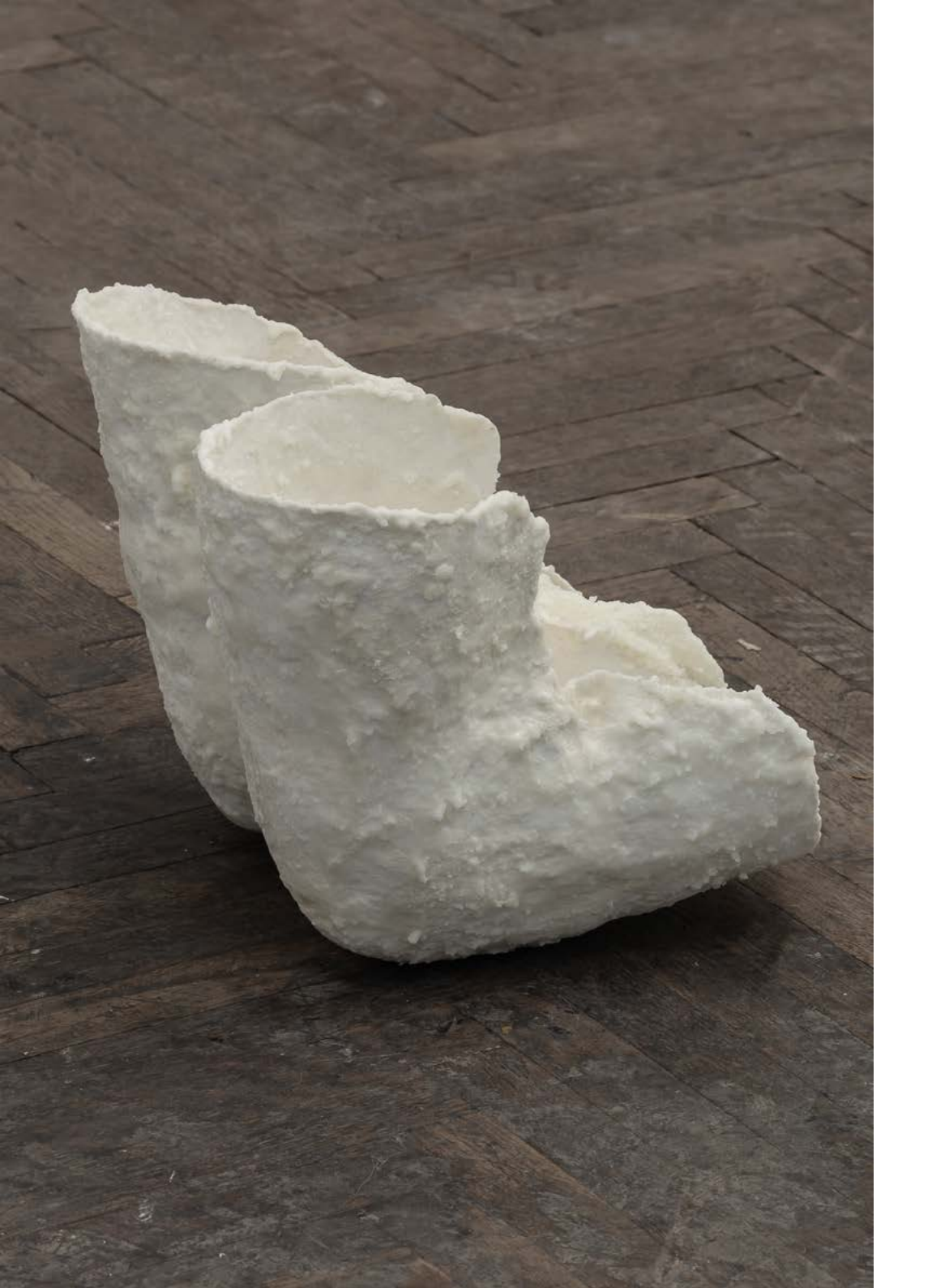
seguir (still), 2025 Plaster bandages, wax 21 x 26 x 21 cm