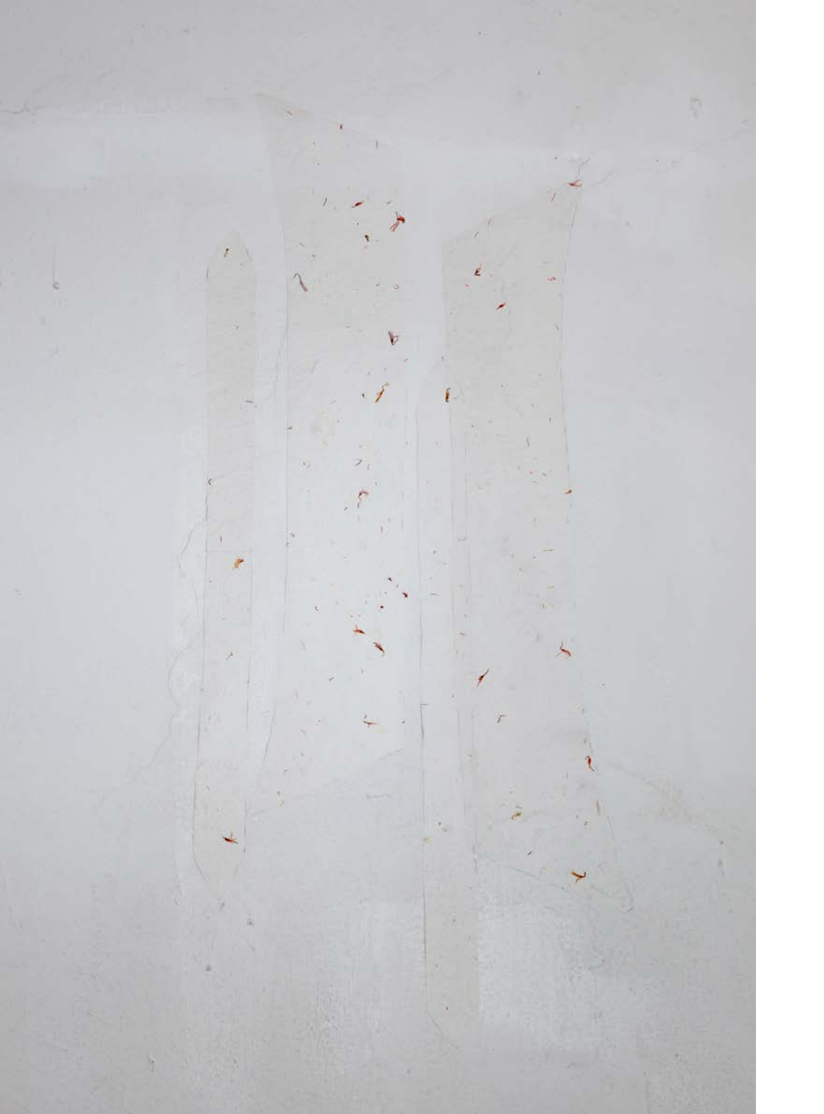
laringes, 2025 Rice paper and cellulose glue on wall 61 x 26 cm