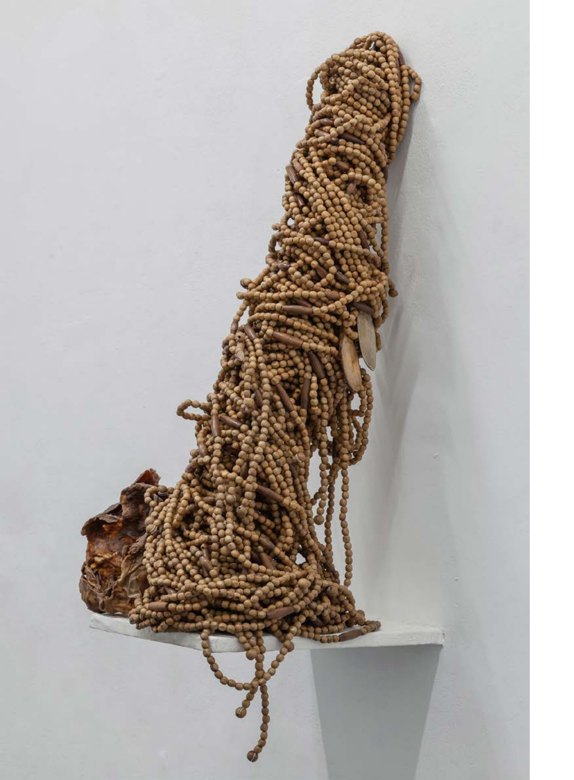
sin título (un dolor), 2025 Detail