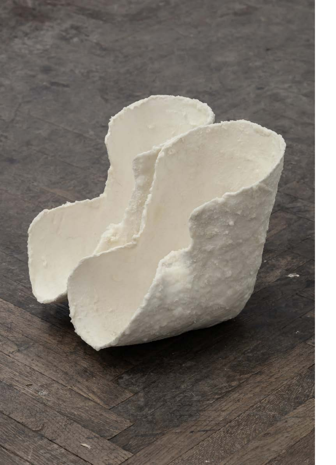
seguir (still), 2025 Detail