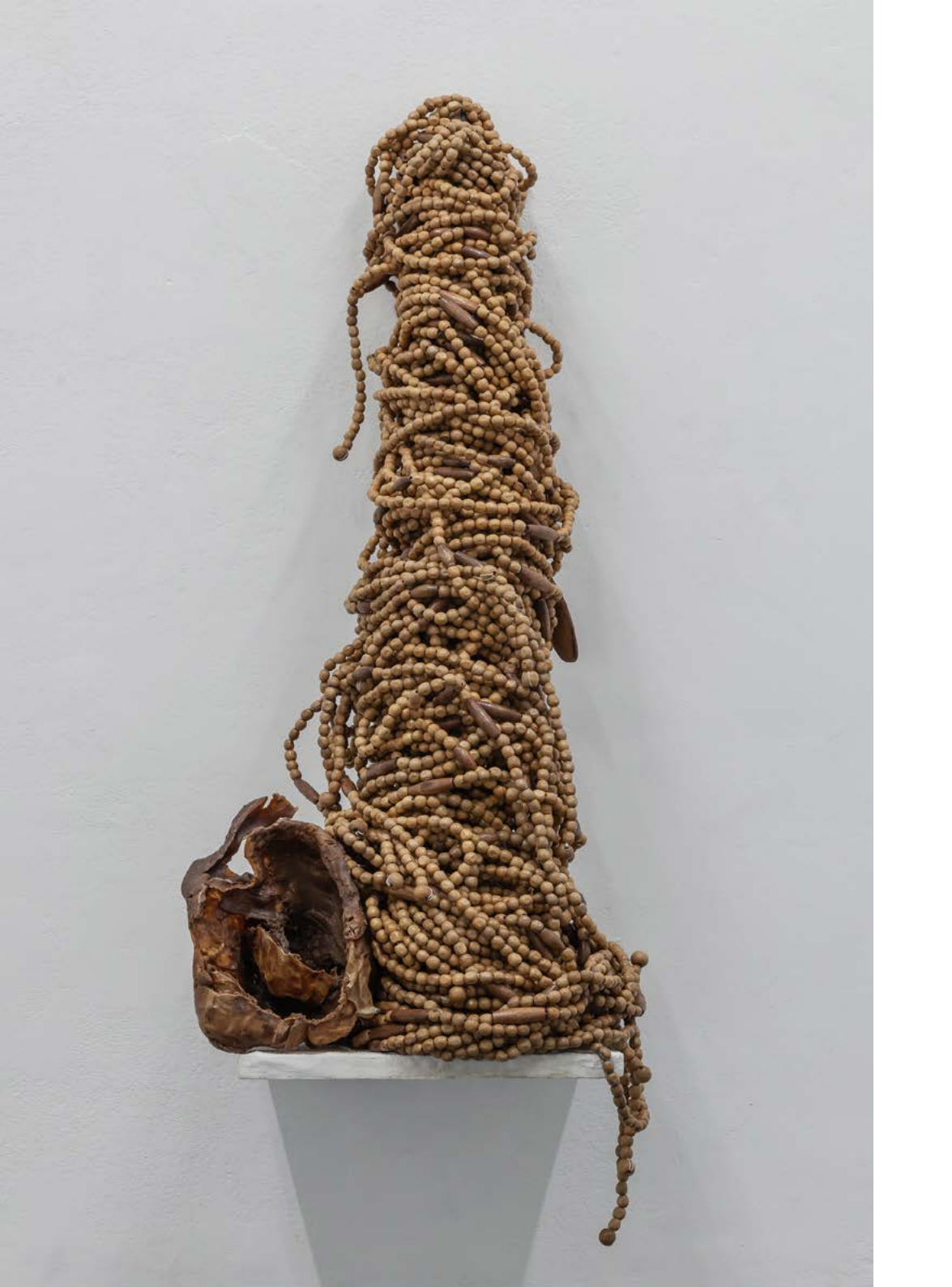
sin título (un dolor), 2025 Wood, silk, wax, flower 99 x 35 x 42 cm