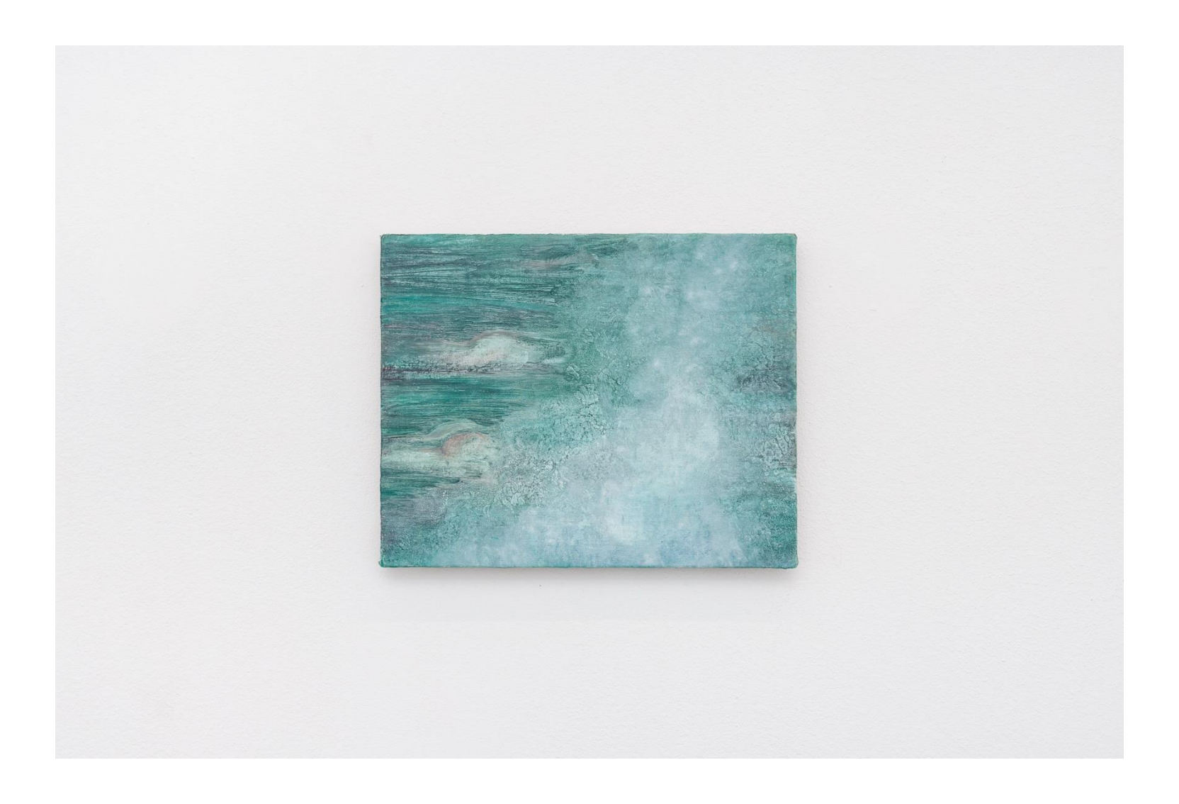
ANGELA BIDAK Floating Maids, 2024 Oil on linen over panel 20 x 25 cm