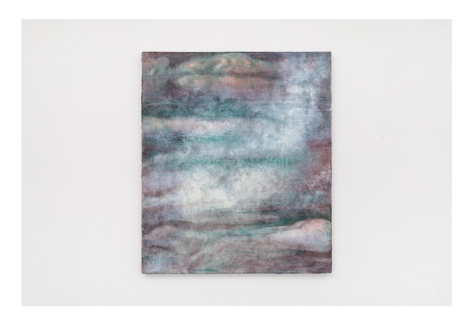
ANGELA BIDAK Shroud of Mist, 2024 Oil on linen 71 x 61 cm