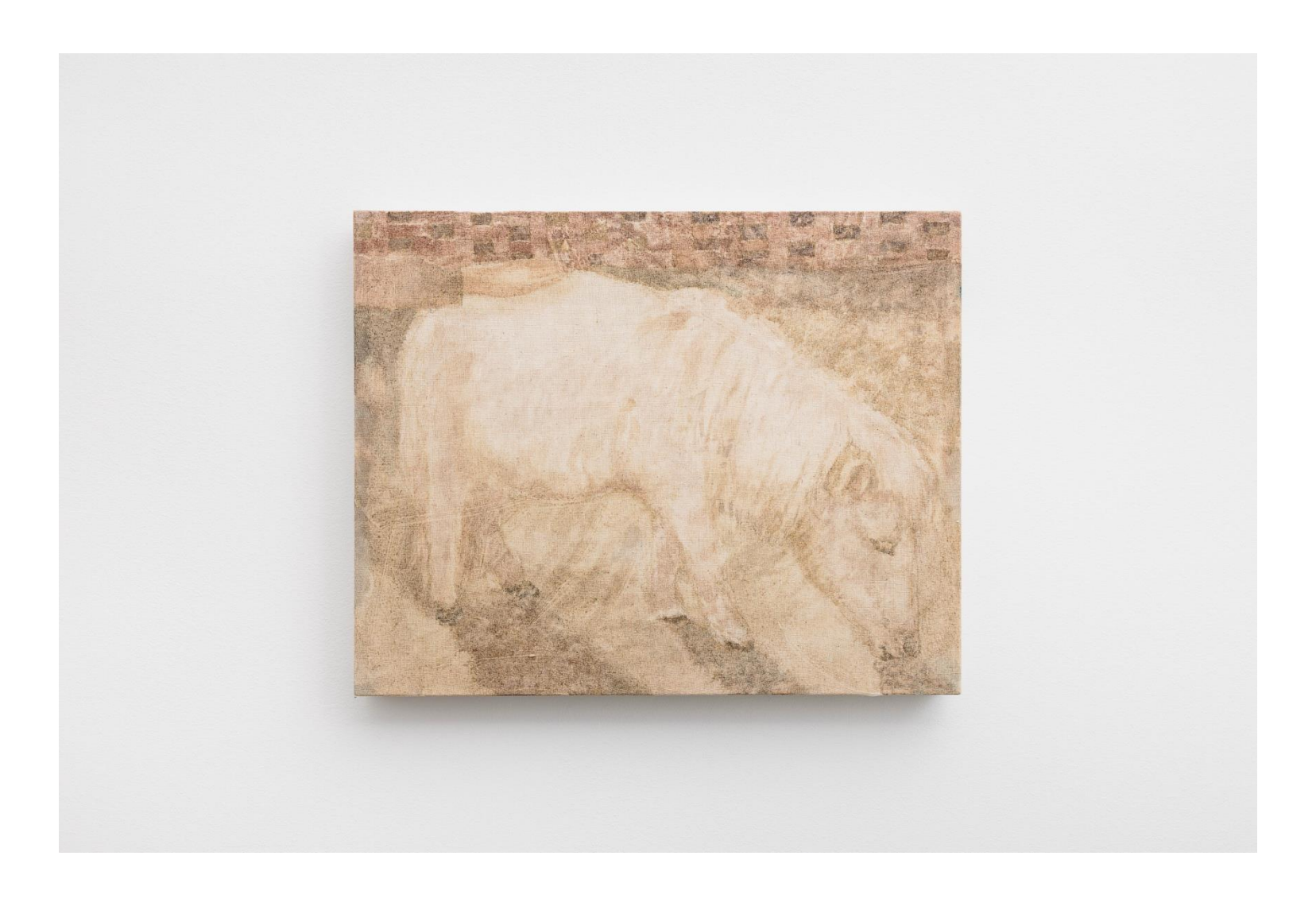
SONIA JIA Winter Pony, 2025 Oil on Canvas 40 x 50 cm