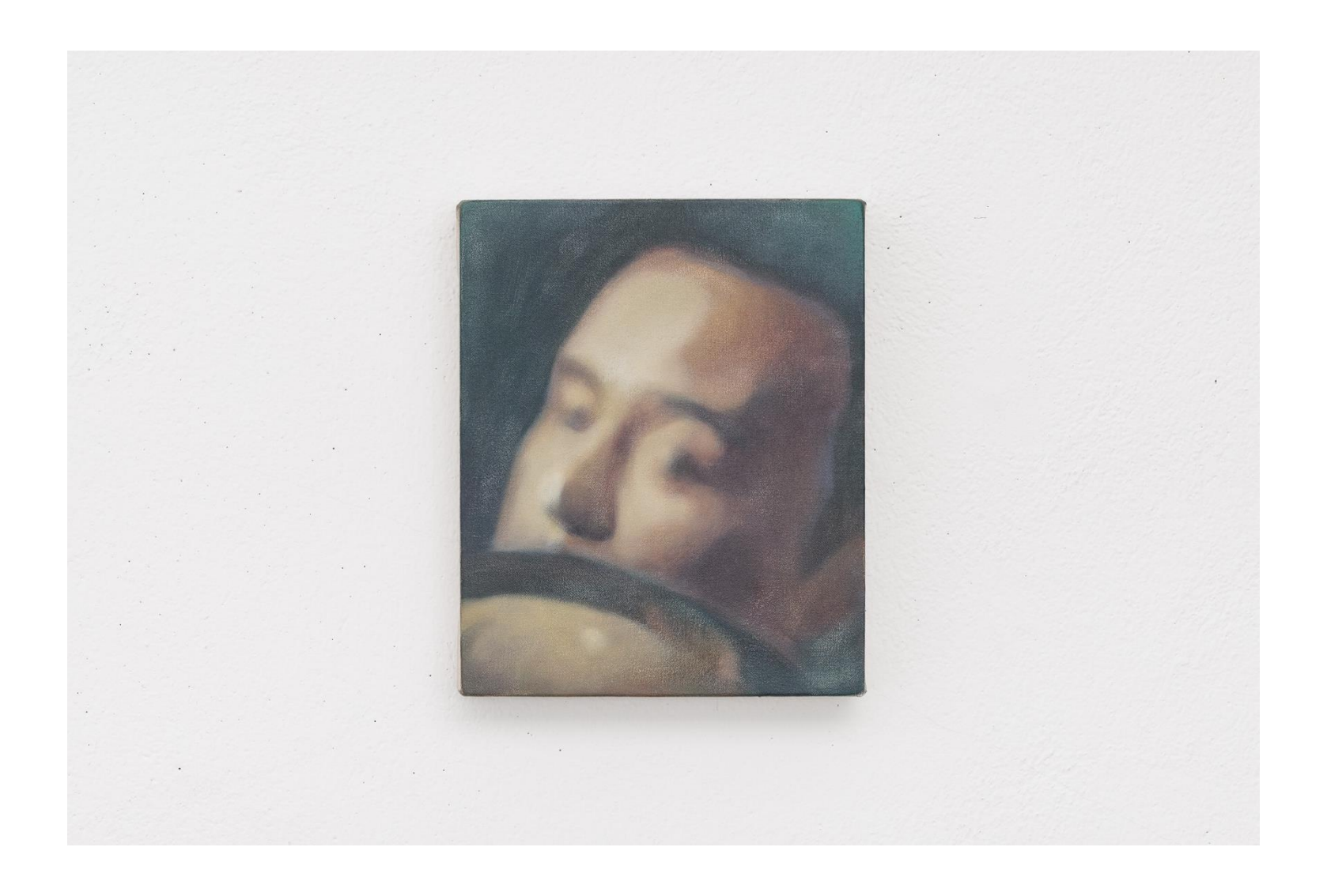
PEI WANG The Gaze, 2025 Oil on canvas 27 x 22 x 4 cm