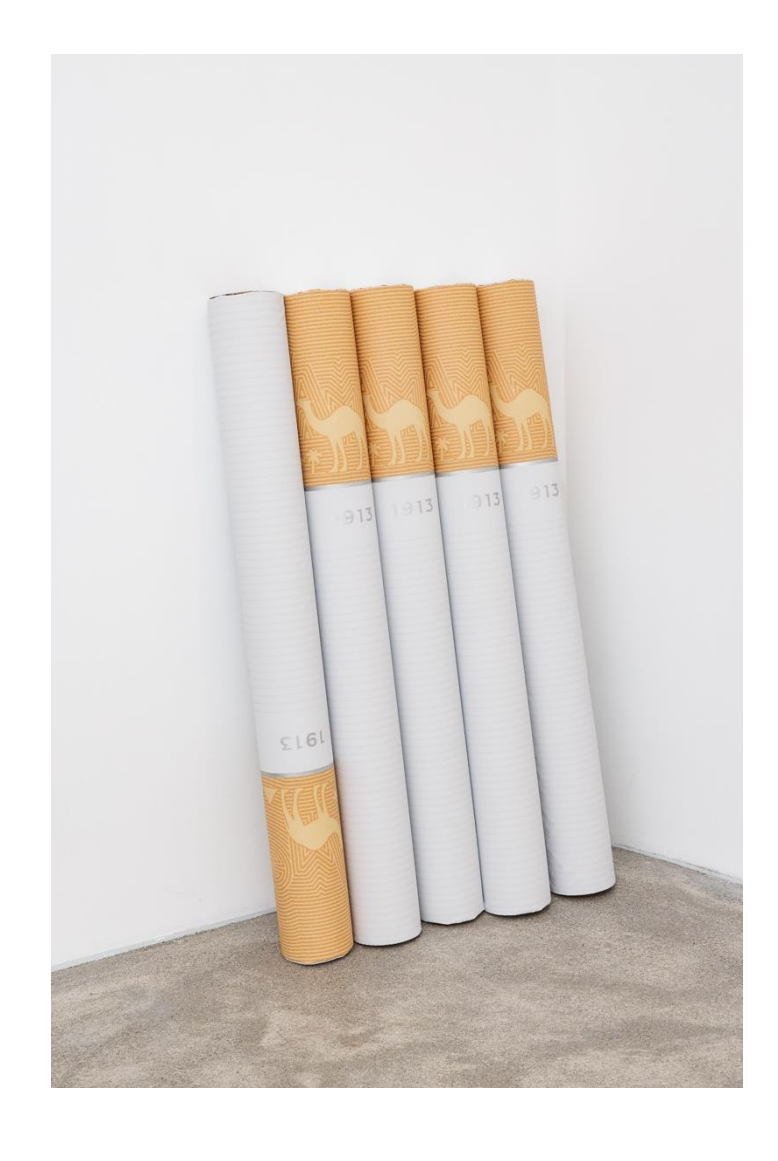
ADAM CRUCES Camel, 2024 Acrylic and UV print on polyester, polyurethane 135 x 15 cm (each) / 750 grams (each)