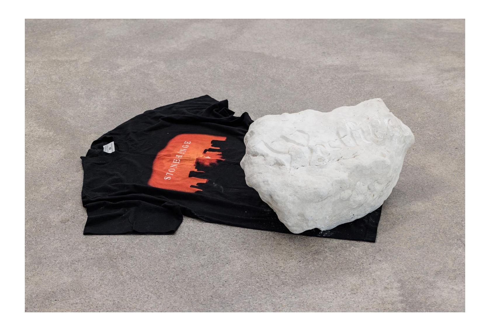
CORBIN SHAW Westfield, 2025 Chalk stone and T-shirt 45 x 33 x 17cm (stone)