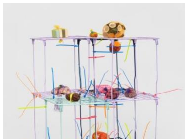
Veronica Ryan Scaffold (detail), 2021-2022 Metal shelf, bronze, zip ties, empty coffee pods, sculpey, hydrocal, beads, self-hardening clay, bandages, thread, fishing line, plastic net, embroidery ring 63 3/8 x 36 1/2 x 26 inches (161 x 92.7 x 66 cm)