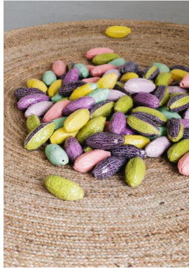
Veronica Ryan Sweet Dreams Are Made of These , 2022 Glazed ceramic stoneware, jute mat 5 7/8 × 83 7/8 × 83 7/8 inches (14.9 × 213 × 213 cm) © Veronica Ryan The Hepworth Wakefield