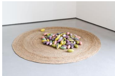
Veronica Ryan Sweet Dreams Are Made of These , 2022 Glazed ceramic stoneware, jute mat 5 7/8 x 83 7/8 x 83 7/8 inches (14.9 x 213 x 213 cm) © Veronica Ryan The Hepworth Wakefield