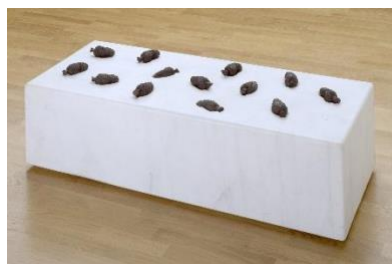
Veronica Ryan Quoit Montserrat , 1998 Tate, presented by the artist 2001 © Veronica Ryan