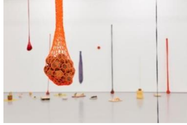
Veronica Ryan Along a Spectrum (2021) Installation view, Spike Island, Bristol Commissioned by Spike Island, Bristol and supported by Freelands Foundation