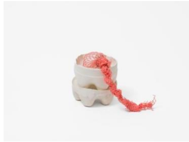
Veronica Ryan Collective Moments V , 2022 Plaster, hairnet and plastic bags 4 x 3 1/2 x 6 1/4 inches (10 x 9 x 16 cm) © Veronica Ryan, OBE RA Courtesy Alison Jacques, London