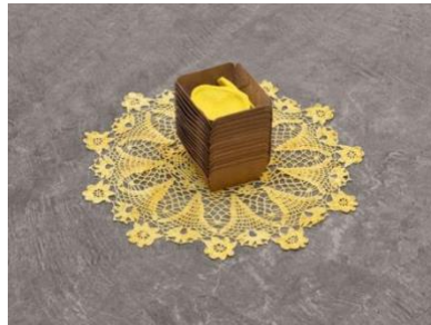
Veronica Ryan Infection VII (Punnet I) , 2020 Dyed thread doily, stacked cardboard mushroom boxes, stone casts 5 7/8 x 19 3/4 x 19 3/4 inches (15 x 50 x 50 cm) Photo: Steven Probert © Veronica Ryan, OBE RA Courtesy Paula Cooper Gallery, New York