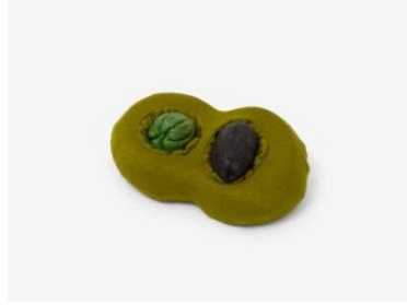
Veronica Ryan Momento Mori I , 2022 Bronze, reconfigured medical pillow 5 7/8 x 11 3/4 x 15 3/4 inches (15 x 30 x 40 cm) © Veronica Ryan, OBE RA Courtesy Alison Jacques, London