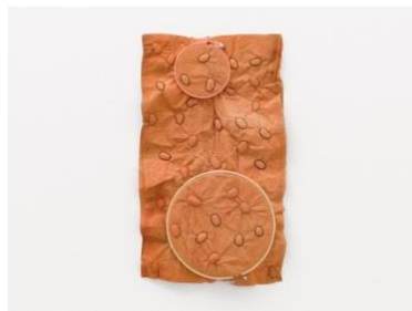
Veronica Ryan Collective Moments III , 2000/2022 Fabric, broad beans, thread, embroidery hoop 18 1/2 x 11 x 1 5/8 inches (47 x 28 x 4 cm) Fitzwilliam Museum, Cambridge © Veronica Ryan, OBE RA