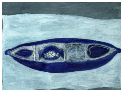
Veronica Ryan Territories , 1986 Oil and graphite on paper 21 4/15 x 29 2/15 inches (54.0 x 74.0 cm) [VR 1] © Veronica Ryan Courtesy of Paula Cooper Gallery Photo: Kettle's Yard