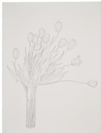
Jess T. Dugan Tulips, January 15, 2025, 2025 Pencil on paper 30 x 22 inches (76.2 x 55.9 cm) © Jess T. Dugan Photography by Robert Bullivant