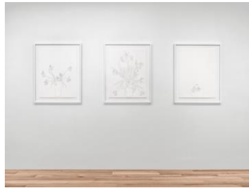
Installation view of Jess T. Dugan: I'm right here with you at the Pulitzer Arts Foundation, March 7–July 27, 2025. © Jess T. Dugan, Photograph by Alise O'Brien Photography. © Pulitzer Arts Foundation and Alise O'Brien Photography