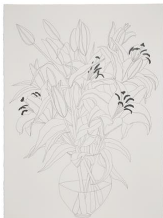
Jess T. Dugan Lilies , November 2, 2024, 2024 Pencil on paper 30 x 22 inches (76.2 x 55.9 cm) © Jess T. Dugan Photography by Robert Bullivant