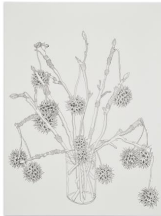
Jess T. Dugan Drawing #14 (Sweetgum) , December 22, 2023 Pencil on paper 9 x 12 inches (30.5 x 22.9 cm) © Jess T. Dugan Photography by Robert Bullivant