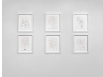
Installation view of Jess T. Dugan: I'm right here with you at the Pulitzer Arts Foundation, March 7–July 27, 2025. © Jess T. Dugan, Photograph by Alise O'Brien Photography. © Pulitzer Arts Foundation and Alise O'Brien Photography