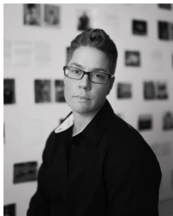
Portrait of Jess T. Dugan, 2021

Permission is contingent upon the artwork not being cropped, detailed, overprinted or altered; the work being fully credited; and the inclusion of the appropriate copyright notice adjacent to all reproductions. All reproductions must be printed in black and white or full color. Printing on colored paper/card stock or duotone printing is not authorized. Unless otherwise noted, for digital uses, reproductions shall be a maximum of 72 dpi with a dimension of no more