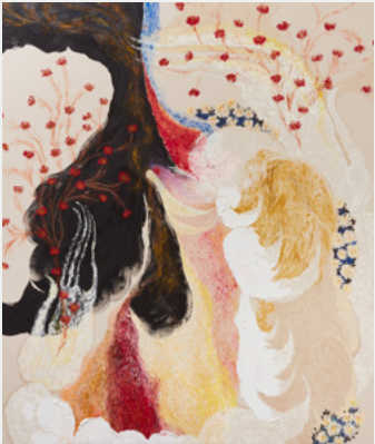
7 'But the one who becomes entirely pure and concave, who allows her entrance, will begin to dance with her and to say what she says and to dissolve within the ardent jewel of her presence'

2025 Gesso, marble dust, pigments, acrylic, linseed oil on canvas 198 x 173 cm