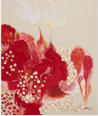
1 'One thousand biceps brachii contractions, under the guidance of ten soaring phalanxes'

2025 Gesso, marble dust, pigments, acrylic, linseed oil on canvas 204 x 173 cm