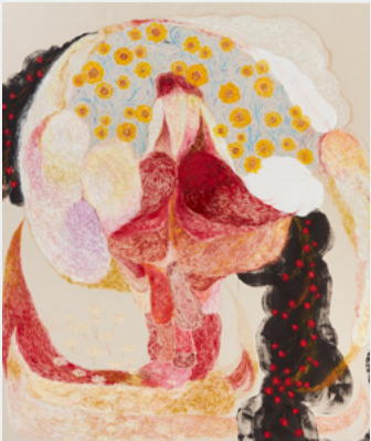
8 'I am the messenger of the permanent impermanence, and at the same time I am the resonance of the first shout'

2024 Gesso, marble dust, pigments, acrylic, linseed oil on canvas 197 x 173 cm