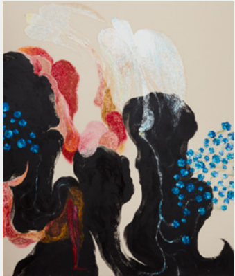
5 'They cannot be transmuted unless they are reduced into their first matter, and then they are transmuted into another form than that which they had before'

2024 Gesso, marble dust, pigments, acrylic, linseed oil on canvas 190 x 173 cm