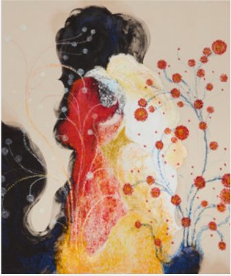
4 'The eyes of the celestial body are white with black pupils, like those of the two figures it overhangs in the purified land'

2024 Gesso, marble dust, pigments, acrylic, linseed oil on canvas 199 x 170 cm