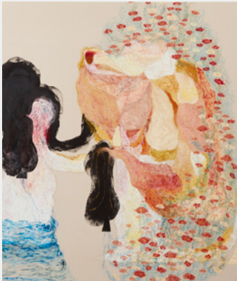
6 'You will cross the river of demented impulses, and once purified, reach the region where everything grows effortlessly'

2025 Gesso, marble dust, pigments, acrylic, linseed oil on canvas 201 x 174 cm