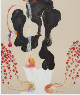
2 'What remains of me? The imperfect body that is converted into the first matter, a single gaze staring at nothing'

2025 Gesso, marble dust, pigments, acrylic, linseed oil on canvas 204 x 173 cm