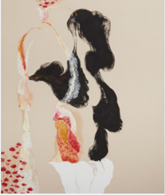
3 'In the axis of a total dance, the vivid water where the thirsty comes to drink '

2024 Gesso, marble dust, pigments, acrylic, linseed oil on canvas 202 x 175 cm