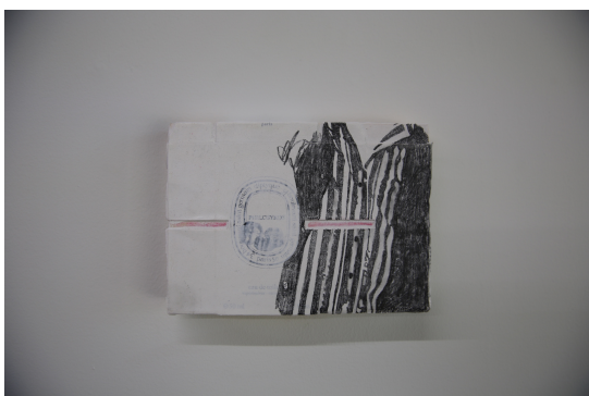
Em Davenport perfume drawing (stripes) graphite on mounted perfume box 5 x 7 in. 2025