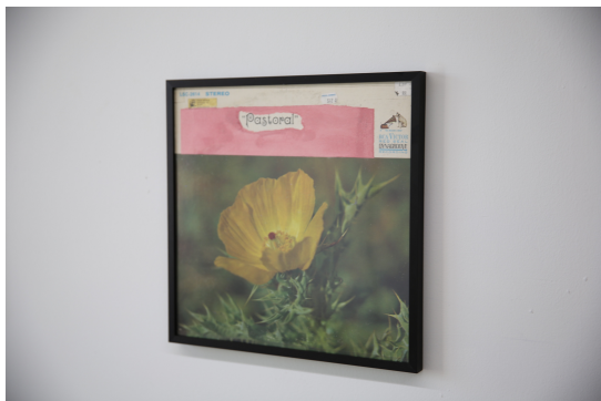
Em Davenport LP (pastoral) paper on LP with frame 12 x 12 in. 2025