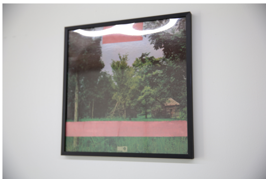
Em Davenport LP (music country) paper on LP with frame 12 x 12 in. 2025