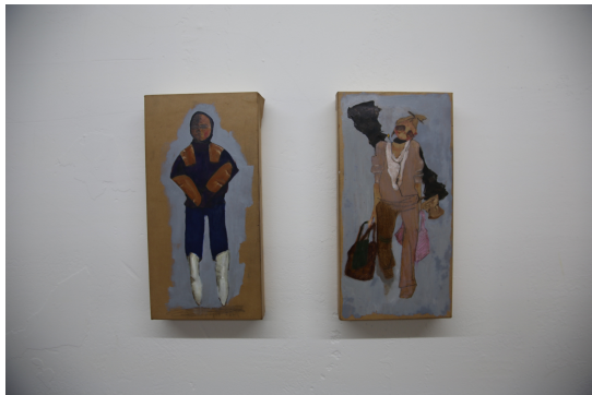
Sasha Miasnikova Expansive (diptych) oil and pencil on paper on panel 12 x 12 in. 2025