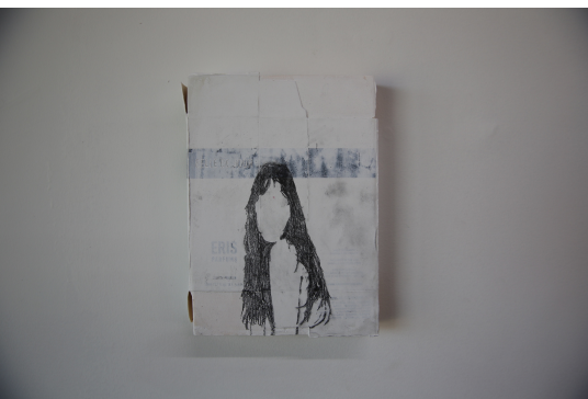
Em Davenport perfume drawing (belle de jour) graphite on mounted perfume box 5 x 7 in. 2025