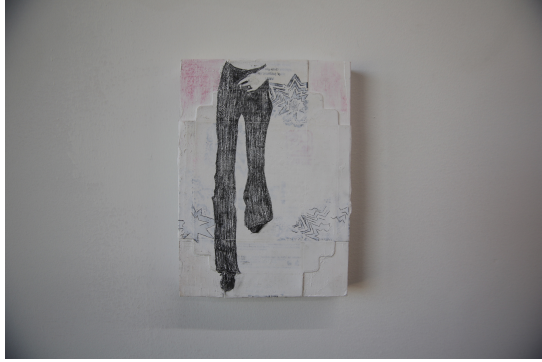
Em Davenport perfume drawing (a good pair of jeans) graphite on mounted perfume box 5 x 7 in. 2025