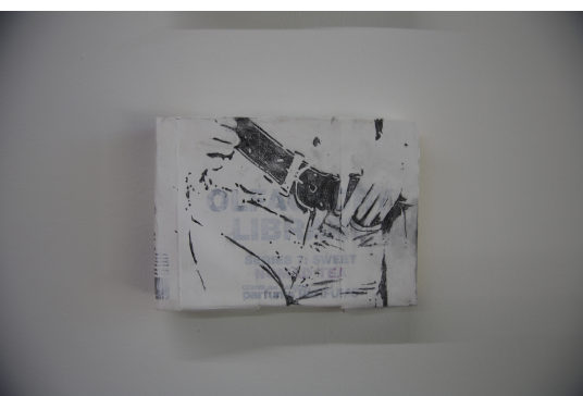
Em Davenport perfume drawing (daisy duke) graphite on mounted perfume box 5 x 7 in. 2025