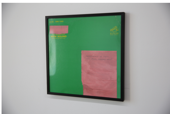
Em Davenport LP drawing (new sound) paper on LP with frame 12 x 12 in. 2025