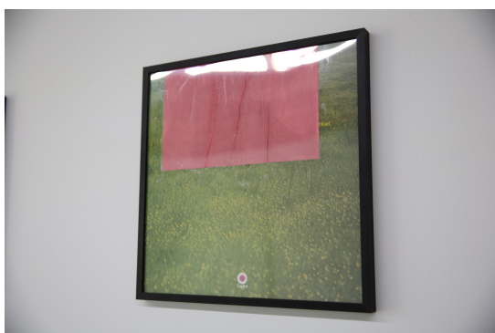
Em Davenport LP (head) paper on LP with frame 12 x 12 in. 2025