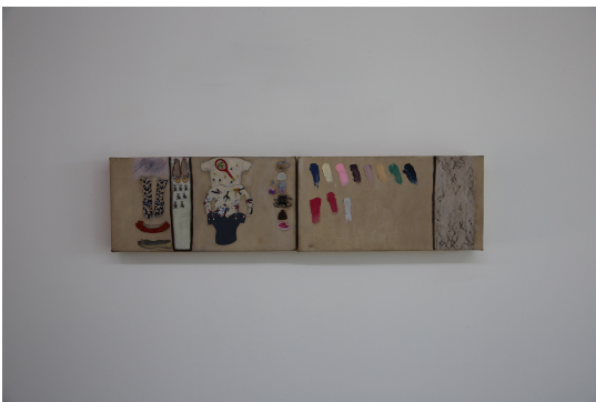
Sasha Miasnikova These things first (swatches) oil and pencil on paper on panel 6 x 24 in. (diptych) 2025