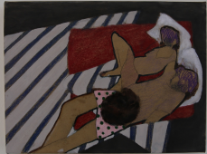
Sasha Miasnikova Copacetic oil and pencil on paper on panel 9 x 12 in. 2025

Em Davenport & Sasha Miasnikova Good Consumer 4.07.25 - 5.10-25 Jessamine