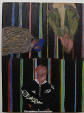
Sasha Miasnikova Floor hang (boys) oil and pencil on paper on panel 12 x 9 in. 2025