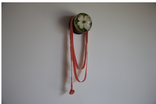
Em Davenport smelling the state flower wood, paperweight, bubble tape, and sterling earring 10.5 x 4.5 x 4 in. 2025