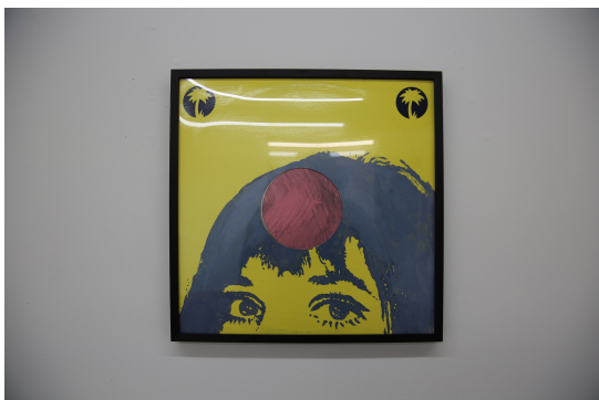
Em Davenport LP painting (yellow) oil and paper on LP with frame 12 x 12 in. 2025