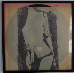
Em Davenport LP drawing (come here) graphite on LP sleeve with frame 12 x 12 in. 2025