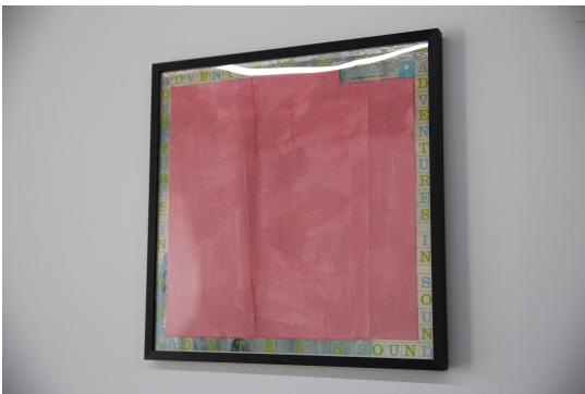
Em Davenport LP (adventures in sound) oil on paper LP with frame 12 x 12 in. 2025