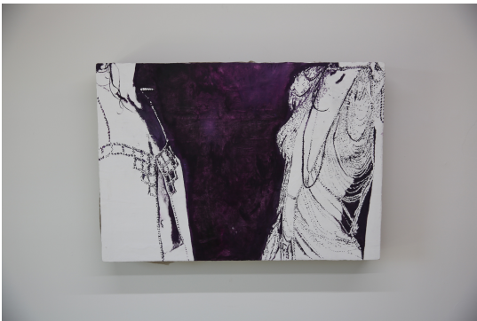
Em Davenport a publicité oil on linen 25 x 35.5 x 4.5 in. 2025