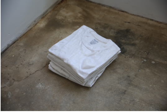
Sasha Miasnikova 6-pack wax and fabric 11 x 10.5 x 3.5 in. 2025