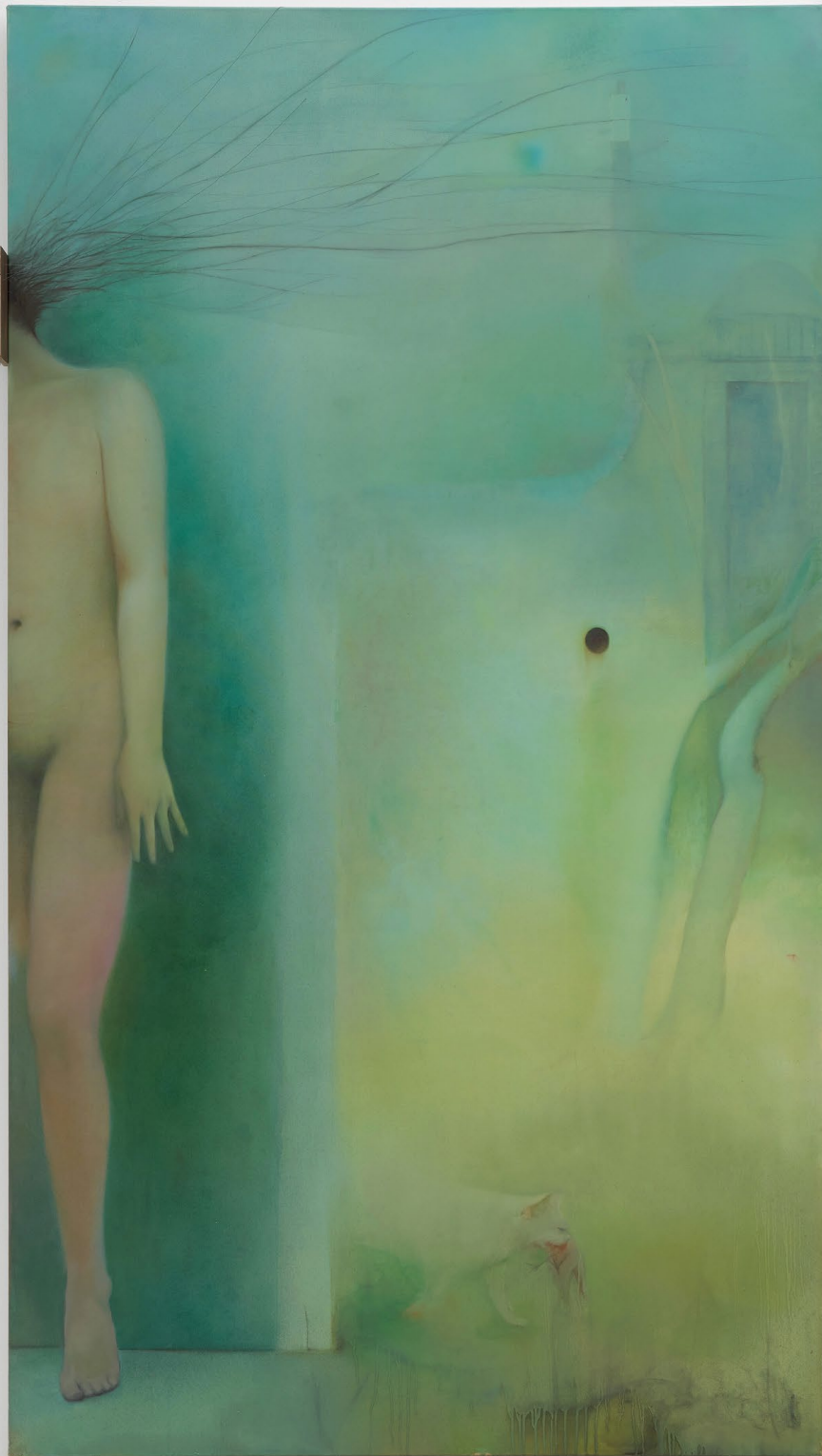
Builders of an Endless Echo, 2025 oil, acrylic, pencil, thread, and wood on canvas 183 x 102 cm