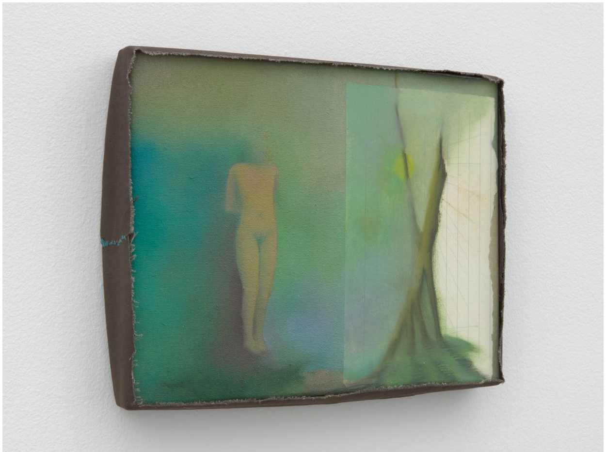
A Murderer's Dream VII , 2025, oil, acrylic, pencil and paper on canvas with artist's frame, 20.5 x 26 cm