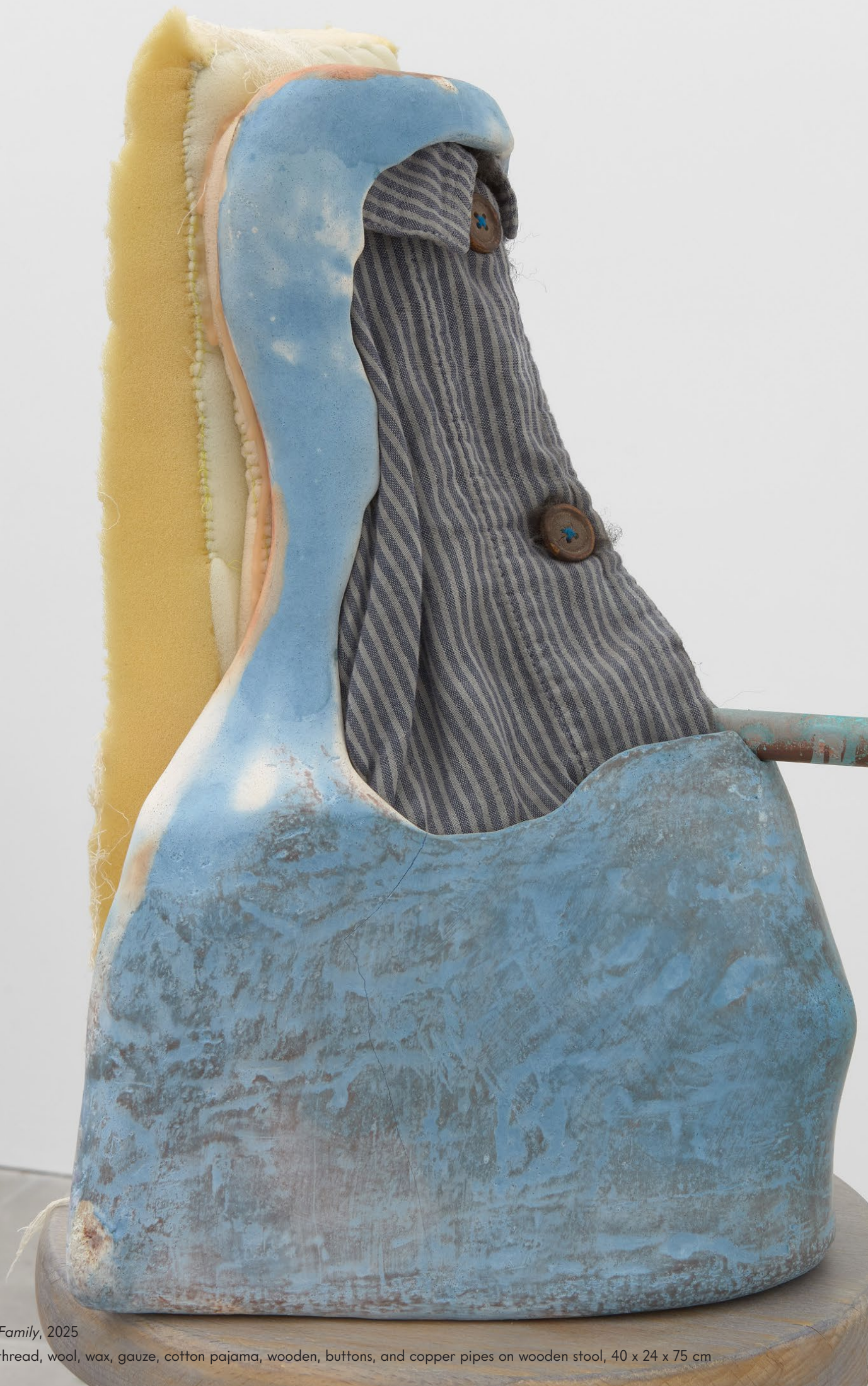
Youngest in the Family, 2025

ceramic, foam, thread, wool, wax, gauze, cotton pajama, wooden, buttons, and copper pipes on wooden stool, 40 x 24 x 75 cm