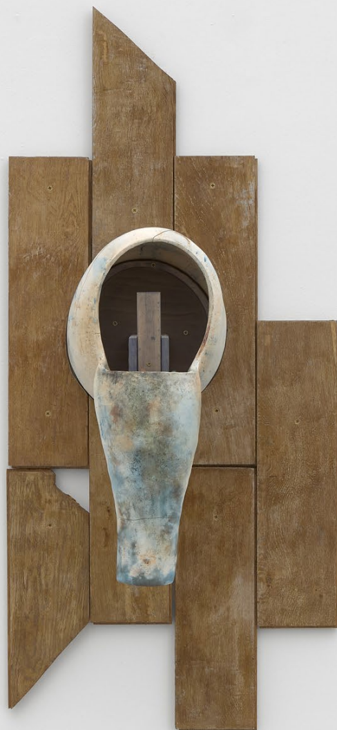
G.radual, H.idden, M.assive, 2025 ceramic, copper, pipes, wood, screws, and wooden floorings 74 x 40 x 50 cm