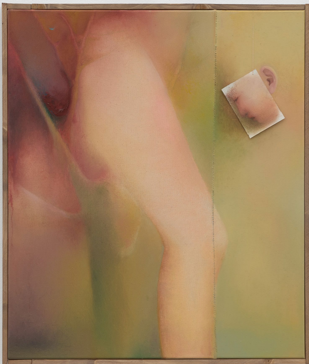
II, 2025 oil, acrylic, pencil, pastel, thread and paper on canvas 65 x 55 x 2 cm