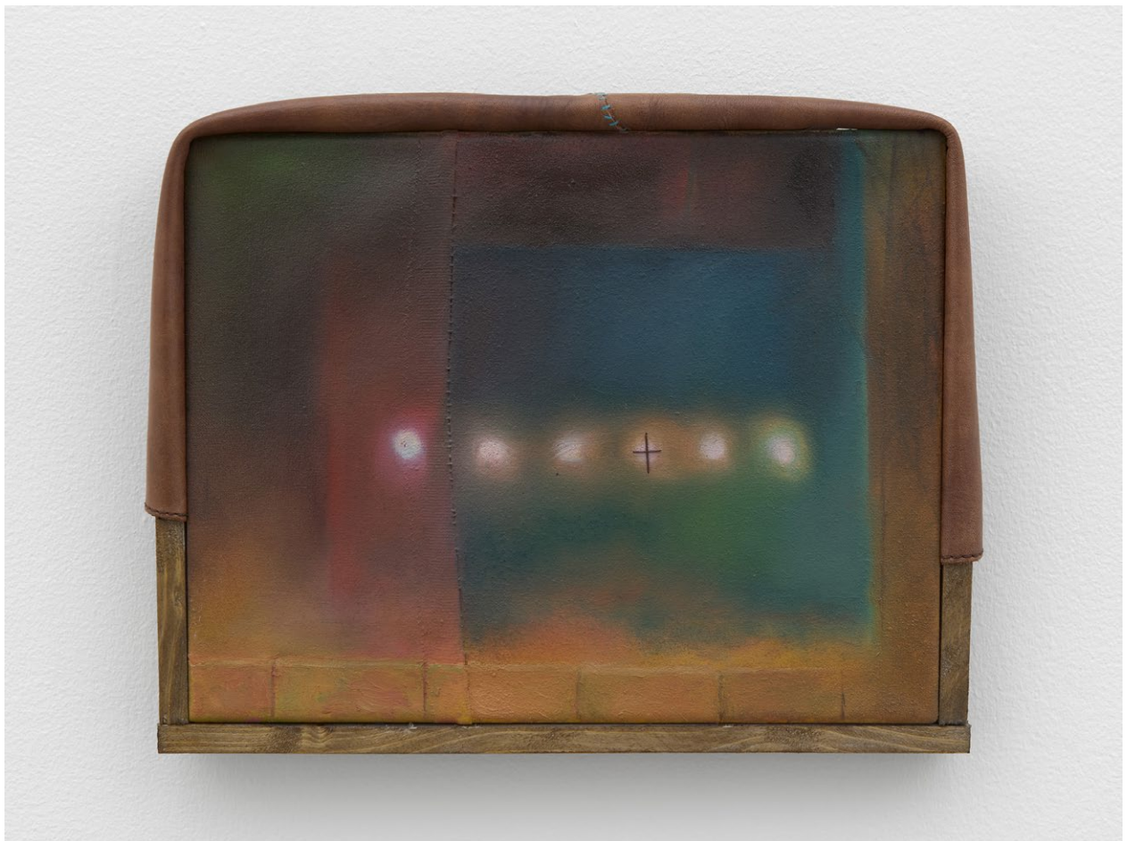
20241222(sun) , 2025, oil, acrylic, and thread on canvas with the artist's frame, 20.5 x 26 cm