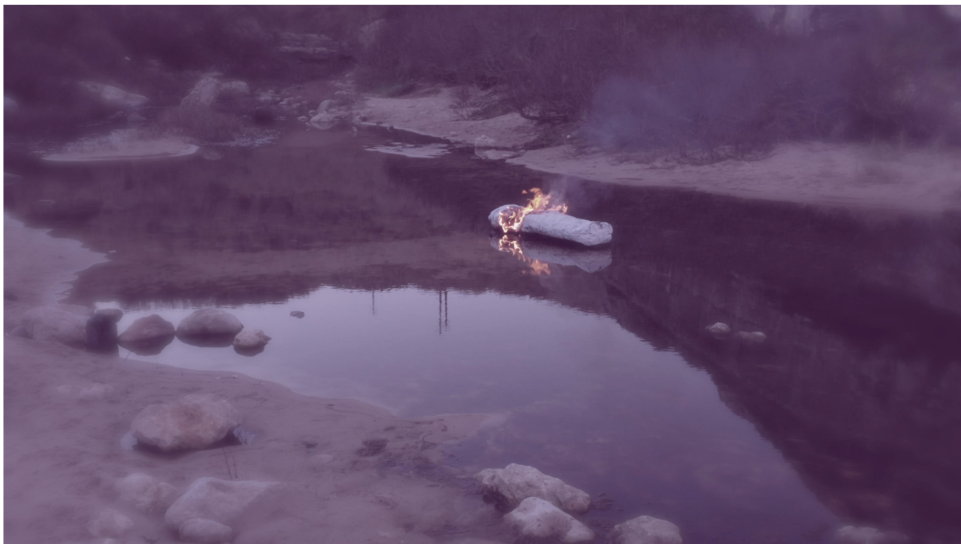
Mar de Fé (2020), 3-Kanal-Video-Installation, 4K, Videostill.

SWAMPING (2024 - 2025) explores how changing ecologies manifest themselves in artistic practice. In addition to a selection of new and existing works by established and emerging international visual artists, artists from various disciplines as well as ecologists and activists are invited to create an artistic sensibility and imagination for an ecological past, present and future. In this project, the Kunstverein has set itself the task of developing public awareness of the principle of moorland and swamping as an ecological strategy.