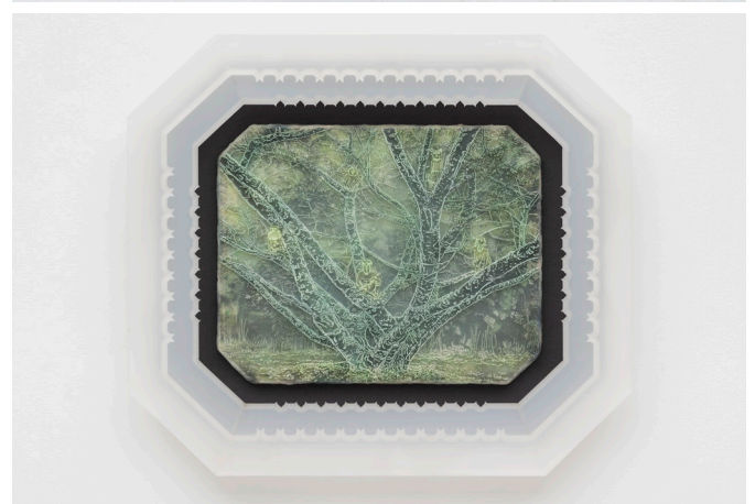
1 Prole , 2023, exhibition view, Galerie Fons Welters, Amsterdam; 2 Inga with Birds (Prosthetic Painting series) , 2023, prosthetic rubber, pigments, wood frame, thread, felt fabric, translucent acrylic, nylon, print, ink, graphite, iron powder, aluminum, screws, 68 x 77,5 x 7 cm.