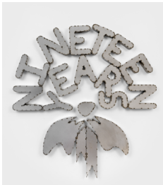
Nineteen Years, 2024