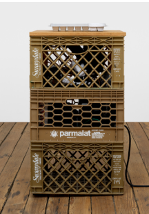
Ice Tray, 2024

Machined aluminum, water, wood, milk crates, refrigeration unit, electrical components