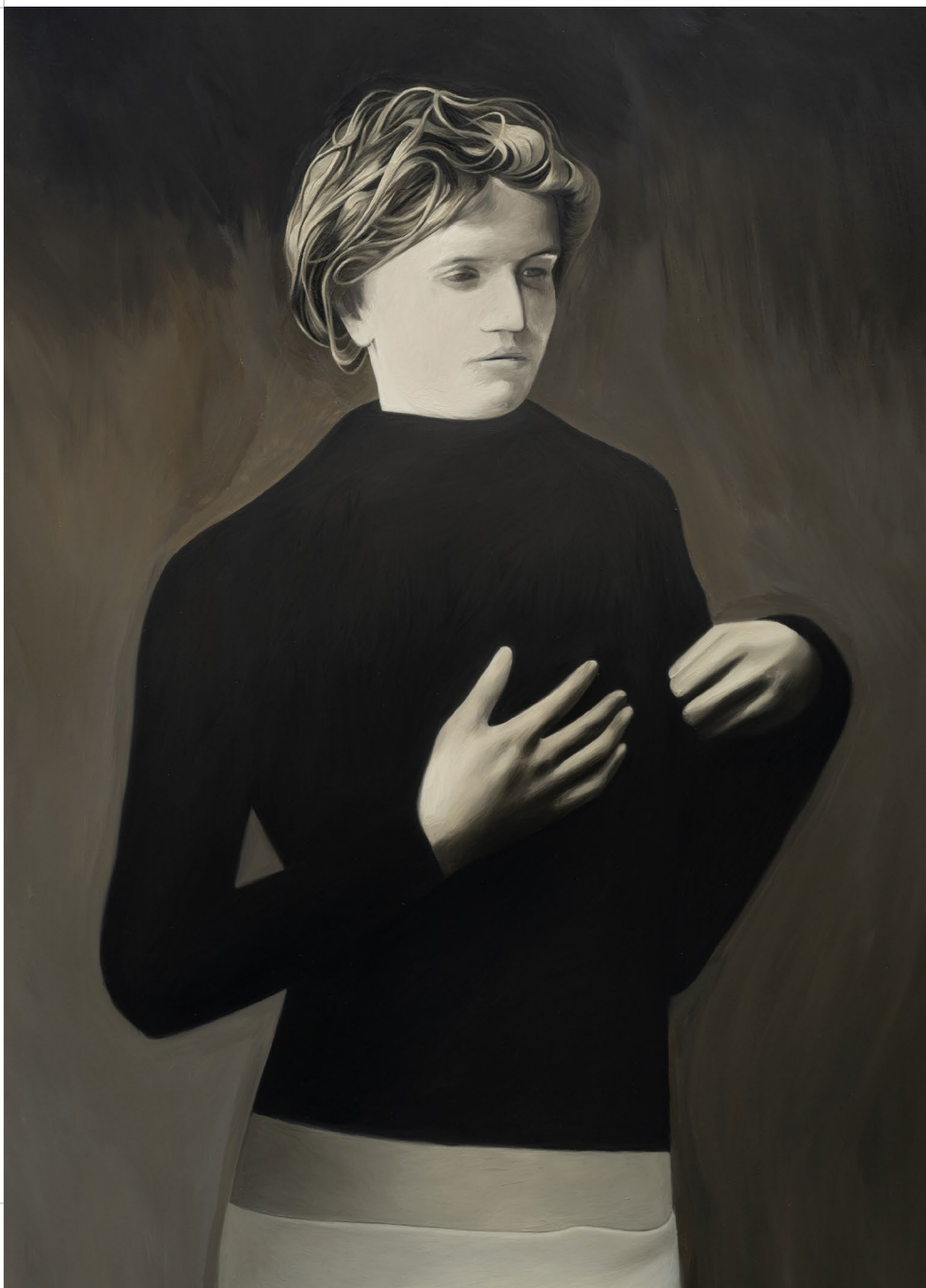
Arthur Marie Clair de Jour (detail) 2025

Oil on canvas 150 x 80 cm 59 x 31 1/2 in