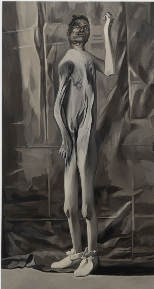
Arthur Marie Moongazer 2025

Oil on canvas 150 x 80 cm 59 x 31 1/2 in