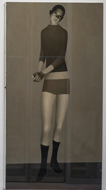
Arthur Marie Silhouettes Installation view, 2025 Passage Sainte-Anne, Paris