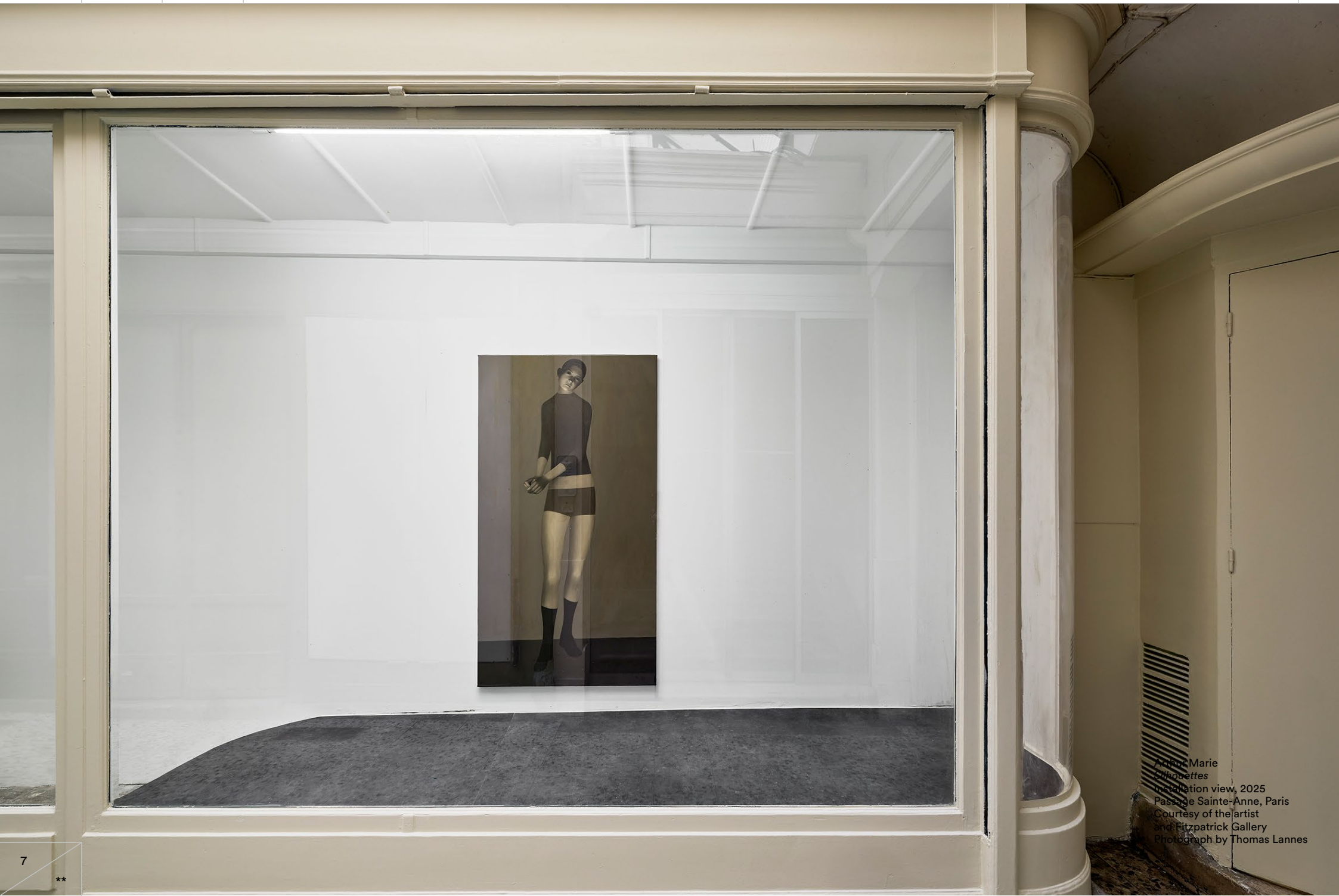
Arthur Marie Silhouettes Installation view, 2025 Passage Sainte-Anne, Paris