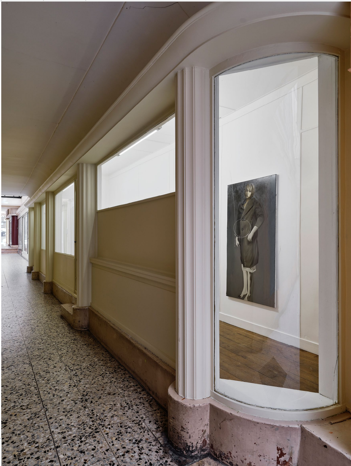
Arthur Marie Silhouettes Installation view, 2025 Passage Sainte-Anne, Paris Courtesy of the artist and Fitzpatrick Gallery Photograph by Thomas Lannes