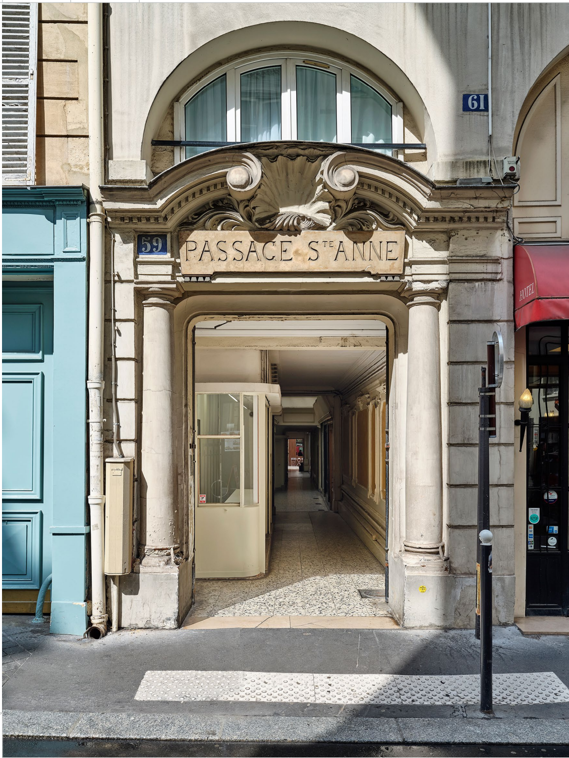
Arthur Marie Silhouettes Installation view, 2025 Passage Sainte-Anne, Paris