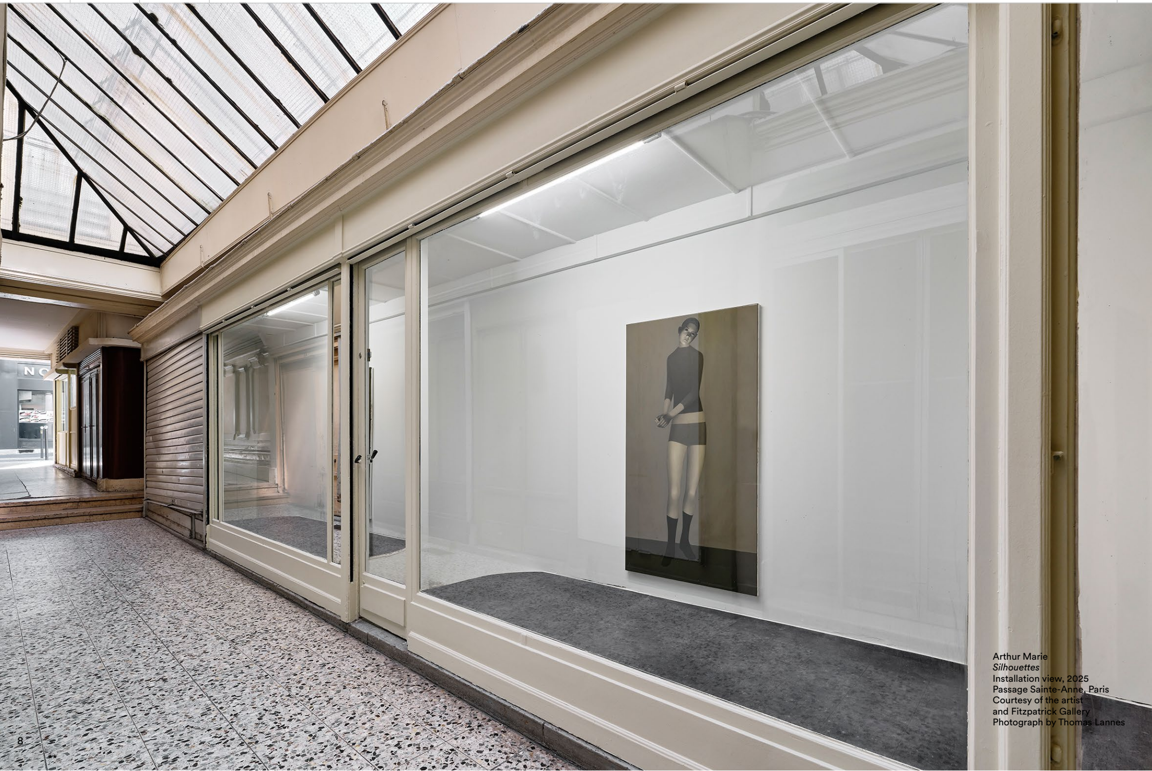
Arthur Marie Silhouettes Installation view, 2025 Passage Sainte-Anne, Paris Courtesy of the artist and Fitzpatrick Gallery Photograph by Thomas Lannes