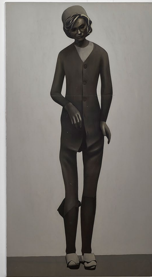
Arthur Marie Silhouettes Installation view, 2025 Passage Sainte-Anne, Paris