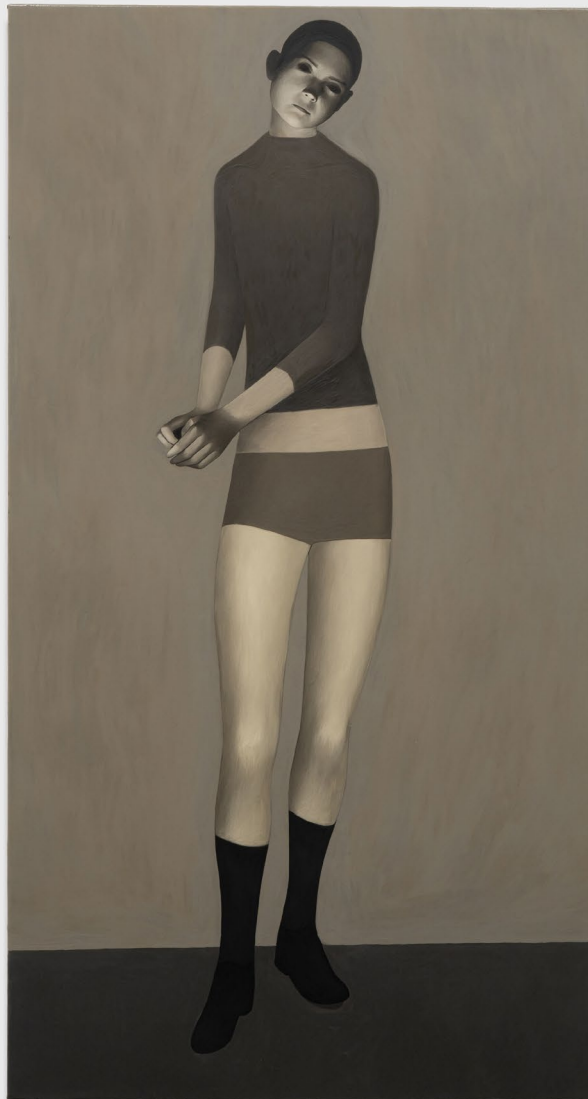
Arthur Marie L'Air du Soir 2025

Oil on canvas 150 x 80 cm 59 x 31 1/2 in