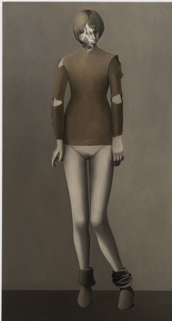
Arthur Marie Leatherface 2025

Oil on canvas 150 x 80 cm 59 x 31 1/2 in