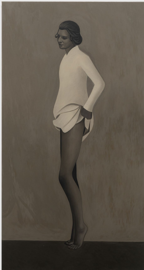
Arthur Marie White Dress 2025

Oil on canvas 150 x 80 cm 59 x 31 1/2 in