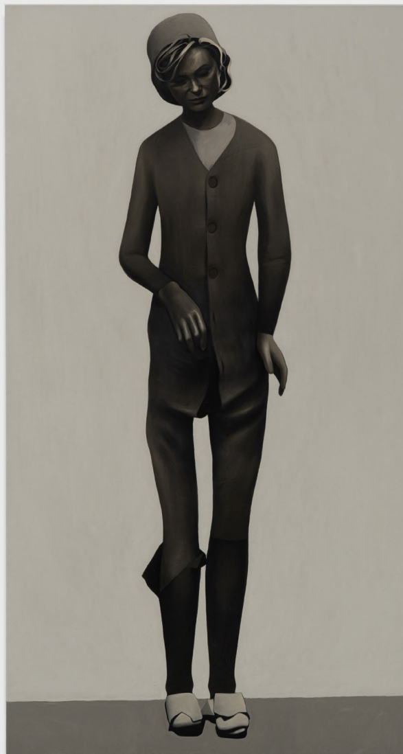
Arthur Marie The Gleaner 2025

Oil on canvas 150 x 80 cm 59 x 31 1/2 in