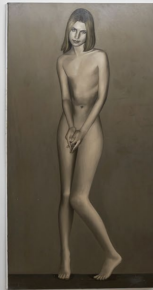
Arthur Marie Silhouettes Installation view, 2025 Passage Sainte-Anne, Paris