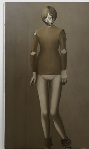
Arthur Marie Silhouettes Installation view, 2025 Passage Sainte-Anne, Paris