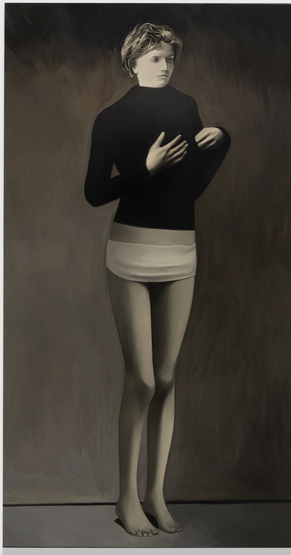
Arthur Marie Clair de Jour 2025

Oil on canvas 150 x 80 cm 59 x 31 1/2 in