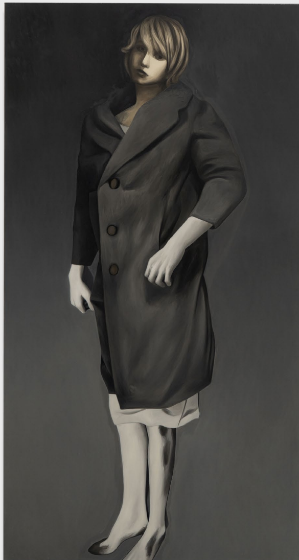
Arthur Marie Woman in a Wool Coat 2025

Oil on canvas 150 x 80 cm 59 x 31 1/2 in