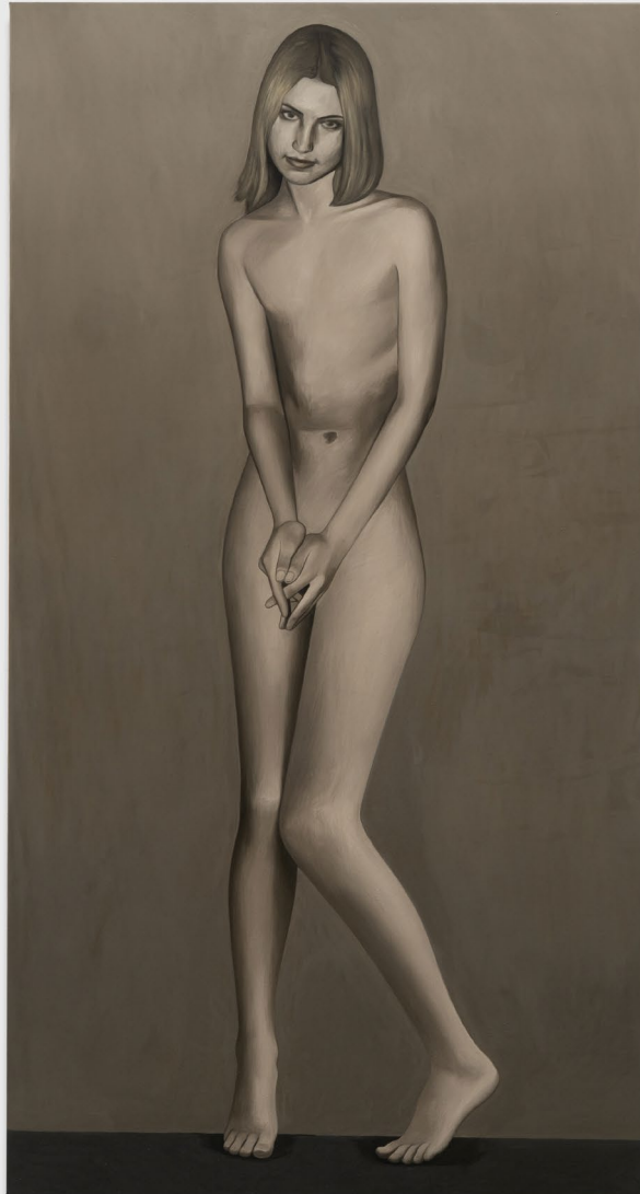
Arthur Marie The Juvenile Lead 2025

Oil on canvas 150 x 80 cm 59 x 31 1/2 in