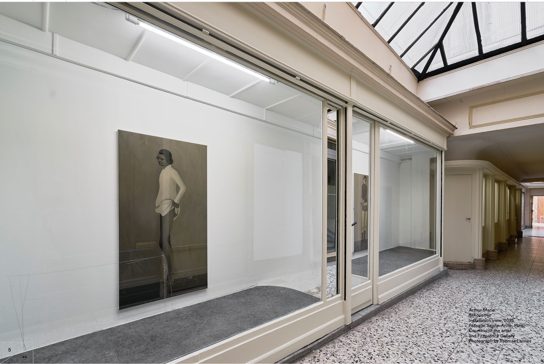
Arthur Marie Silhouettes Installation view, 2025 Passage Sainte-Anne, Paris