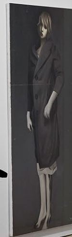
Arthur Marie Silhouettes Installation view, 2025 Passage Sainte-Anne, Paris Courtesy of the artist and Fitzpatrick Gallery Photograph by Thomas Lannes