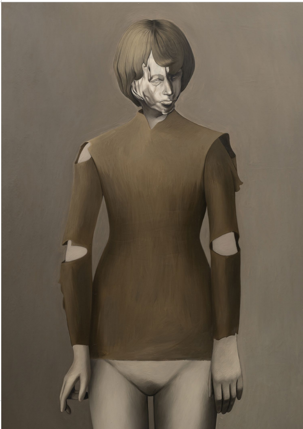
Arthur Marie Leatherface (detail) 2025

Oil on canvas 150 x 80 cm 59 x 31 1/2 in