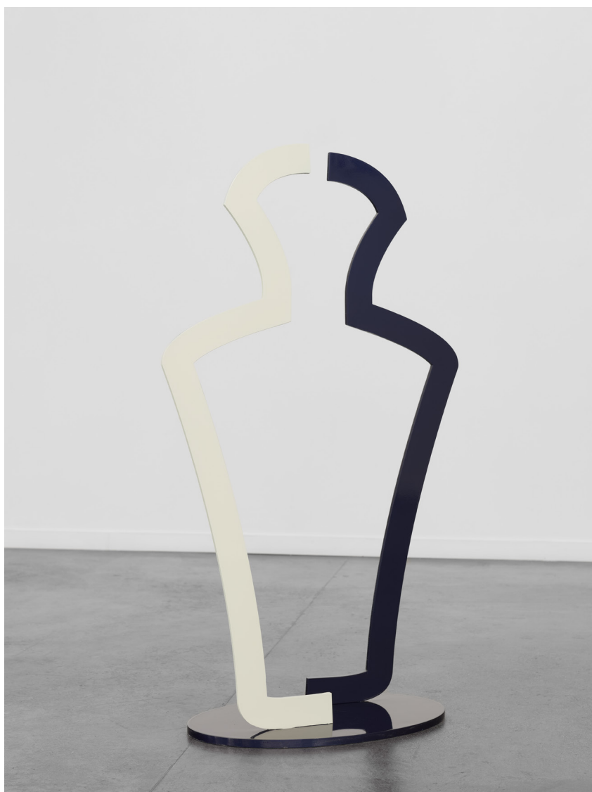
Double spaced (Enzianblau and Jaune vanille), 2025