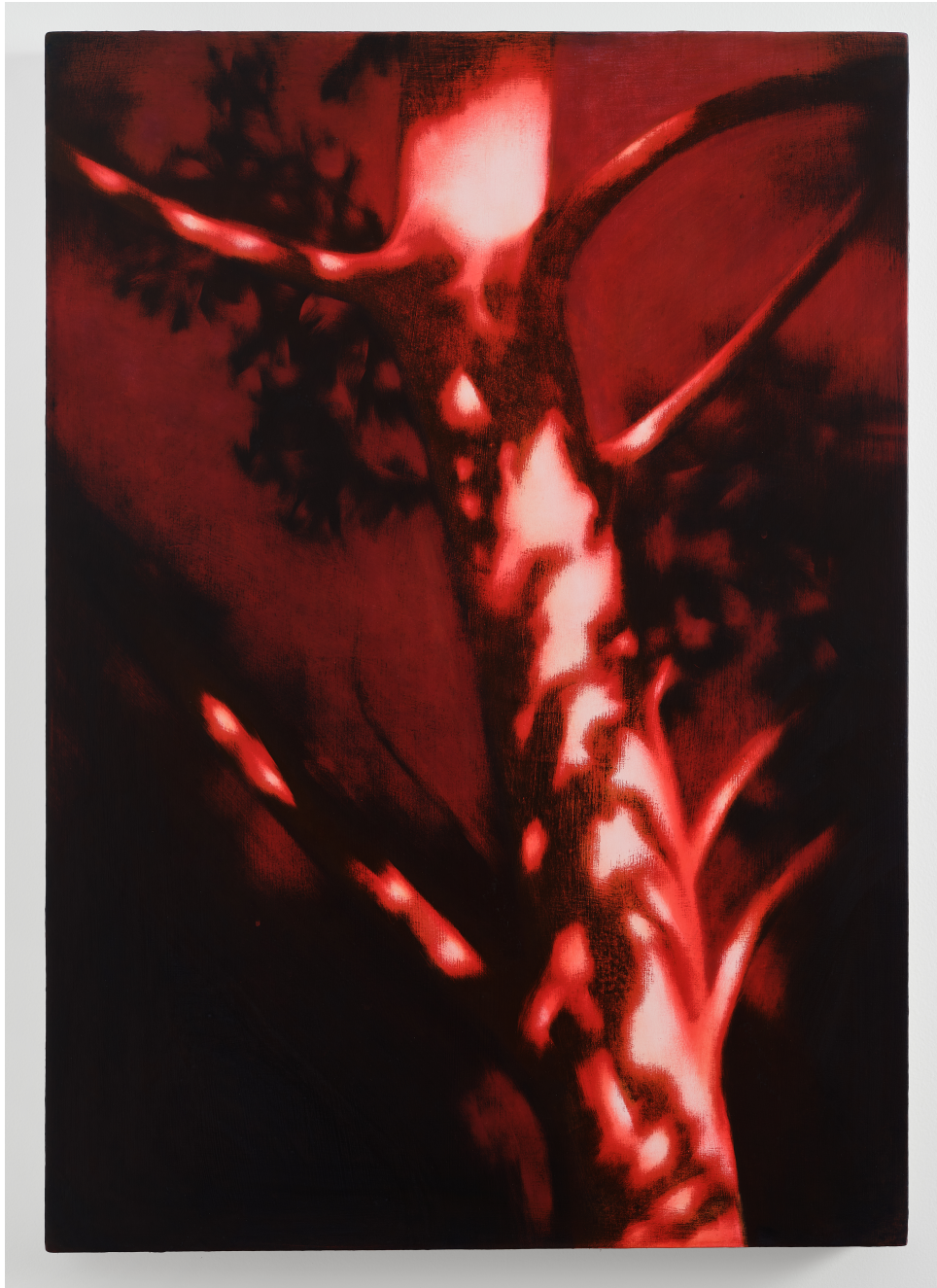
Emergency acrylic on canvas stretched on aluminum 28 7/8 x 20 1/2 in. | 73.5 x 52 cm. | 2025