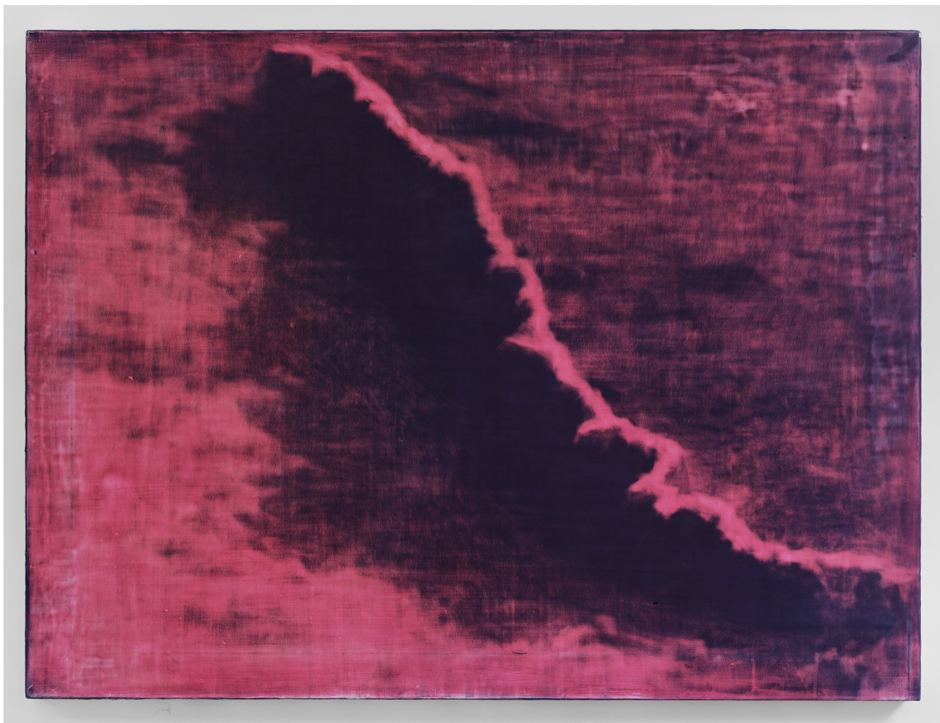
Wall acrylic on canvas 37 1/2 x 50 in. | 95 x 127 cm. | 2025