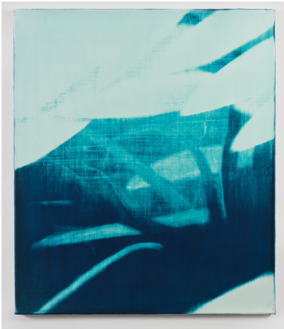
Undergrowth acrylic on canvas 27 1/2 x 23 5/8 in. | 70 x 60 cm. | 2025