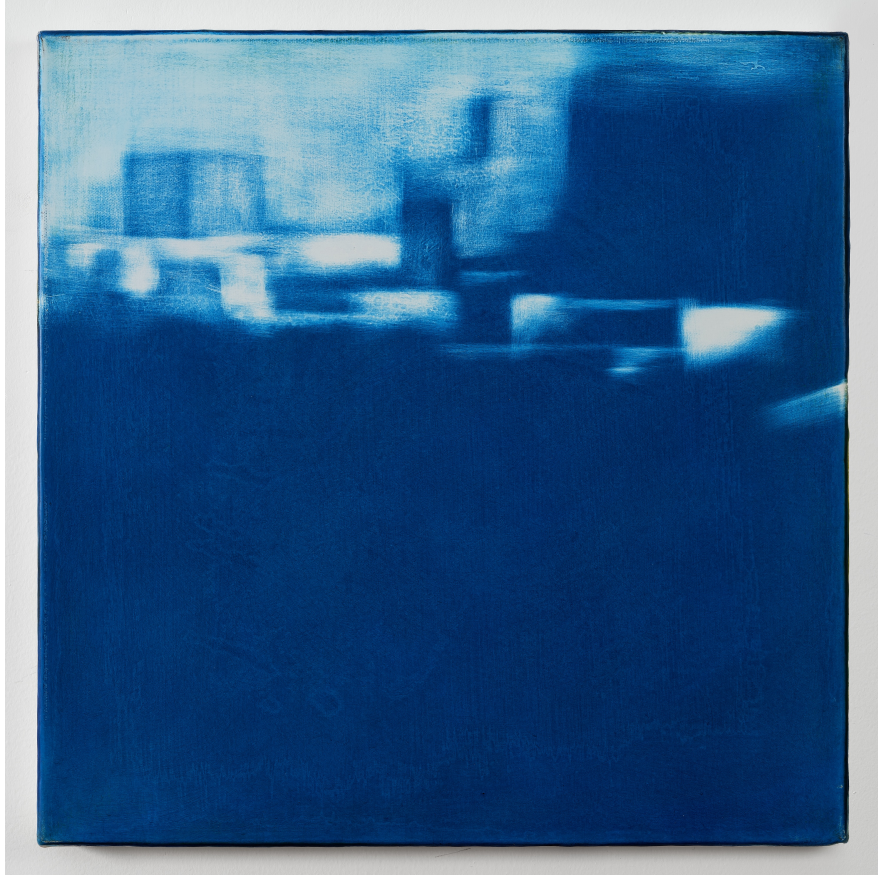
Amsterdam acrylic on canvas 15 7/8 x 15 7/8 in. | 40 x 40 cm. | 2025