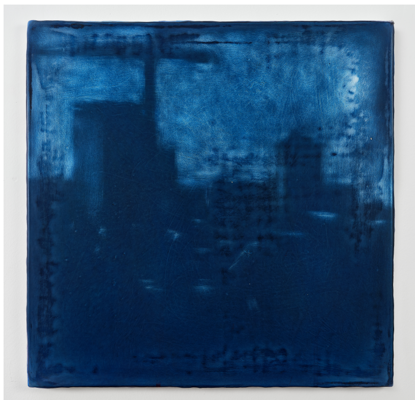
Amsterdam 2 acrylic on canvas 15 7/8 x 15 7/8 in. | 40 x 40 cm. | 2025