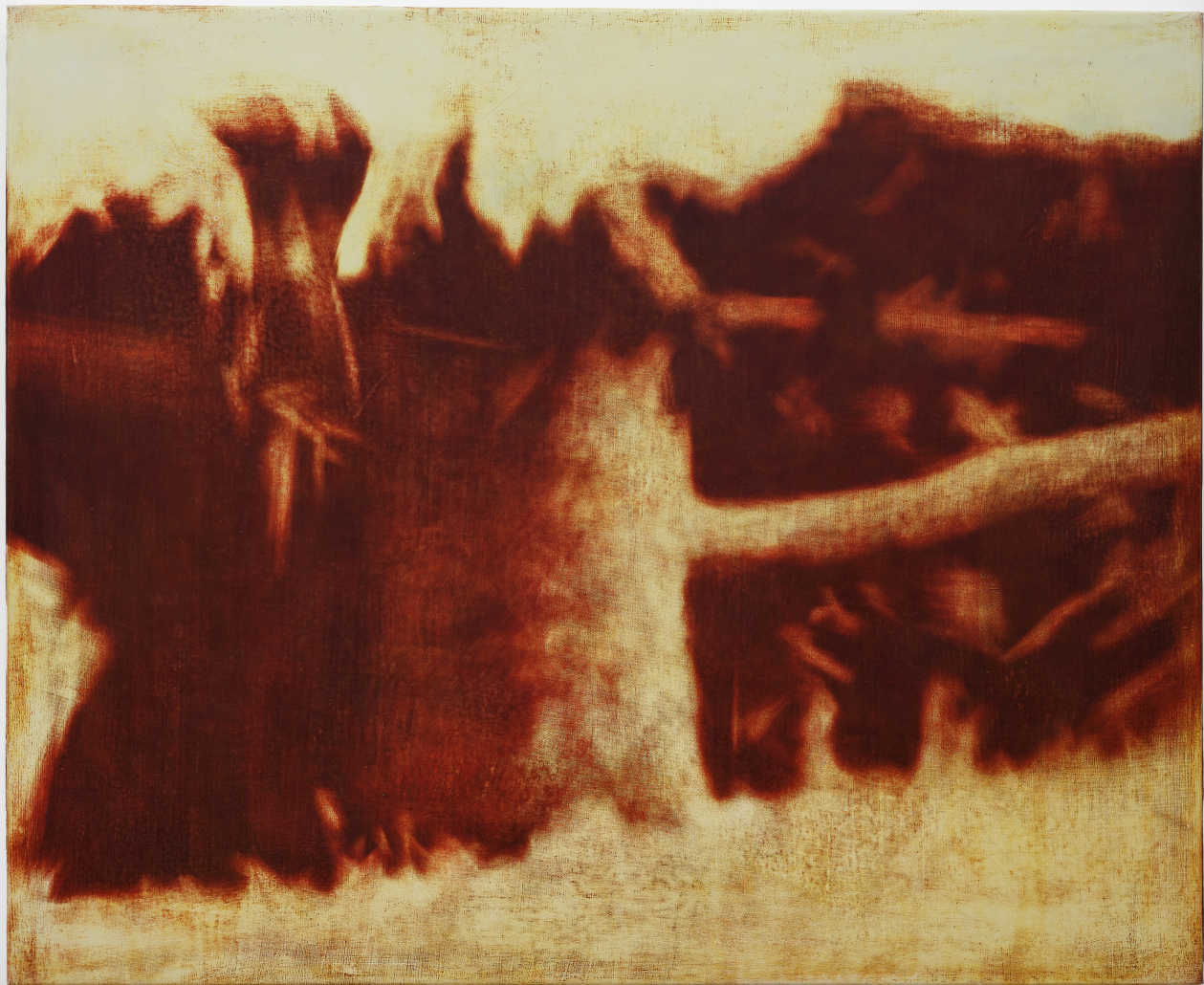
Bush acrylic on canvas 44 x 53 7/8 in. | 112 x 137 cm. | 2025