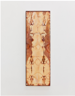
The Many-Worlds Interpretation, 2023

Oil on canvas 11 1/2 x 35 in 29.2 x 88.9 cm