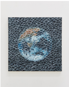
You're Not Just Us, But We're Just You, 2022