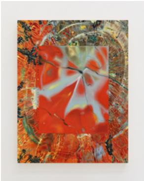
Forever Material, 2024