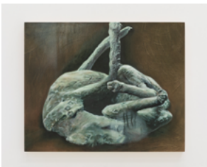
Cave Canem: A Circular Highway, 2025