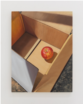
What the Apple Became, 2024

Oil on canvas 11 1/2 x 35 in 29.2 x 88.9 cm