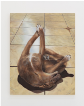
Cave Canem: The Volcano, 2025