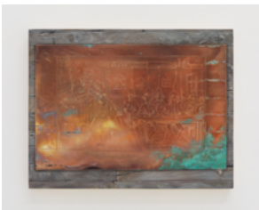
En l'an 2000, 2025