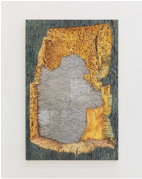
How We Know Where to Dig, 2024