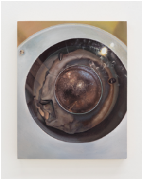
The Discovery Room, 2025