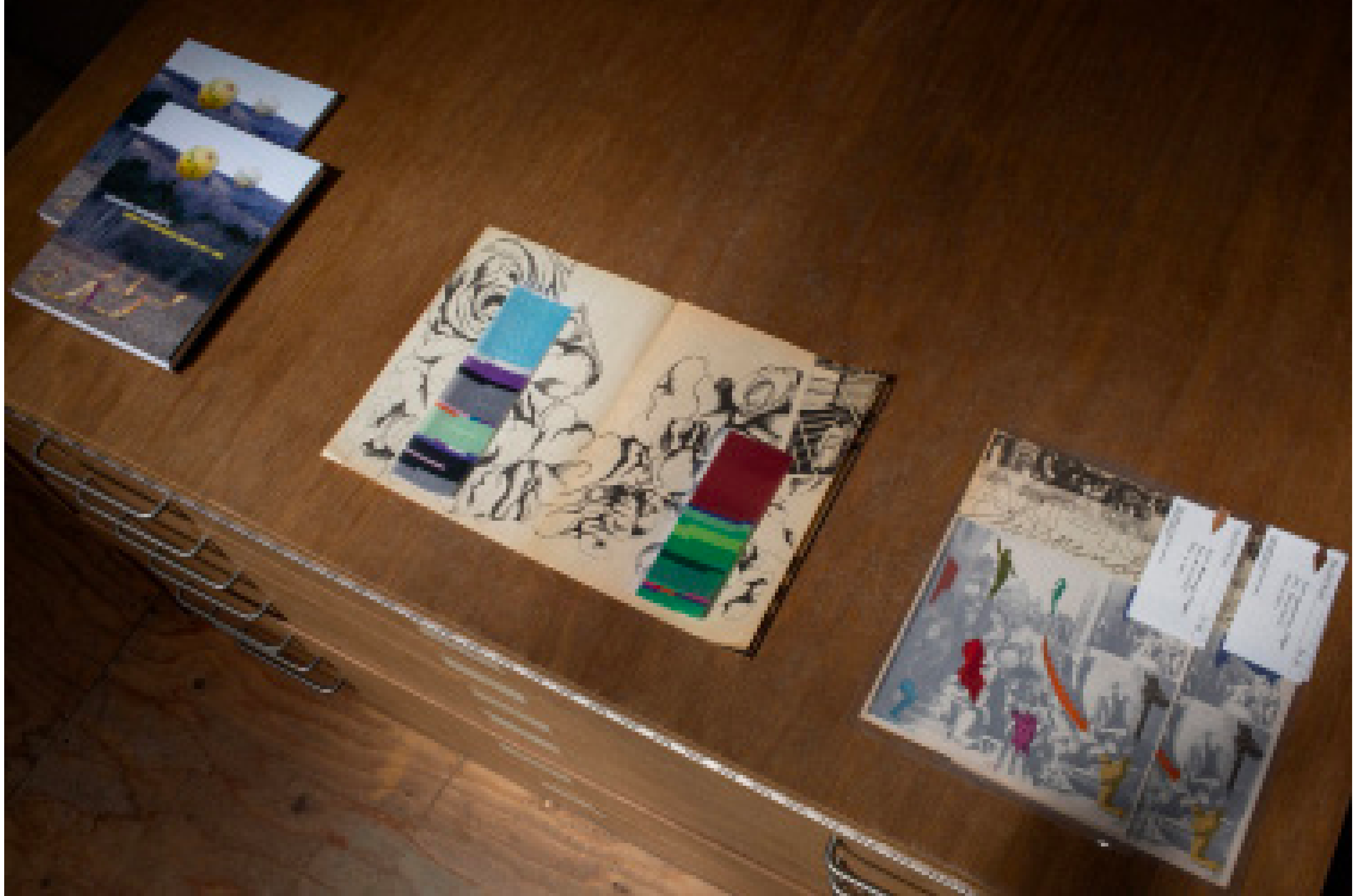
14. Darling Green – Surroundings' Colors , 2025. Alteration of Art-Rite , no. 15, "Surroundings," 1977. Printed vellum, ribbon, and colored ink on newsprint; edition of 5.