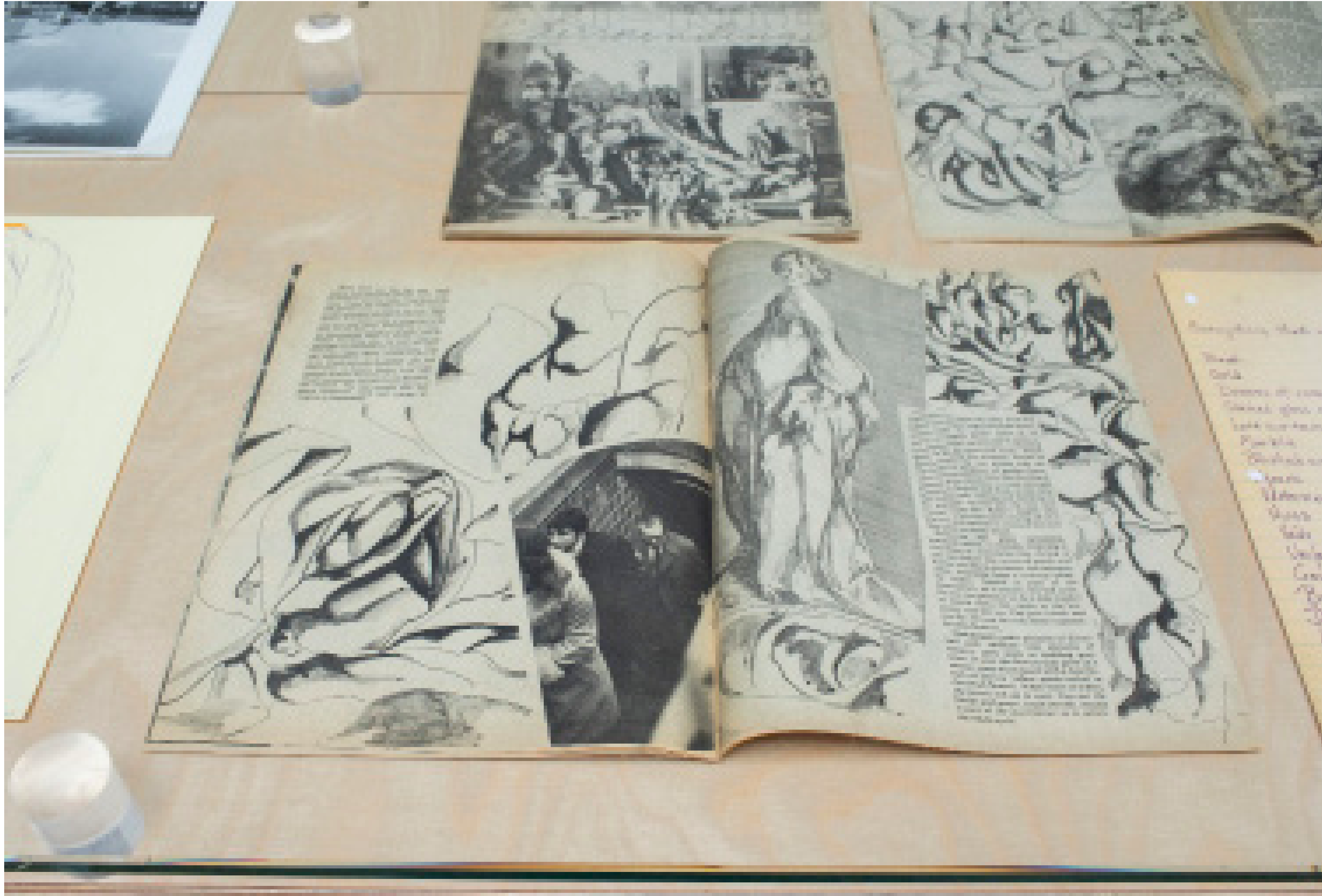
06. Art-Rite , no. 15, "Surroundings," 1977. Ink on newsprint, 20 pages. Courtesy of the collection of de Appel Archive.