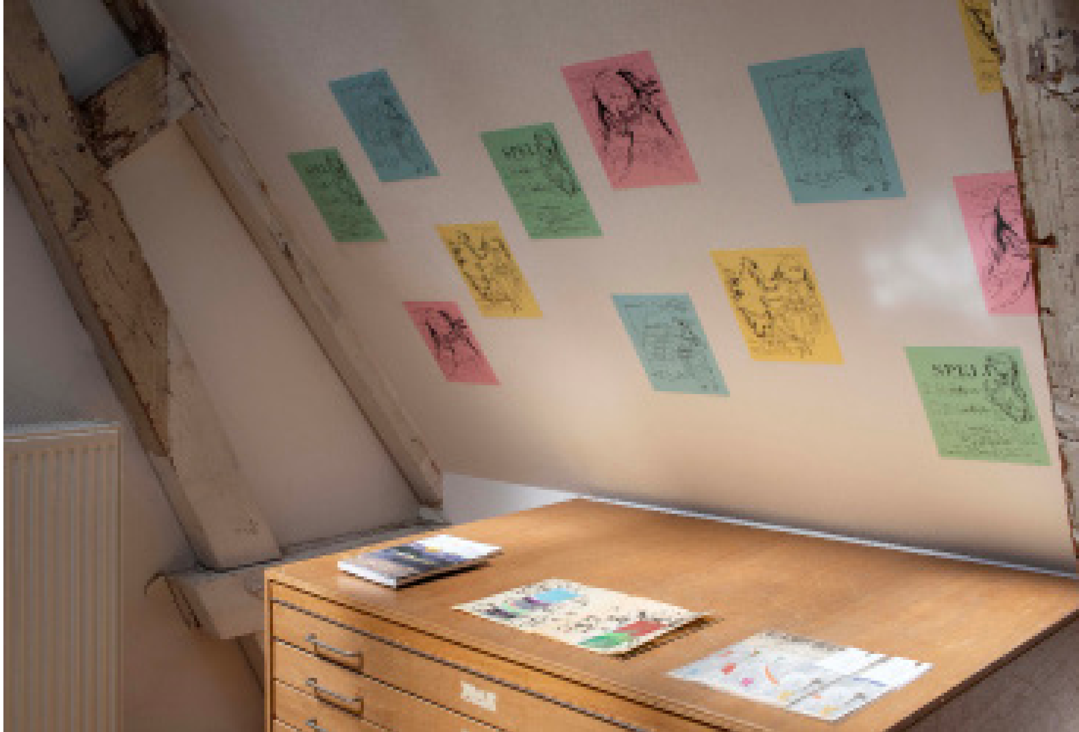
13. Overview Have you got the time? Rosemary Mayer's Temporary Monuments (Spring) . Flyers: Facsimile of flyers for Spell , 1977. Original: photocopied drawing, ink on paper. Facsimile: Laser print on paper.