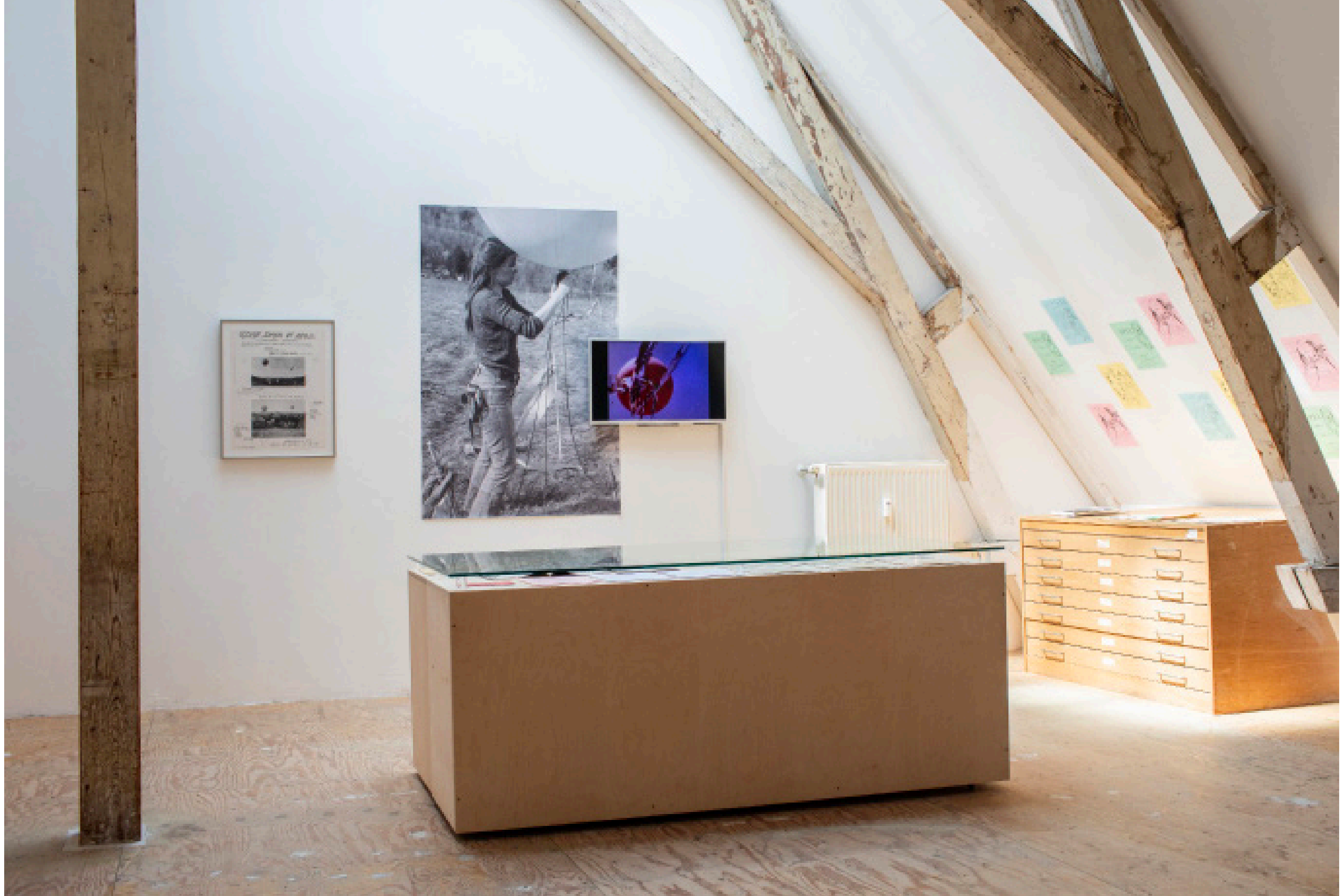
12. Overview Have you got the time? Rosemary Mayer's Temporary Monuments (Spring).