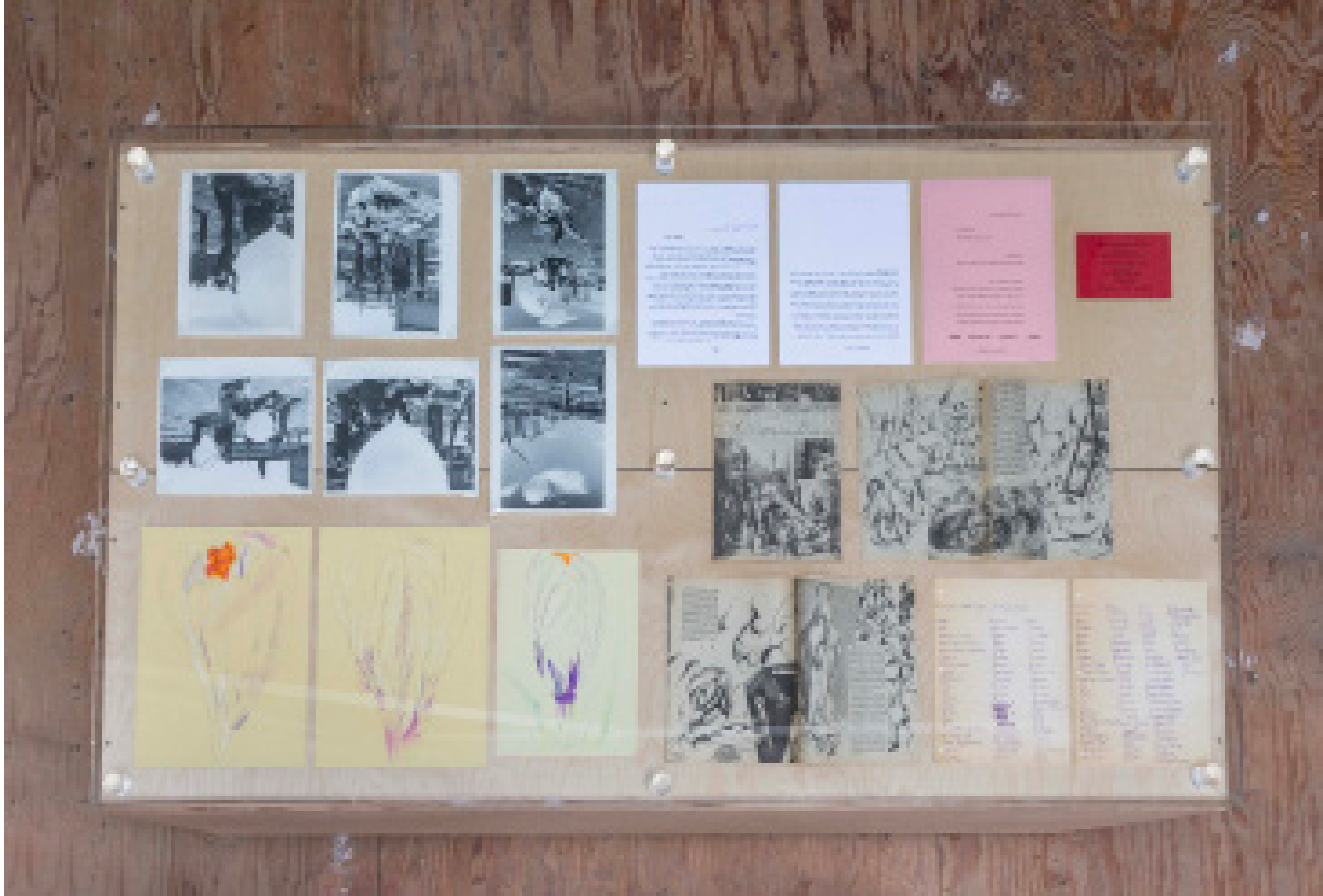
04. Vitrine Overview. See checklist for details.