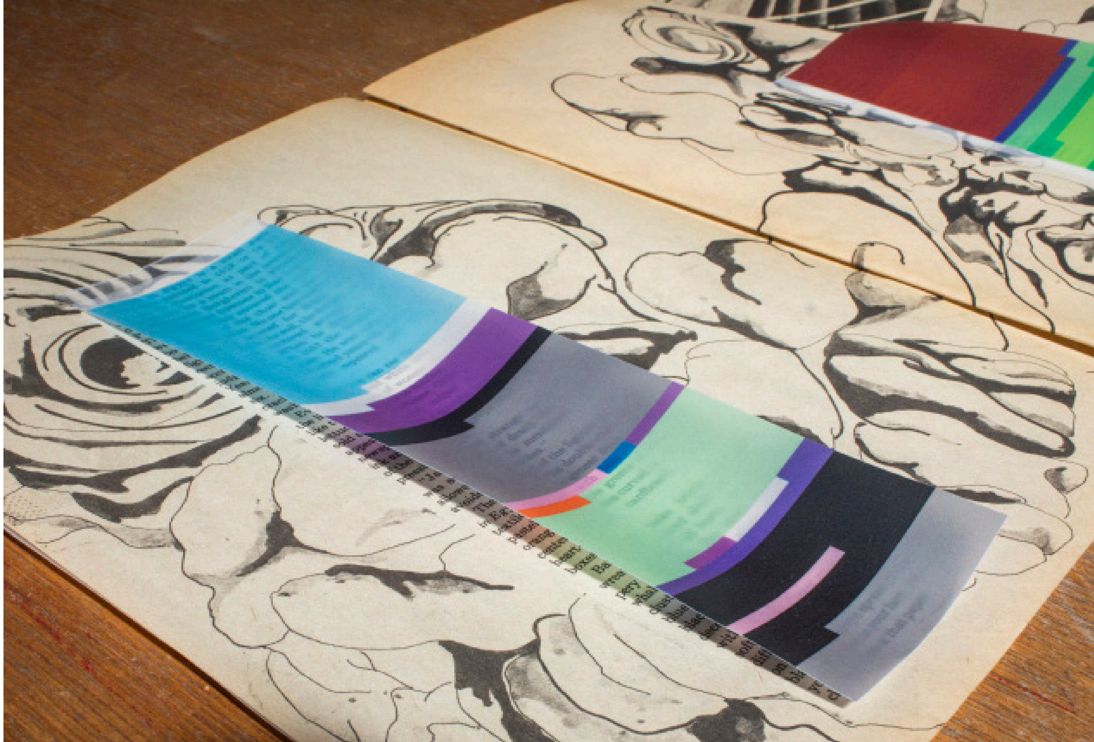
15. Detail book edition.