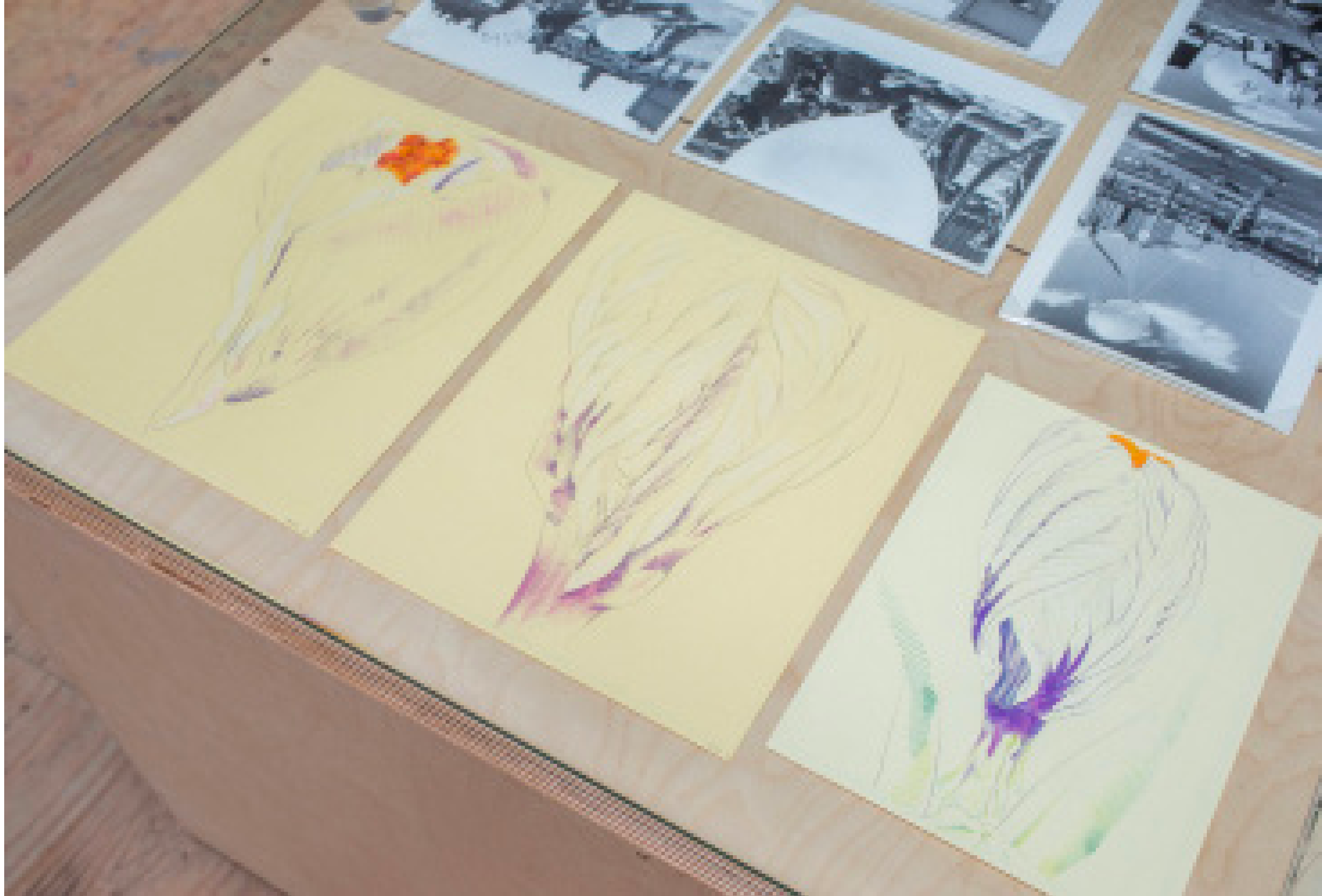
05. Crocus study no. 1 , 1976. Ink and pencil on paper. Courtesy of the Estate of Rosemary Mayer. Crocus study no. 2 , 1976. Ink and pencil on paper. Courtesy of the Estate of Rosemary Mayer. Crocus study no. 3 , 1976. Ink and pencil on paper. Courtesy of the Estate of Rosemary Mayer. Photo: Anastasija Kiake.