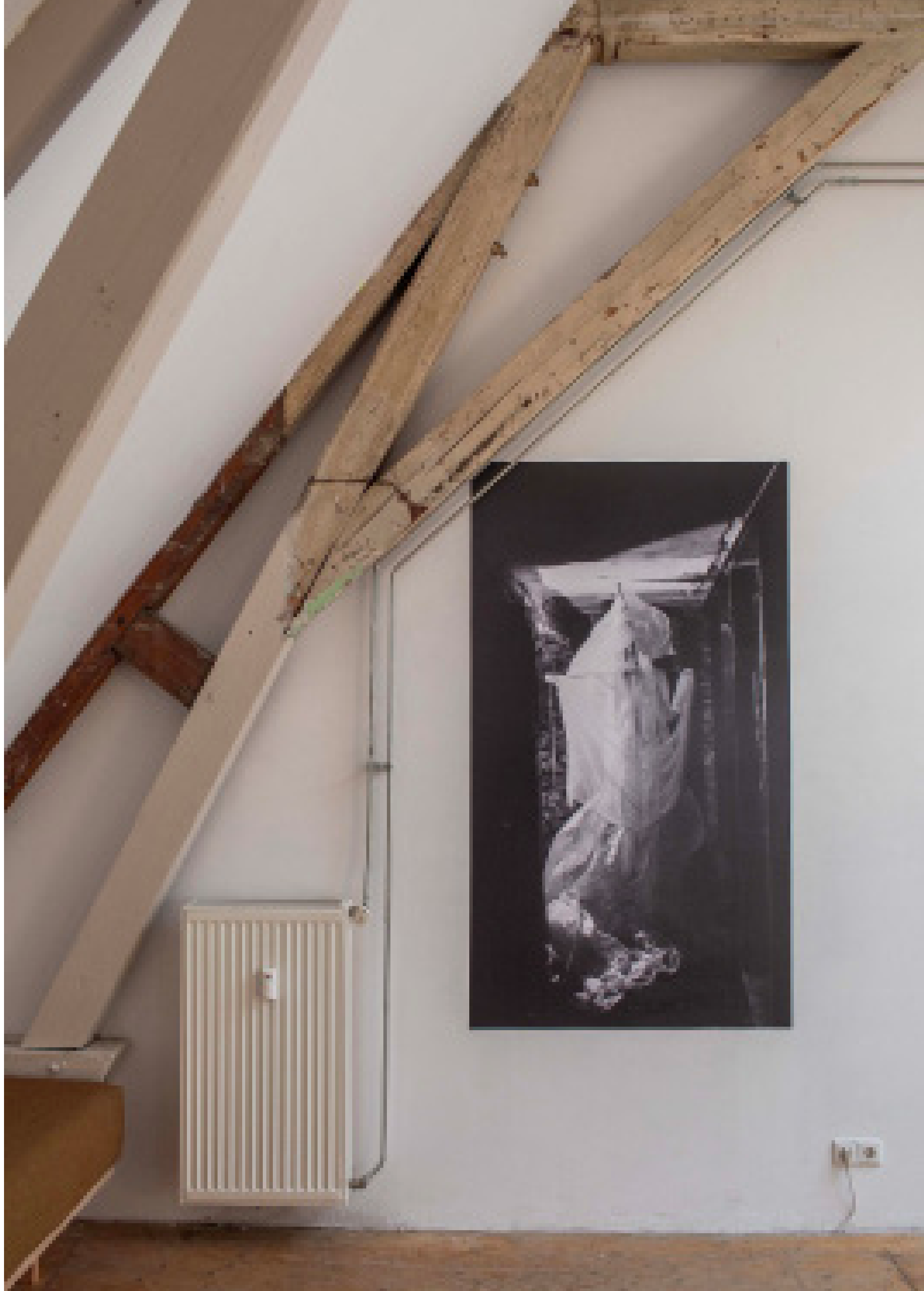
01. Rosemary Mayer – Reproduction of documentation of 41st Street Ghost , 1980. Original: silver gelatine print.