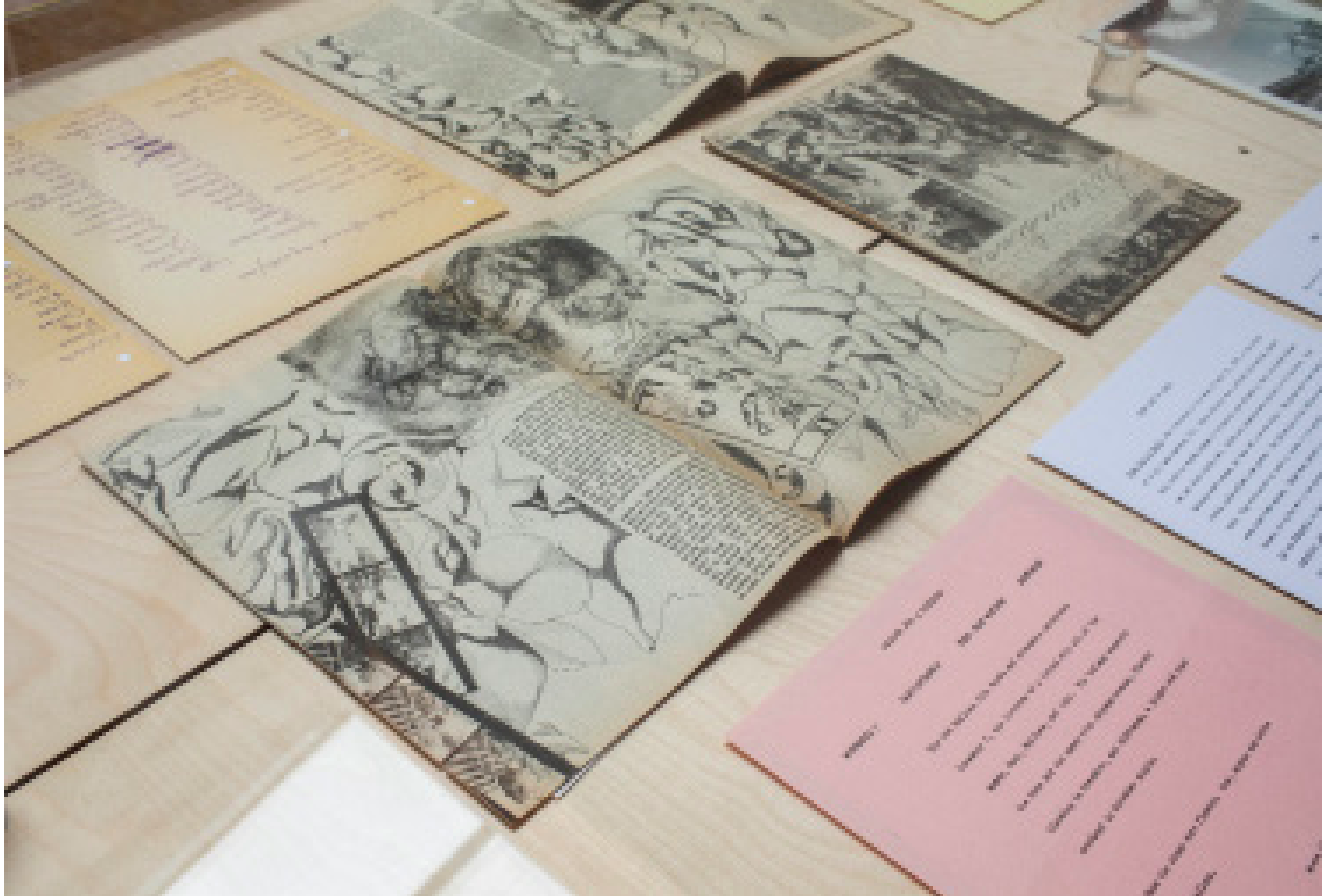
07. Vitrine overview.