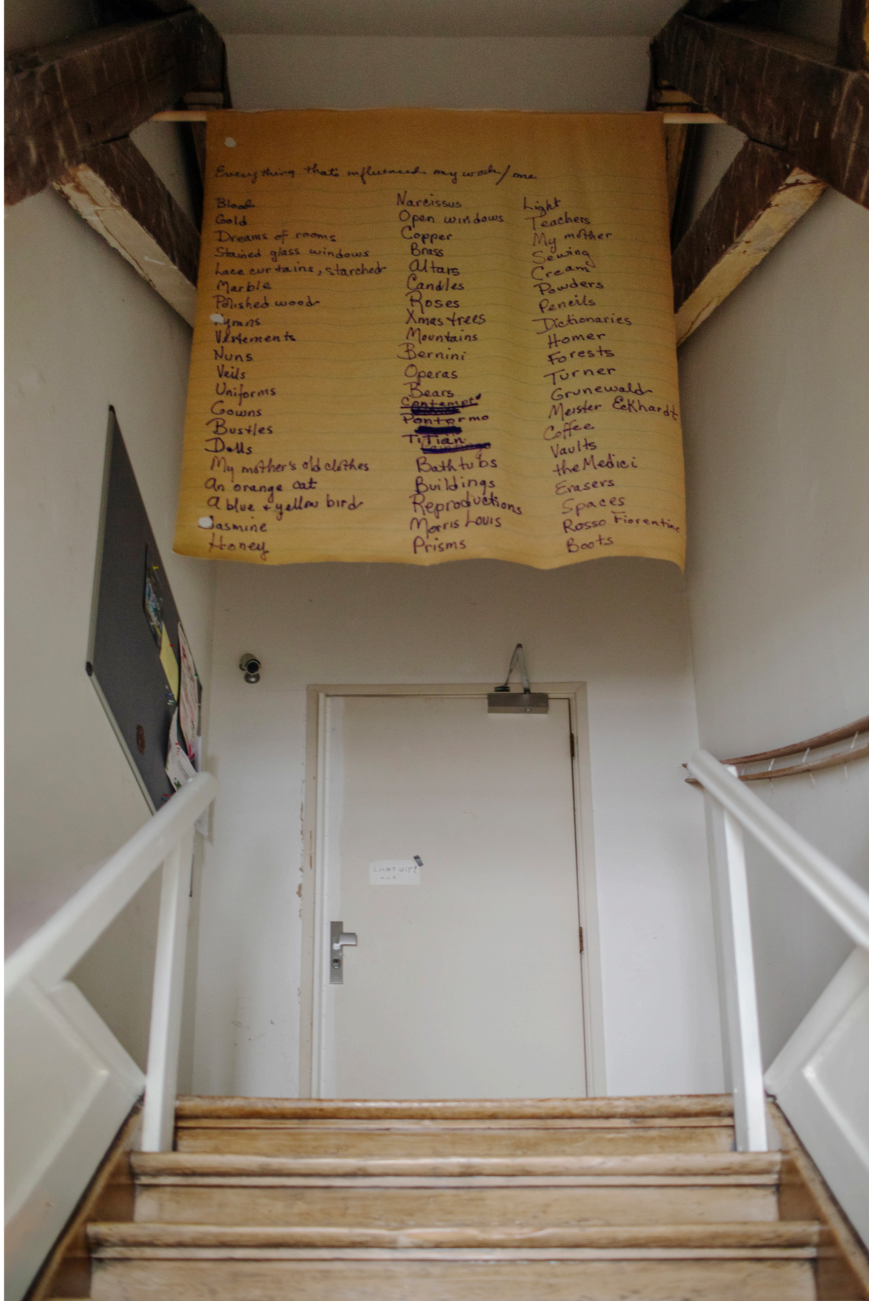
16. Banner reproduction of Everything that's influenced my work/me , 1978. Original: ink on notebook. Reproduction: synthetic silk.