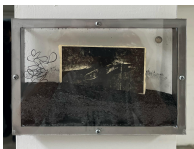
Imogen Brent Untitled (Terror) 2025 Metal dust, lithograph, bronze droplet, steel off cut, plexiglass, steel, soldering iron tips 6 x 8 x 2 inches