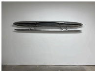
Imogen Brent Spillway 2025 Welded steel 12 ½ x 84 x 6 inches

Note, document is not for sale, replicate available