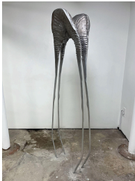
Imogen Brent Tip of my finger, roof of my mouth 2025 Cast and welded aluminum 62 x 15 x 11 ½ inches