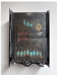
Max Popov Slush (on the threshold of a heart) III 2025 Doorbell chime, fluorescent displays, found objects, assembled housing (steel, glass, hardware), electrical components 6 ½ x 4 ½ x 2 inches