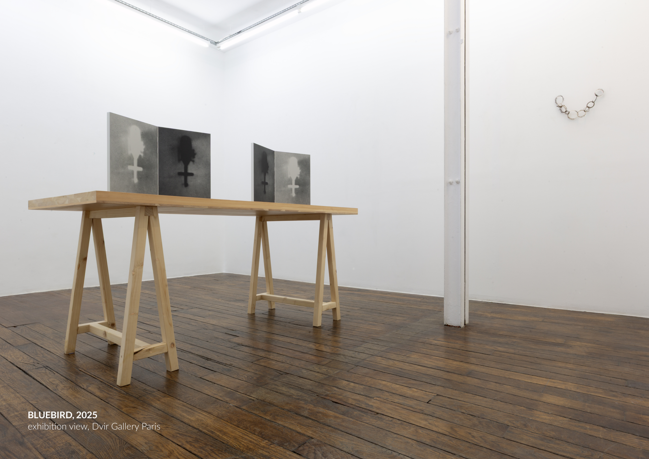
BLUEBIRD, 2025 exhibition view, Dvir Gallery Paris