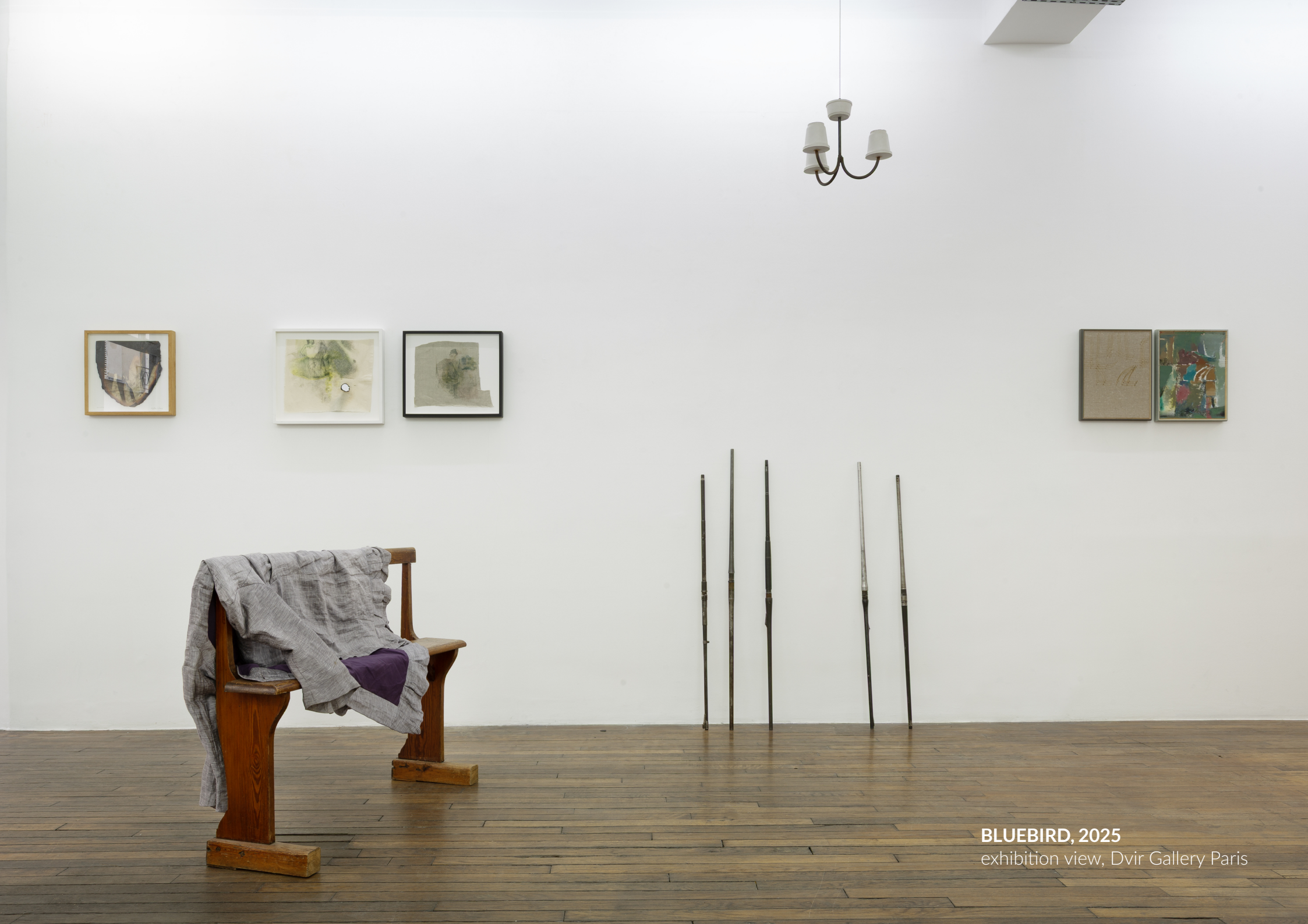
BLUEBIRD, 2025 exhibition view, Dvir Gallery Paris