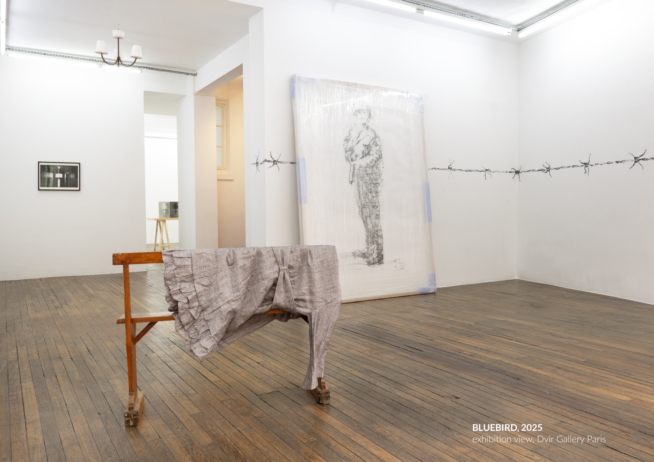
BLUEBIRD, 2025 exhibition view, Dvir Gallery Paris