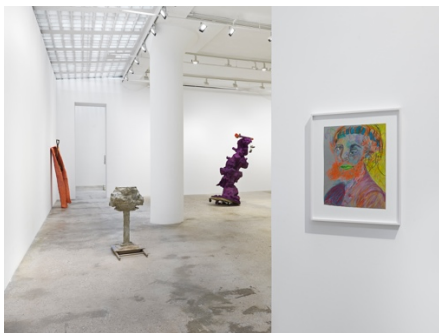
14. Rachel Harrison, installation view, The Friedmann Equations , Greene Naftali, New York, 2025

Courtesy the artist and Greene Naftali, New York.