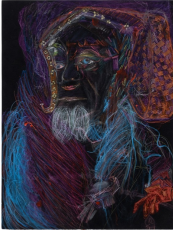
13. Rachel Harrison, Rachel Harrison viii Drawing , 2025

Colored pencil, wax crayon, and acrylic on velour pastel paper 18 7/8 x 14 1/8 in (48 x 36 cm)