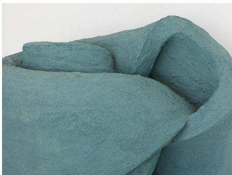
8. Rachel Harrison

Courtesy the artist and Greene Naftali, New York.