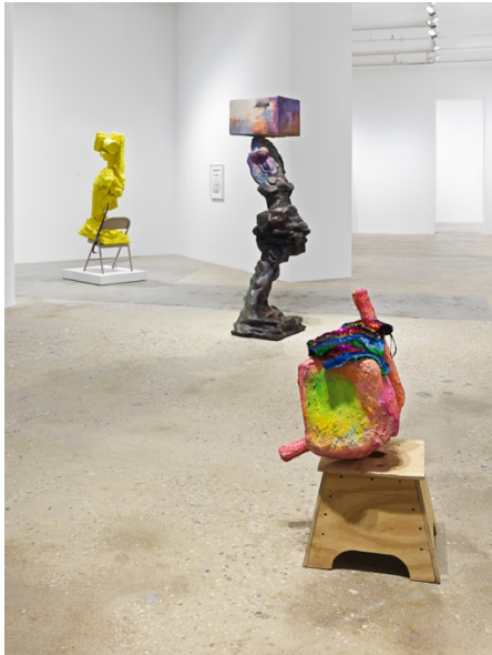
15. Rachel Harrison, installation view, The Friedmann Equations , Greene Naftali, New York, 2025

Courtesy the artist and Greene Naftali, New York.