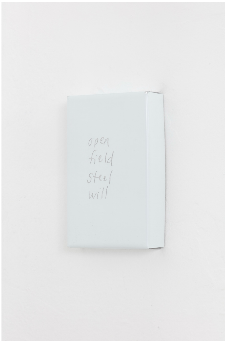
Untitled (open), Aluminum, 3 x 5 x 1 inches, 2025

2007 Wilshire Blvd. #820 Los Angeles, CA 90057