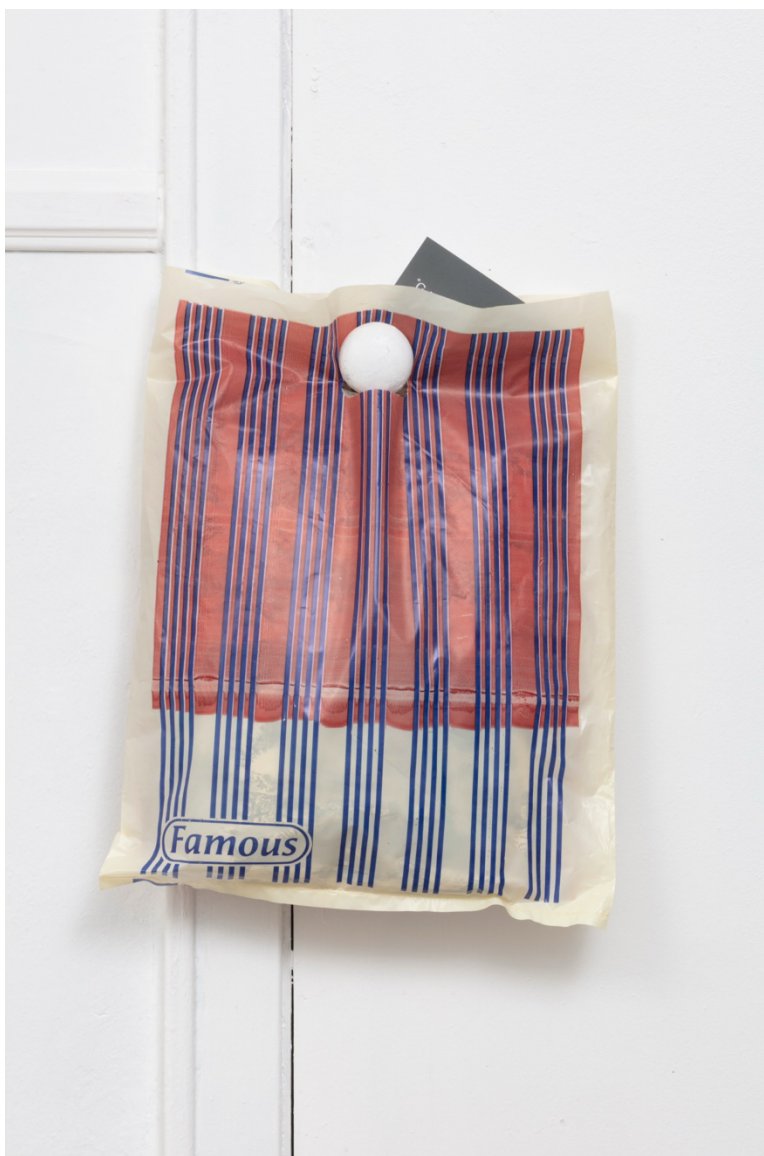
Famous , Found objects and inkjet print, 18 x 22 x 2 inches, 2025

2007 Wilshire Blvd. #820 Los Angeles, CA 90057