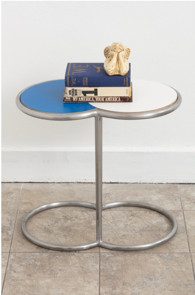
Adventures in Poetry , Steel, laminated plywood, found objects, 18 x 25 x 12 inches, 2020-2025

2007 Wilshire Blvd. #820 Los Angeles, CA 90057