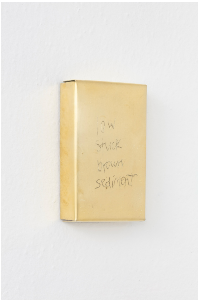
Untitled (low), Brass, 3 x 5 x 1 inches, 2025

2007 Wilshire Blvd. #820 Los Angeles, CA 90057