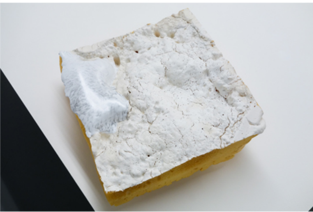
Untitled c. 1995 Graphite on expansion foam 13” x 14” x 5.5”