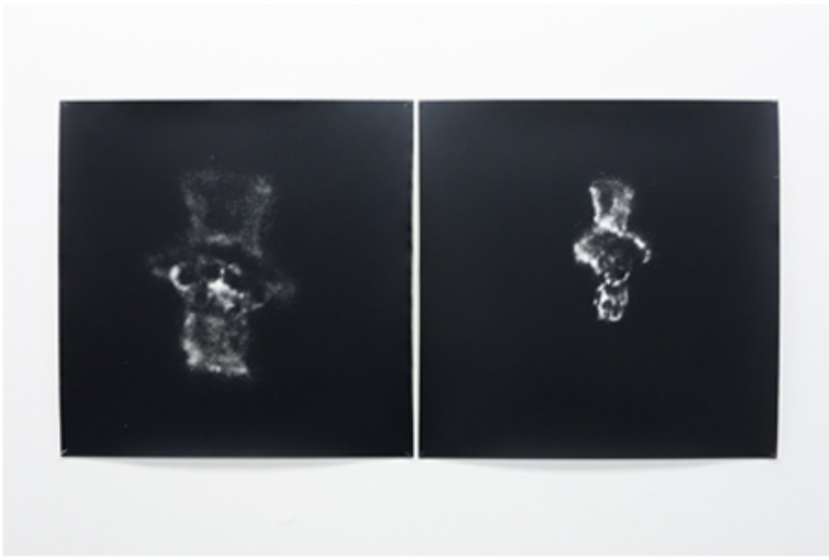
Untitled (Train Man, Brother: Doppelgänger) c. 1997 Photograms 16” x 16” each