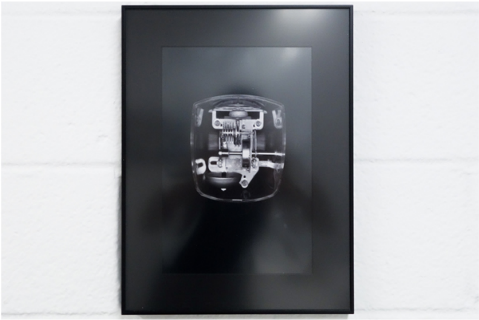
Untitled 2025 Giclée on deep metallic photo paper 12” x 8” (unframed) 16” x 12” x 1” (framed)