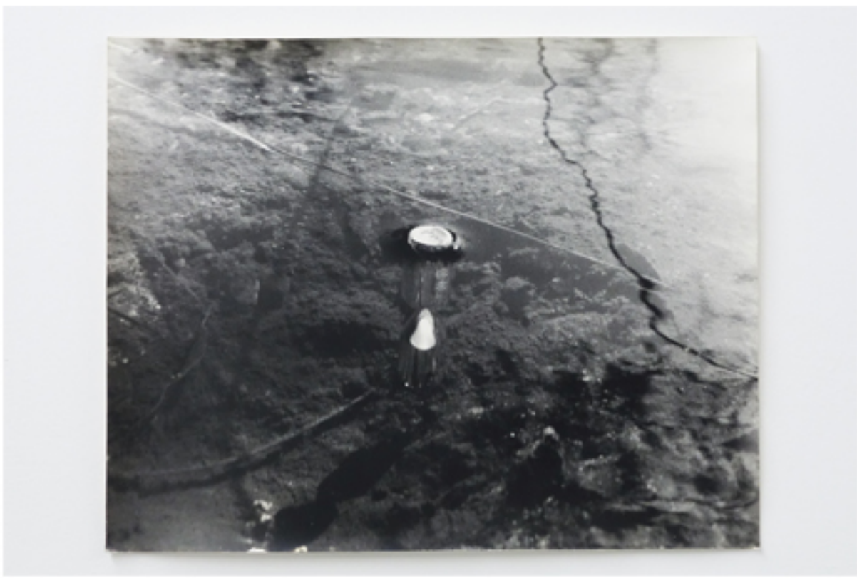
Test Print c. 1990 Silver gelatin print 13.75” x 11”