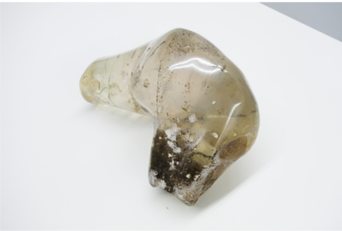
Baby Hole c. 1990 Resin, dirt, roots 10.5” x 8.5” x 6.25”