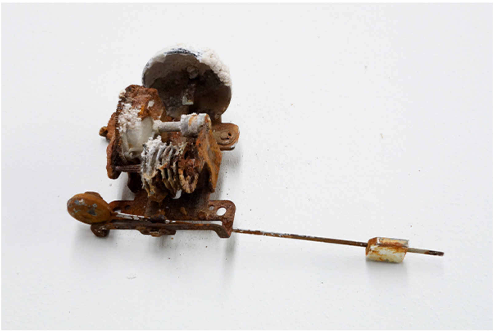
Music Without Music 2025 Timekeeping and metronome mechanisms from the collection of the artist’s grandfather, dissolved in gastric solution (HCL solution mimicking the composition of stomach acid formulated by the artist) 7.5” x 3.75” x 2.5”