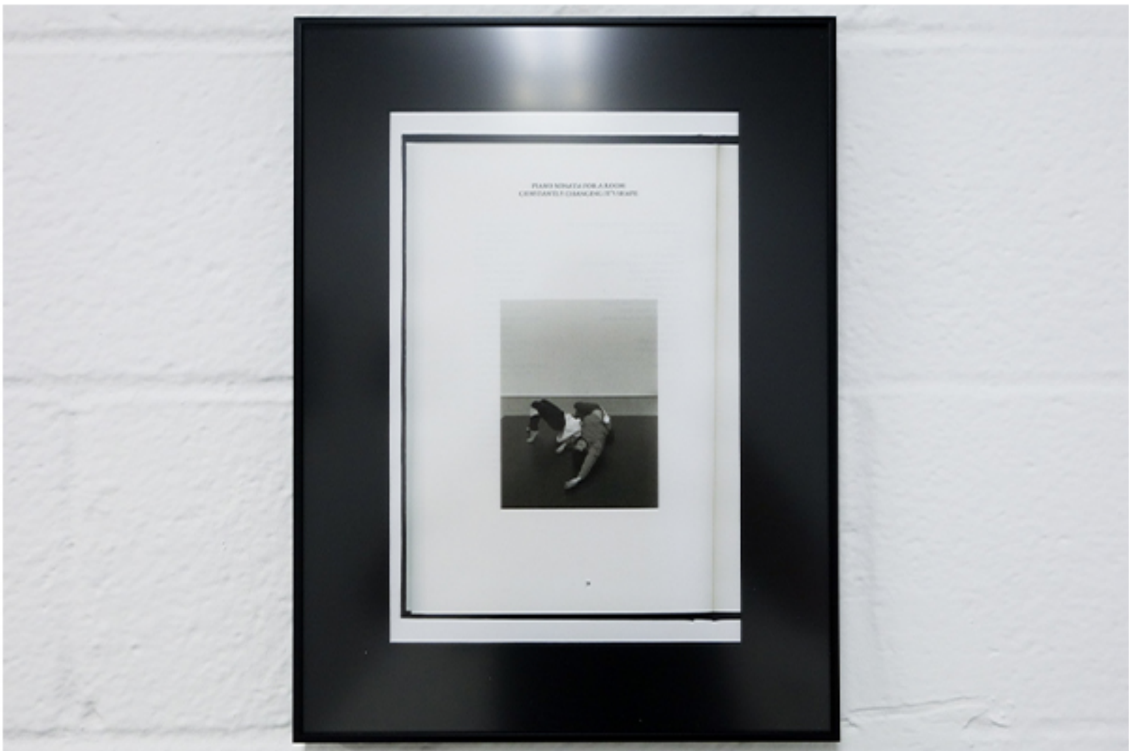
Untitled 2025 Giclée on deep matte photo paper 12” x 8” (unframed) 16” x 12” x 1” (framed)