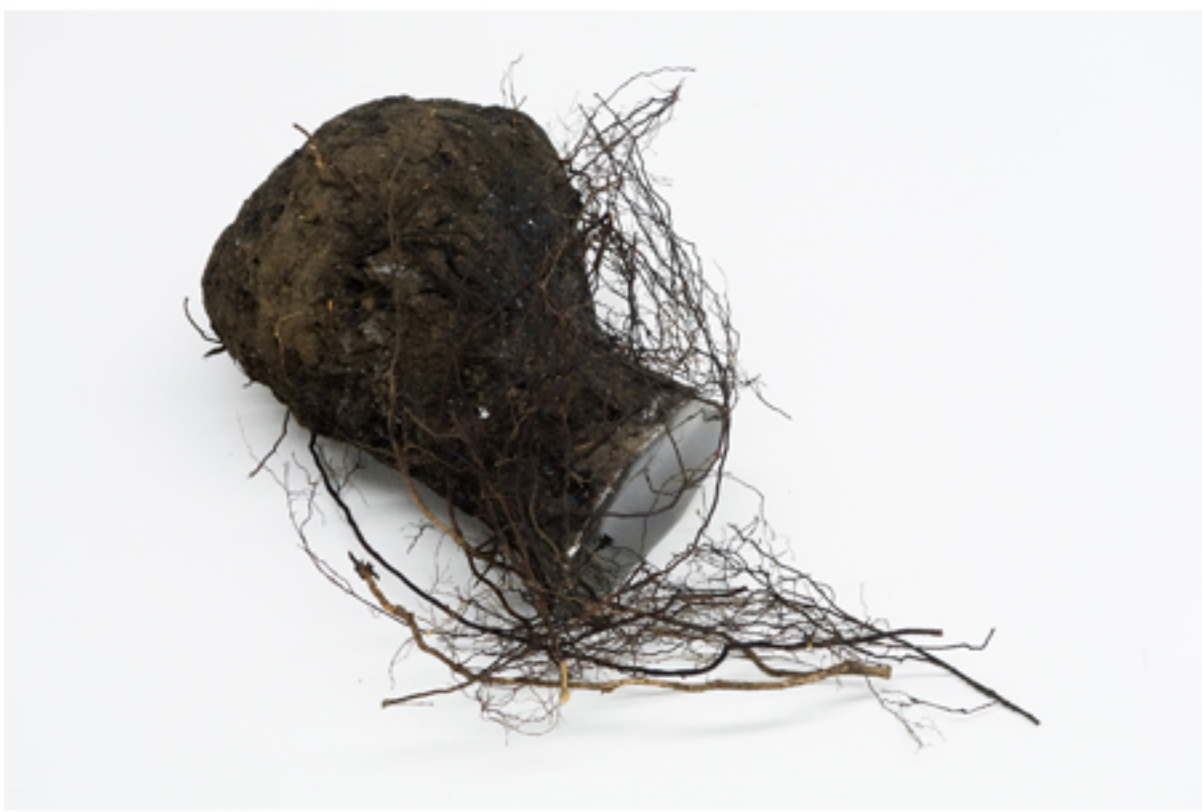
Hole #19 1999 Resin, dirt, roots, rocks 10” x 16” x 10” (variable)