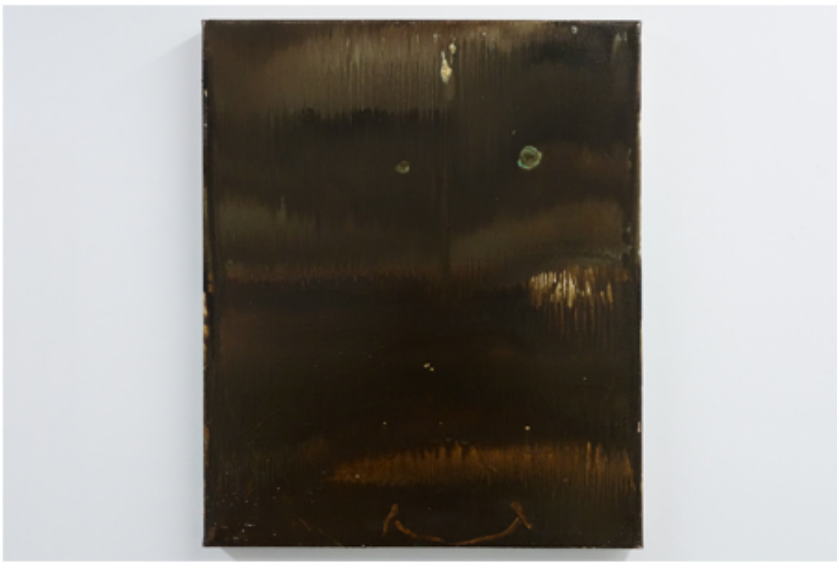
Untitled (Older, No I’m Older) c. 2006-2008 Oil on canvas 20” x 24” x 1.25”