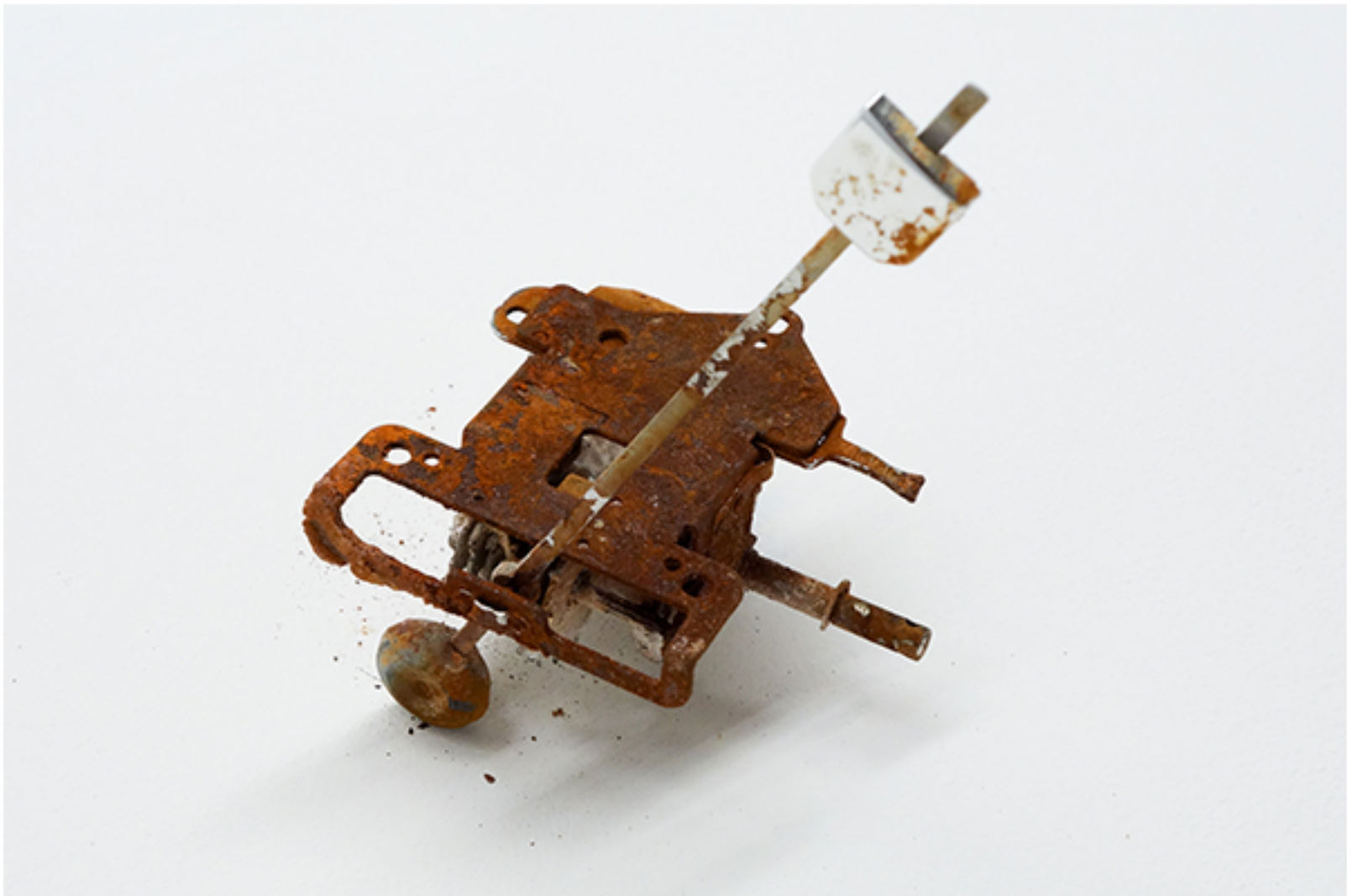
3.75” x 3.75” x 6.25”