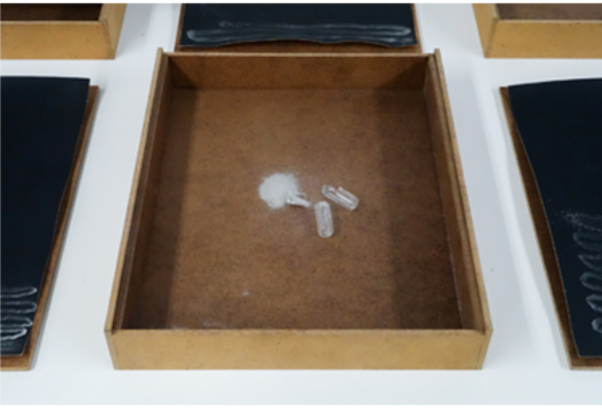
“Open” Letters c. 1990 Photograms, broken hourglass timers, engraved MDF 15” x 12” x 2” each (enclosed)