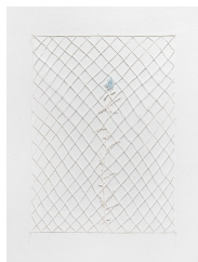
Annabel Daou Kick against the pricks #30 , 2025 Gesso, watercolor pencil, ink and repair tape on microfiber paper 30 x 22 in (76.2 x 55.9 cm) DAOan-004