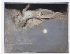
Rachael Catharine Anderson Moon Bath , 2025 Oil and marble dust on wood 11 x 14 in (27.9 x 35.6 cm) ANDra-001