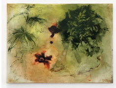
Rachael Catharine Anderson Magic Canvas , 2025 Oil and marble dust on canvas 18 x 24 in (45.7 x 61 cm) ANDra-002