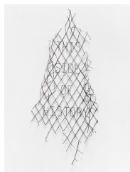
Annabel Daou This Side Of History , 2025 Gesso, watercolor pencil, ink and repair tape on microfiber paper 34 x 16 in (86.4 x 40.6 cm) DAOan-005