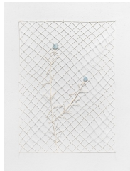
Annabel Daou Kick against the pricks #32, 2025 Gesso, watercolor pencil, ink and repair tape on microfiber paper 30 x 22 in (76.2 x 55.9 cm) DAOan-003