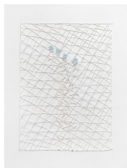
Annabel Daou Kick against the pricks #30, 2025 Gesso, watercolor pencil, ink and repair tape on microfiber paper 30 x 22 in (76.2 x 55.9 cm) DAOan-001