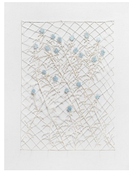
Annabel Daou Kick against the pricks #31, 2025 Gesso, watercolor pencil, ink and repair tape on microfiber paper 30 x 22 in (76.2 x 55.9 cm) DAOan-002