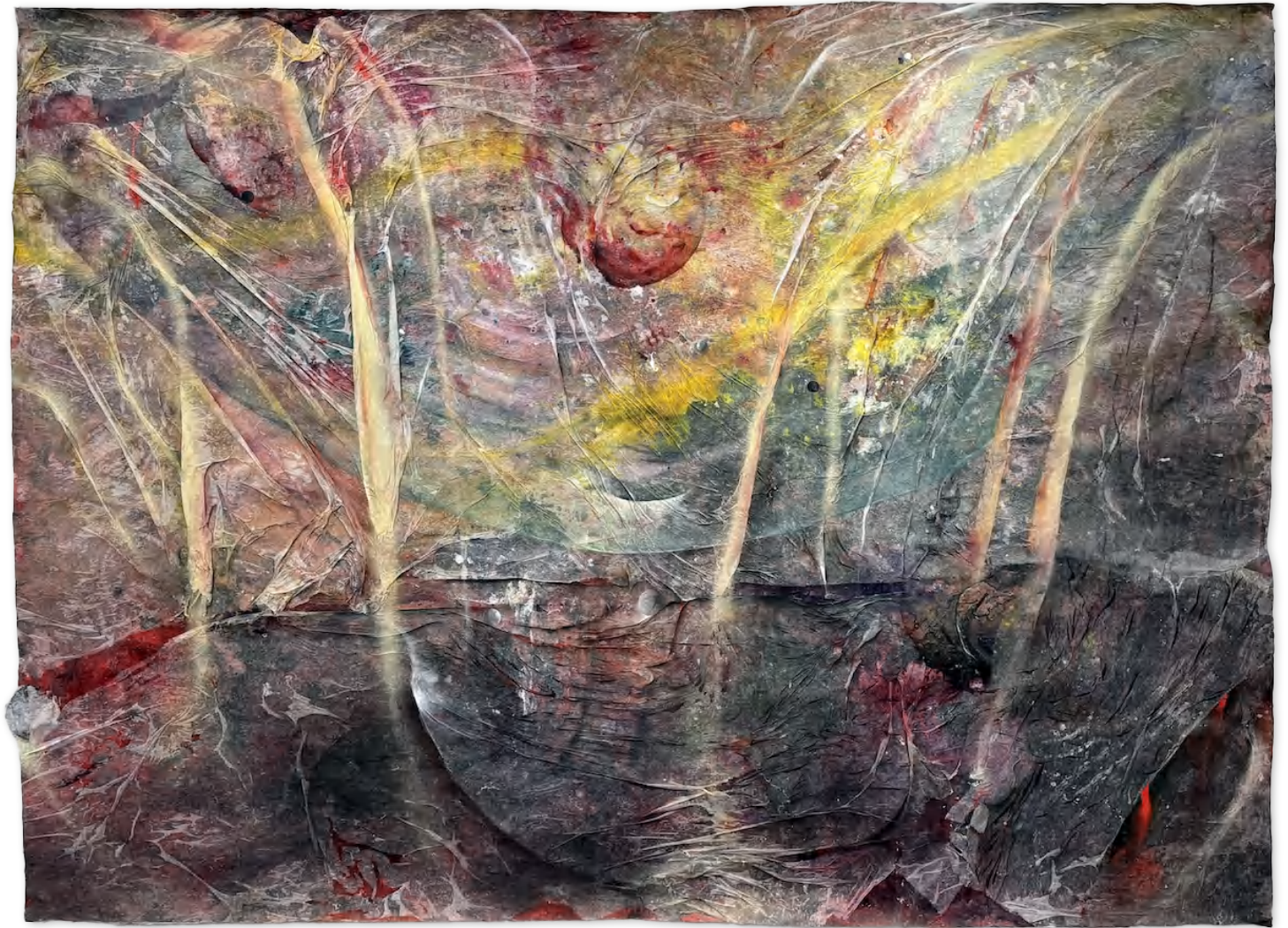
We Were Light Before We Were