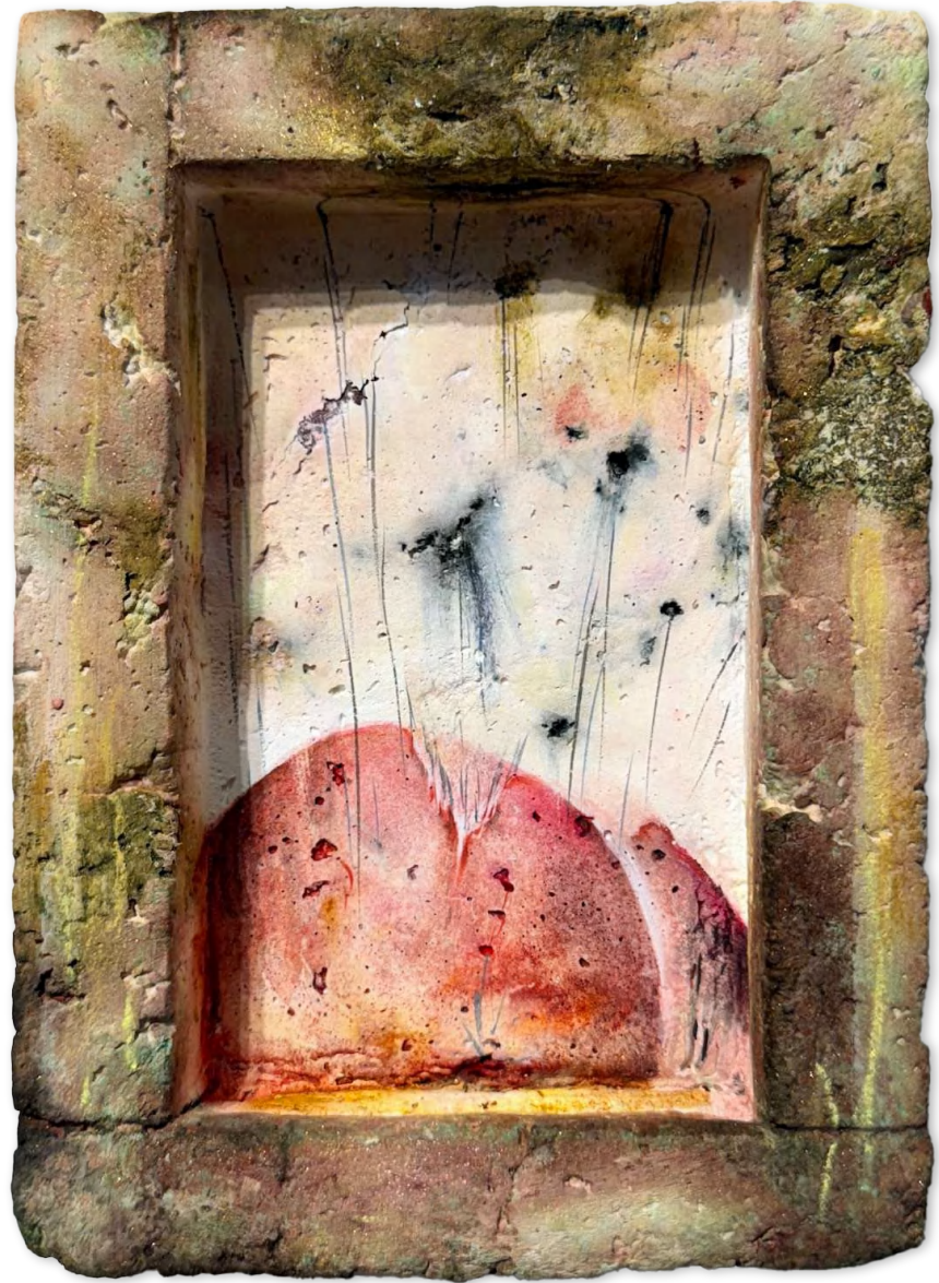
Cast 5 2025 Ink, watercolour, paper on paper 18 x 13 x 4 cm; 7 x 5 x 1 1/2 inches