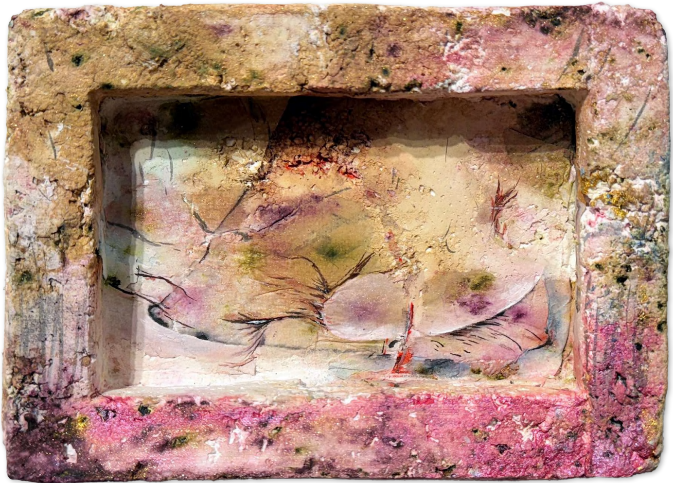
Cast 8 2025 Ink, watercolour, paper on paper 13 x 18 x 4 cm; 5 x 7 x 1 1/2 inches