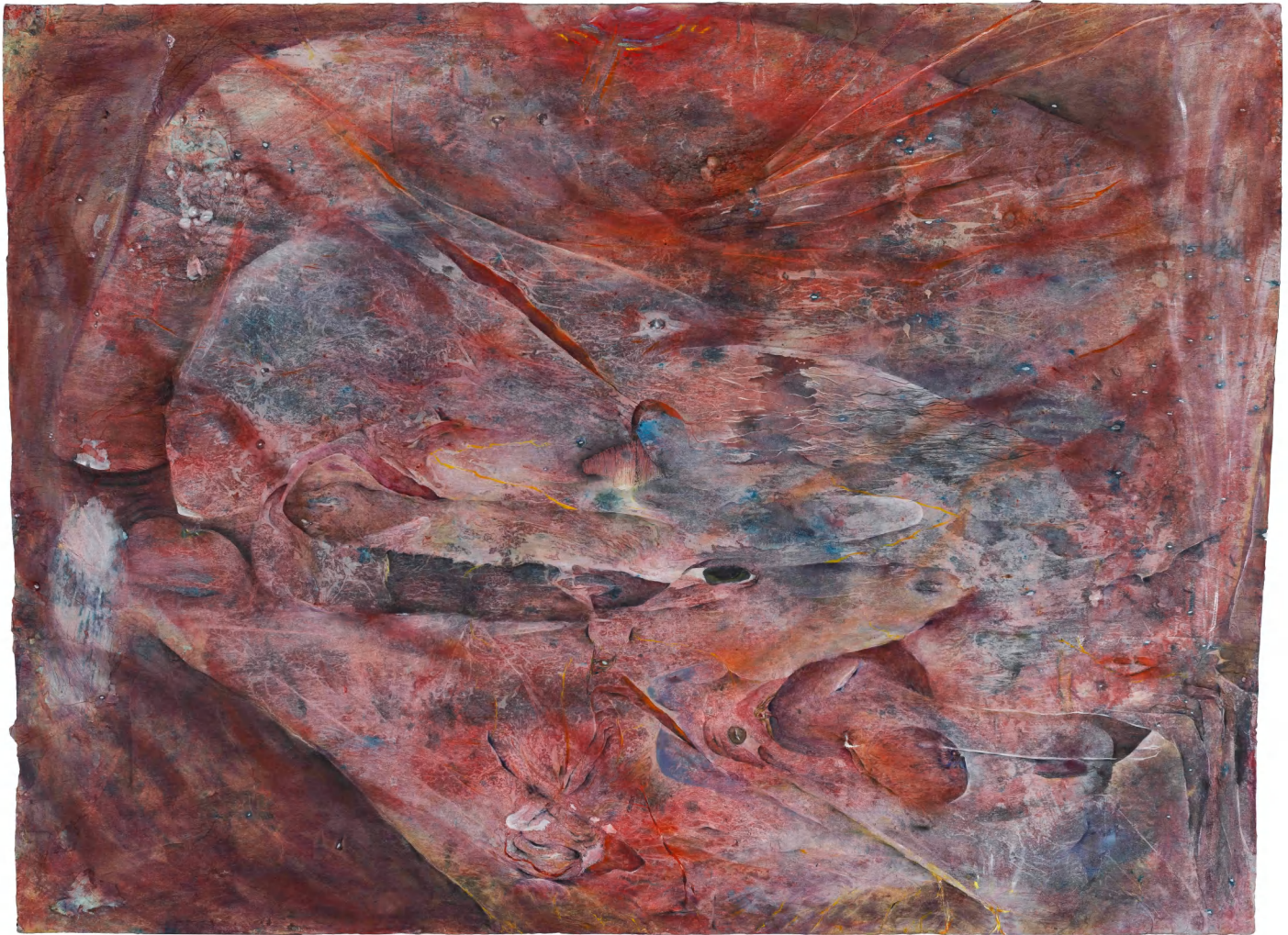
Sliding Scale of Our Fates