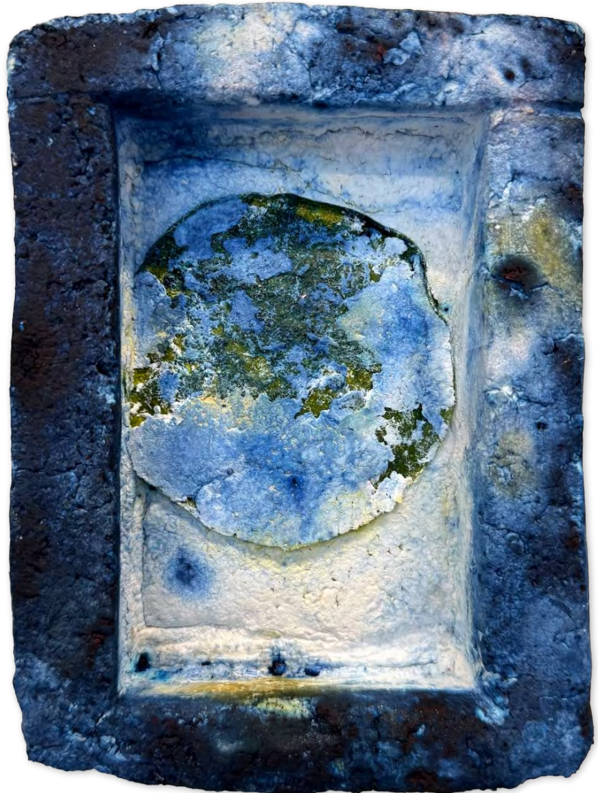
Cast 7 2025 Ink, watercolour, paper on paper 16.5 x 13 x 4 cm; 6 1/2 x 5 x 1 1/2 inches