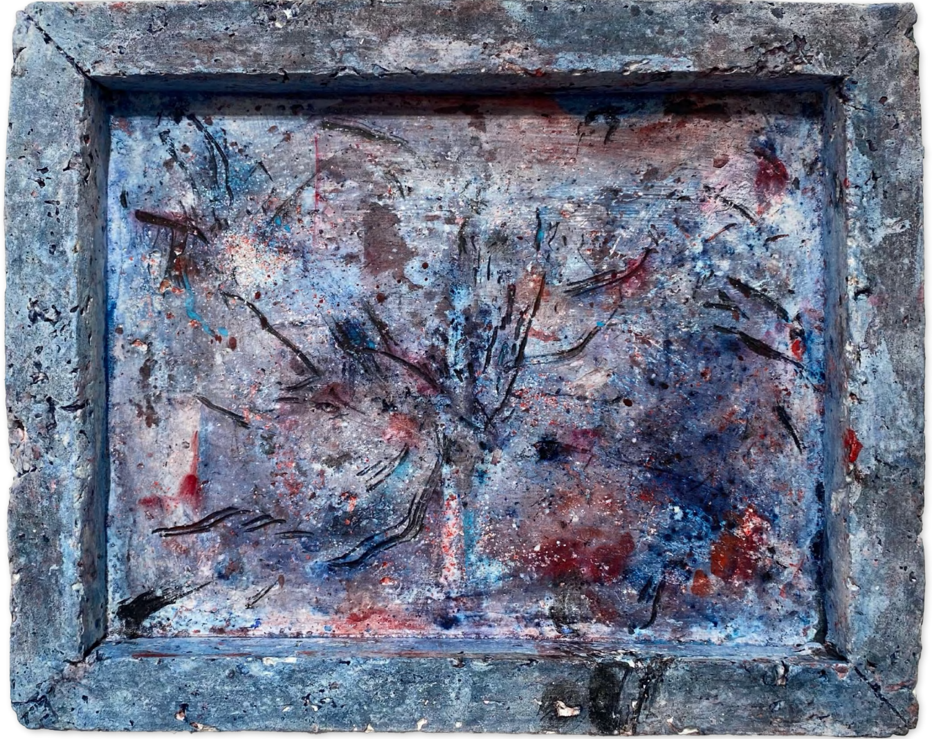
Cast 3 2024 Ink, watercolour, paper on paper 23 x 30.5 x 5 cm; 9 x 12 x 2 inches