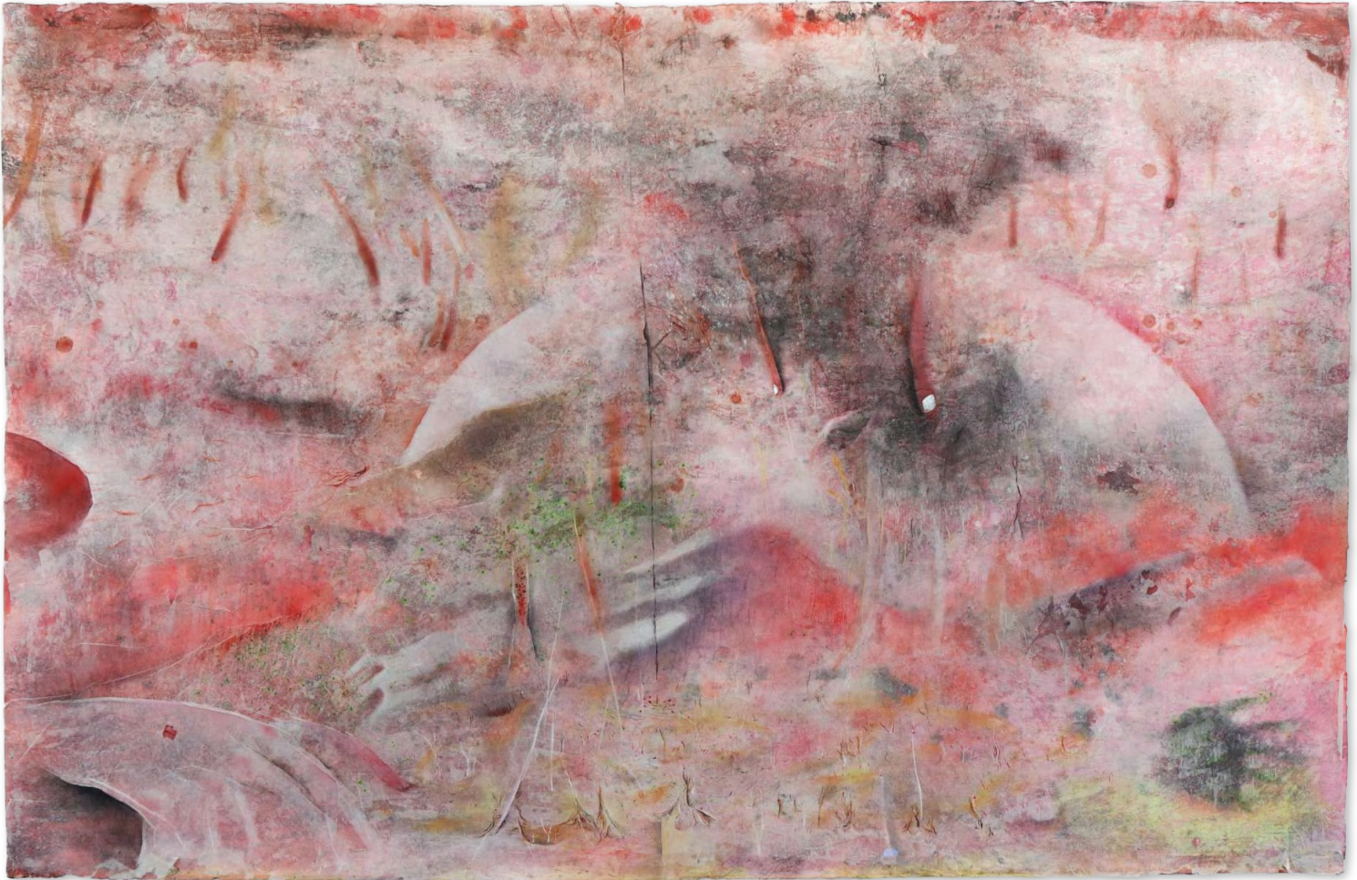
Love Bubble, Bubble Love