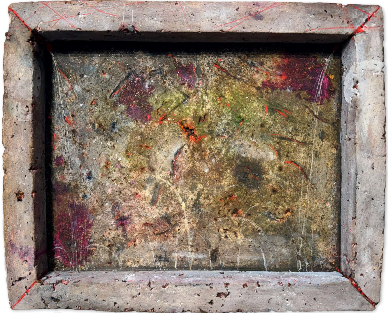
Cast 6 2025 Ink, watercolour, paper on paper 18.5 x 35.5 x 4 cm; 7 1/4 x 14 x 1 1/2 inches