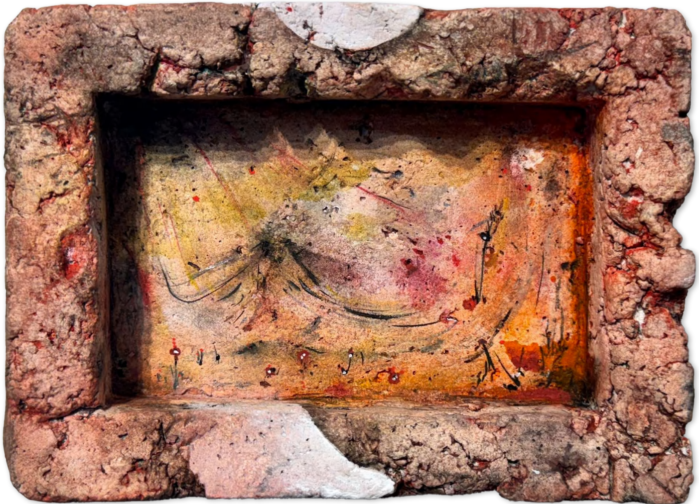
Cast 2 2025 Ink, watercolour, paper on paper 13 x 18 x 4 cm; 5 x 7 x 1 1/2 inches