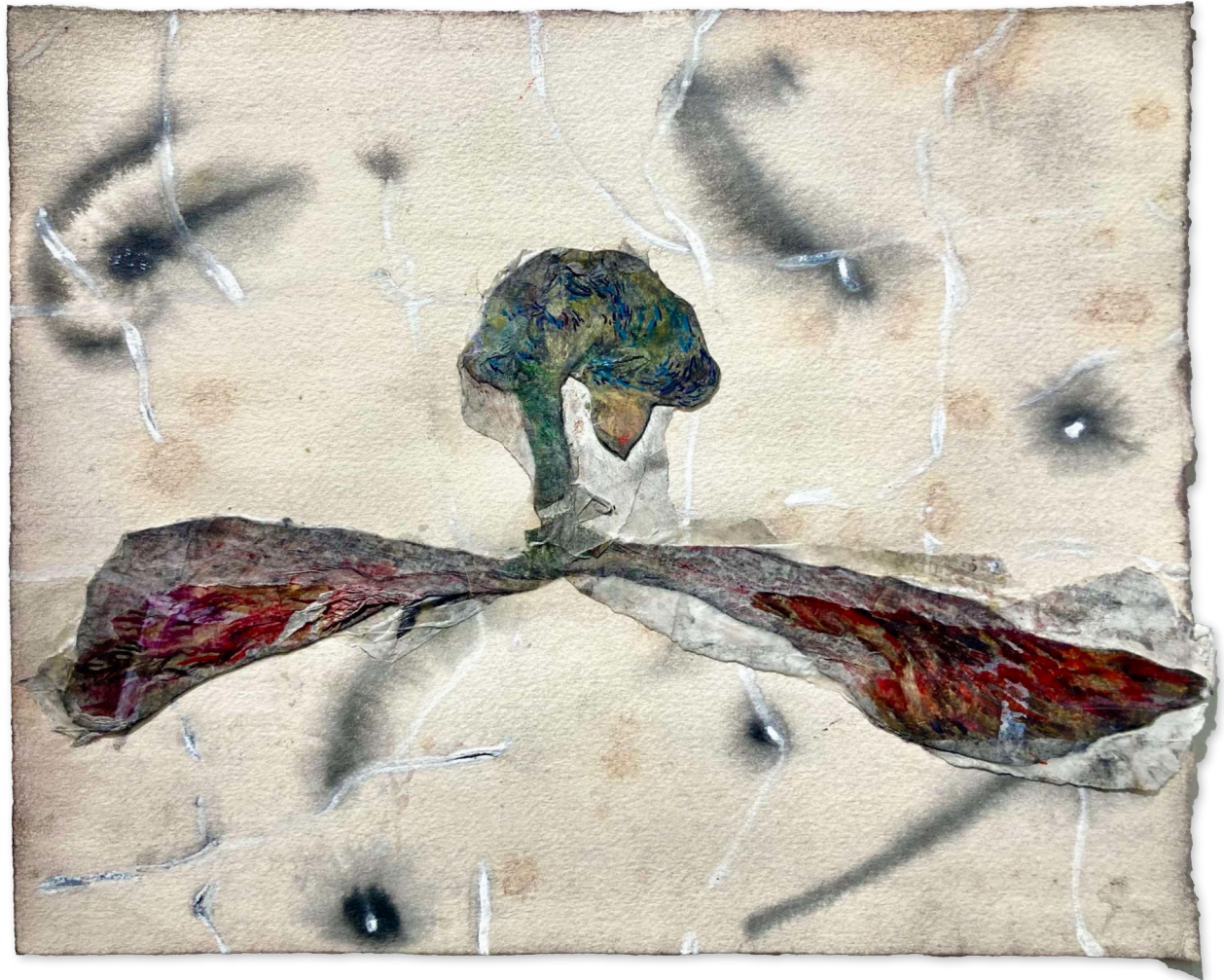
Untitled 2023 Watercolor and acrylic on paper 22 x 32 cm; 8 1/2 x 12 1/2 inches