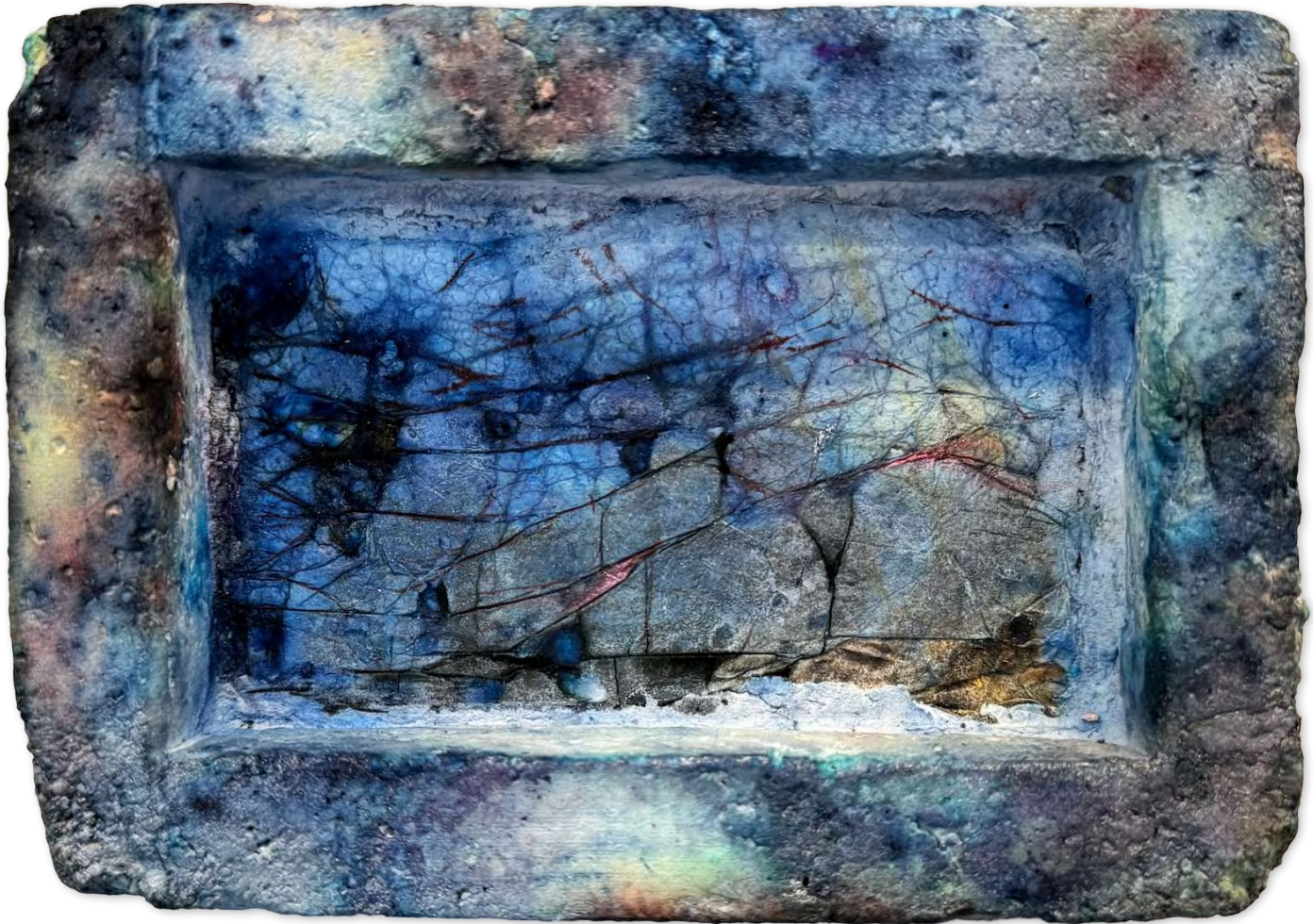
Cast 4 2025 Ink, watercolour, paper on paper 13 x 18 x 4 cm; 5 x 7 x 1 1/2 inches