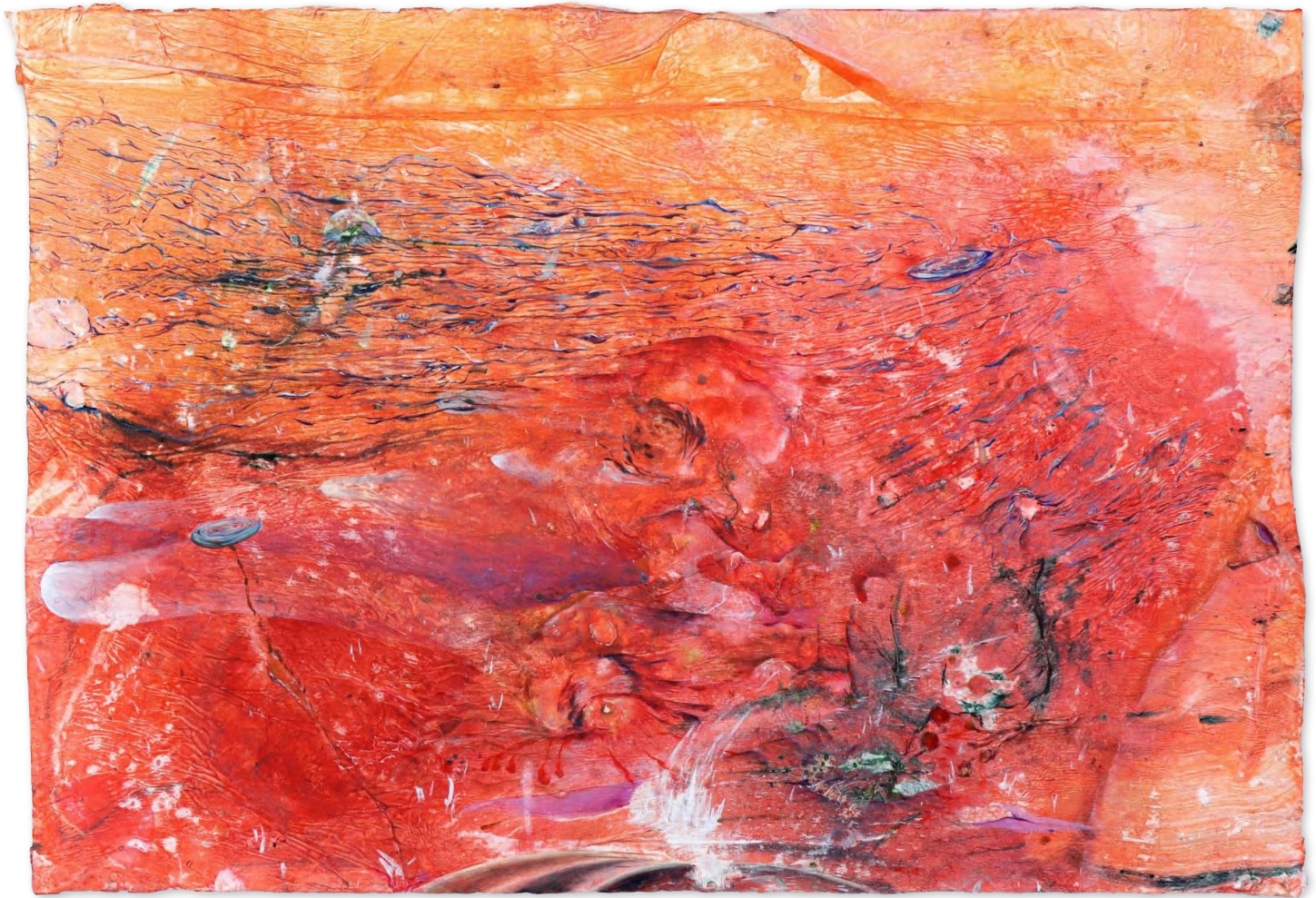
Horizons of Warmth, The Furthest I Can See