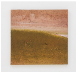
Merlin James, Landspace , 2004 Acrylic on canvas 19 x 19 7/8 inches (48.3 x 50.5 cm) (MJA0001)