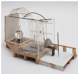
Yuri Masnyj, Crucible: Screens, Clarity, Chambers, Opacity , 2024 Wood, concrete, steel, acrylic, foam, acrylic paint, oil based paint with artist made shelf 13 5/8 x 6 3/8 x 8 inches (34.6 x 16.2 x 20.3 cm) (YMA0001)