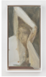
Ellen Siebers, Birdsong Rapid , 2025 Oil on birch panel 12 x 6 inches (30.5 x 15.2 cm) (ESI0001)