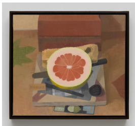
Susan Jane Walp, Cut-open Pummelo with Knife, Black Walnut, Leaves, and Cork (Patience) , 2025 Oil on linen 10 x 11 1/4 inches (25.7 x 28.6 cm) (SWA0001)