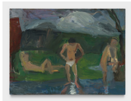
Janice Nowinski, Bathers, after Cezanne , 2025 Oil on board 12 x 16 inches (30.5 x 40.6 cm) (JNO0001)