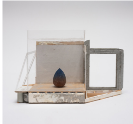
Yuri Masnyj, Crucible: Blue Hour , 2025 Wood, concrete, steel, acrylic, foam, acrylic paint, oil based paint with artist made shelf 13 x 5 ¾ x 8 inches (33 x 14.6 x 20.3 cm) (YMA0002)