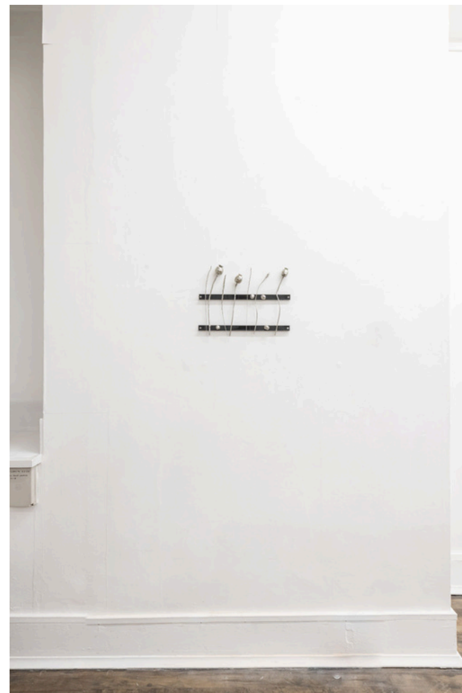
LEWIS DAVIDSON Field , 2025 Chrome Electroplated Poppies, Grasses, Snails and Magnetic Tool Holders 35 x 44 x 5 cm