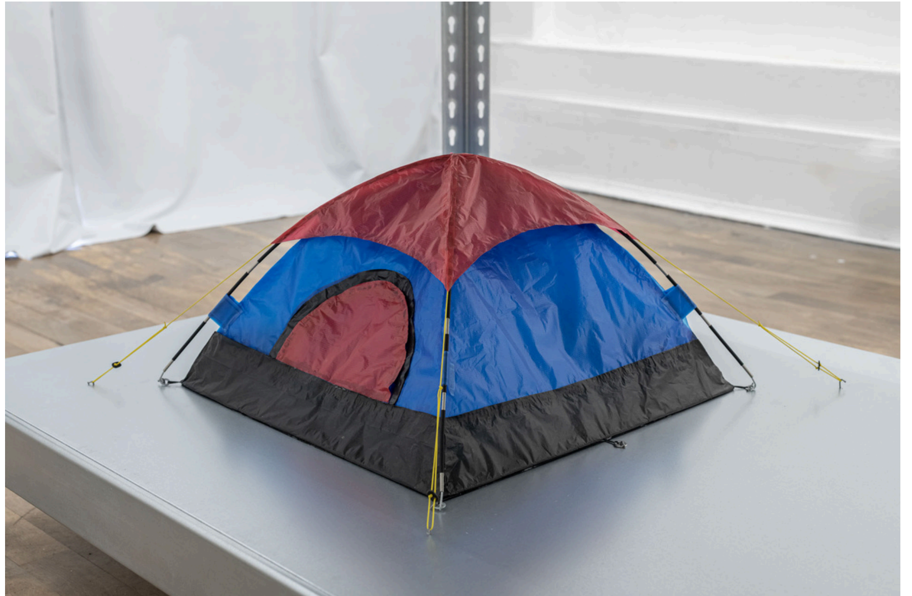
LEWIS DAVIDSON Tent 2 , 2023 Plastic carrier Bags, Bin Bags, Clear Polythene Wrapping, Stainless Steel Rod, Nylon Cord, PETG Plastic, Panel Pins, Stainless Steel Washers Gaffa Tape, Double-sided Tape, Magnetic Strips, Araldite, Superglue, Lights 30 x 35 x 35 cm