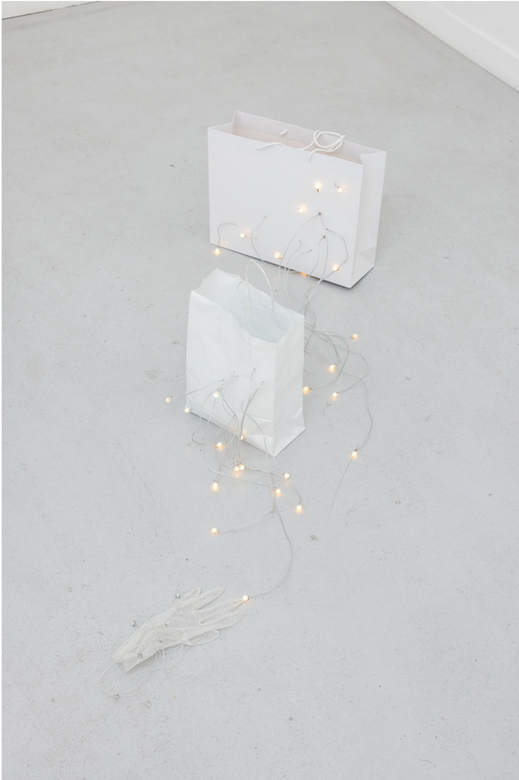
Nile Koetting, something , 2023, paper bag, led, fabric, variable dimensions