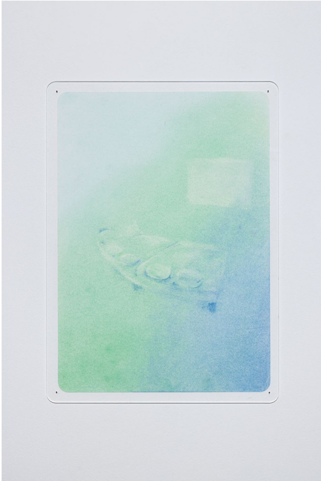
Nile Koetting, Projection room , 2024, pastel on paper, 31,5 x 23 cm