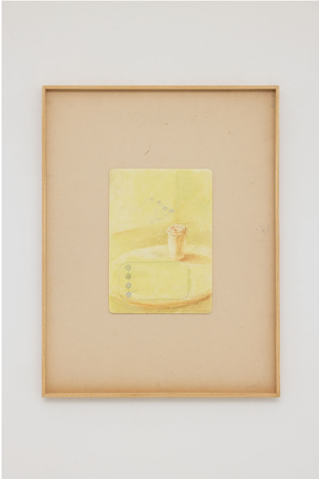
Nile Koetting, Strategy meeting (invisible latte art) , 2025, pastel and plotted ink on paper, 63,2 x 48,3 cm