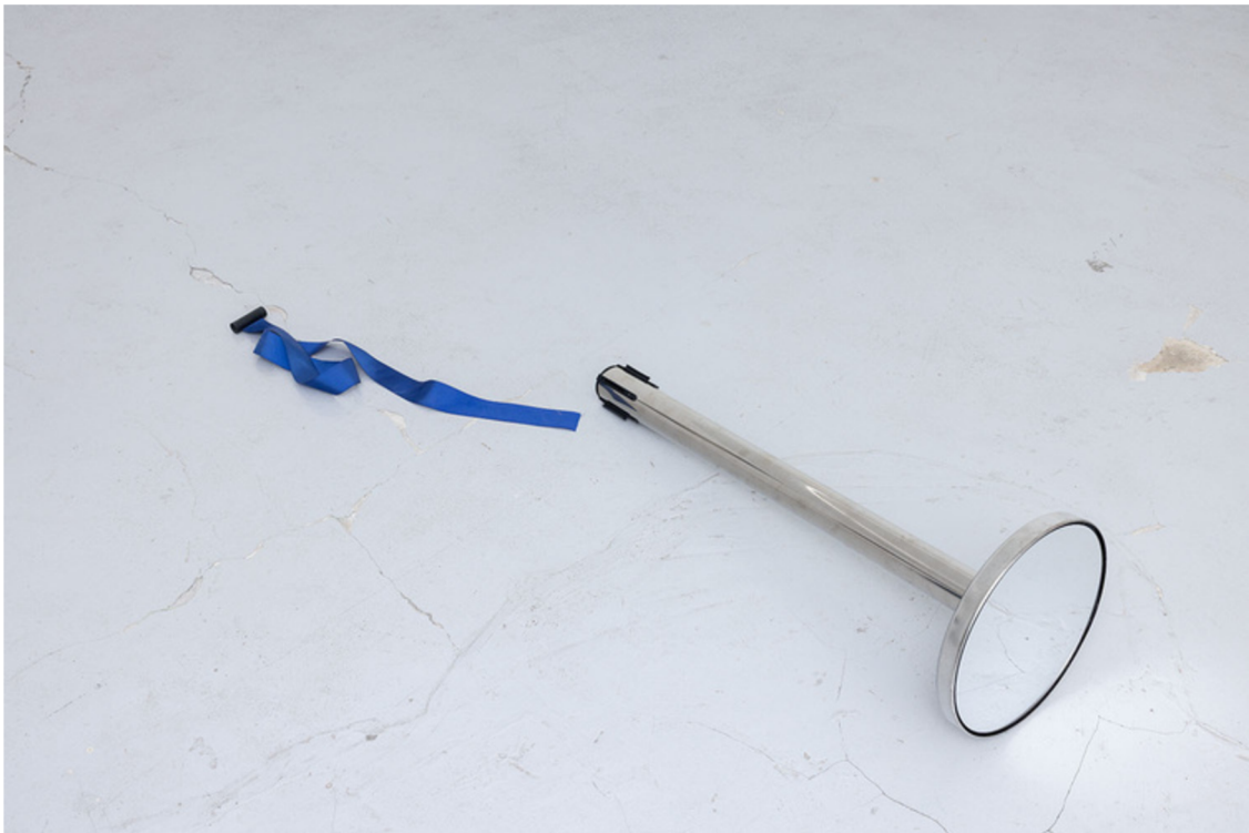
Nile Koetting, Unhinged , 2025, stainless steel, motor, electronics, variable dimensions