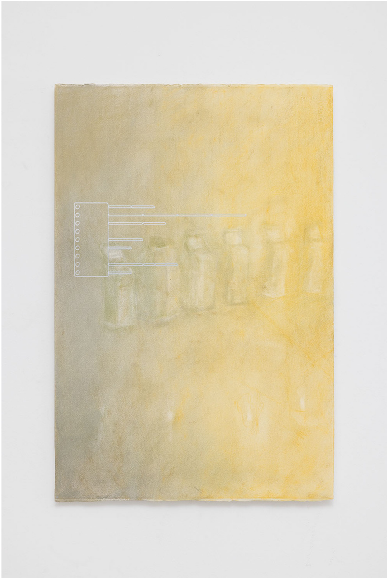
Nile Koetting, Self check in , 2024, pastel and plotted ink on paper, 57,2 x 38,3 cm