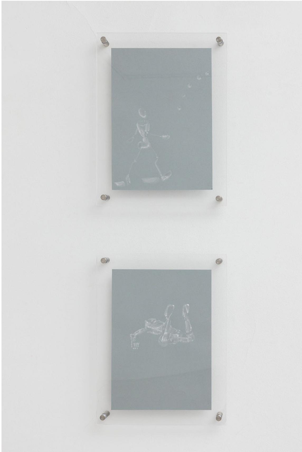
Nile Koetting, CO 2 study in mineralization: \text{CaCl}_2 (\text{aq}) + \text{H}_2\text{CO}_3 (\text{aq}) \rightarrow \text{CaCO}_3 (\text{s}) + 2 \text{H}^+ + 2 \text{Cl}^- (1), (2), 2025, Mineralized carbon dioxide on paper (in collaboration with Kyoto University, Professor Easan Sivaniah and Pureosity dep), 36 x 27,5 cm (each)