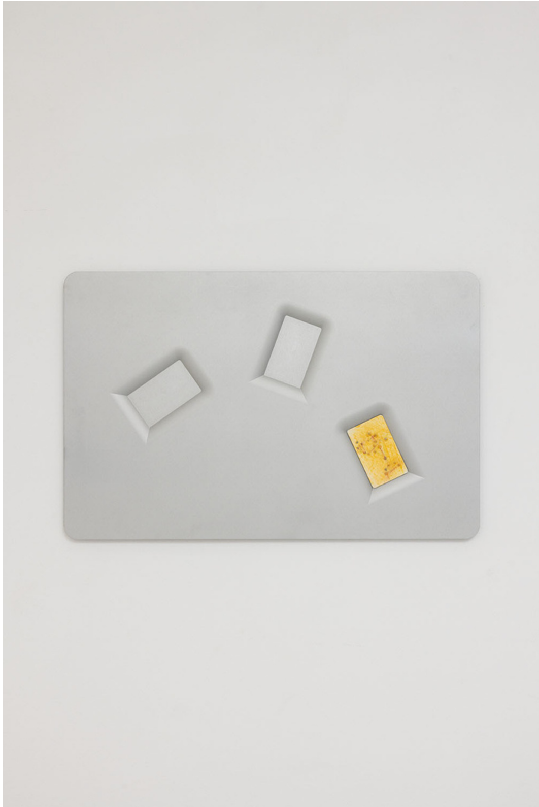
Nile Koetting, True color , 2025, aluminium, paper, pastel, resin, 38 x 59 cm (Part 1)