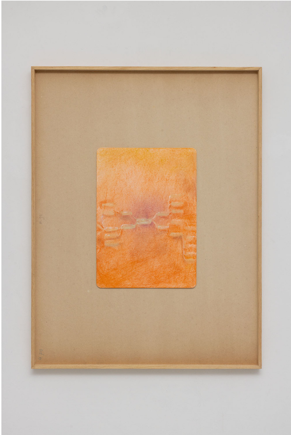
Nile Koetting, Fresh green tree , 2025, pastel on paper, 63,2 x 48,3 cm