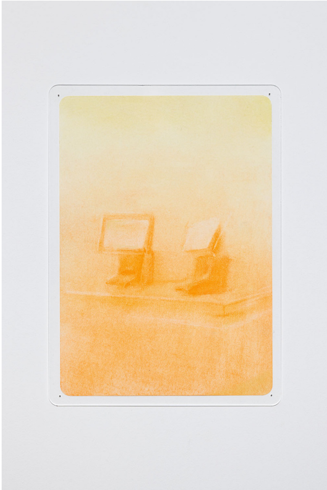
Nile Koetting, More discounts. Discount , 2024, pastel on paper, 31,5 x 23 cm