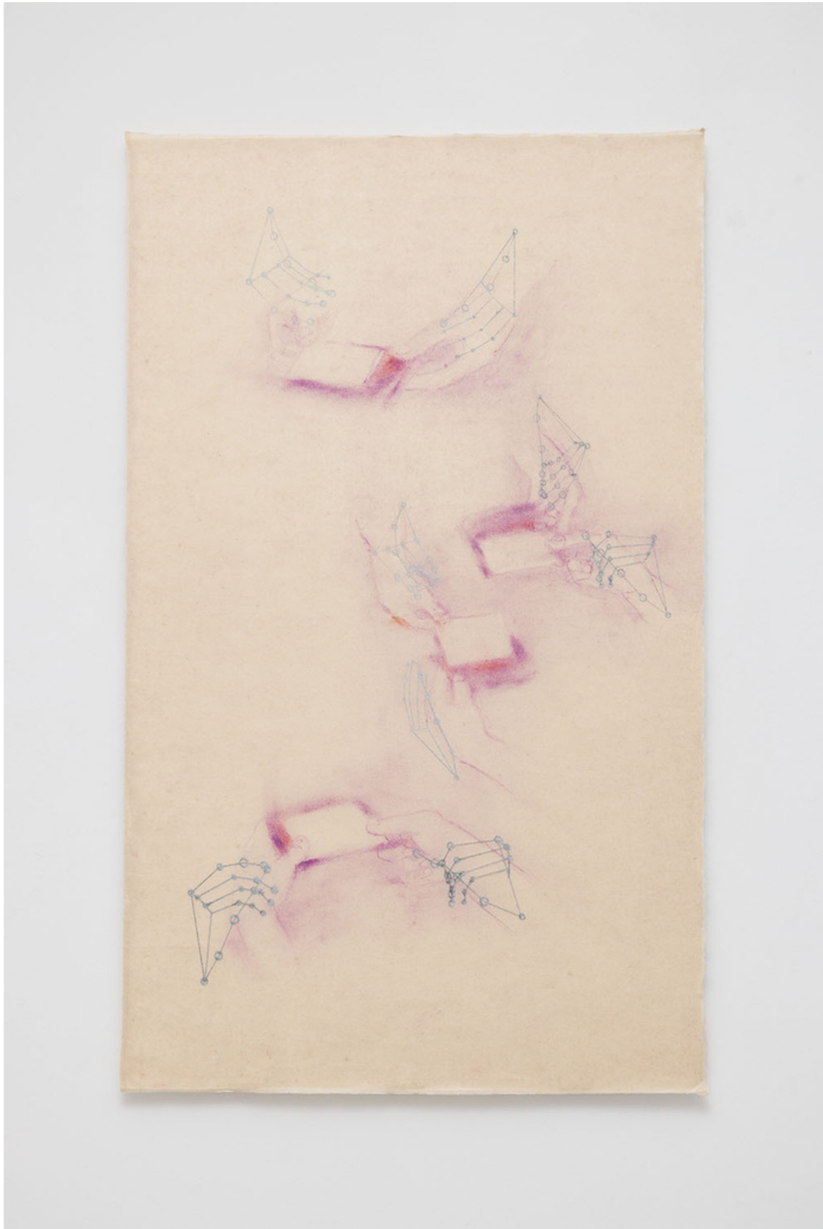
Nile Koetting, Introduction with two arms , 2024, pastel and plotted ink on washi-paper, 99 x 59,5 cm