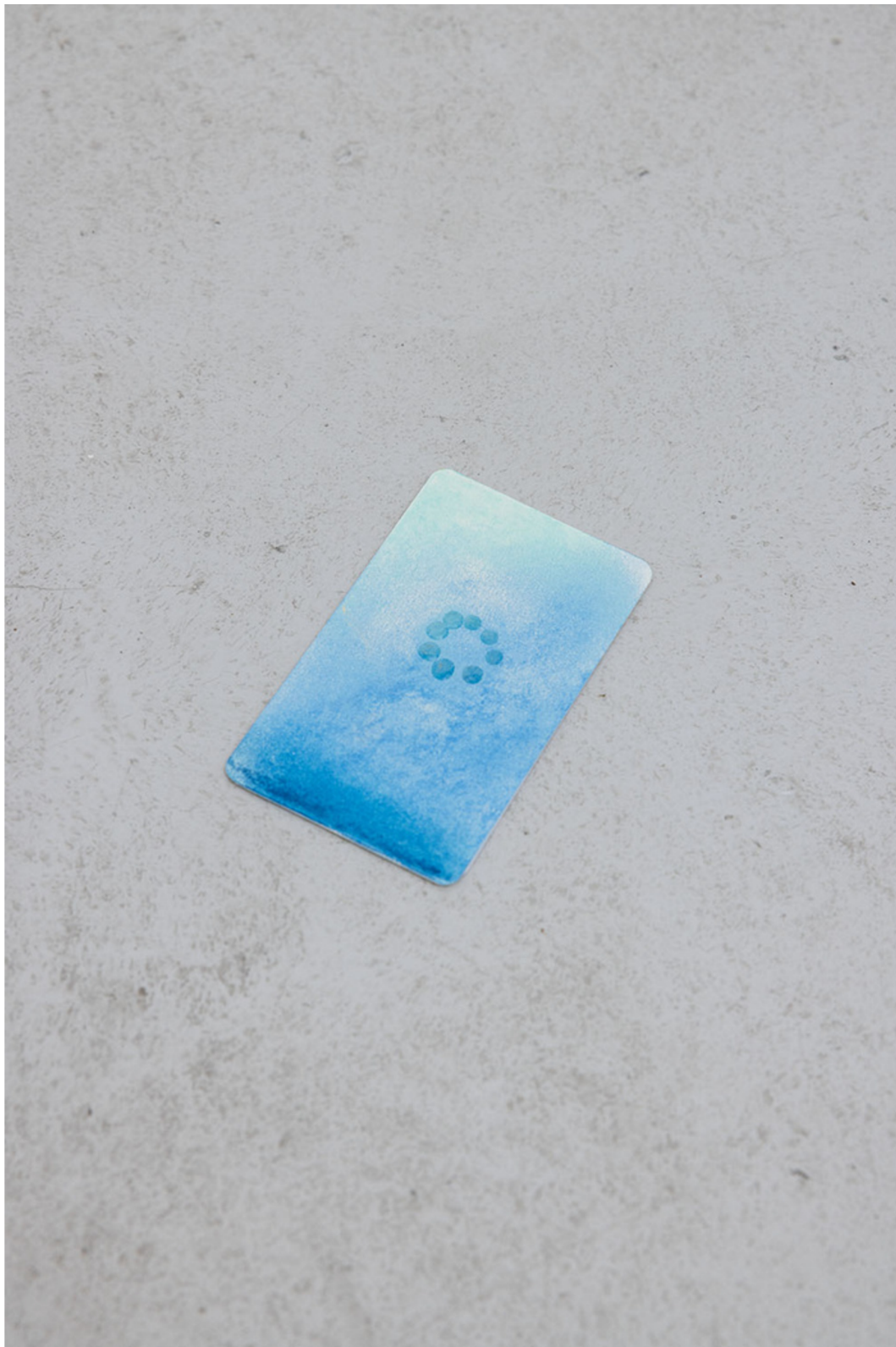
Nile Koetting, drop air , 2025, aluminium, pastel, paper, 29 x 20 cm, (Part 2)