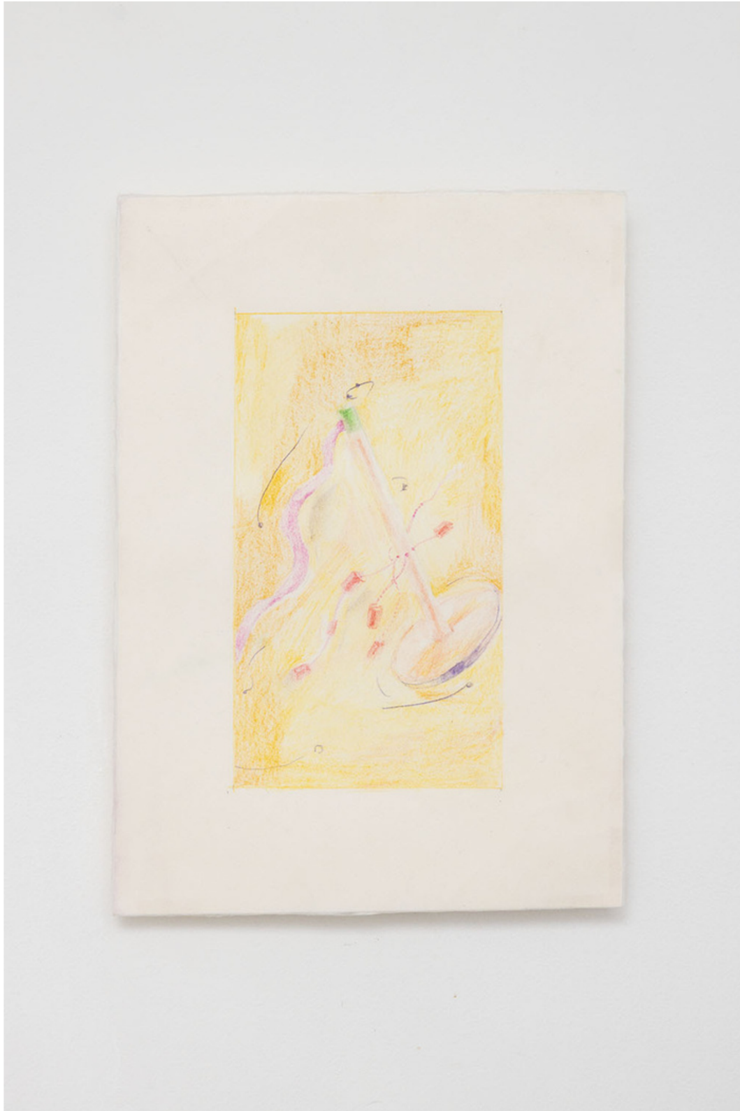
Nile Koetting, Sketch for unhinged , 2024, colored pencil on wahi-paper, 29 x 21 cm