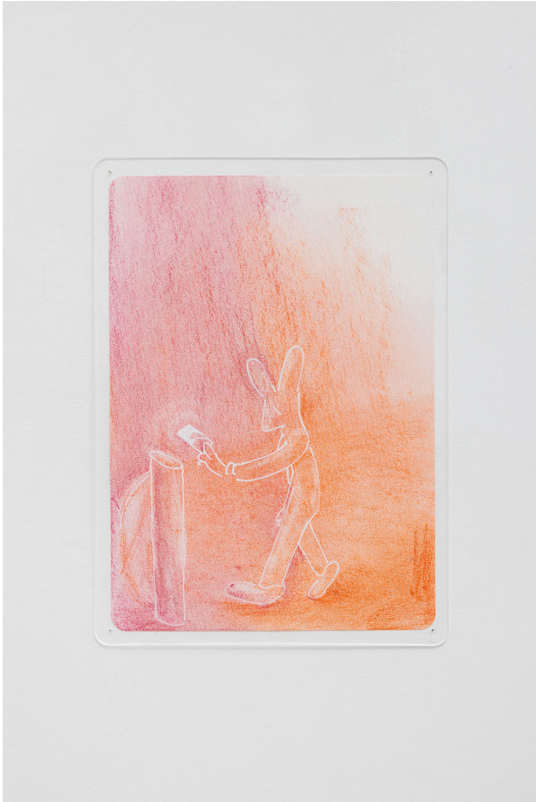
Nile Koetting, Full priority gold express access in platinum movement , 2024, pastel and plotted ink on paper, 31,5 x 23 cm