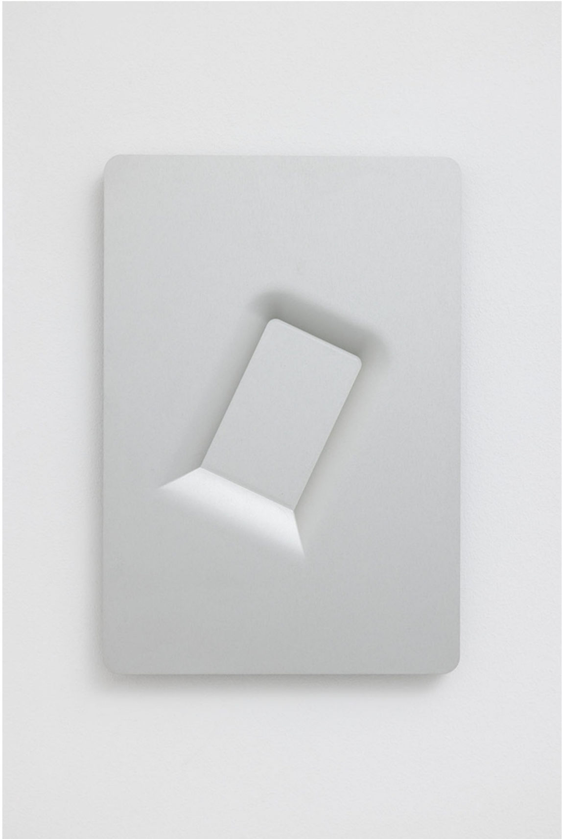
Nile Koetting, drop air , 2025, aluminium, pastel, paper, 29 x 20 cm, (Part I)