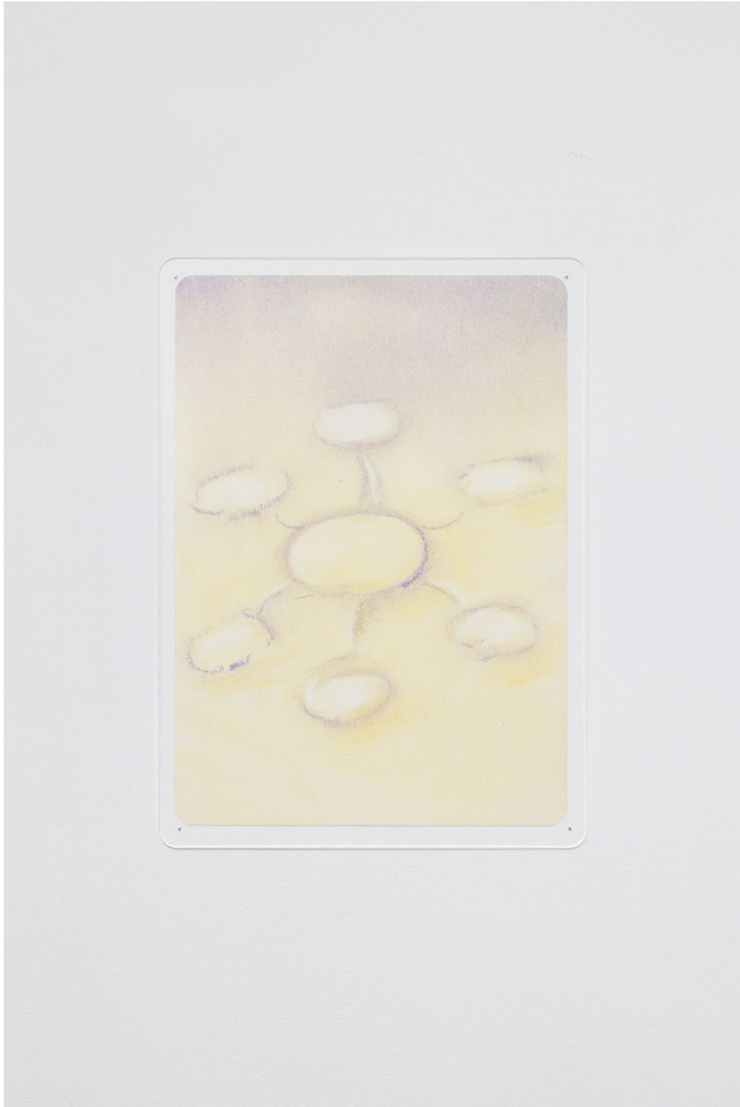
Nile Koetting, Mind template in optimization, 2025, pastel on paper, 31,5 x 23 cm