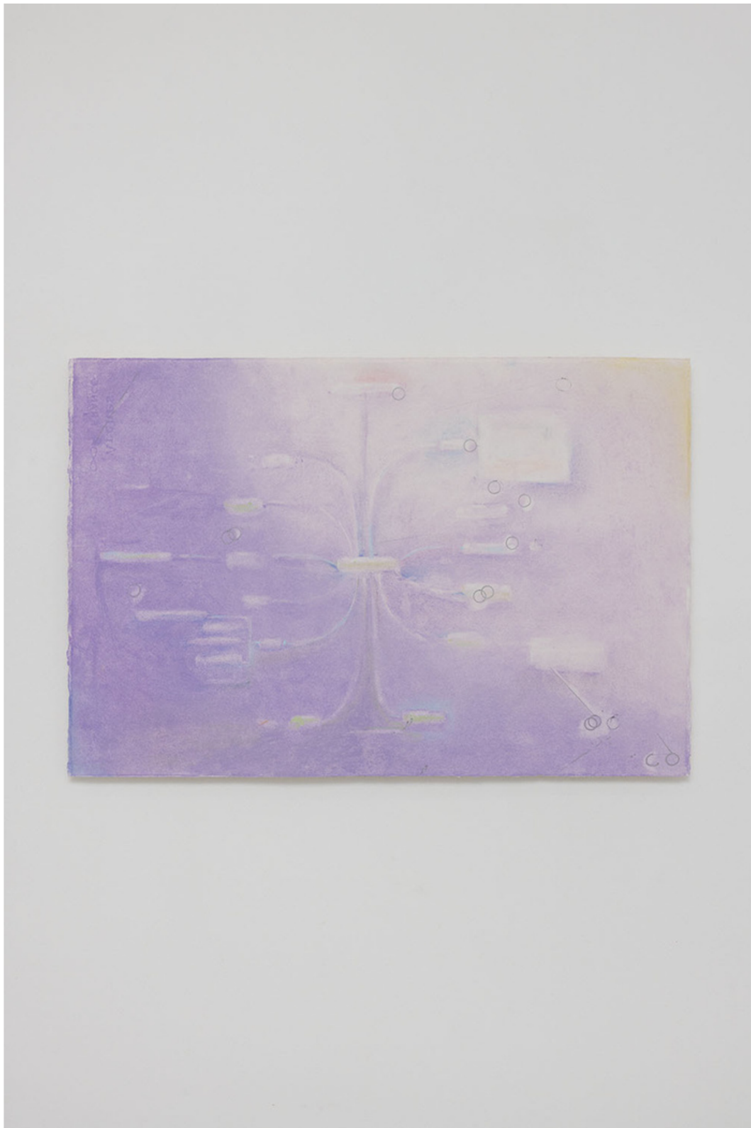
Nile Koetting, Yutaka (豊か), 2024, pastel on paper, 38,5 x 57 cm