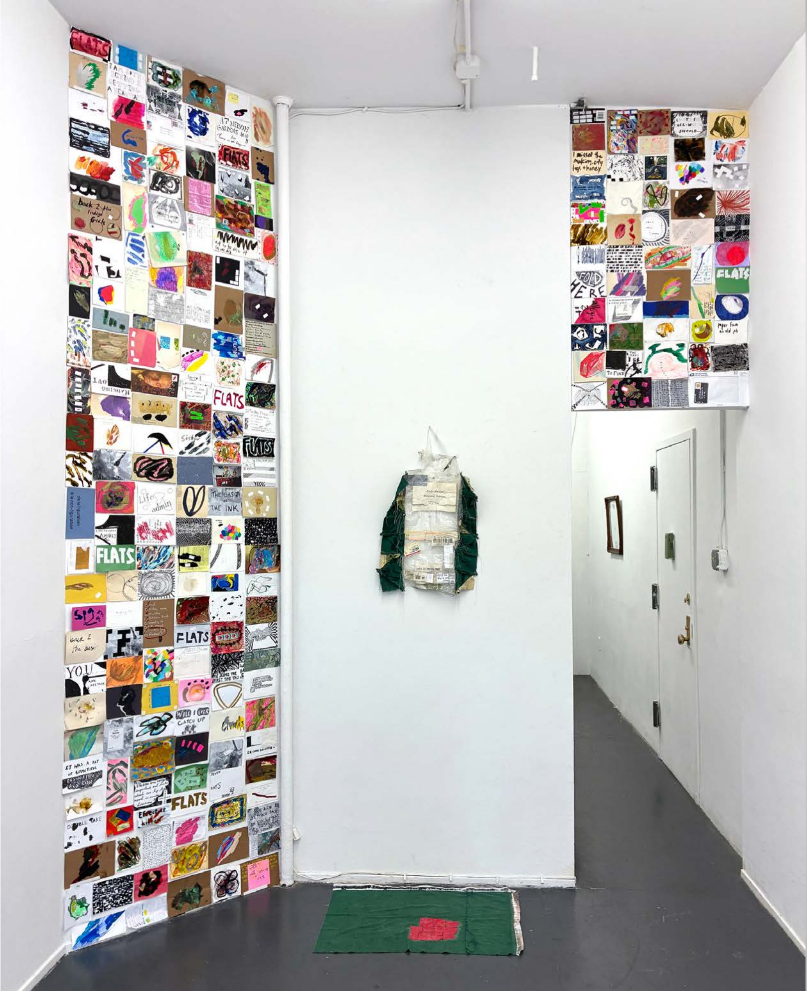
Installation view, 21201 / 10002 (left and right wall), Early American Decorating Techniques (center wall and floor) Dimensions variable, 2025