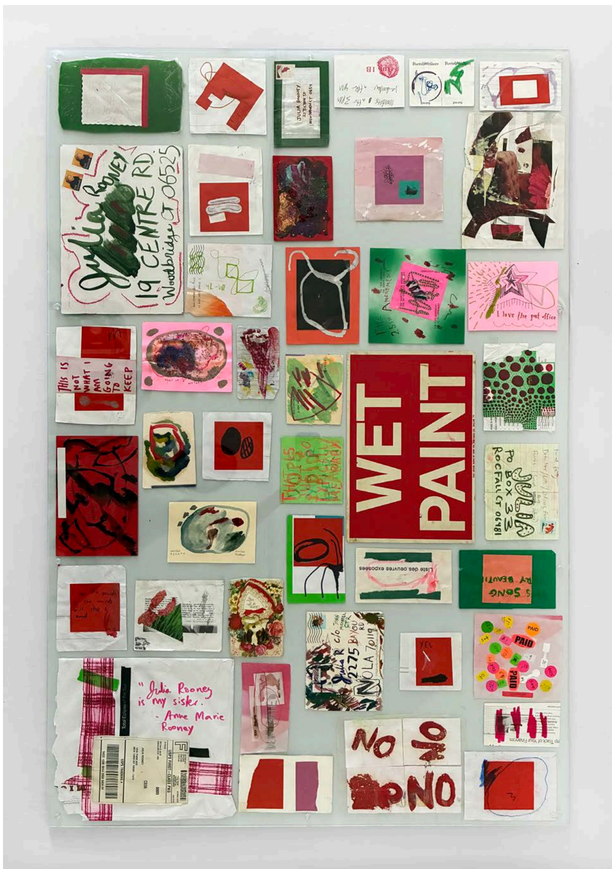
Flat (yes/no) Mail and plexiglass 48" x 32" 2015-2025