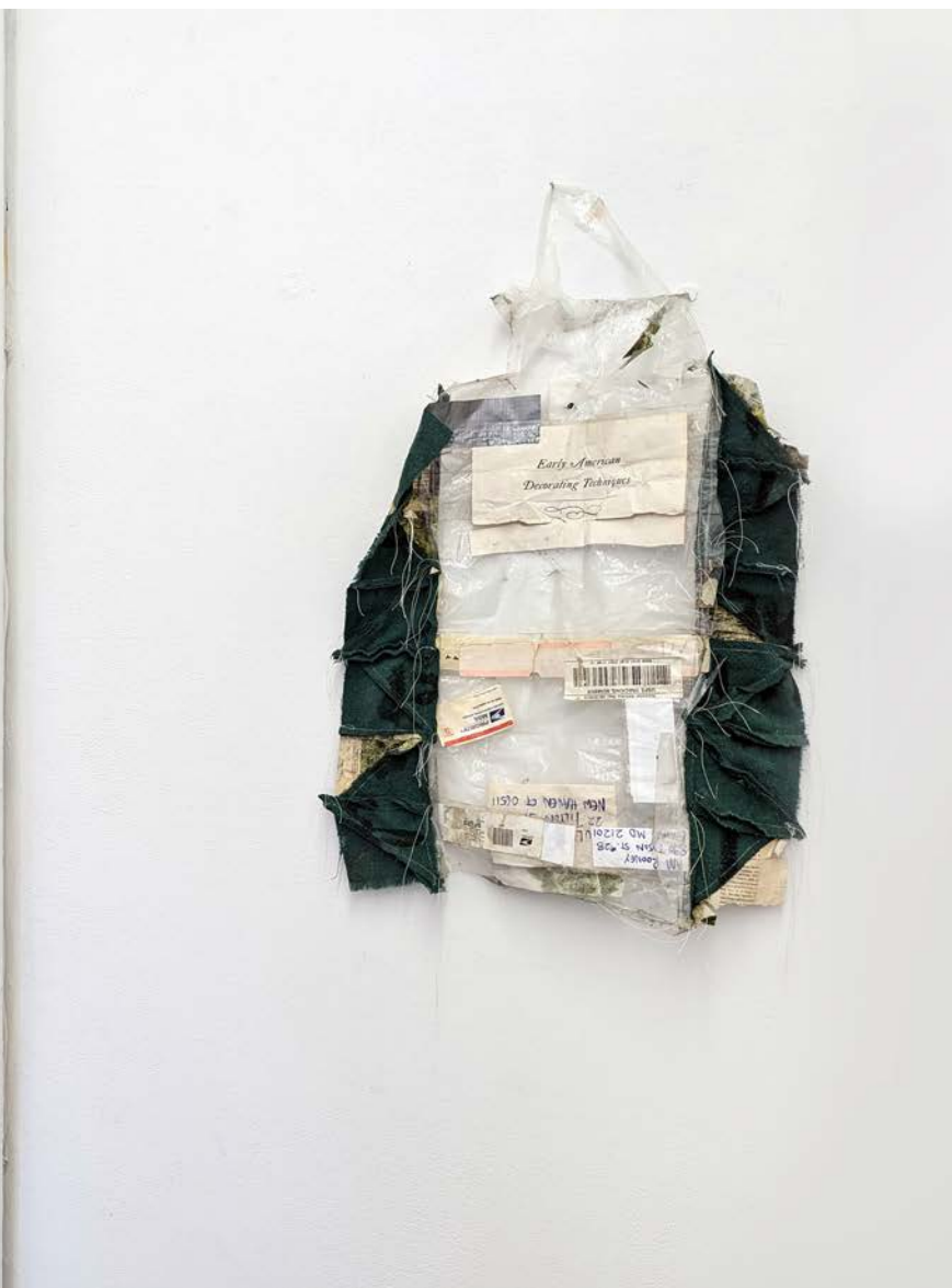
Installation view, 21201 / 10002 (left), Early American Decorating Techniques (right)