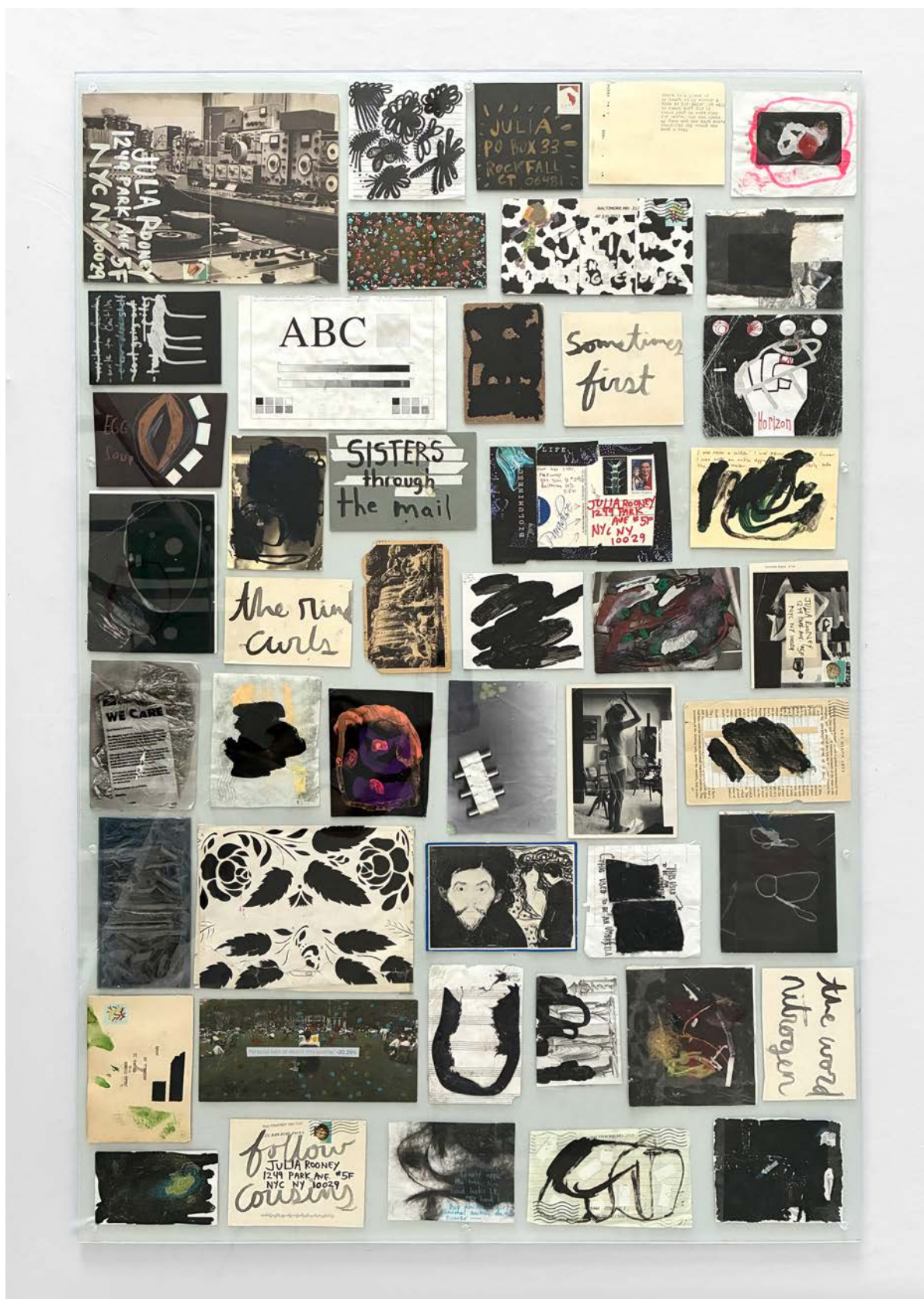
Flat (grayscale) Mail and plexiglass 48" x 32" 2016-2025