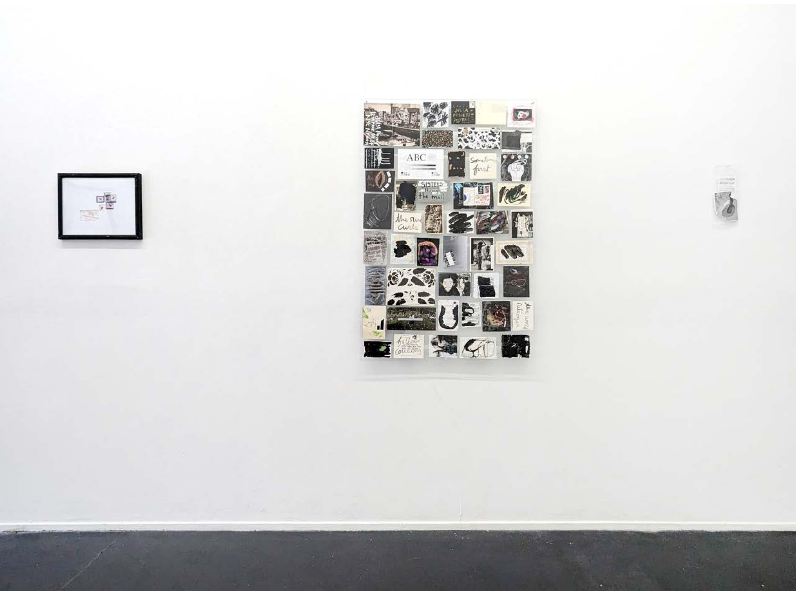
Installation view, $2.45 (left), Flat (grayscale) (center), We Care (portrait) (right), dimensions variable, 2025