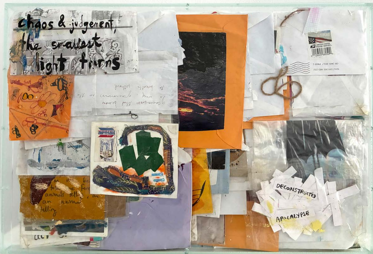
106 U.S. Flags (back) Mail in plexiglass box 16.5" x 24.5" 2012-2025