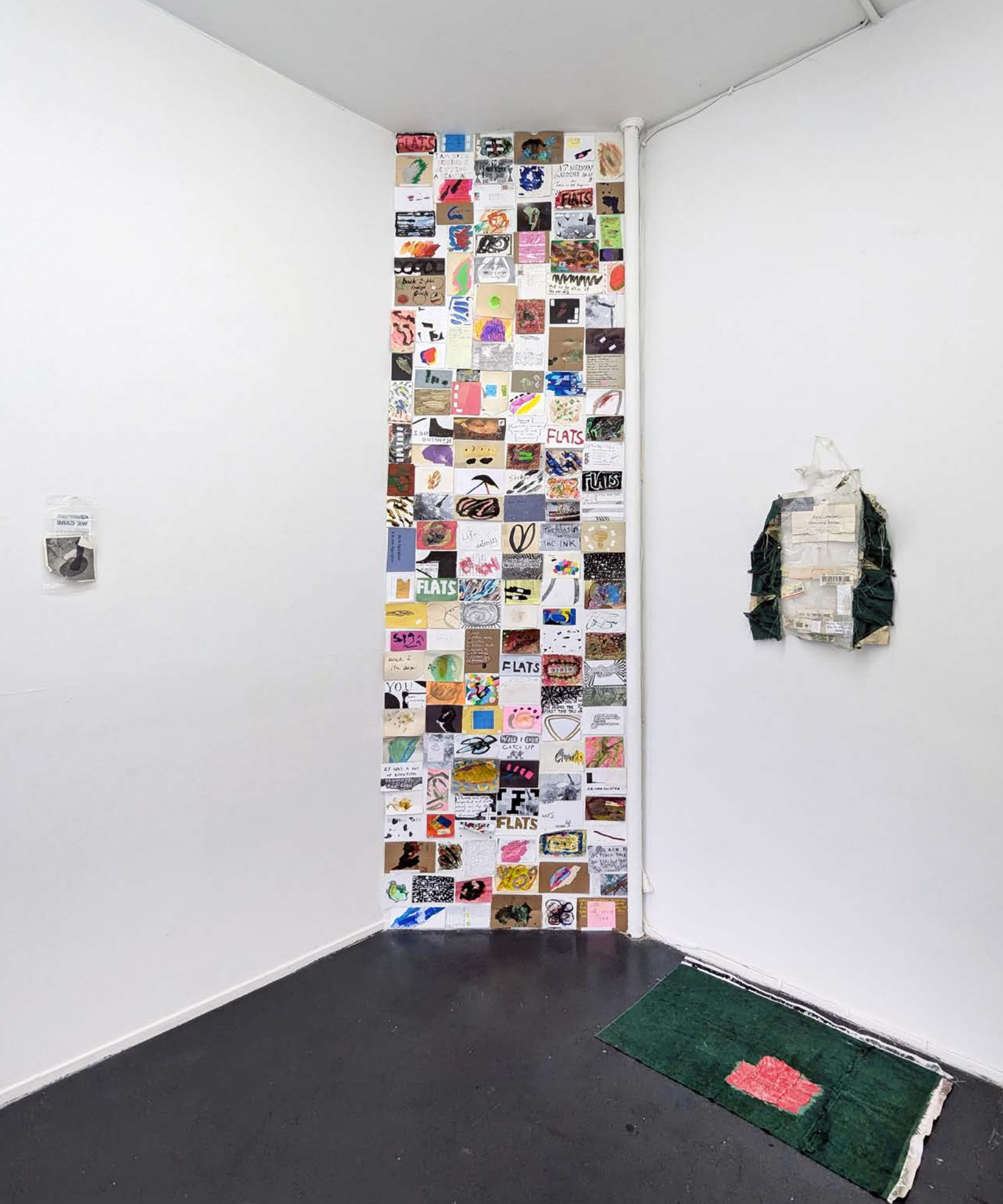
Installation view, We Care (portrait) (left), 21201 / 10002 (center), Early American Decorating Techniques (right and floor)