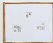
Installation view, Flat (yes/no) (left), $5.27 (center), $3.06 (right), dimensions variable, 2025