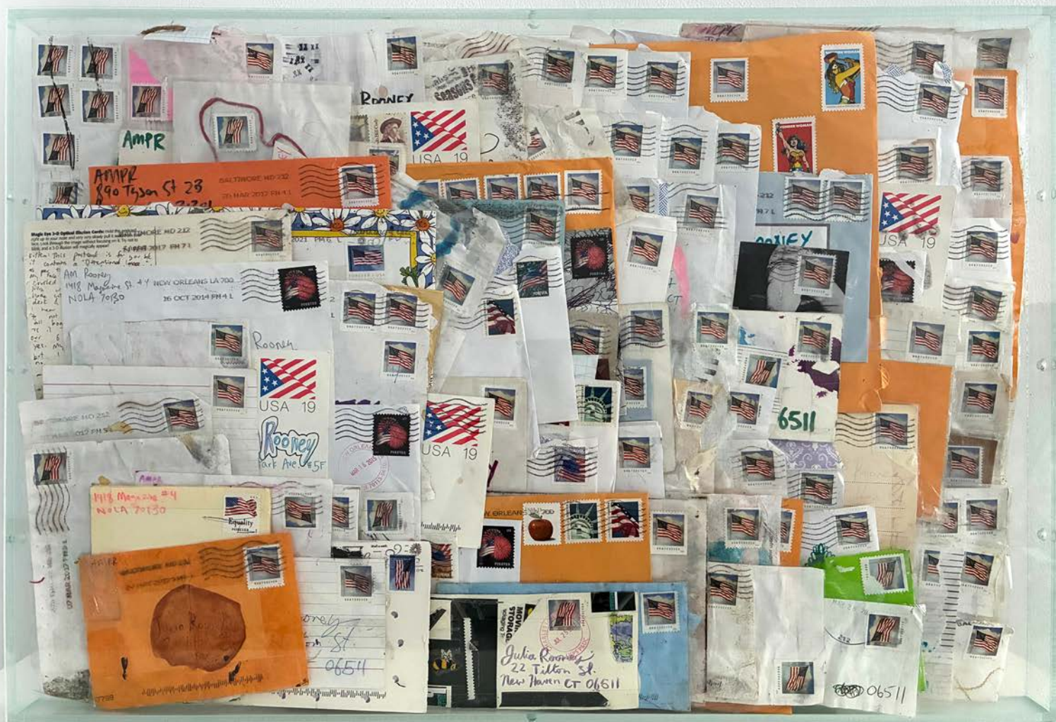
106 U.S. Flags (front) Mail in plexiglass box 16.5" x 24.5" 2012-2025