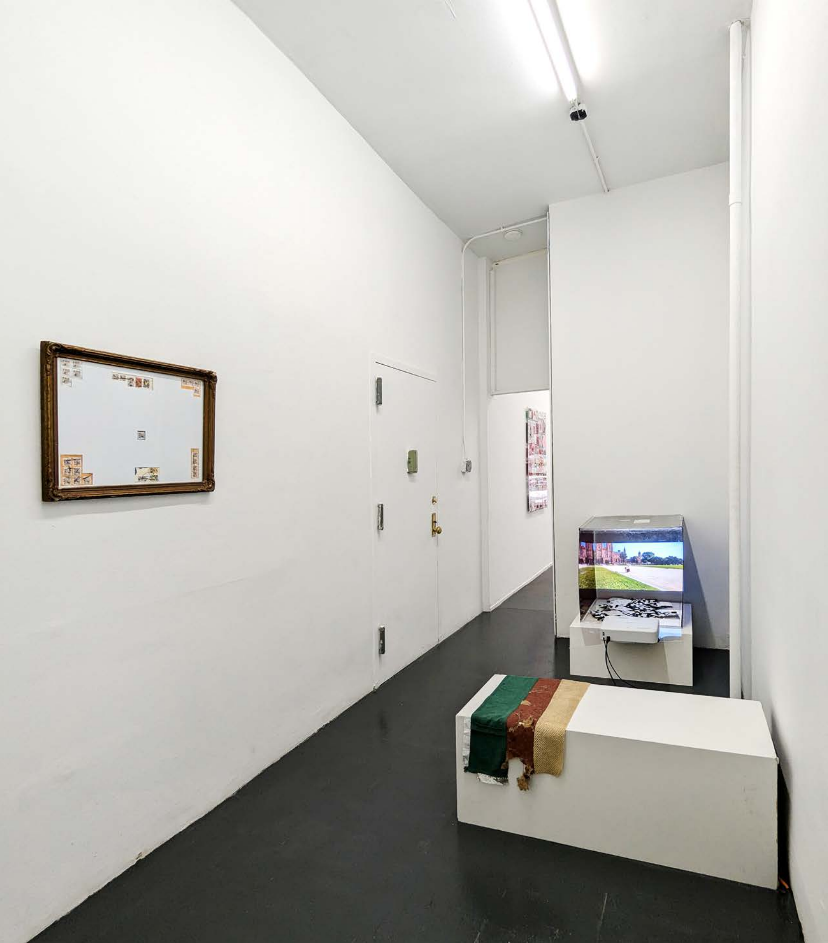
Installation view, $13.36 (left), Early American Decorating Techniques (bench), No stamps since Christmas (pedestal)