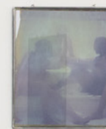
Installation view: Marina Grize, In-Between Touch , 2025