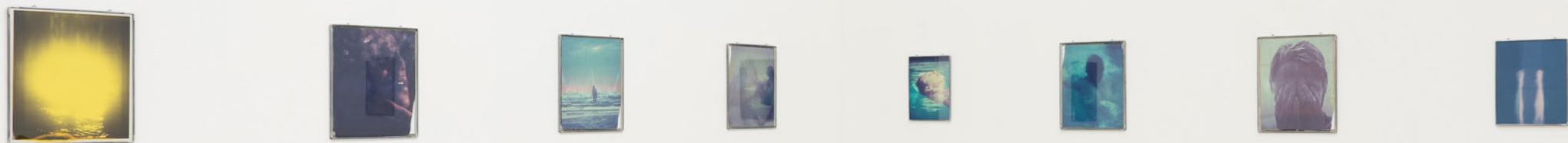
Installation view: Marina Grize, In-Between Touch , 2025