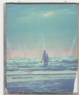
Installation view: Marina Grize, In-Between Touch , 2025