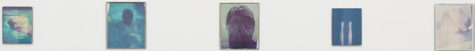
Installation view: Marina Grize, In-Between Touch , 2025