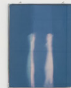
Installation view: Marina Grize, In-Between Touch , 2025