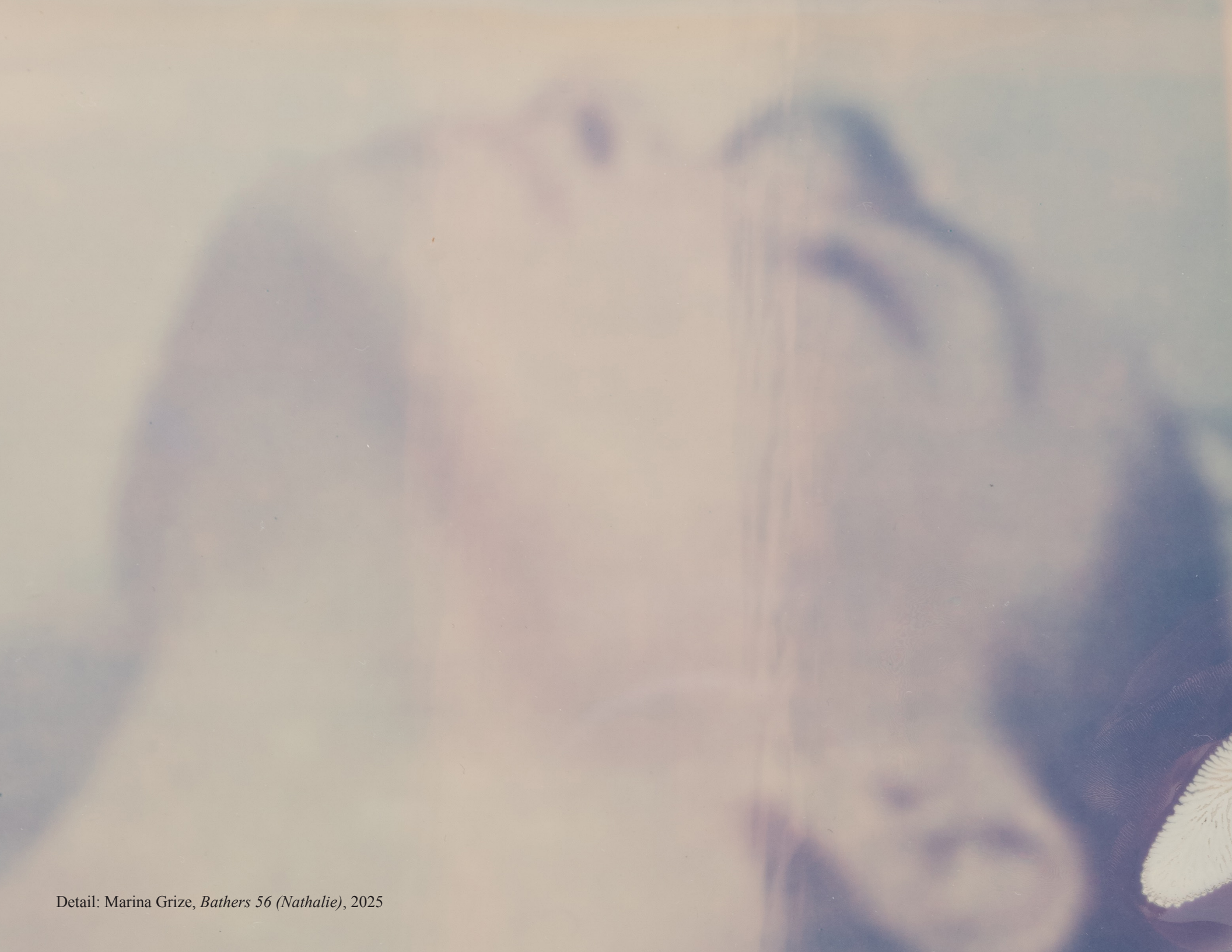
Detail: Marina Grize, Bathers 56 (Nathalie) , 2025