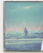
Installation view: Marina Grize, In-Between Touch , 2025