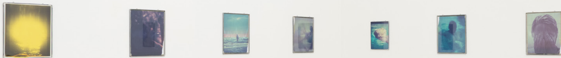
Installation view: Marina Grize, In-Between Touch , 2025