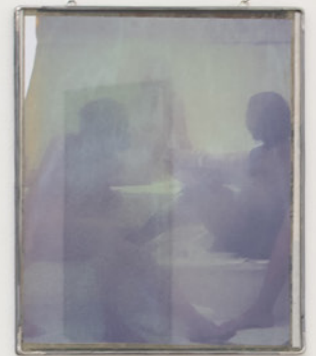
Installation view: Marina Grize, In-Between Touch , 2025