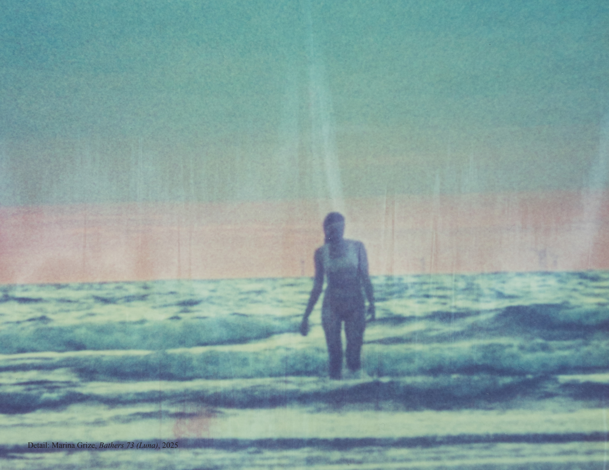
Detail: Marina Grize, Bathers 73 (Luna) , 2025