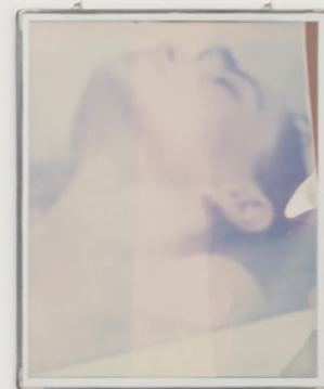
Installation view: Marina Grize, In-Between Touch , 2025